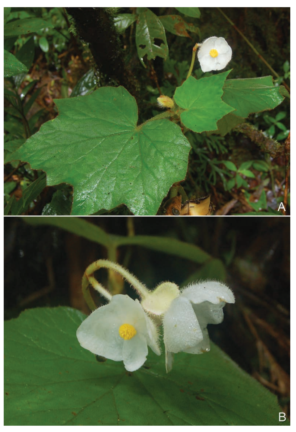
Fig. 1. Begonia khaophanomensis Phutthai & M.Hughes. A. Habit. B. Staminate and pistillate flowers. From the type K. Williams et al. 1943.