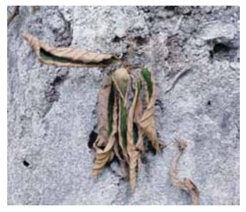
Limestone habitats are free-draining and can periodically become very dry. This plant of Paraboea leuserensis has rolled up its leaves in response to water stress.