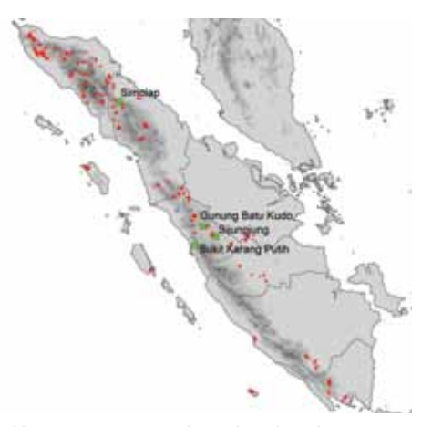
Limestone outcrops, shown here in red, are very scattered in Sumatra. Their archipelago-like distribution is no doubt important in permitting the evolution of many narrowly endemic plants on limestone.

Once a species becomes a limestone specialist and loses the ability to thrive on other types of base rock, the distribution of its populations becomes more restricted.