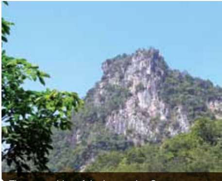
The steep sides of the impressive Gunung Batu Kudo.