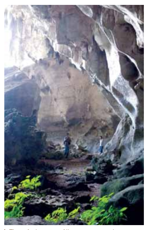
The soft character of limestone means it can be rapidly eroded, sometimes forming spectacular caves such as this one near Solok Ambah, West Sumatra.

Batu Kudo is one of many peaks in the Batang Sinamar region. The many rounded summits are reminiscent of more familiar scenes such as can be found in Thailand or Vietnam.