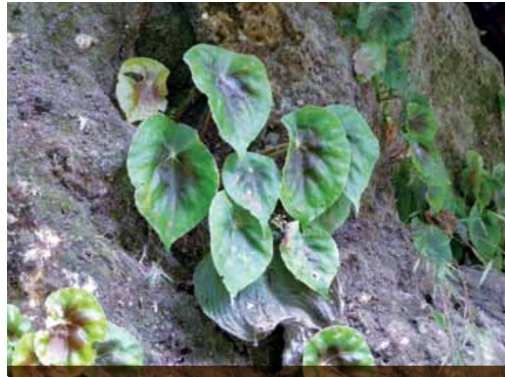
A new species of Begonia discovered growing in cave entrances in Bukit Karang Putih a few kilometres away from Padang city.