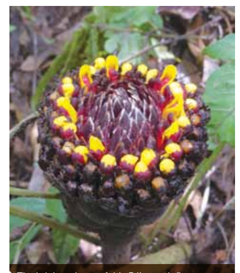
The bright colours of this Etlingera inflorescence show up well even in the dim light of the forest understory. This is an as-yet unidentified and potentially new taxon from near Sijunjung.

This beautiful succulent Impatiens was found on a vertical rock face in a sheltered spot near Sijunjung. This is a potentially new taxon, and is currently being researched by botanists at Herbarium Bogoriense.