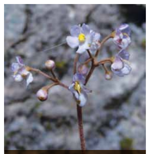
The pale lilac flowers of Paraboea leuserensis , an endemic to the Leuser region as its name suggests.