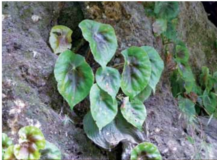
▶ A new species of Begonia discovered growing in cave entrances in Bukit Karang Putih a few kilometres away from Padang city.