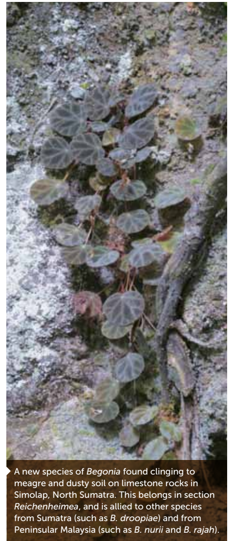
▶ A new species of Begonia found clinging to meagre and dusty soil on limestone rocks in Simolap, North Sumatra. This belongs in section Reichenheimea , and is allied to other species from Sumatra (such as B. droopiae ) and from Peninsular Malaysia (such as B. nurii and B. rajah ).