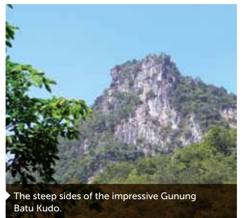
The steep sides of the impressive Gunung Batu Kudo.