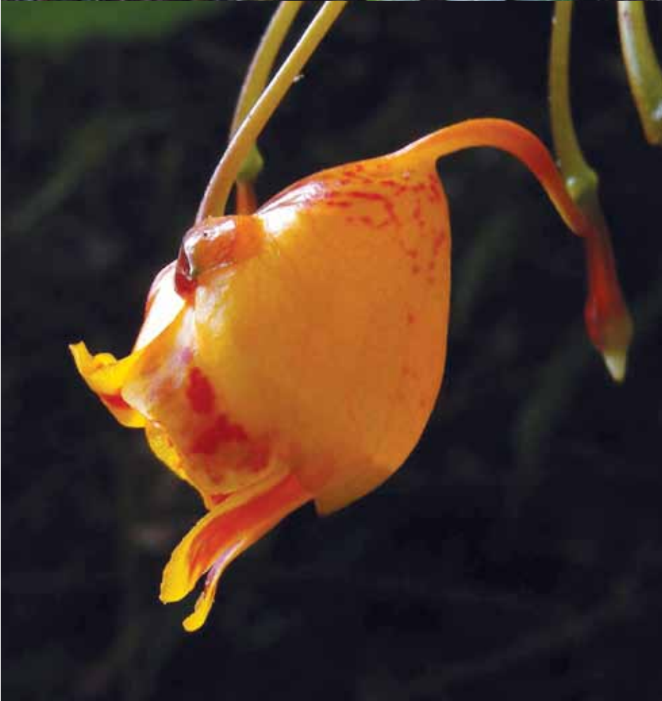
This beautiful succulent Impatiens was found on a vertical rock face in a sheltered spot near Sijunjung. This is a potentially new taxon, and is currently being researched by botanists at Herbarium Bogoriense.