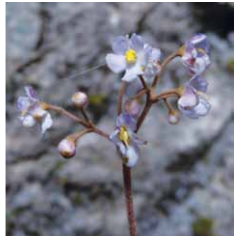
The pale lilac flowers of Paraboea leuserensis , an endemic to the Leuser region as its name suggests.