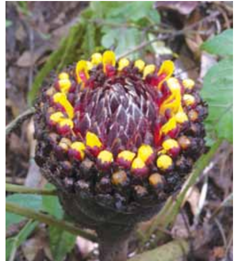
The bright colours of this Etilingera inflorescence show up well even in the dim light of the forest understory. This is an as-yet unidentified and potentially new taxon from near Sijunjung.