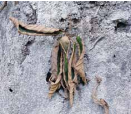
► Limestone habitats are free-draining and can periodically become very dry. This plant of Paraboaea leuserensis has rolled up its leaves in response to water stress.