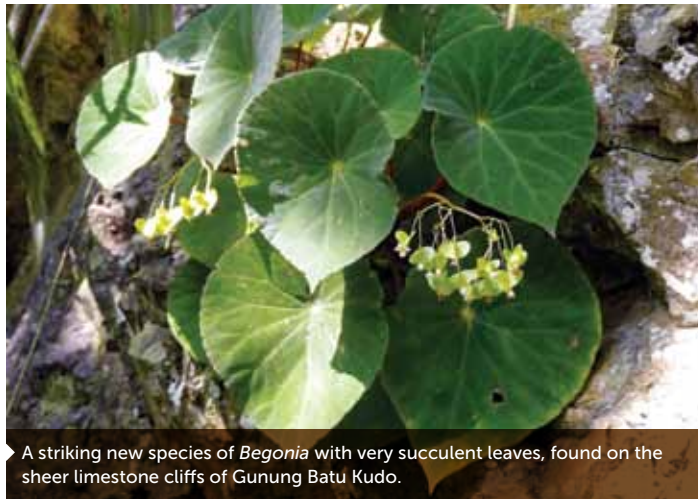
▶ A striking new species of Begonia with very succulent leaves, found on the sheer limestone cliffs of Gunung Batu Kudo.