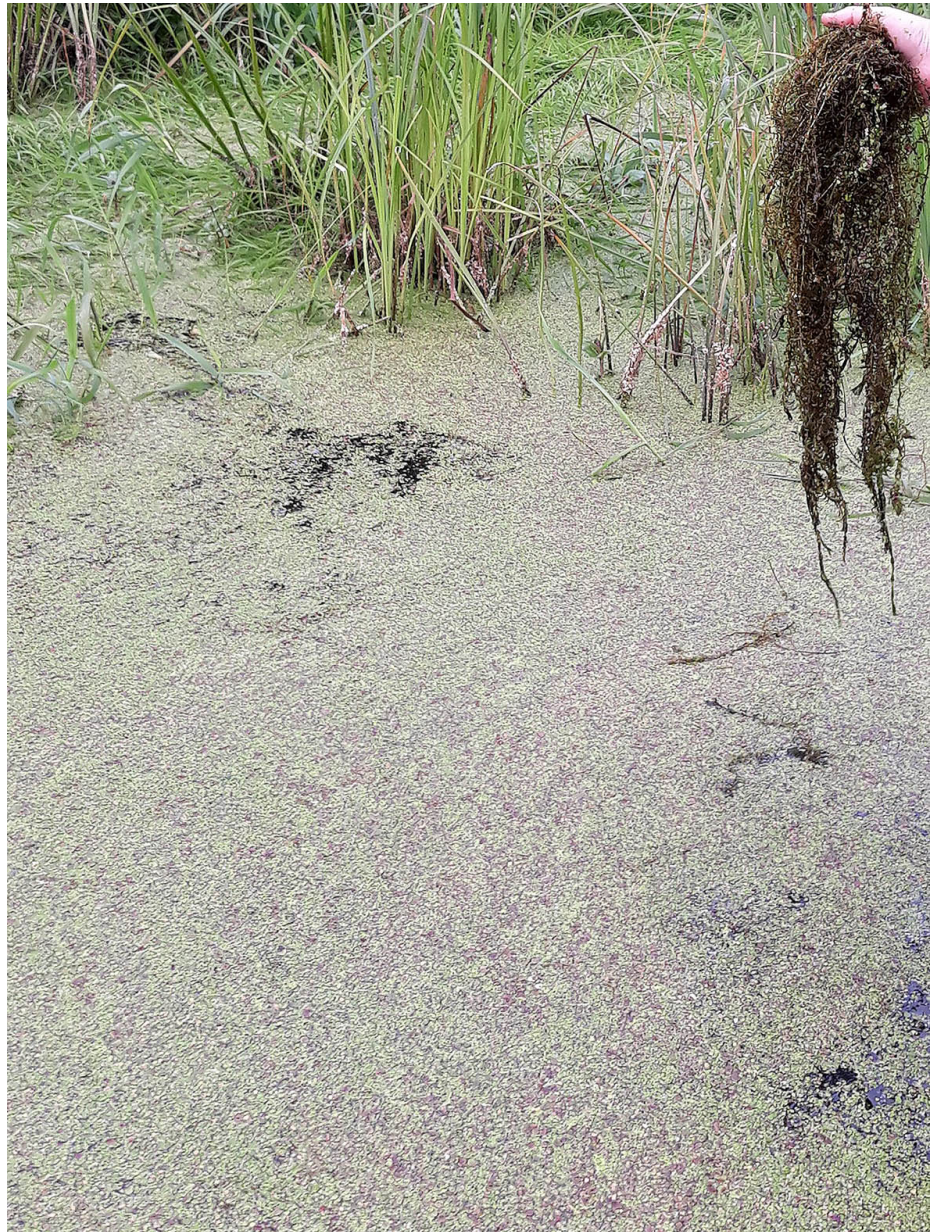
Figure 3. Typical habitat of Elodea nuttallii in the Nemunas River – shallow depression along the helophyte belt at the shore covered by Lemnaceae species.

The alignment of the sequences of psbE-petL region included 1109 base pairs. However, the psbE-petL region turned out to be less variable. Here, in total 12 variables and 1097 conserved sites. Predominantly single nucleotide substitutions (SNP) (eight positions) and one four base pairs insertion/deletion (from 355 nt position to 358 nt position) (Table 5).