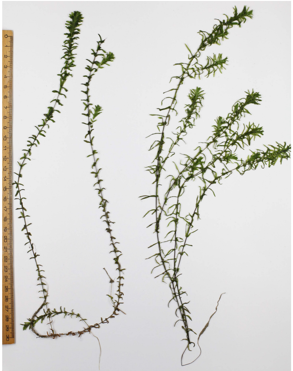
Figure 2. Habitus of Elodea canadensis and E. nuttallii from a location downstream of the Baltoji Ančia River mouth.

downstream (respectively 15.5 \pm 1.8 , 1.7 \pm 0.3 ). In general E. nuttallii from the Nemunas River had significantly longer leaves than indicated in many literature sources (Table 3). Similar long-leaved morphotypes have been also described by Simpson (1988).