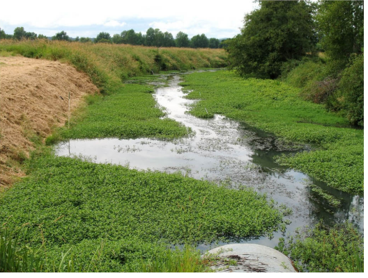
Figure 2. Photos of parrot-feather taken in Washington state, included as visual examples of a complete parrot-feather plant and densely growing populations (King County NWCP 2018). Specimen of a rooted fragment held in hand with roots and young stems growing off fragment (left). Examples of dense wild parrotfeather growth (right, top and bottom).

adjust and rapidly change; under experimental conditions, parts of the stem were observed to change from the emergent to the submersed form "in a matter of days" after a rise in water level (Wersal and Madsen 2011). The majority of the plant's biomass appears to be positioned above the water, but the stems can extend downward up to 2 meters, where a rhizome is anchored to the sediment by thin roots (Cook 1985; Murphy 2007; Haberland 2014).