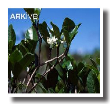
Figure 17. Tabernaemontana apoda C. Wright, (Source: arkive.org)

Cinnamodendron cubense Urb. (Figure 18): The genus is characterized for aromatic perennifolios trees. Species of this family can be use for hypotension control, cold, fiber and food condiment (25).