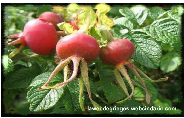
Figure 4. Rosa canina L.

Among the sorts of medicinal herbs found in the region there are those, the number of which are extremely small and they require protection. First of all, these are Adonis vernalis, Vaccinium vitisidaea L., Valeriana officinalis L., Oxycoccus palustris Pers., Nuphar lutea L. and others.