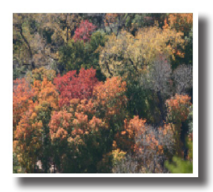
Figure 20. Genus laplacea , (Source: thefullwiki.org)

Laplacea curtyana A. Rich (Figure 20): It is threatened by habitat loss. The juice that exudates by root, stem and leaves excision is diuretic and have been considered as antisyphilitic (26).