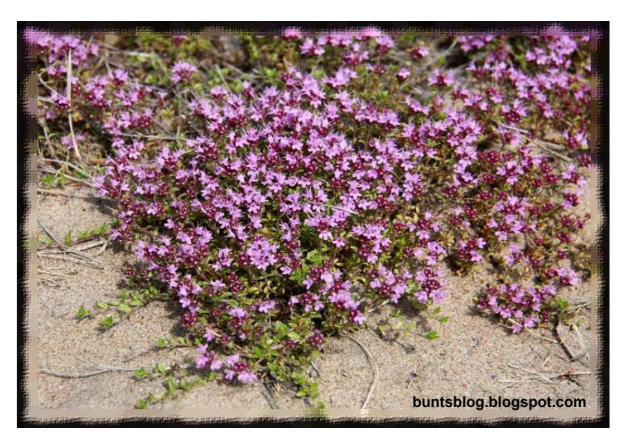
Figure 5. Thymus serpyllum L.