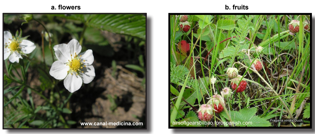
Figure 2. Fragaria viridis Duch.