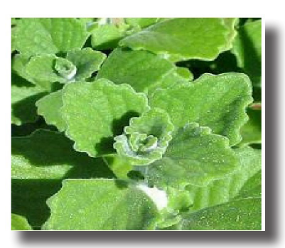
Figure 16. Plecthranthus amboinicus (Lour.)Spren, (Source: bitterrootrestoration.com)