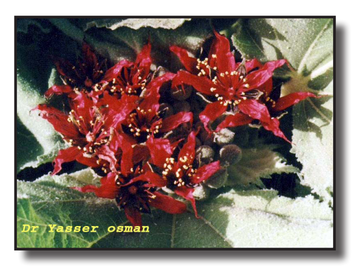
Figure 10. Moghat (Glossostemon bruguieri)