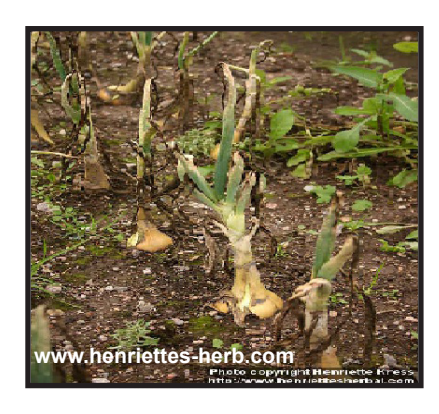
Figure 12. Alliun cepa L.

Cuba has a great flora diversity typified by endemic dominance (51,4%), floristic elements inversion, microphilia, and micrantia, and a high vulnerability. If together with all this join the existence of soils with a great edafic mosaic, excellent climatic conditions for the development of a lot exotic species, and a rich and complex cultural history that have contribute not only with a quantity of species, but also with a diverse use of them, so it is possible to conclude that Cuba has a great native and introduce vegetal wealth. This factors have been conditioned the existence of an economic flora not well study. that in the case of medicinal plants is particularly rich, in where since