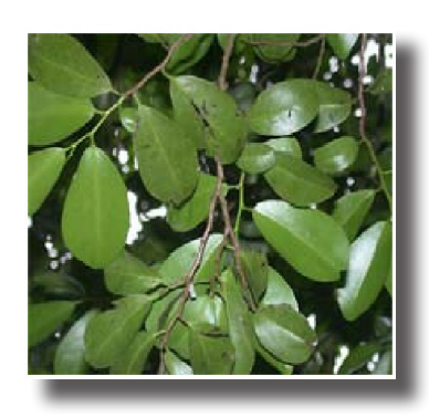
Figure 18. Cinnamodendron cubense Urb.

Juniperus Iucayana Britton (Figure 19): From the leaves of this plants it is possible to extract oil with the composition of pinene (25–27 %), limonene (23–27 %), sabinene (11-12 %) with small amounts of sesquiterpenes, all this with medicinal properties (26).