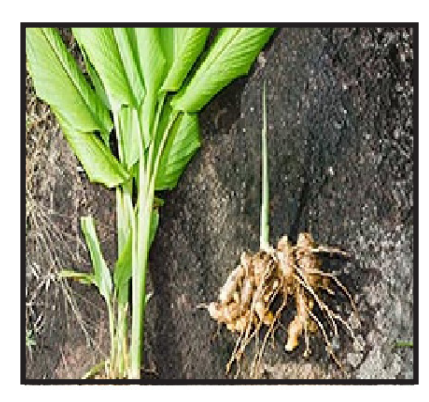
Figure 13. Zingiber officinale Rosc.

In Cuba there are medicinal species that are widely used by people, and some of them are certificated by the Ministry of Public Health for they use as vegetable medicine or as a base for the preparation of phytopharmacist. Almost all the totality of medicinal species related for Cuba doesn't have pharmacological and toxicological studies that probe the properties that people said they have, but in the last years the government has realize a great effort for the pharmacological