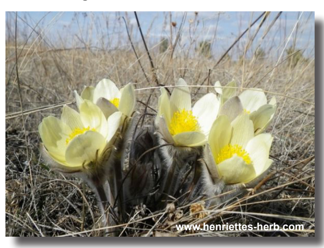
Figure 7. Pulsatilla flavescens Zucc.