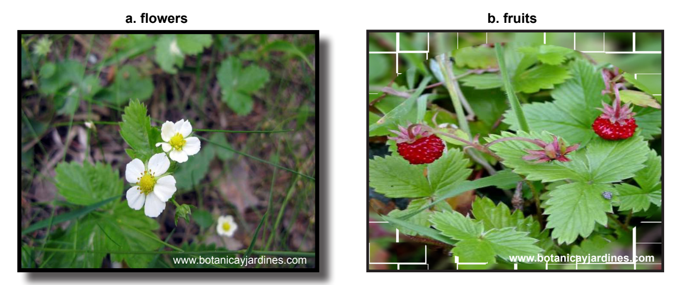
Figure 3. Fragaria vesca L.