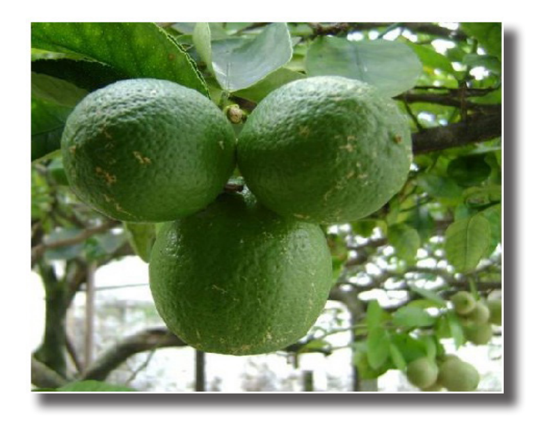
Figure 14. Citrus aurantifolia (Christm.)