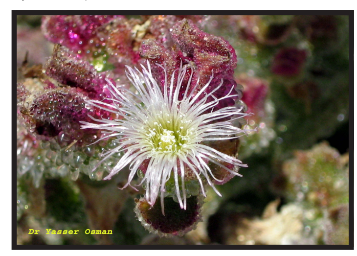
Figure 11. Ice plant (Mesembryanthemum crystallinum)

The Cuban vascular flora embraces 6,700 species (500 Pteridophytes and 6,200 Phanerophytes of which about 20 are Gymnosperms and the rest Angiosperms), grouped in 1,300 genera and 181 families. A figure of 51 % endemism has been reported thus making about 3,100 endemic species. Moreover, Cuban natural ecosystems have been strongly altered during the last 200 years; about 16 % of its phanerogamic flora is threatened and probably 2 % is already extinct (22).