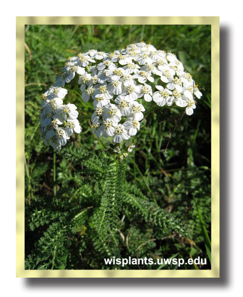
Figure 1. Achillea millefolium L.