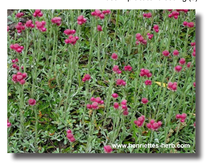
Figure 6. Antennaria dioica

Rosa majalis Herrm, Adonis vernalis L., Valeriana offisinalis L. will require plantation cultivation to meet the needs of pharmaceutical base development. Saving and restoration of natural ecosystems is only possible when given a reasonable management based on scientific and legal bases. People should not forget the importance of genetic resources conservation not only for biological diversity and ecological balance, but also for their use in practical breeding (8).