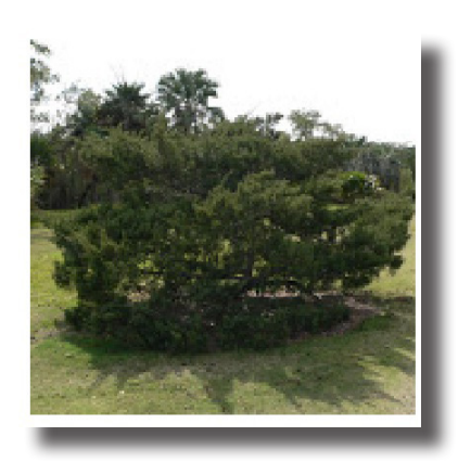
Figure 19. Juniperus lucayana Britton

Juniperus Iucayana Britton (Figure 19): From the leaves of this plants it is possible to extract oil with the composition of pinene (25–27 %), limonene (23–27 %), sabinene (11-12 %) with small amounts of sesquiterpenes, all this with medicinal properties (26).