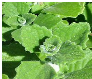
Figure 16. Plecthranthus amboinicus (Lour.)Spren, (Source: bitterrootrestoration.com)