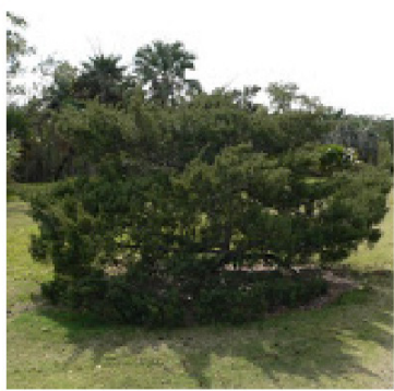
Figure 19. Juniperus lucayana Britton, (Source: forums.gardenweb.com)

Juniperus lucayana Britton (Figure 19): From the leaves of this plants it is possible to extract oil with the composition of pinene (25–27 %), limonene (23–27 %), sabinene (11-12 %) with small amounts of sesquiterpenes, all this with medicinal properties (26).