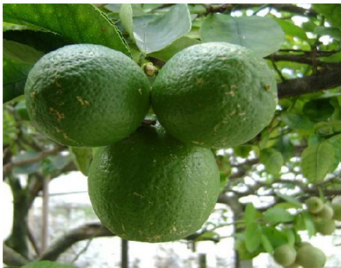
Figure 14. Citrus aurantifolia (Christm.)