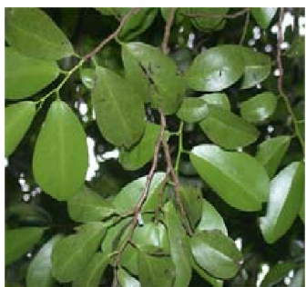
Figure 18. Cinnamodendron cubense Urb.

Juniperus lucayana Britton (Figure 19): From the leaves of this plants it is possible to extract oil with the composition of pinene (25–27 %), limonene (23–27 %), sabinene (11-12 %) with small amounts of sesquiterpenes, all this with medicinal properties (26).