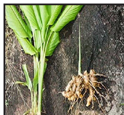
Figure 13. Zingiber officinale Rosc.

In Cuba there are medicinal species that are widely used by people, and some of them are certificated by the Ministry of Public Health for they use as vegetable medicine or as a base for the preparation of phytopharmacist. Almost all the totality of medicinal species related for Cuba doesn't have pharmacological and toxicological studies that probe the properties that people said they have, but in the last years the government has realize a great effort for the pharmacological