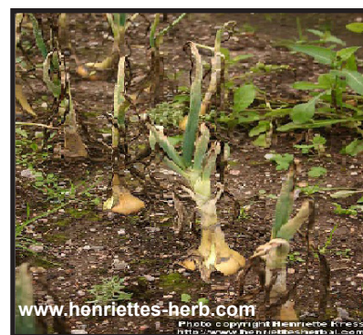
Figure 12. Allium cepa L.

Cuba has a great flora diversity typified by endemic dominance (51,4 %), floristic elements inversion, microphilia, and micrantia, and a high vulnerability. If together with all this join the existence of soils with a great edafic mosaic, excellent climatic conditions for the development of a lot exotic species, and a rich and complex cultural history that have contribute not only with a quantity of species, but also with a diverse use of them, so it is possible to conclude that Cuba has a great native and introduce vegetal wealth. This factors have been conditioned the existence of an economic flora not well study, that in the case of medicinal plants is particularly rich, in where since