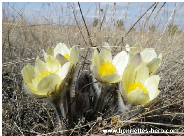
Figure 7. Pulsatilla flavescens Zucc.