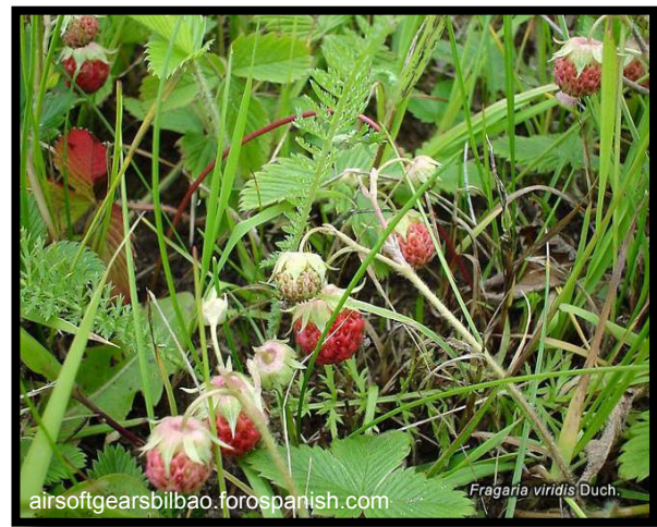
Figure 2. Fragaria viridis Duch.