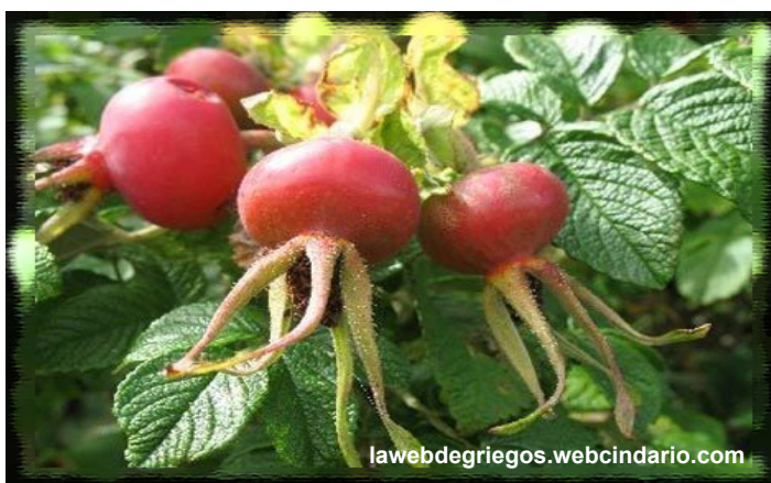
Figure 4. Rosa canina L.

Among the sorts of medicinal herbs found in the region there are those, the number of which are extremely small and they require protection. First of all, these are Adonis vernalis , Vaccinium vitisidaea L., Valeriana officinalis L., Oxycoccus palustris Pers., Nuphar lutea L. and others.