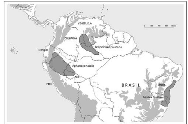
Figure 1. Map of the distribution of the three piassaba species in South America.

The genus Aphandra includes only one species, Aphandra