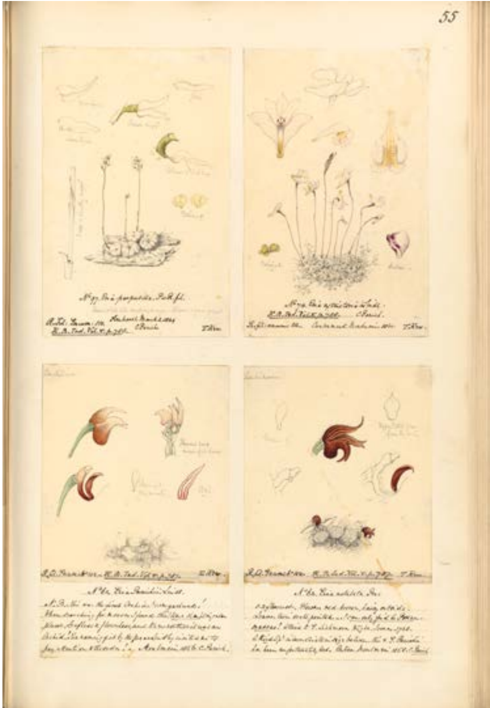
FIGURE 9. Porpax parishii (Lindl. & Rchb.f.) Rolfe in Orchid Rev. 16: 8. 1908. Eria parishii Lindl. & Rchb.f., Trans. Linn. Soc. London 30: 147. 1874. Type: Burma, Parish s.n. (holo. W). Parish illustration vol. 1, p. 55, dated 1856. Reproduced with the kind permission of the Director and the Board of Trustees, Royal Botanic Gardens, Kew.