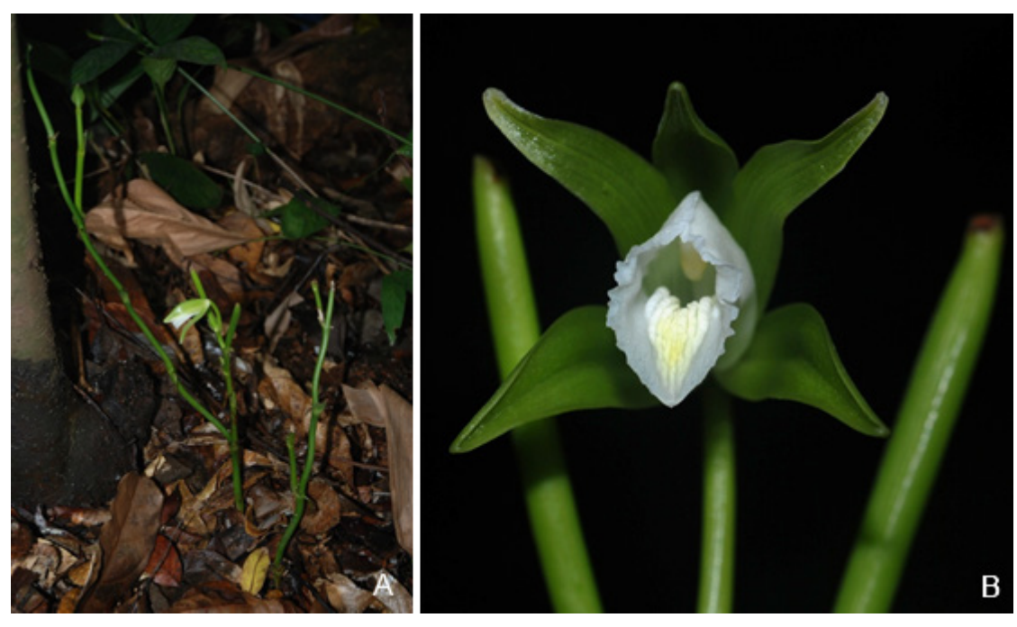
FIGURE 2. Vanilla dietschiana. A. Habit. Note the stem with monopodial (pseudosympodial) growth; B. Flower. Note the green sepals and petals and the white tubular labellum with longitudinal keels on the median portion.

Vanilloideae has been considered as а monophyletic subfamily (Cameron, 2003, 2009). However, the inclusion of Pogoniopsis in the analysis turns Vanilloideae paraphyletic (Fig. 1; adapted from Pansarin et al. 2012). Vanilloideae is currently divided into the tribes Vanilleae and Pogonieae (Cameron 2003, 2009; Pansarin et al. 2012). Vanilleae is subcosmopolitan in distribution and comprises nine genera, namely Clematepistephium, Cyrtosia, Epistephium, Eriaxis, Erythrorchis, Galeola, Lecanorchis, Pseudovanilla and Vanilla. The genus Vanilla is pantropical and has been frequently assumed to be natural on the basis of its climbing habit and lateral inflorescences (Cameron & Molina 2006). However, the inclusion of the rare Dictyophyllaria dietschiana in the phylogenetic analyses makes the genus Vanilla paraphyletic (Pansarin 2010a, 2010b; Pansarin et al. 2012). Thus, Dictvophyllaria has been restored to Vanilla (Pansarin 2010a, 2010b; Pansarin et al. 2012). Vanilla dietschiana (Figs. 2A-B) is closely related to V. edwallii and V. parvifolia by floral and vegetative characters. Vanilla dietschiana is terrestrial, with monopodial (pseudosympodial) non-climbing habit. Its reduced leaves are pale green, reticulate-