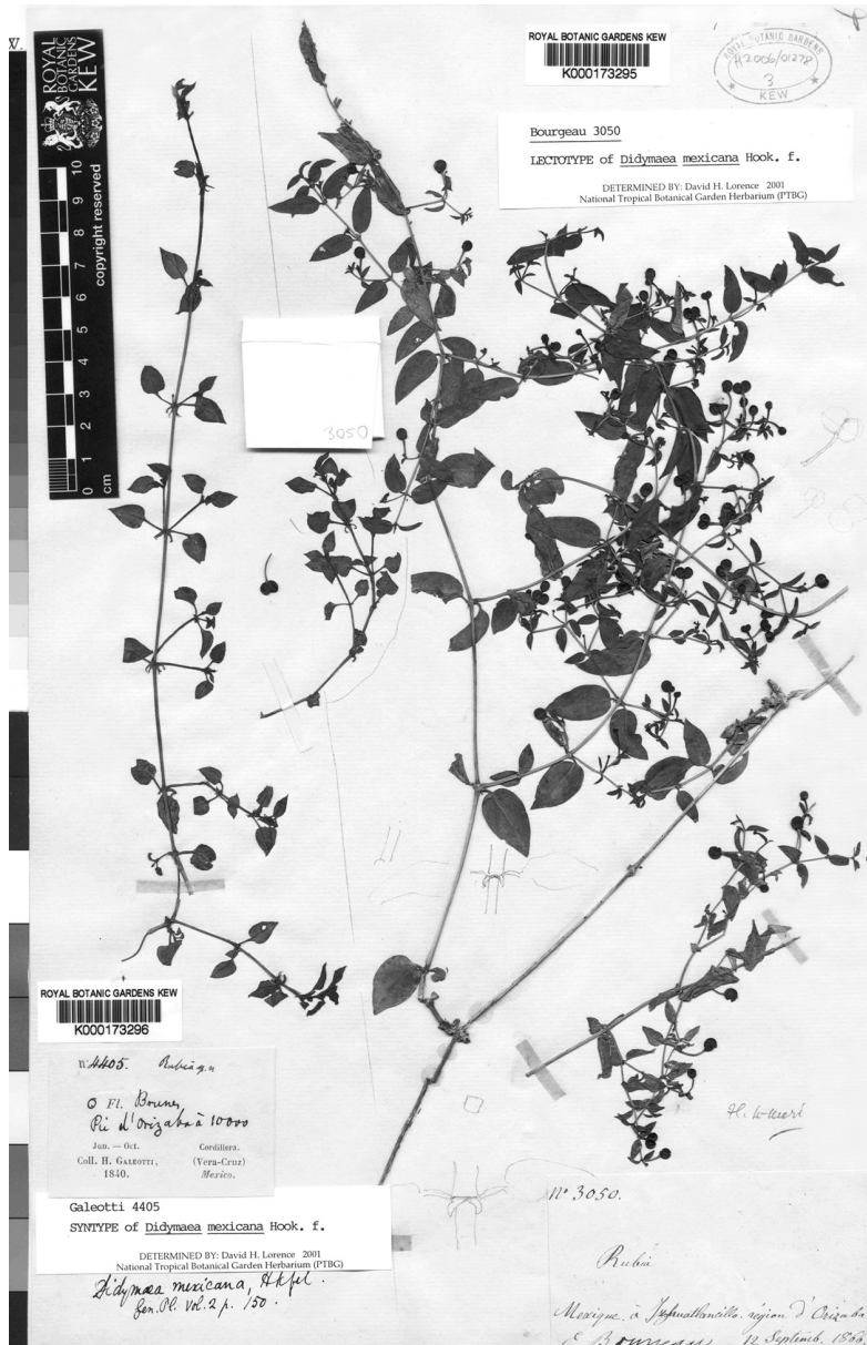
Fig. 2. Lectotype of Didymaea mexicana Hook. f. (right hand collection, Bourgeau 3050, K).