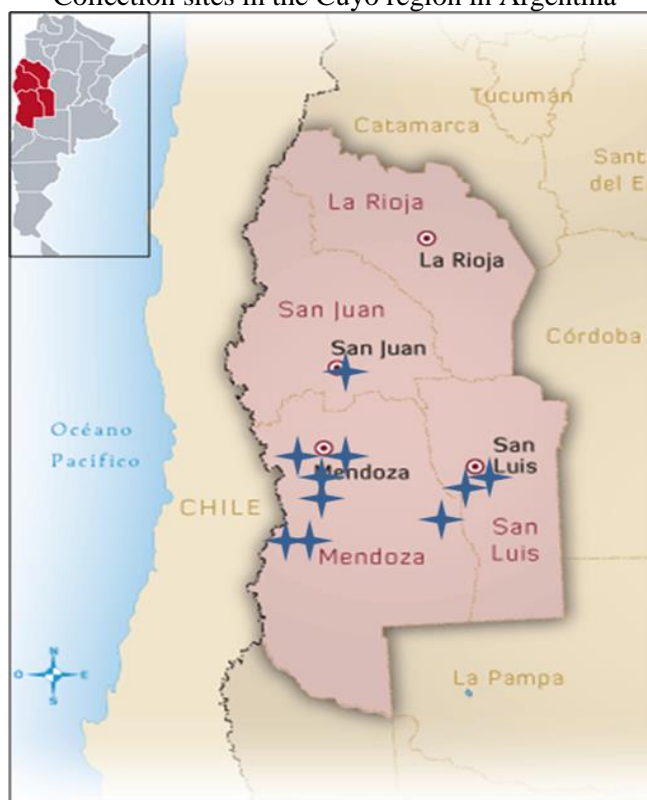
Figure 2 Collection sites in the Cuyo region in Argentina

Geographical coordinates were taken for each population using a Garmin Etrex Legend HCX. Plant materials were identified by one of the authors (AM) and vouchers specimens from each site were deposited in the "Instituto de Recursos Biológicos-INTA", Hurlingham, Argentina (BAB) (Table 1).