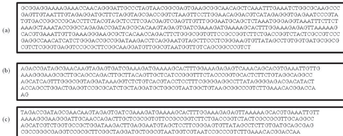
Figure 2. Nucleotide sequences from the genera isolated from leaves of safflower false mildew: a) Ramularia , b) Alternaria , c) Cladosporium .

The fungal taxonomy is a dynamic and progressive discipline that constantly generates changes in its nomenclature. Traditionally, fungi are classified according to their morphology and sexual status; however, they have also been classified from an ecological and biological panorama (Guarro et al. , 1999). Disputes to name species commonly occur, particularly when fungi have the ability to spread using different types of reproduction, which varies with the geographical zone in which the sample was collected, or simply with the time of collection (Shenoy et al. , 2007). For this reason, there are many synonymous for some species and they are constantly reclassified. Also, the difficulty of the