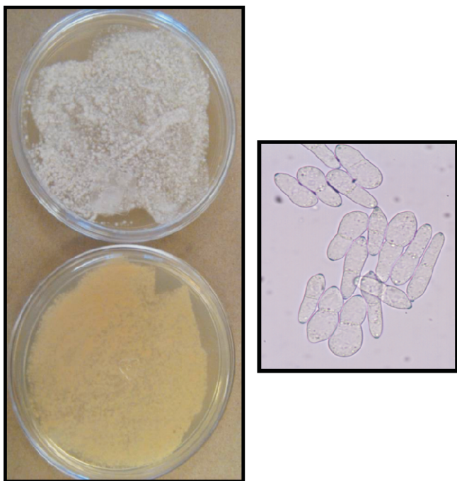
Figure 3. Colonies and spores isolated from false mildew in medium ST at 18°C.

morphological identification causes frequent changes in the classification by genera, Ramularia and Cercospora for example (Kirschner, 2009). Moreover, Tautz et al. (2003) mentioned that one of the disadvantages of the traditional taxonomy systems is the dependence on specialists whose skills are lost upon retirement; other is the difficulty to access the specialized literature.