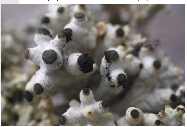
a) Fertile podetia with black spore masses extruding from apothecia

Mountain Crab-eye is the only species of the genus Acroscyphus . It is noteworthy that the Mountain Crab-eye in Canada occupies peatland habitats that are very different from the habitats of Mountain Crab-eye elsewhere in the world. There could be genetic or chemical differences between the Canadian subpopulations and other subpopulations.