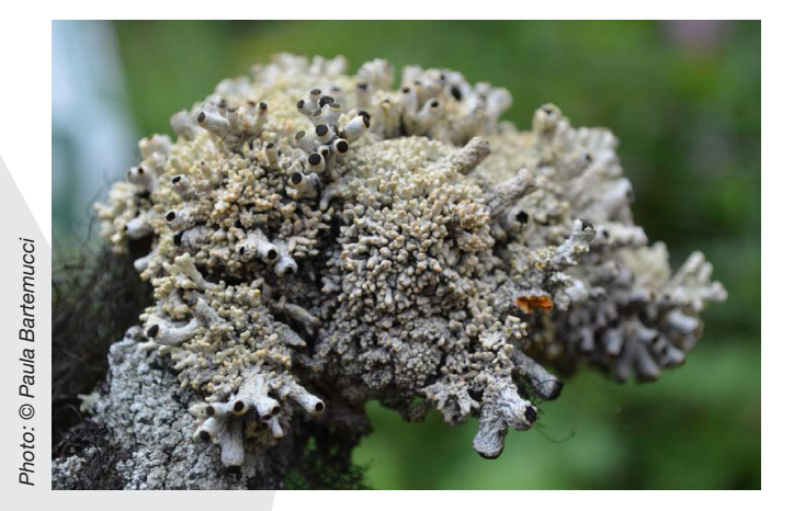
Scientific name Acroscyphus sphaerophoroides