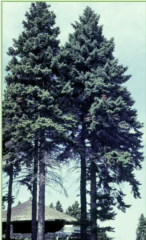
Photo 4: Cytospora canker generally attacks lower branches and, over many years, gradually works its way up the tree.