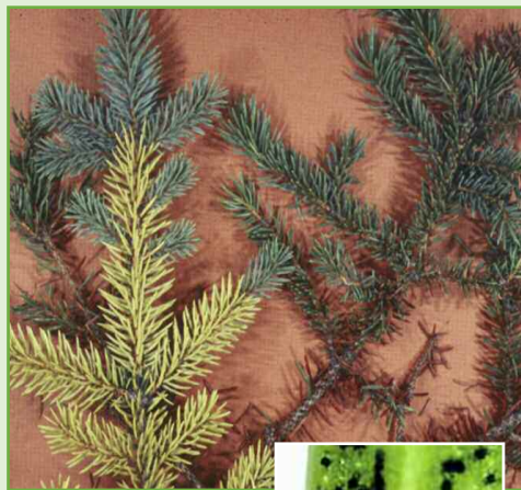
Photo 5: Needlecast diseases such as Rhizosphaera typically attack previous years' needles. As with Rhizosphaera , Stigmina ( Mycosphaerella ) produces fruiting bodies (reproductive structures) on spruce needles.