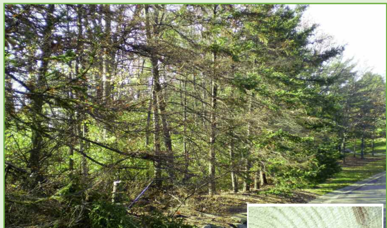
Photo 7: Many factors may contribute to Spruce Decline. Here, the roots of these spruce trees were buried with approximately 18 inches of fill 10 years ago. Note stress as evidenced by ring compression starting approximately 10 years back (Inset).