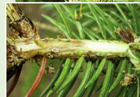
Photo 3: Phomopsis has been discovered attacking branches on large spruce in

recent years. Cankers may cause resin release and are disclosed (brown cambial regions) by scraping the bark (Inset).