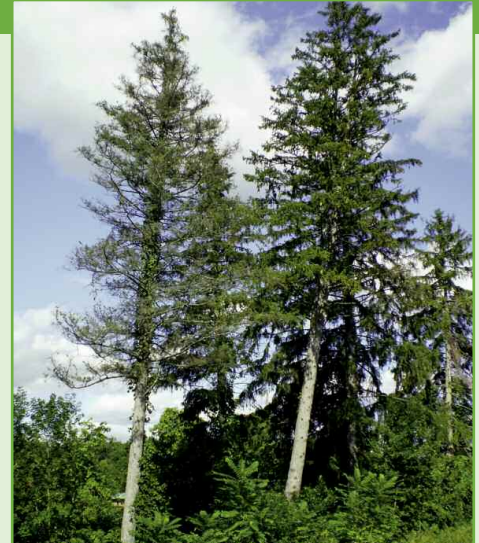
Photo 1: Many spruce trees around Michigan seem to be declining at an accelerated rate. The cause is not directly understood but is probably attributable to multiple factors.