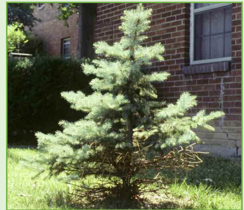
Photo 2: Phomopsis canker was discovered by the author in the late 1980s and was believed to primarily attack smaller spruce trees; Phomopsis was known to be lethal to spruce trees.