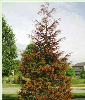
Photo 8: Herbicides may contribute to Spruce Decline. However, the recent Imprelis issue is limited in distribution and considered short-term; hence, it should not be included in the phenomenon known as Spruce Decline.