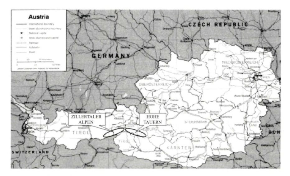
Fig. 1. Area of collection in Austria

These areas appeared to be particularly suitable, due to several lateral valleys with northern exposition. We intended to visit one valley a day in two different years. The soils are more or less acid except some small areas, where calcareous soil was noted, on the contrary of the Italian slopes where calcareous and acid soils are more equally distributed. We know the area would need more time in order to be better explored. However, we could determine 67 different taxa out of a total of 107 records.