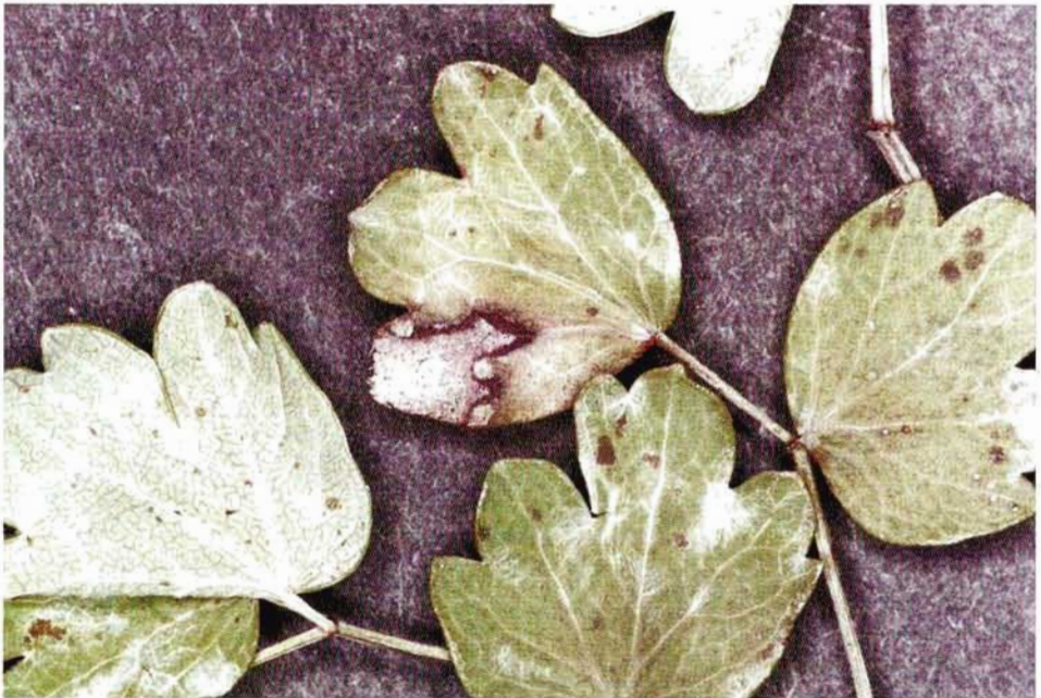
Fig. 5. Ascochyta actaeae (Bres.) J. J. Davis on Thalictrum minus