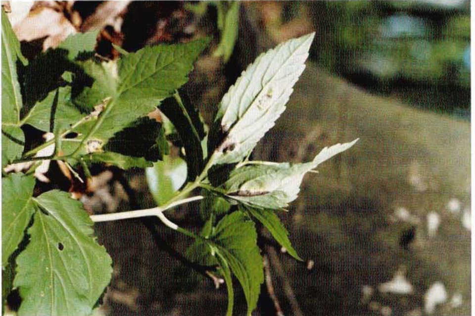
Fig. 3. Ramularia concomitans Ell. et Holw. on Bidens tripartita