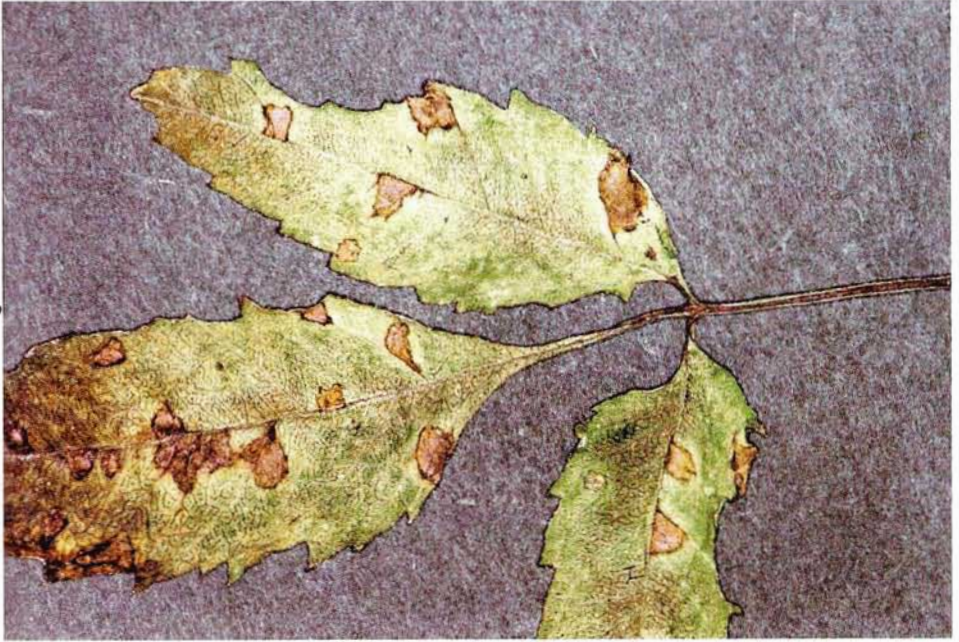
Fig. 2. Puccinia dentariae (Alb. et Schw.) Fuck. on Dentaria enneaphyllos