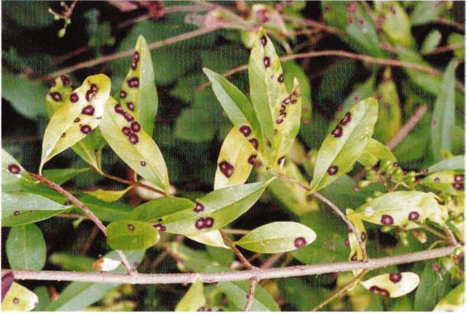
Fig. 4. Thedgonia ligustrina (Boerema) Sutton on Ligustrum vulgare