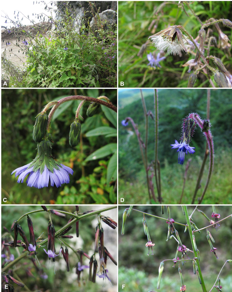
Figure 4. Selected species of Melanoseris in situ. A and C, Melanoseris atropurpurea (Yunnan, 9 Sep. 2009, photo by Z. J. Yin; voucher: Z. J. Yin & al. 1970 (KUN)), B, M. likiangensis (Sichuan, 23 Aug. 2012, photo by N. Kilian; voucher: N. Kilian & al. 10808 (B, KUN)), D, M. cyanea (Yunnan, 22 Sep. 2011, photo by G. X. Hu; voucher: H. J. Dong & al. 446 (KUN)), E, M. tenuis (Yunnan, 10 Sep. 2009, photo by Z. J. Yin; voucher: Z. J. Yin & al. 1969 (KUN)), F, M. graciliflora (Sichuan, 19 Aug. 2012, photo by N. Kilian; voucher: N. Kilian & al. 10509 (B, KUN)). doi:10.1371/journal.pone.0082692.g004

an isolated, basally branching position in the present ITS tree. The strikingly incongruent position in the plastid phylogeny as a member of the Lactuca lineage deserves further investigation. From the morphological evidence we consider the nuclear phylogeny as the better estimate for the species phylogeny.