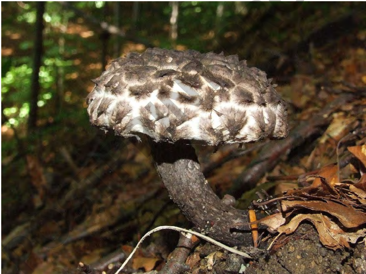
Fig. S48. Basidioma of Strobilomyces strobilaceus (Scop.) Berk. from the Bieszczady Mts (Aug 16, 2009).

*♦ Strobilomyces strobilaceus (Scop.) Berk. (Fig. S48); RL-R, PaP; LR: [S6,S7,S55] (as S. floccopus (Vahl. in Fl. Dan.) Karst.), [S1,S4,S12,S13,S16,S38,S245]. PP: SE from Bereżki (NW slope of Widełki Mt), Ustrzyki Górne 2 km NE (N slope of Kiczera Mt), Wołosate 3.5 km E (Horbki); VIII; beech forest, fir-beech forest; soil. UP: Wetlina (E slope of Jawornik Mt), Hulskie NR borders, Wetlina (Sękowa Mt, Jawornik range), Stuposiany 2 km SW (S slope of Prypiczek Mt), SW from Muczne (Jamniczna), Hulskie NR, Wetlina 2 km NE (W slope of Hnatowe Berdo Mt), Sine Wiry NR (S slope of Połoma Mt); VIII-X; beech forest, fir-beech forest; soil.