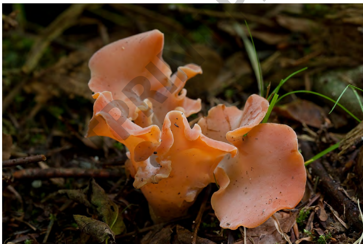
Fig. S51. Basidiomata of Tremiscus helvelloides (DC.) Donk from the Bieszczady Mts (Aug 06, 2011).

* Tremiscus helvelloides (DC.) Donk (Fig. S51); RL-R, PaP; LR: [S7] (as Phlogiotis helvelloides DC.), [S1,S4,S66,S152]. UP: Zatwarnica 2 km S (Hylaty valley), Hulski valley; VIII-IX; beech forest; soil.