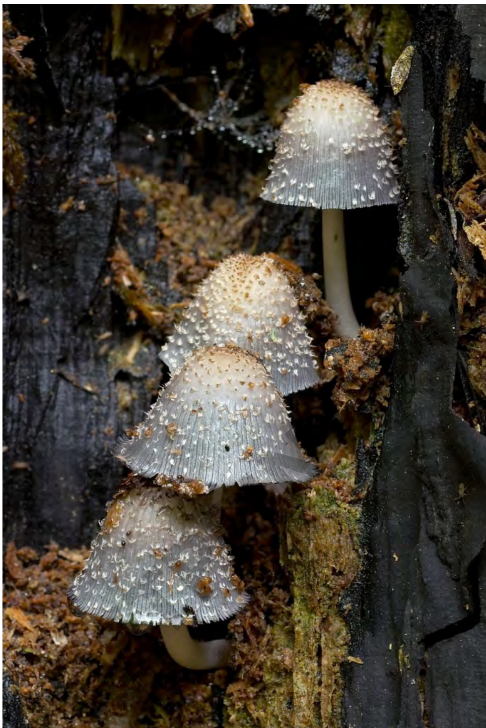
Fig. S16. Basidiomata of Coprinopsis spelaiophila (Bas & Uljé) Redhead, Vilgalys & Moncalvo from the Bieszczady Mts (Jul 02, 2010). Photography by T. Pachlewski.

* Coprinopsis tigrinella (Boud.) Redhead, Vilgalys & Moncalvo; NChL; LR: [S1] (as Coprinus tigrinellus Boud.), [S100]. UP: Lutowiska 2 km W (by the tourist trail to Chata