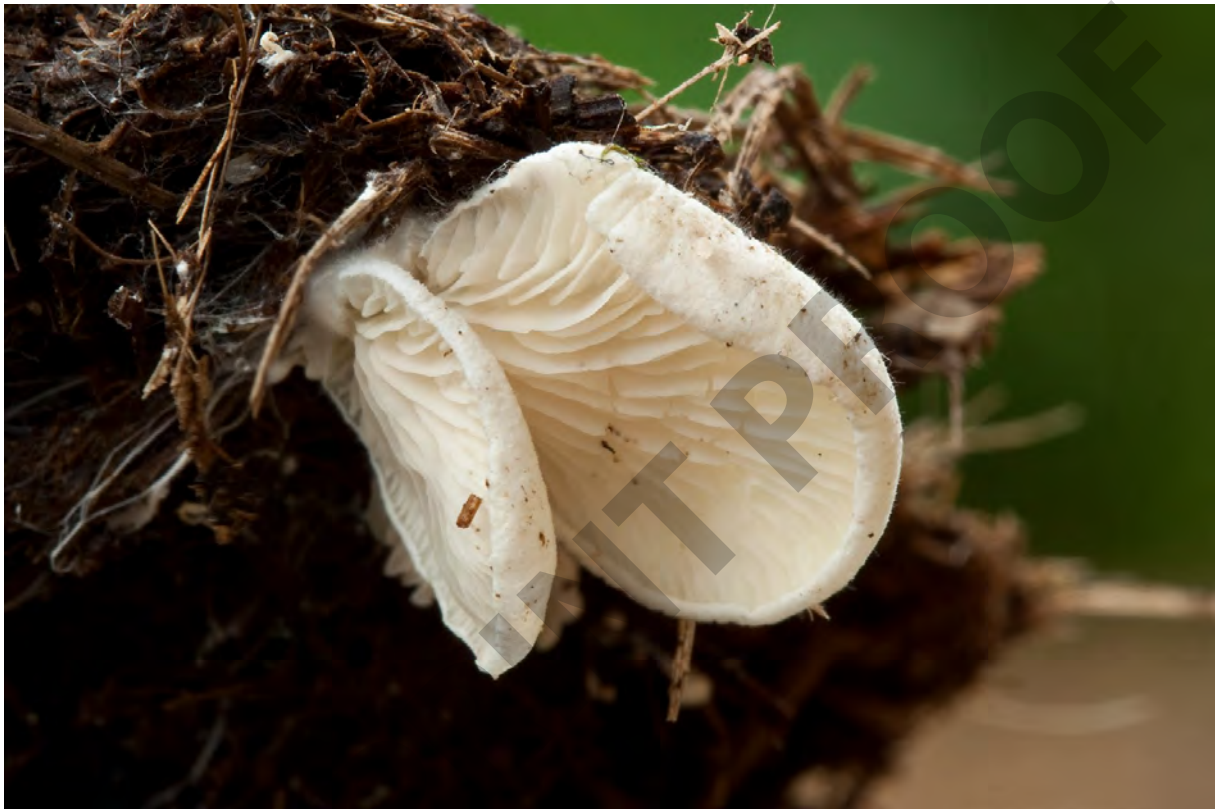
Fig. S15. Basidiomata of Clitopilus passeckerianus (Pilát) Singer from the Bieszczady Mts (Aug 01, 2011).

*♦ Collybia tuberosa (Bull.) P. Kumm.; LR: [S1,S6,S13]. UP: Pszczeliny 1.5 km W (SE slope of Magura Stuposiańska Mt); VIII; fir-beech forest; decaying basidiomata of agaricoid fungi.