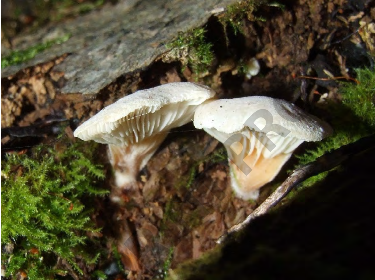
Fig. S25. Basidiomata of Hohenbuehelia auriscalpium (Maire) Singer from the Bieszczady Mts (Aug 22, 2009).

#*◆ Hohenbuehelia auriscalpium (Maire) Singer (Fig. S25); NChL, I++, SSI(C); PP: Wołosate (SW slope of Semków Wierszek Mt), Muczne (NE slope of Kudriawyński Wierch Mt); VIII, X; fir-beech forest; Fagus log, coniferous log. Notes: In Poland also known from Wigry NP [S156] and Ostrzycki Las NR [S144].