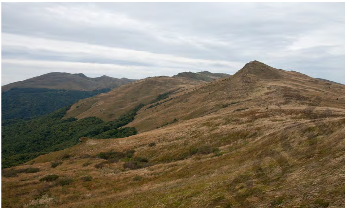
Fig. 5. Subalpine zone (polonynas) on Kopa Bukowa Mt, Bieszczady Mts (Sep 10, 2011).