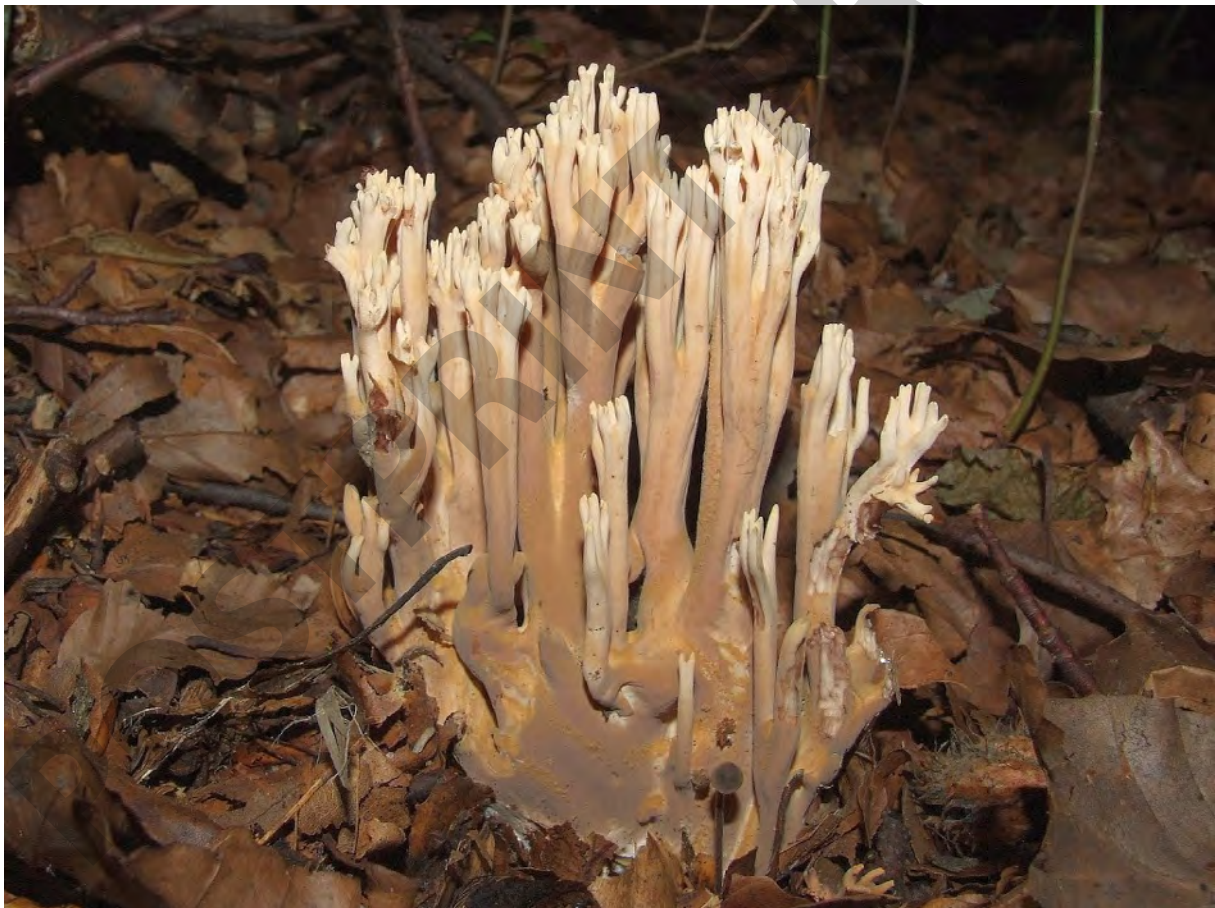
Fig. S46. Basidioma of Ramaria bataillei (Maire) Corner from the Bieszczady Mts (Sep 03, 2011).

#* Ramaria bataillei (Maire) Corner (Fig. S46); NChL; UP: Ustrzyki Górne 3 km SW (slope of Wielka Rawka Mt); IX; beech forest; soil. Notes: In Poland also known from Bory Tucholskie NP [S222] and Przemyśl Foothills [S29].