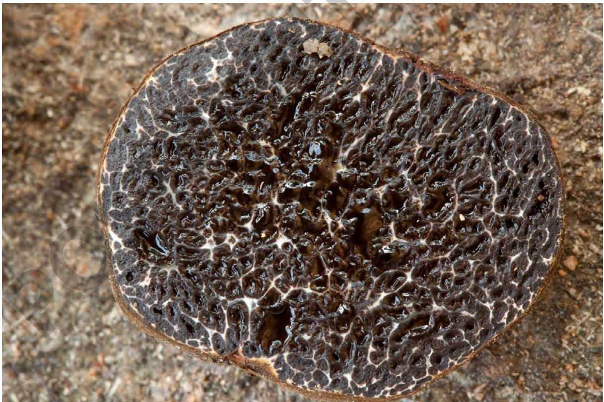
Fig. S32. Basidiomata of Melanogaster broomeanus Berk. from the Bieszczady Mts (Aug 06, 2011).