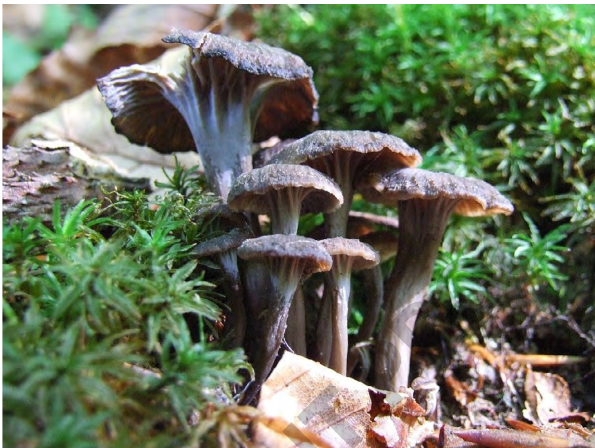
Fig. S13. Basidiomata of Cantharellus cinereus Pers. from the Bieszczady Mts (Aug 16, 2009).

*♦ Cantharellus friesii Quél.; RL-E; LR: [S1,S76]. PP: Ustrzyki Górne 3.5 km SW (Czuryłowo), Ustrzyki Górne 2 km SW (Wierch Mt), Wołosate 3.5 km E (Horbki), Ustrzyki Górne 2 km NE (N slope of Kiczera Mt), Wetlina (Górna Solinka valley, Sołynki Forest), Wołosate (SW slope of Semków Wierszek Mt); VIII-X; beech forest, fir-beech forest; soil. UP: Dwerniczek 2 km N, Dwernik 1.5 km NE, Wołosate 2 km NE (N slope of Hudów Wierszek Mt), Bereżki 1.5 km SE (S slope of Kiczera Mt), Near Bereżki (NE slope of Kiczera Bereżczańska Mt), Stuposiany 2 km SW (S slope of Prypiczek Mt), Pszczeliny-Widełki 0.5 km W (SE slope of Magura Stuposiańska Mt), Pszczeliny 2 km W (SE slope of Magura Stuposiańska Mt), Bereżki 2 km NW, Wetlina 2 km NE (W slope of Hnatowe Berdo Mt), NNE from Jaworzec (NE slope of Żołobina Mt); VIII-IX; beech forest, deciduous forest, fir-beech forest; soil.