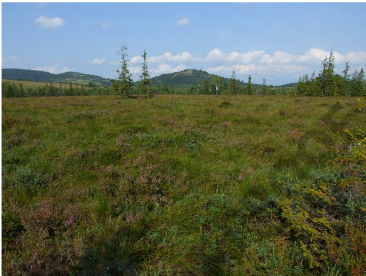
Fig. 6. Raised bog “Dźwiniacz” in the Upper San valley, Bieszczady Mts (Aug 18, 2009).