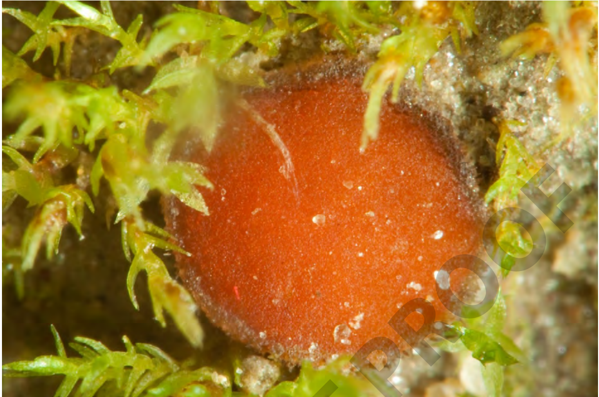
Fig. 14. Ascoma of Scutellinia torrentis (Rehm) T. Schumach. from the Bieszczady Mts (Aug 02, 2011).