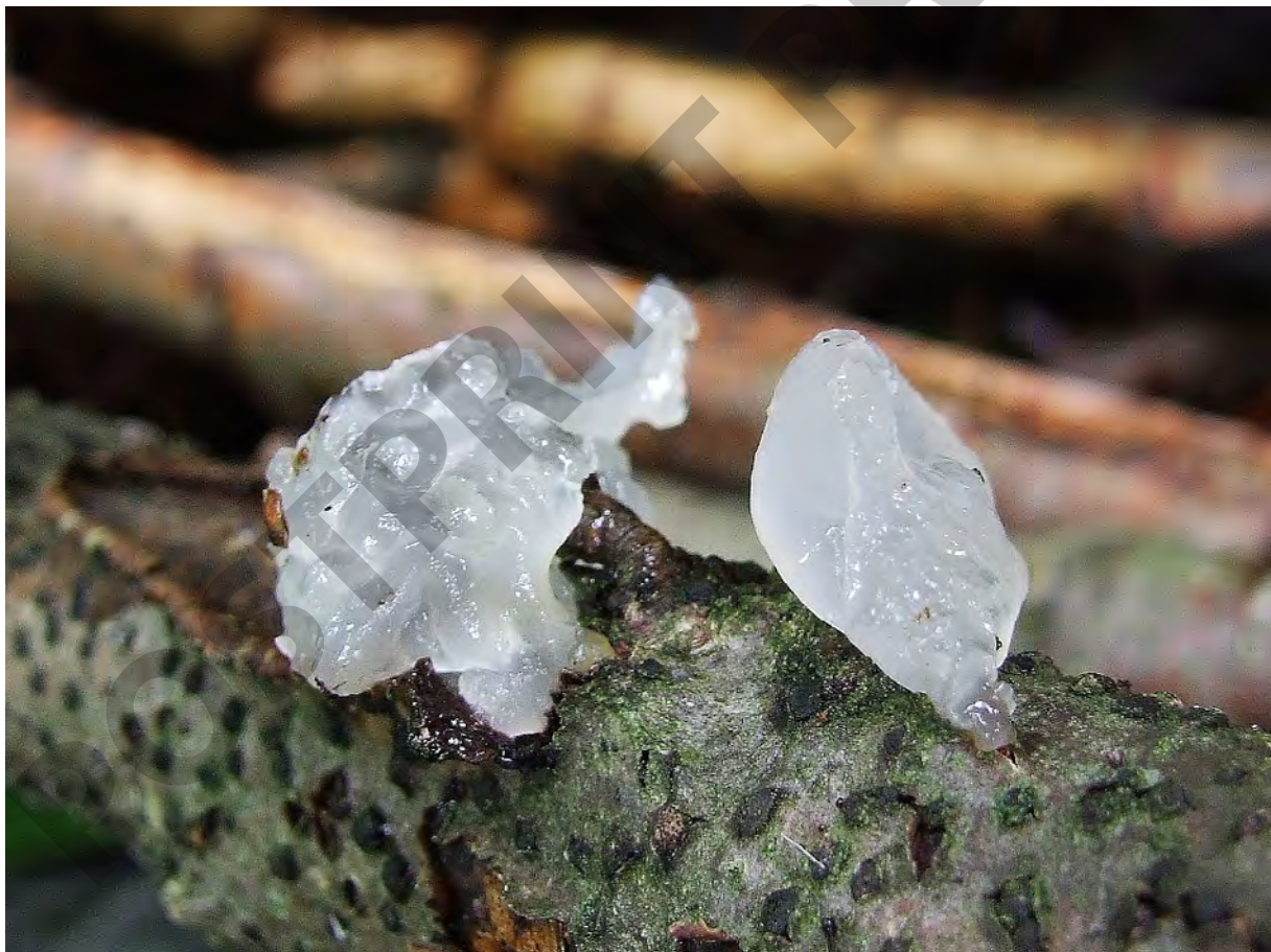
Fig. S50. Basidiomata of Tremella mesenterica (Schaeff.) Retz. f. crystallina Ew. Gerhardt from the Bieszczady Mts (Aug 02, 2011).

# Tremella mesenterica (Schaeff.) Retz. f. crystallina Ew. Gerhardt (Fig. S50); NChL; UP: Sękowiec 1.5 km N, Pszczeliny; VIII; deciduous forest, shrubs by the stream; deciduous branch. Notes: In Poland known also from Przemyśl Foothills [S29].