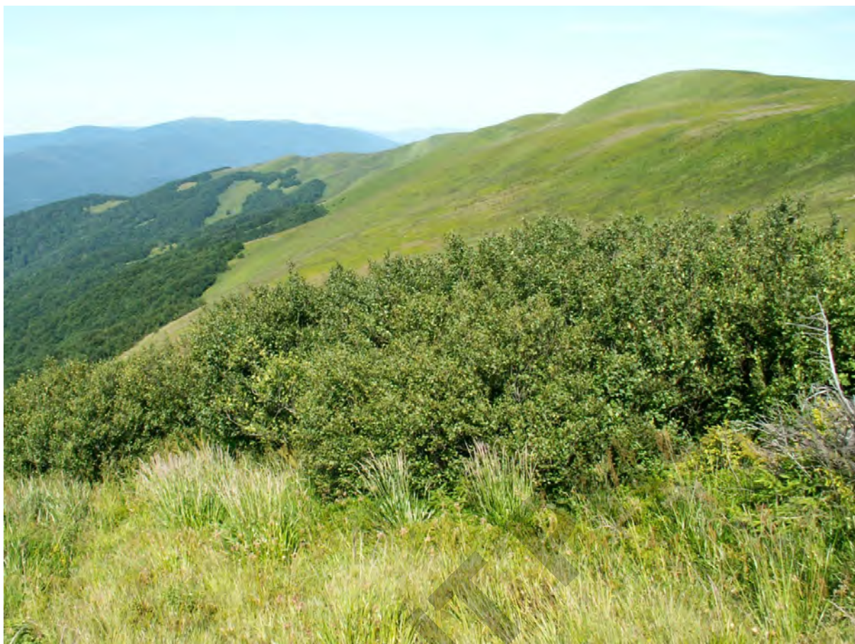
Fig. 4. Green alder ( Alnus viridis ) shrubs near Tarnica Mt, Bieszczady Mts (Jul 17, 2006).