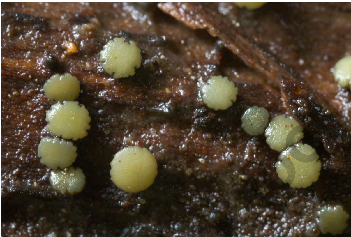
Fig. S7. Ascomata of Vibrissea decolorans (Saut.) A. Sánchez & Korf (Jun 03, 2010).

#*♦ Vibrissea truncorum (Alb. & Schwein.) Fr.; PP: Połonina Wetlińska Mt; VI; herbaceous shrubs; Sorbus aucuparia wood. Notes: In Poland known from two contemporary localities [S47,S48] and some historical ones [S8,S30,S31].