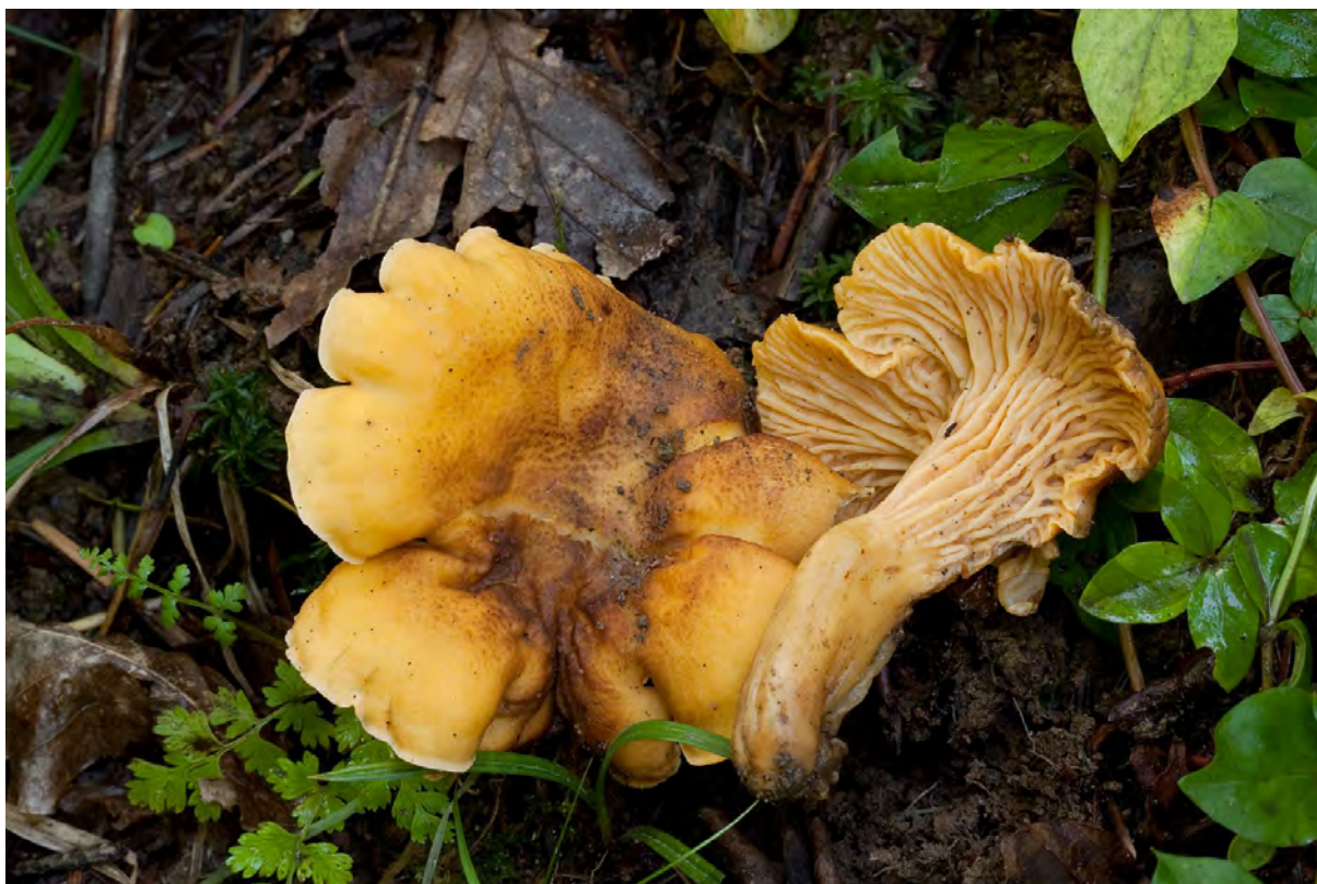
Fig. S12. Basidiomata of Cantharellus amethysteus (Quél.) Sacc. from the Bieszczady Mts (Aug 03, 2011).

*♦ Cantharellus cibarius Fr.; LR: [S1,S4,S5,S7,S9,S12]. PP: Wołosate (S slopes of Tarnica Mt), Wetlina (Górna Solinka valley, Sołynki Forest), Wetlina (Górna Solinka valley, Chyżyszcze), Wołosate (N slope of Kiczera Mt, Za Potok); VIII-X; beech forest, fir-beech forest; soil. UP: Brzegi Górne 1.5 km E, Lutowiska 2.8 km SW, Sękowiec 1.6 km N, Tarnawa Bog 2.5 km SW, Zatwarnica 2 km S (Hylaty valley), NNW from Zatwarnica (near Hulskie NR), Pszczeliny-Widełki 1.5 km W (SE slope of Magura Stuposiańska Mt), Pszczeliny 1 km W (SE slope of Magura Stuposiańska Mt), Pszczeliny 2 km W (SE slope of Magura Stuposiańska Mt), Muczne 2 km SW (Jamniczna), Bereżki 2 km NW, near Bereżki (NE slope of Kiczera Bereźczańska Mt); VII-VIII; beech forest, fir forest, mixed forest, fir-beech forest, deciduous forest; soil.