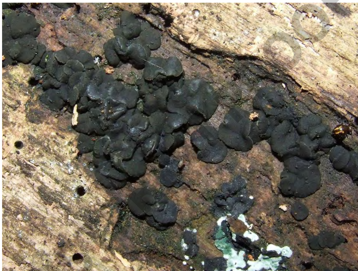
Fig. S1. Ascomata of Bulgariella pulla (Fr.) P. Karst. from the Bieszczady Mts (Aug 08, 2009).

*♦ Bulgaria inquinans (Pers.) Fr.; LR: [S6,S9,S13] (as B. polymorpha (Oeder) Wettstein), [S1,S5,S14]. PP: between Pszczeliny and Bukowe Berdo Mt (Kiczera Mt), Wołosate 3.5 km E (Horbki), SW from Zatwarnica (Hulski valley, SE slope of Błyszczowy Berek Mt), Ustrzyki Górne (near parking place at the base of Wielka Rawka Mt); VI, VIII; beech forest, fir-beech forest, mixed forest; Fagus log. UP: Lutowiska (by nature trail), Wetlina (E slope of Jawornik Mt), Hulskie NR, Sine Wiry NR (S slope of Połoma Mt); VIII, X; roadside, beech forest; wood, Fagus log.