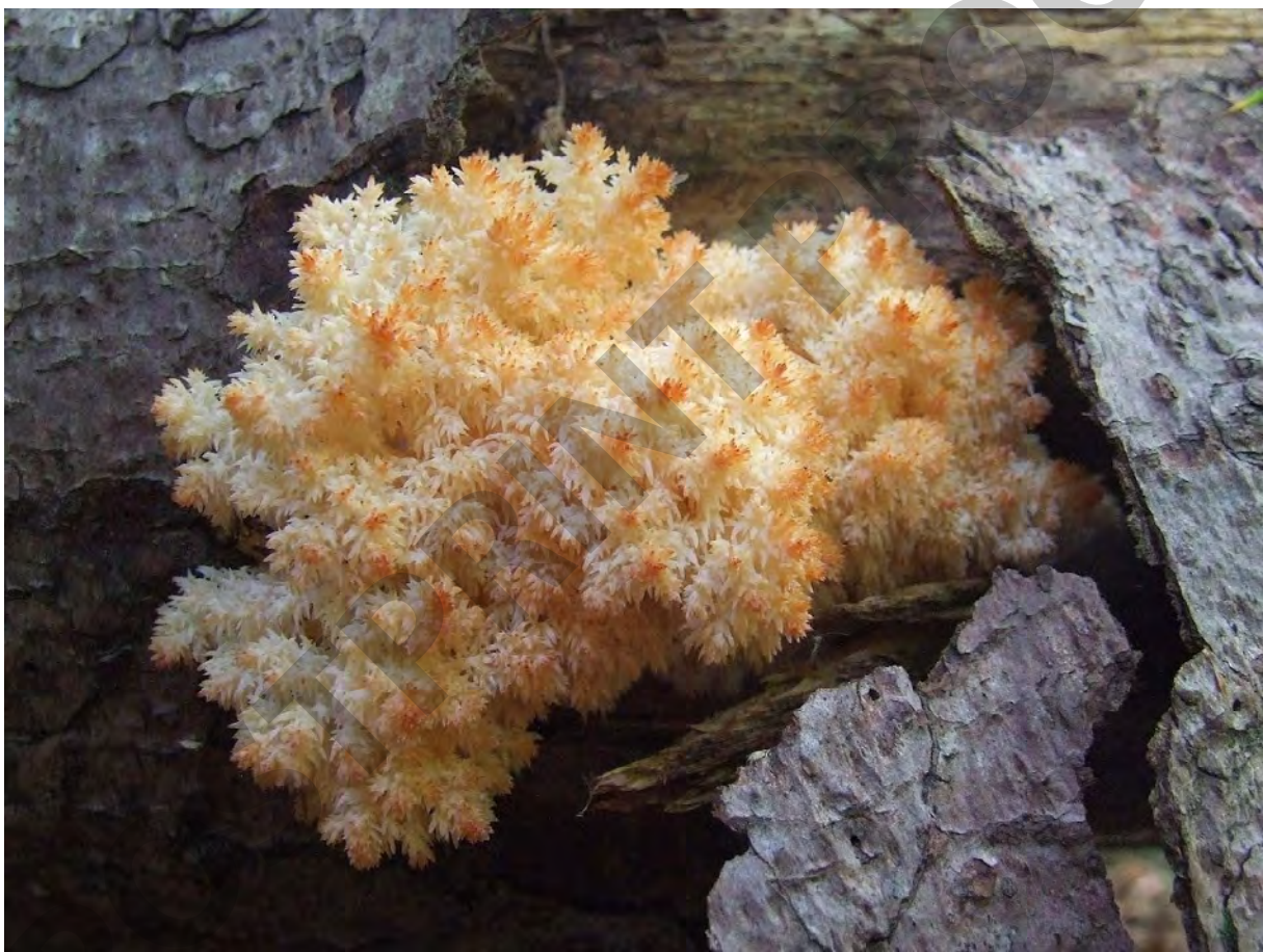
Fig. S23. Basidiomata of Hericium alpestre Pers. from the Bieszczady Mts (Aug 17, 2009).

*♦ Hericium coralloides (Scop.) Pers.; RL-V, PaP, I++, SSI(B); LR: [S6,S13] (as Dryodon coralloides (Scop.) Quél.), [S9] (as H. ramosum (Bull.) Letell.), [S1,S4,S5,S7,S104]. PP: Wetlina (Górna Solinka valley, N slope of Kamienna Łuka Mt), Bereżki (Kiczera), Ustrzyki Górne 2 km NE (N slope of Kiczera Mt), Wołosate 2.5 km E (Horbki), Wołosate 3.5 km E (Horbki); VIII-X; beech forest, fir-beech forest; Fagus trunks and logs. UP: Wołosate 1 km S, Zatwarnica 3 km S (Hriadnik), Ustrzyki Górne 1.5 km NW (by the tourist trail to Połonina Caryńska Mt), Rozsypaniec Mt 1 km SW, S from Wetlina (Borsuk pass), S from Wetlina (E slope of Jawornik Mt), NNE from Jaworzec (NE slope of Żołobina Mt), N from Dołżyca (Łopiennik Mt); VIII-IX; beech forest; Fagus log, Acer pseudoplatanus log.