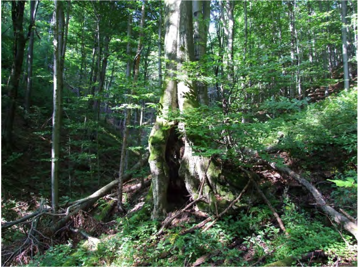
Fig. 2. Carpathian beech forest ( Dentario glandulosae-Fagetum ) on the slopes of the Otryt mountain range, Bieszczady Mts (Aug 16, 2009).