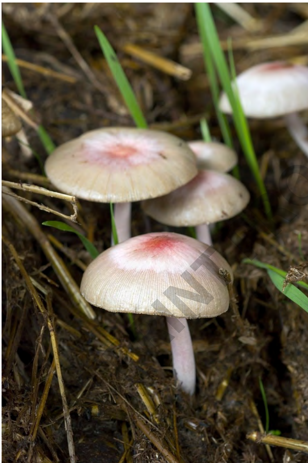
Fig. S10. Basidiomata of Bolbitius coprophilus (Peck) Hongo from the Bieszczady Mts (Jun 02, 2015).