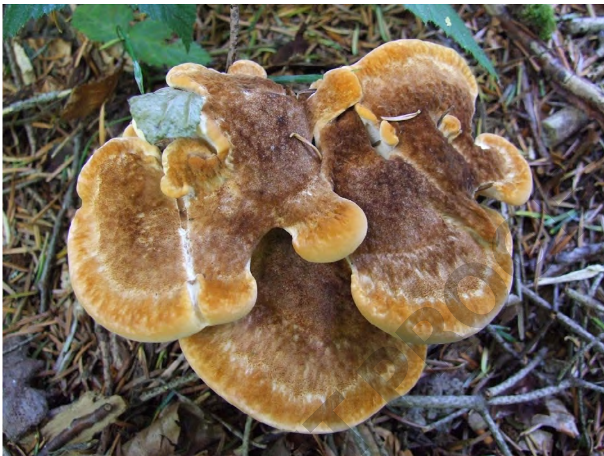
Fig. S11. Basidiomata of Bondarzewia mesenterica (Schaeff.) Kreisel from the Bieszczady Mts (Aug 17, 2009).

*♦ Bondarzewia mesenterica (Schaeff.) Kreisel (Fig. S11); RL-V, PaP; LR: [S5,S55] (as B. montana (Quél.) Singer), [S1,S4,S12,S69]. PP: Wetlina (Górna Solinka valley, N slope of Kamienna Łuka Mt); X; fir-beech forest; Abies trunk base. UP: S from Zatwarnica (Hylaty valley, Izwir), SW from Zatwarnica (Hulski valley), SW from Muczne (Jamniczna), Pszczeliny-Widełki 1.5 km W (SE slope of Magura Stuposiańska Mt), Sękowiec 3.5 km NNE (by the tourist trail near Hulskie NR), Dwerniczek 2 km N (S slope of Trohaniec Mt), Rabe 2.5 km NW (NE slope of Chryszczata Mt); VIII-IX; beech forest, fir-beech forest; Abies trunk base, Abies roots.