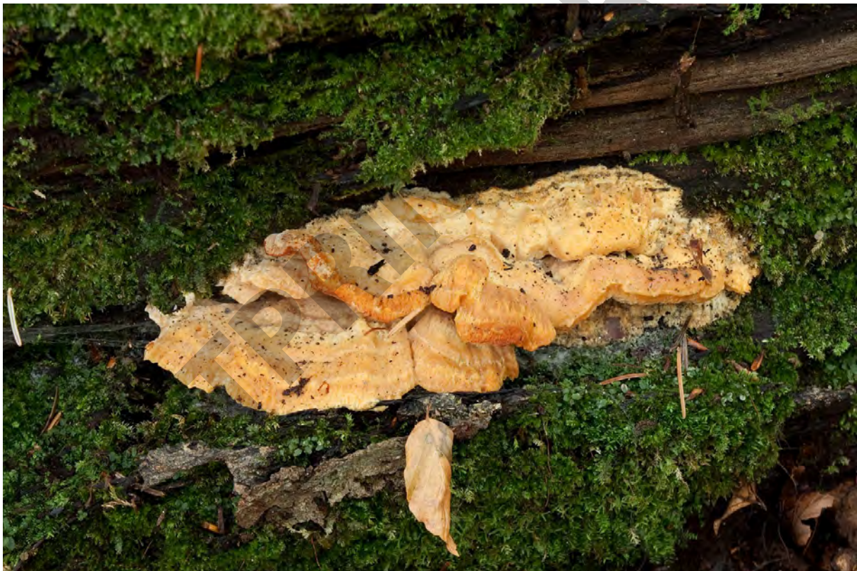
Fig. S8. Basidiomata of Antrodiella pallescens (Pilát) Niemelä & Miettinen from the Bieszczady Mts (Sep 07, 2011).

##* Antrodiella pallescens (Pilát) Niemelä & Miettinen (Fig. S8); UP: S from Zatwarnica (Hylaty valley, Izwir), Ustrzyki Górne 1.5 km NW (by the tourist trail to Połonina Caryńska Mt), Hnyła valley (by the tourist trail to Bukowska Pass), near Ustrzyki Górne (by the tourist trail to Wierch Mt); VIII-IX; beech forest; Fagus log, Fomes fomentarius basidiomata.