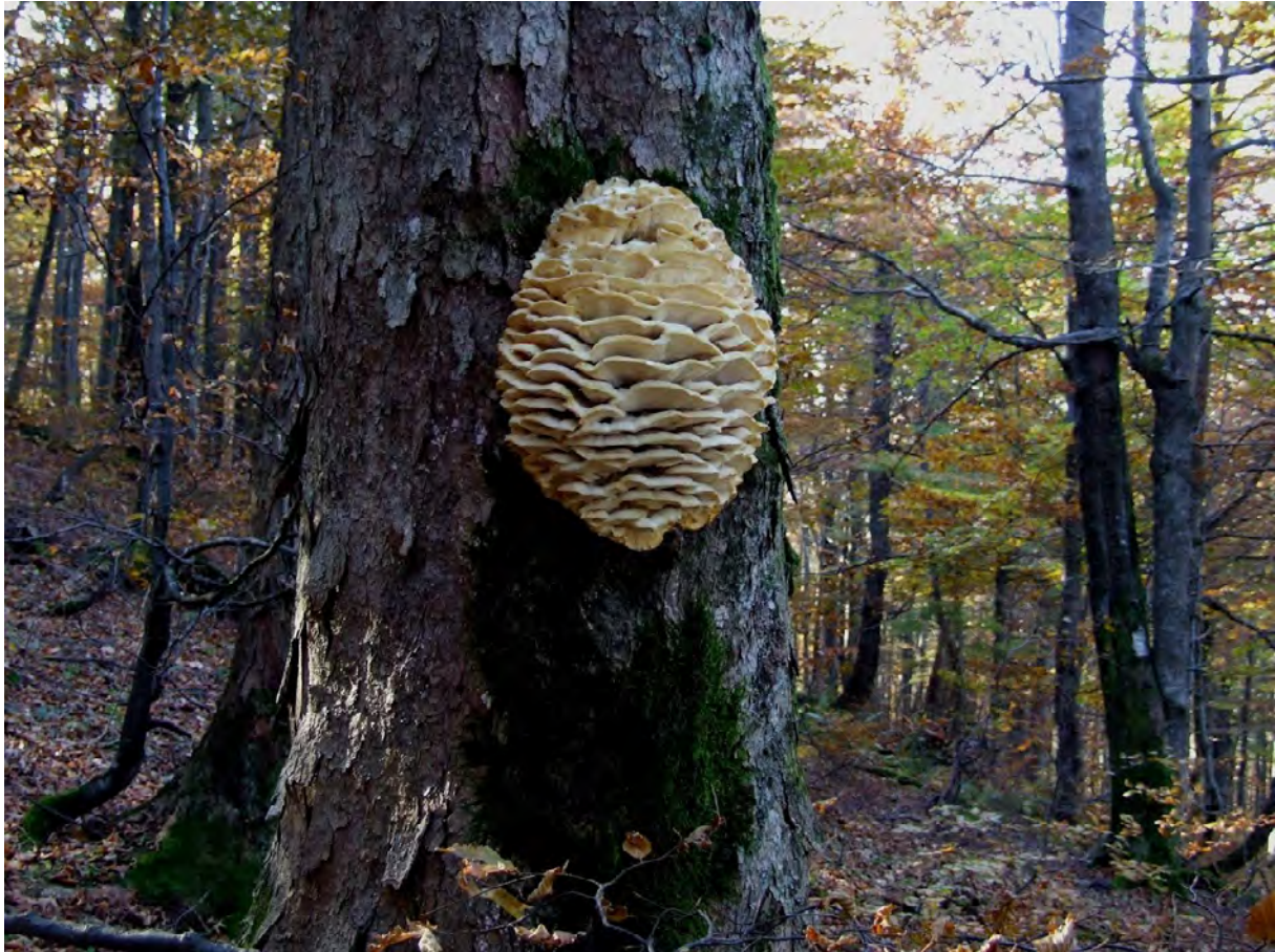
Fig. S14. Basidiomata of Climacodon septentrionalis (Fr.) P. Karst. from the Bieszczady Mts (Oct 07, 2010).

* Clitocybe agrestis Harmaja; RL-R ; LR : [S9] (as C. angustissima Lasch).