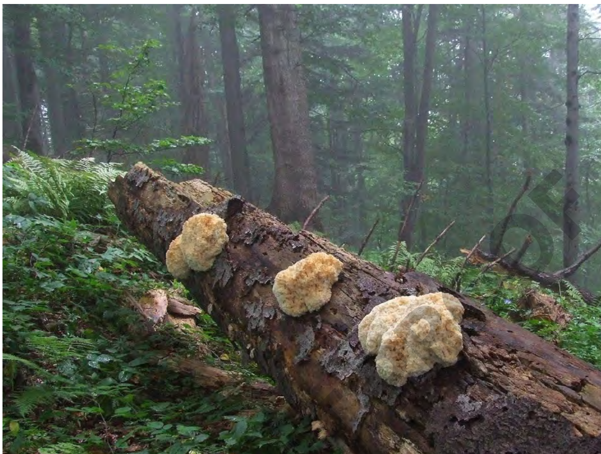
Fig. S24. Basidiomata of Hericium alpestre Pers. from the Bieszczady Mts (Sep 04, 2009).

*♦ Hericium erinaceum (Bull.) Pers.; RL-E, SP, I++; LR: [S4,S5,S155].