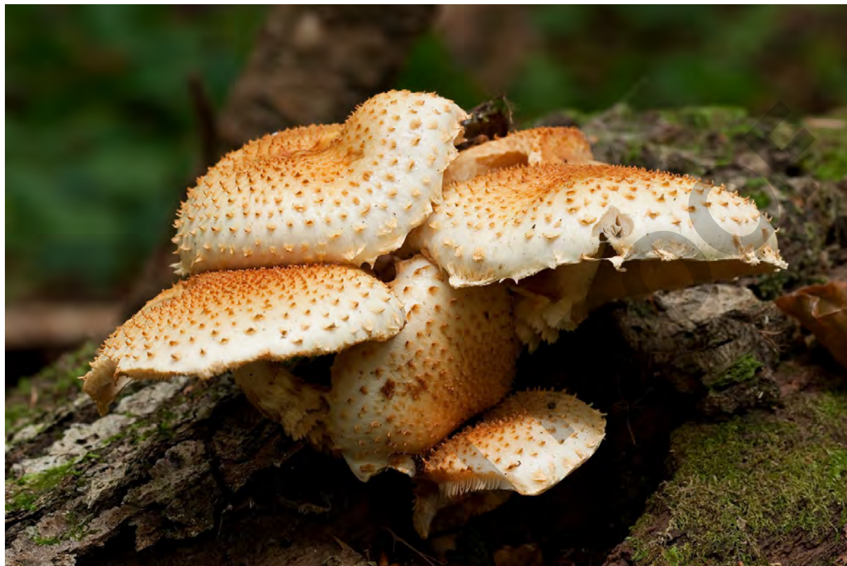
Fig. S40. Basidiomata of Pholiota squarrosoides (Peck) Sacc. from the Bieszczady Mts (Sep 07, 2011).

Moczarne), near Bereżki (NE slope of Kiczera Bereźczańska Mt), Pszczeliny-Widełki 1.5 km W (SE slope of Magura Stuposiańska Mt); VIII-X; beech forest, fir-beech forest; wood, Abies log, Fagus logs and trunk.