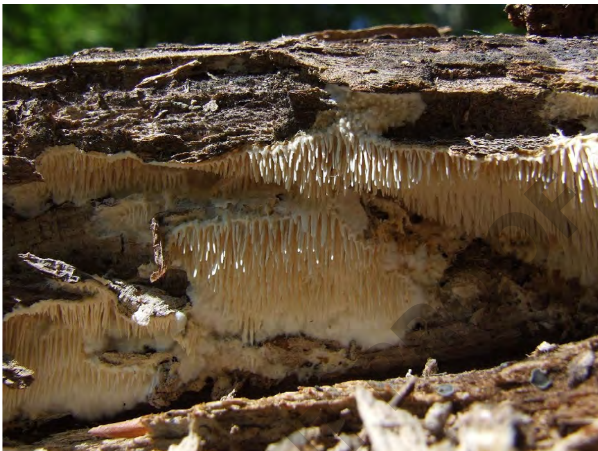
Fig. S20. Basidiomata of Dentipellis fragilis (Pers.) Donk from the Bieszczady Mts (Aug 20, 2009).

*♦ Echinoderma aspera (Pers.) Bon; LR: [S6,S13] (as Lepiota acutesquamosa (Weinm.) Gill.), [S1] (as L. aspera (Pers.) Quél.). UP: S from Zatwarnica (Hylaty valley); IX; beech forest; soil.