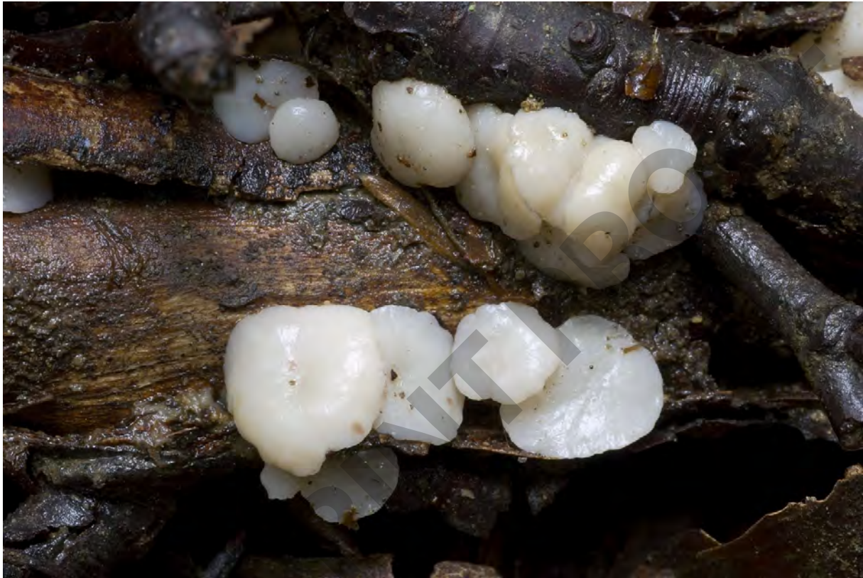
Fig. S2. Ascomata of Cudoniella tenuispora (Cooke & Masee) Dennis from the Bieszczady Mts (Jun 02, 2015).

spored, with non-amyloid pore, 70\text{--}110 \times 6\text{--}9 \mu\text{m} . Spores fusoid, non-septate, 11\text{--}15 \times 4.5\text{--}5.5 \mu\text{m} . Paraphyses slender, non-septate or sparsely septate, up to 2.5 \mu\text{m} broad. Croziers present. Ectal excipulum of textura intricata . Specimens seen: 02.06.2010, leg. T. Pachlewski, det. A. Kujawa, fungarium no. BdPN-01355; 31.05.2010, leg. T. Pachlewski, det. A. Kujawa, fungarium no. BdPN-01374.