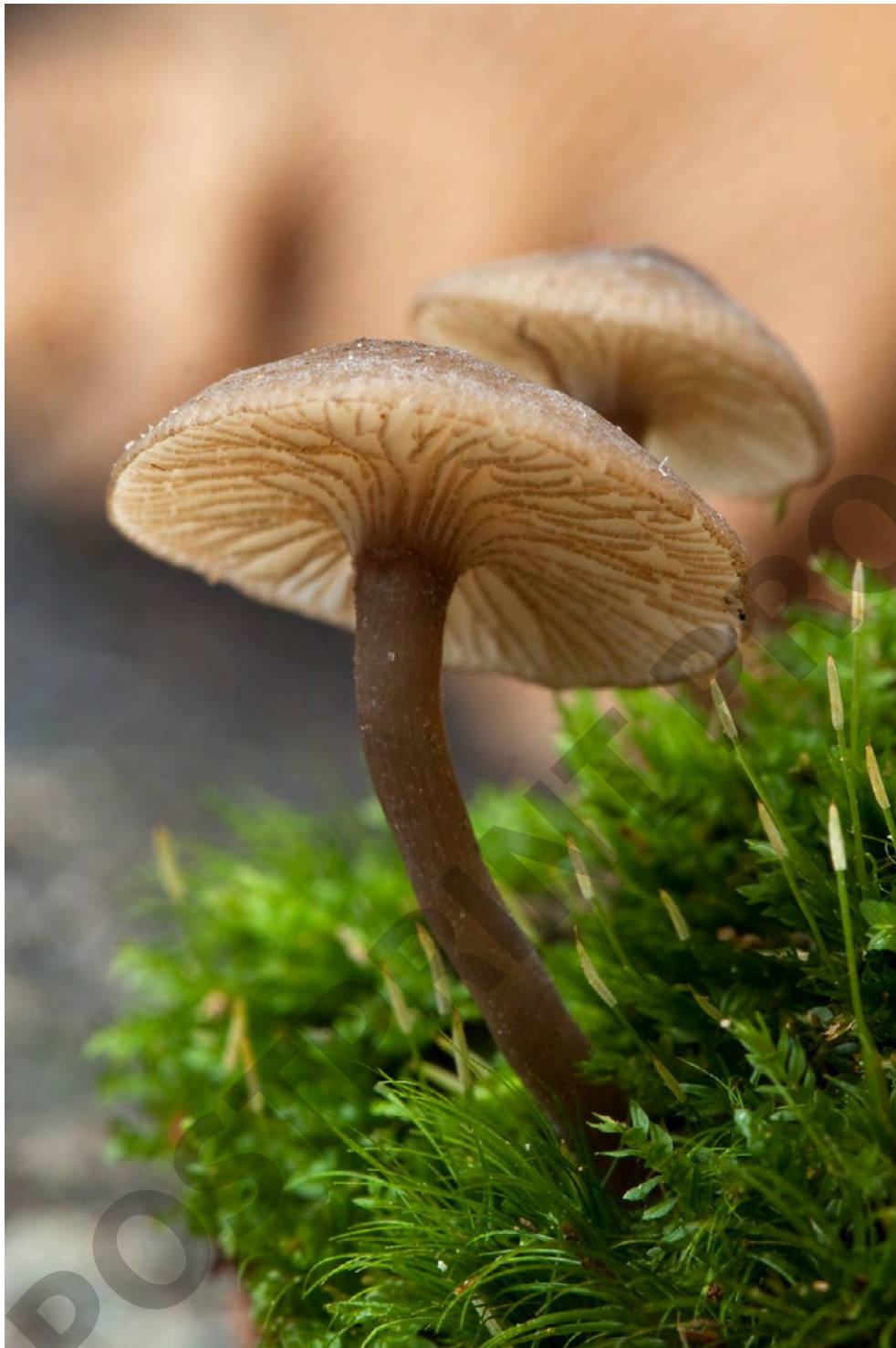
Fig. S26. Basidiomata of Hydropus marginellus (Pers.) Singer from the Bieszczady Mts (Aug 01,2018).

*♦ Hydropus marginellus (Pers.) Singer (Fig. S26); RL-E; LR: [S1,S4]. PP: Nasiczne (Izwir), Beniowa (Szczob); VII-VIII; beech forest; Fagus log. UP: Cisna 3 km S (by the