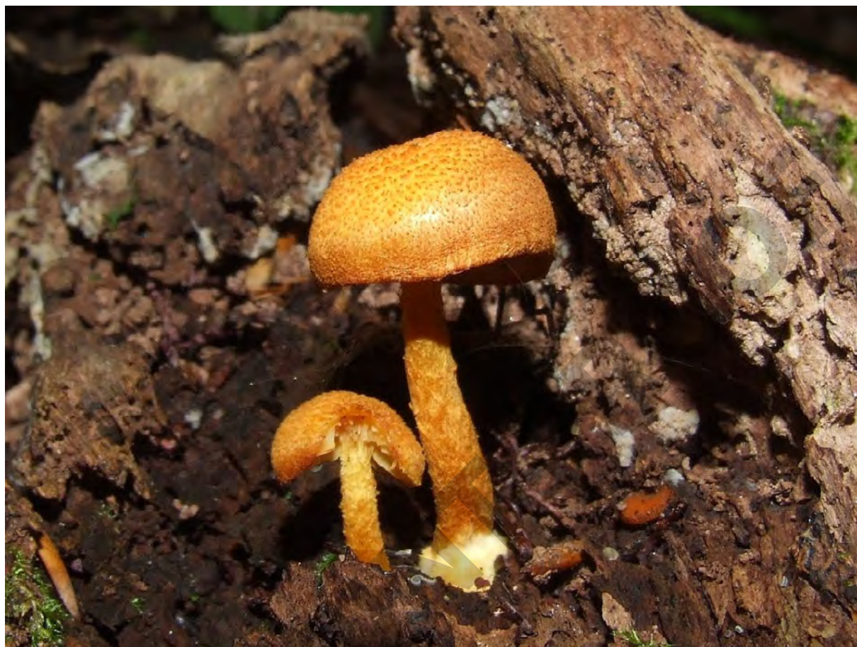
Fig. S21. Basidiomata of Flammulaster limulatus (Fr.) Watling var. limulatus from the Bieszczady Mts (Aug 21, 2009).

Przysłup 2 km SW, Wołosate 1 km S, Rozsypaniec Mt 1 km SW; VII-IX; beech forest; Fagus log.