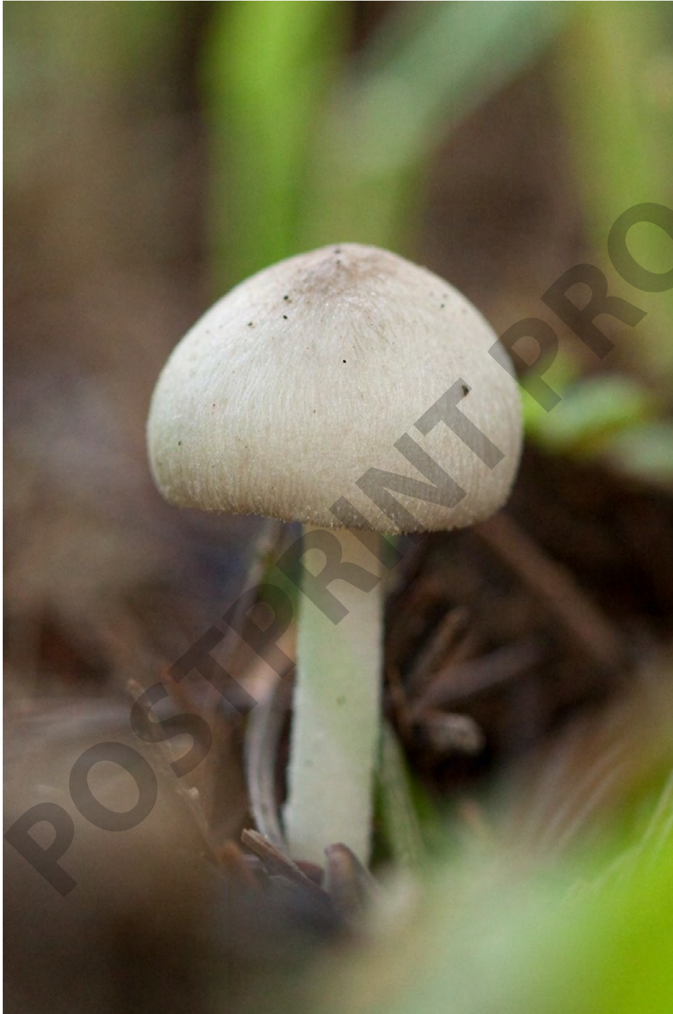
Fig. S52. Basidioma of Volvariella pusilla (Pers.) Singer from the Bieszczady Mts (Aug 02, 2011).

#*♦ Volvariella gloiocephala (DC.) Boekhout & Enderle; PP: Tarnawa (horse stud); VI; horse stud site; soil.