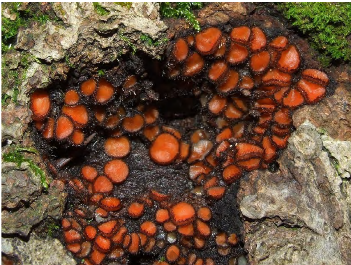
Fig. S5. Ascomata of Scutellinia heterosculpturata Kullman & Raitv. from the Bieszczady Mts (Oct 05, 2010).

* Scutellinia kerguelensis (Berk.) Kuntze; LR: [S5] (as S. nympharum (Vel.)), [S1] (as S. kerguelensis (Berk.) Kuntze). PP: Tworylczyk valley; VI; beech forest; soil. UP: between Muczne and Tarnawa (769 m asl pass); VIII; roadside; soil.