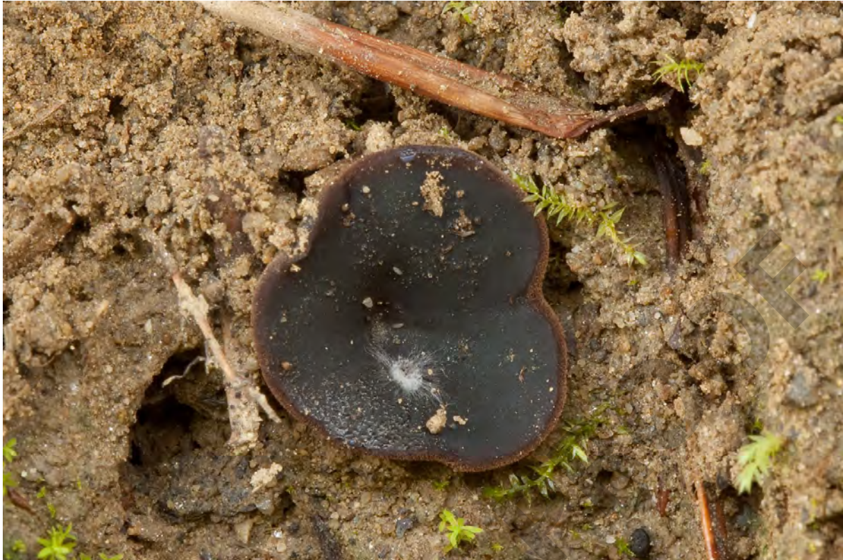
Fig. S4. Ascoma of Peziza saniosa Schrad. ex J.F. Gmel. from the Bieszczady Mts (Aug 06, 2011).

* Pezizella eburnea (Roberge) Dennis; LR: [S9] (as Peziza eburnea (Rob.) Dennis). Notes: In Poland known only from the Bieszczady Mts.