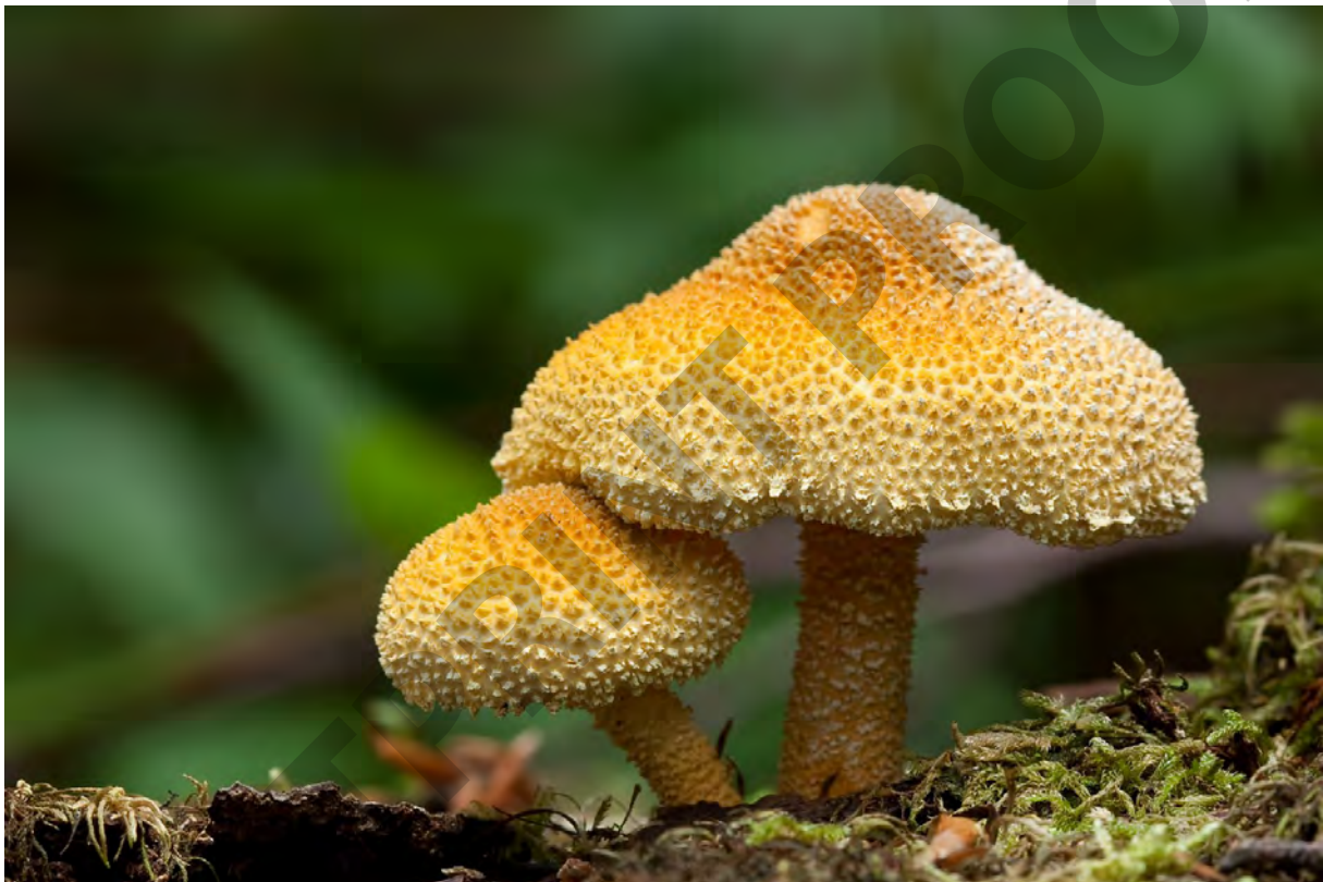
Fig. S18. Basidiomata of Cystoderma carpaticum M.M. Moser in the Bieszczady Mts (Sep 07, 2011).

*♦ Cystoderma carpaticum M.M. Moser ( Fig. S18 ); LR: [S4,S128,S129]. Notes: In Poland known only from the Bieszczady Mts. Locus classicus in Bieszczady NP.