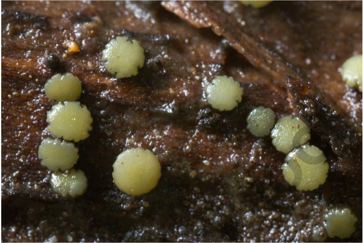
Fig. 15. Ascomata of Vibrissea decolorans (Saut.) A. Sánchez & Korf (Jun 03, 2010).