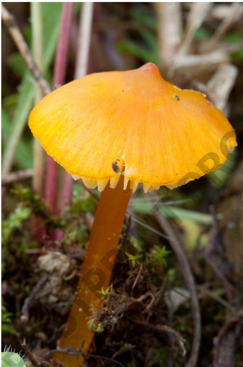
Fig. S27. Basidioma of Hygrocybe acutoconica (Clem.) Singer from the Bieszczady Mts (Aug 02, 2011).