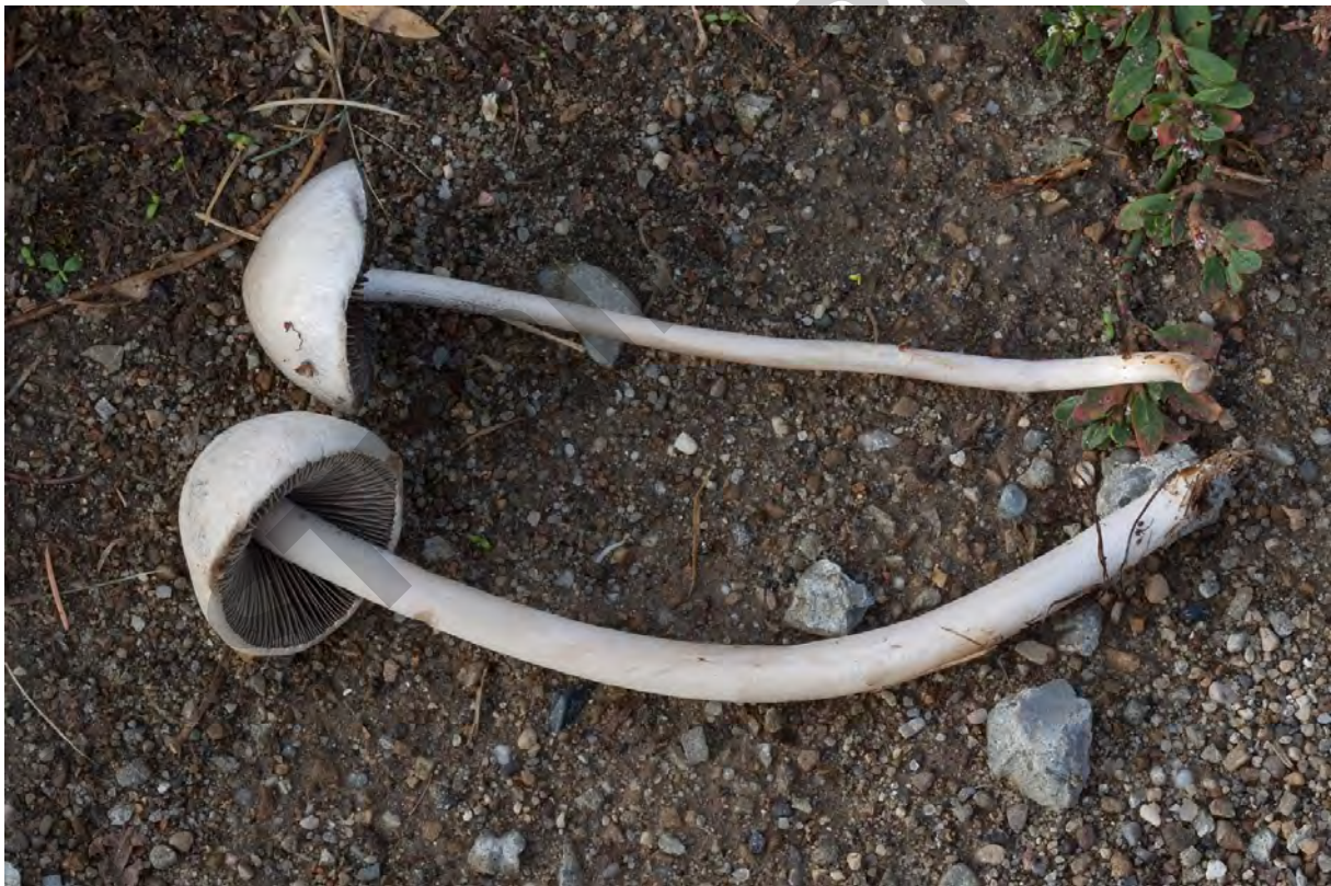
Fig. S37. Basidiomata of Panaeolus antillarum (Fr.) Dennis from the Bieszczady Mts (Sep 09, 2011).

##* Panaeolus antillarum (Fr.) Dennis (Fig. S37); NChL; PP: Wołosate (horse stud); VI-IX; horse stud site; manure, Equus caballus dung. Notes: In Poland also known from Wigry NP [S212].