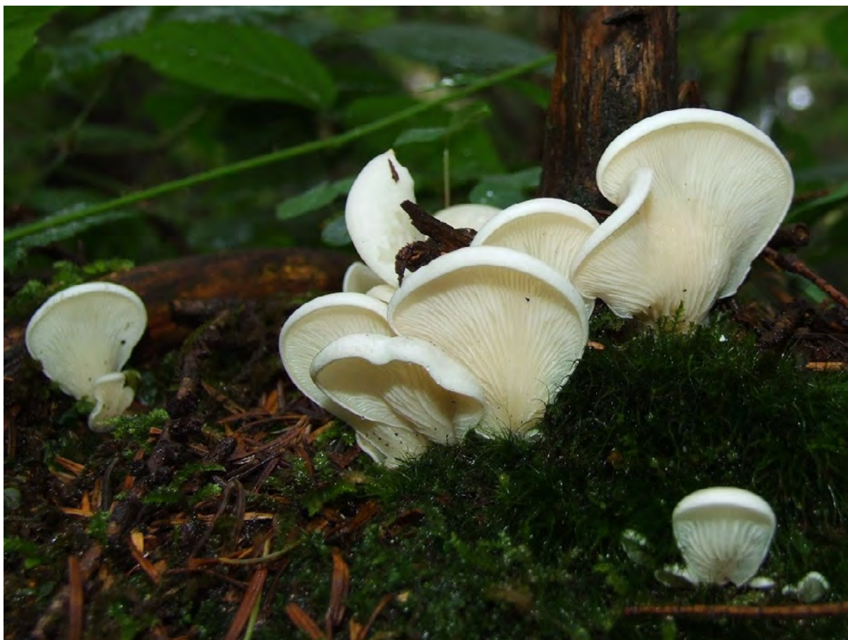
Fig. S41. Basidiomata of Pleurocybella porrigens (Pers.) Singer from the Bieszczady Mts (Sep 05, 2009).

*♦ Pleurotus cornucopiae (Paulet) Rolland; RL-V, SSI(C); LR: [S5].