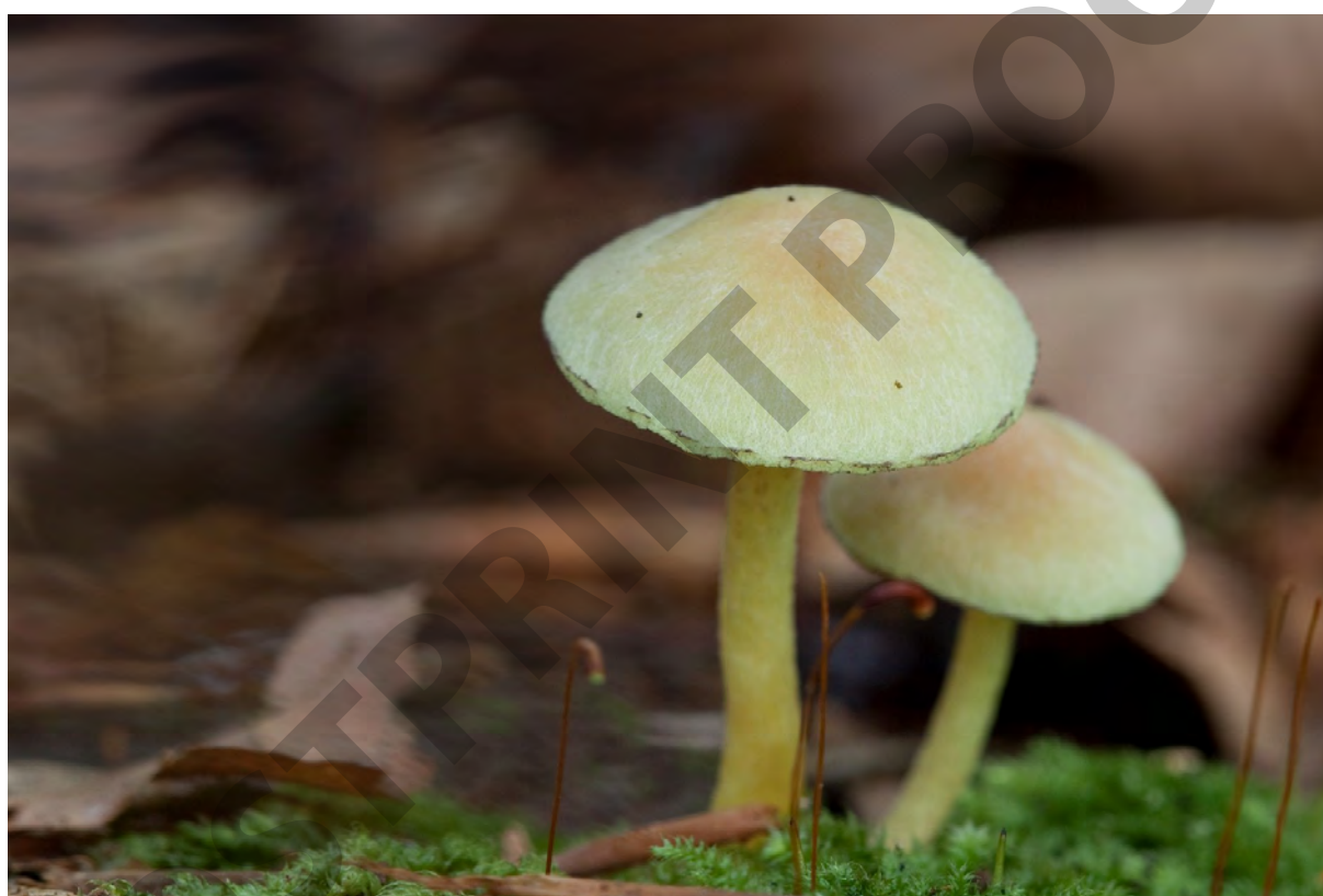
Fig. S29. Basidiomata of Hypholoma fasciculare (Huds.) P. Kumm. var. subviride (Berk. & M.A. Curtis) Krieglst. from the Bieszczady Mts (Sep 03, 2011).

Łocentyków), Wetlina (Górna Solinka valley, near mouth of Beskidnik stream), NE slope of Wielka Rawka Mt (Dołhe Pole), Wołosate 3.5 km E (Horbki); VI, VIII; beech forest, mixed forest; Fagus log, wood. UP: Dwerniczek 1.5 km N, Czarna 5 km S, Nasiczne, near Pszczeliny (2 km S from Widelki forester's lodge), Ustrzyki Górne 3 km W (by the tourist trail to Wielka Rawka Mt), Stuposiany 2 km SW (S slope of Prypiczek Mt), Near Bereżki (NE slope of Kiczera Bereżecka Mt), Pszczeliny 0.5 km W (SE slope of Magura Stuposiańska Mt), Pszczeliny-Widelki 0.5 km W (SE slope of Magura Stuposiańska Mt), Muczne 2 km SW (Jamniczna), Bereżki 1 km W; VI-IX; beech forest, fir-beech forest, parking place; wood remains, Fagus trunk and branches.