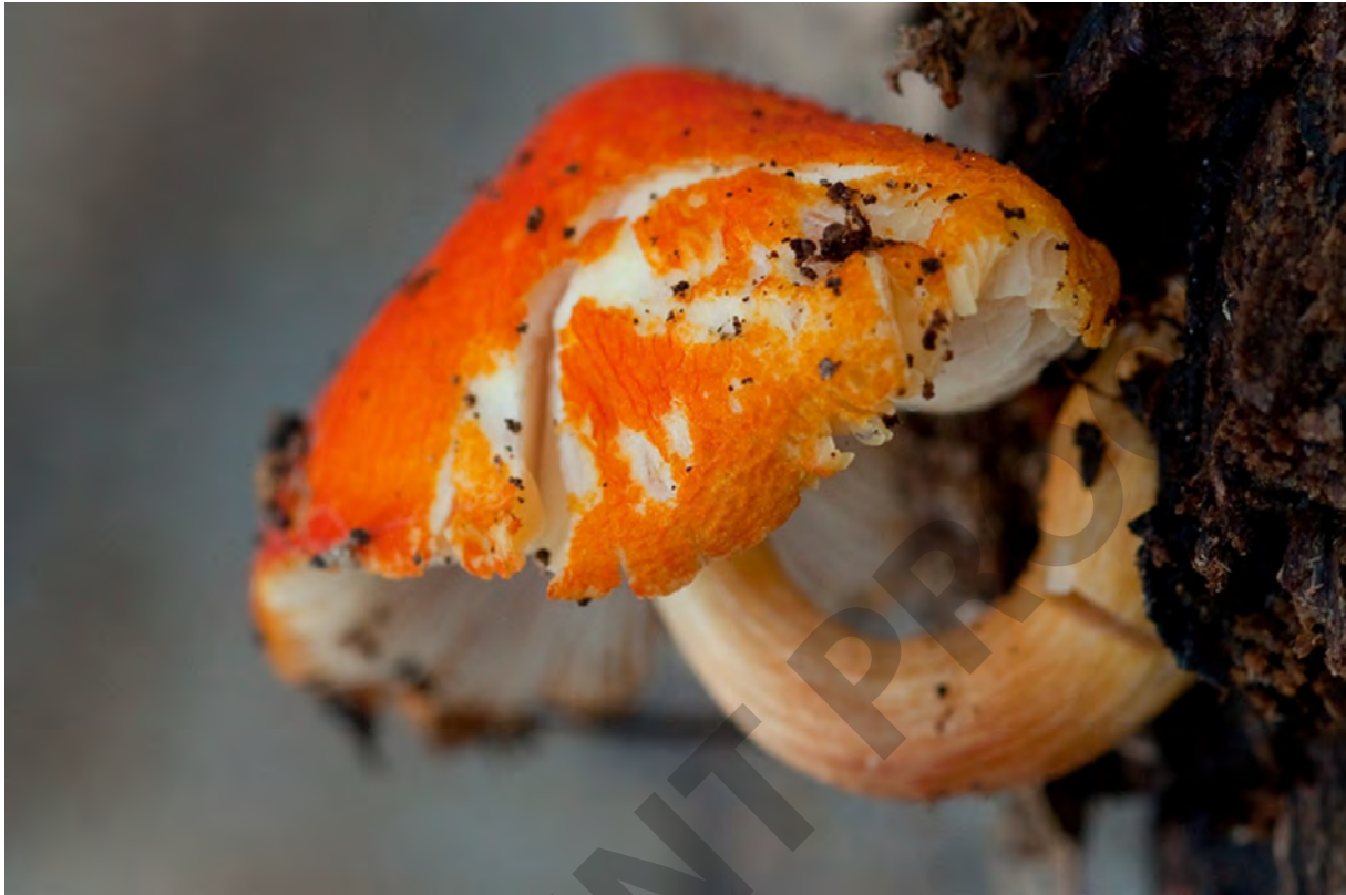
Fig. S42. Basidioma of Pluteus aurantiorugosus (Trog) Sacc. from the Bieszczady Mts (Aug 06, 2011).

* Pluteus aurantiorugosus (Trog) Sacc. (Fig. S42); RL-E; LR: [S11]. UP: Hulskie NR boarders; VIII; beech forest; Fagus wood.