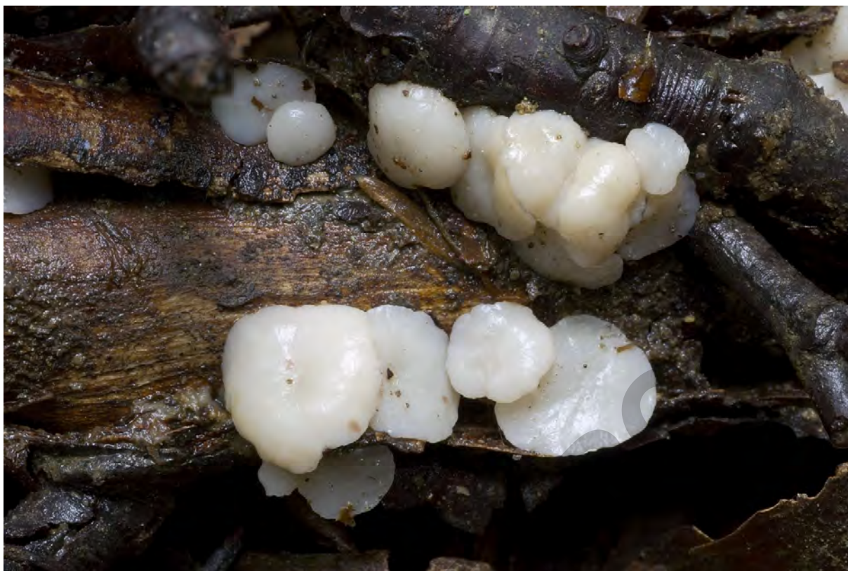
Fig. 10. Ascomata of Cudoniella tenuispora (Cooke & Masee) Dennis from the Bieszczady Mts (Jun 02, 2015).