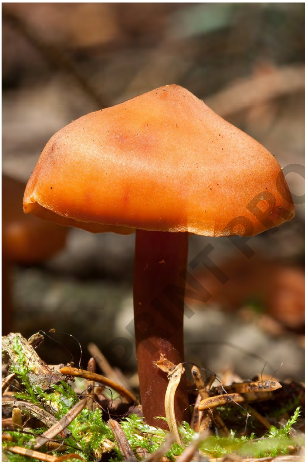
Fig. 13. Basidioma of Phaeocollybia jennyae (P. Karst.) Romagn. from the Bieszczady Mts (Aug 02, 2011).