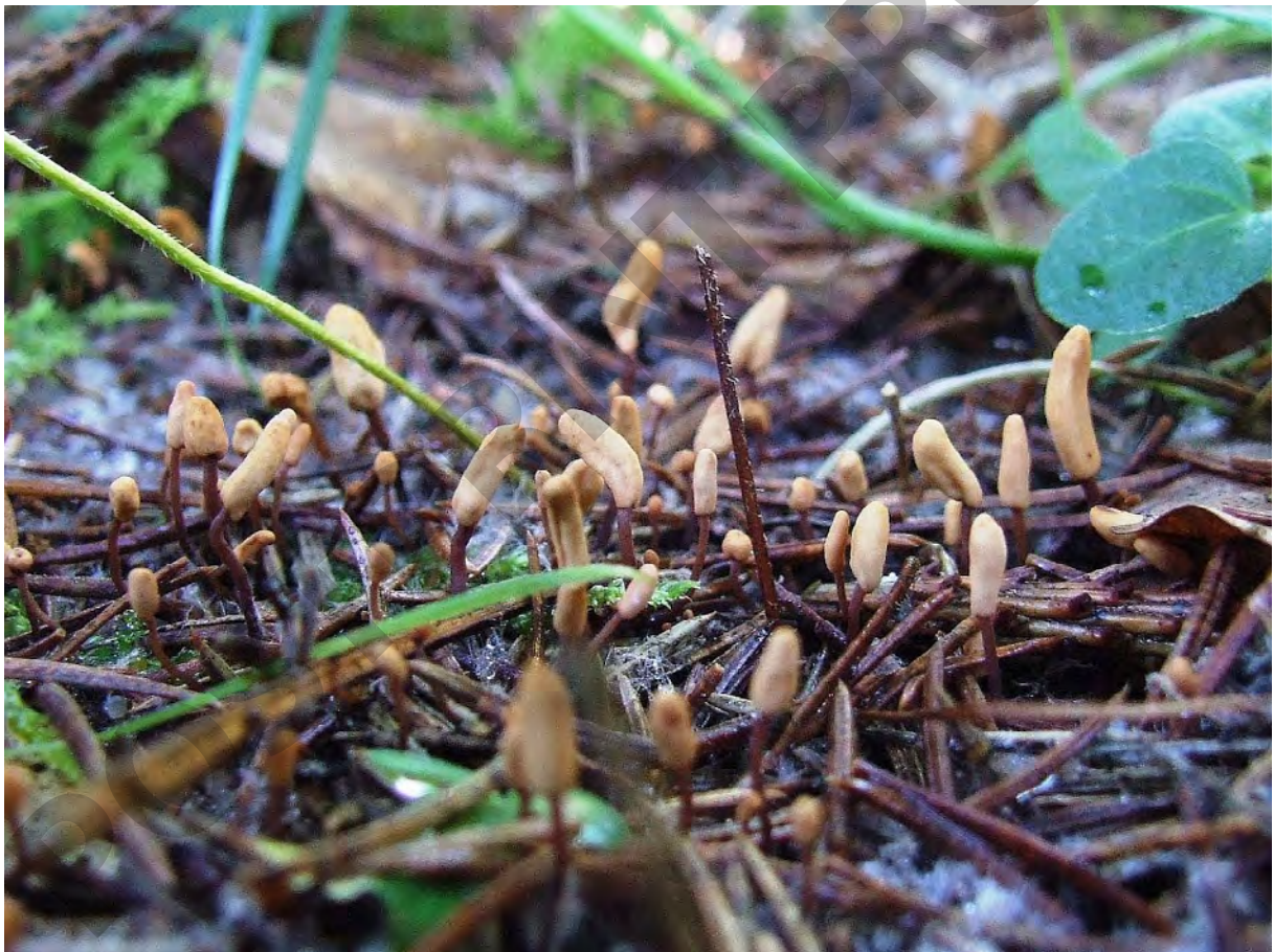
Fig. S3. Ascomata of Heyderia abietis (Fr.) Weinm. from the Bieszczady Mts (Oct 04, 2010).

#* Helvella stevensii Peck; PP: vicinity of Muczne (Jamniczna); VIII; fir-beech forest; soil. Notes: In Poland also known from Iński LP [S27,S28].