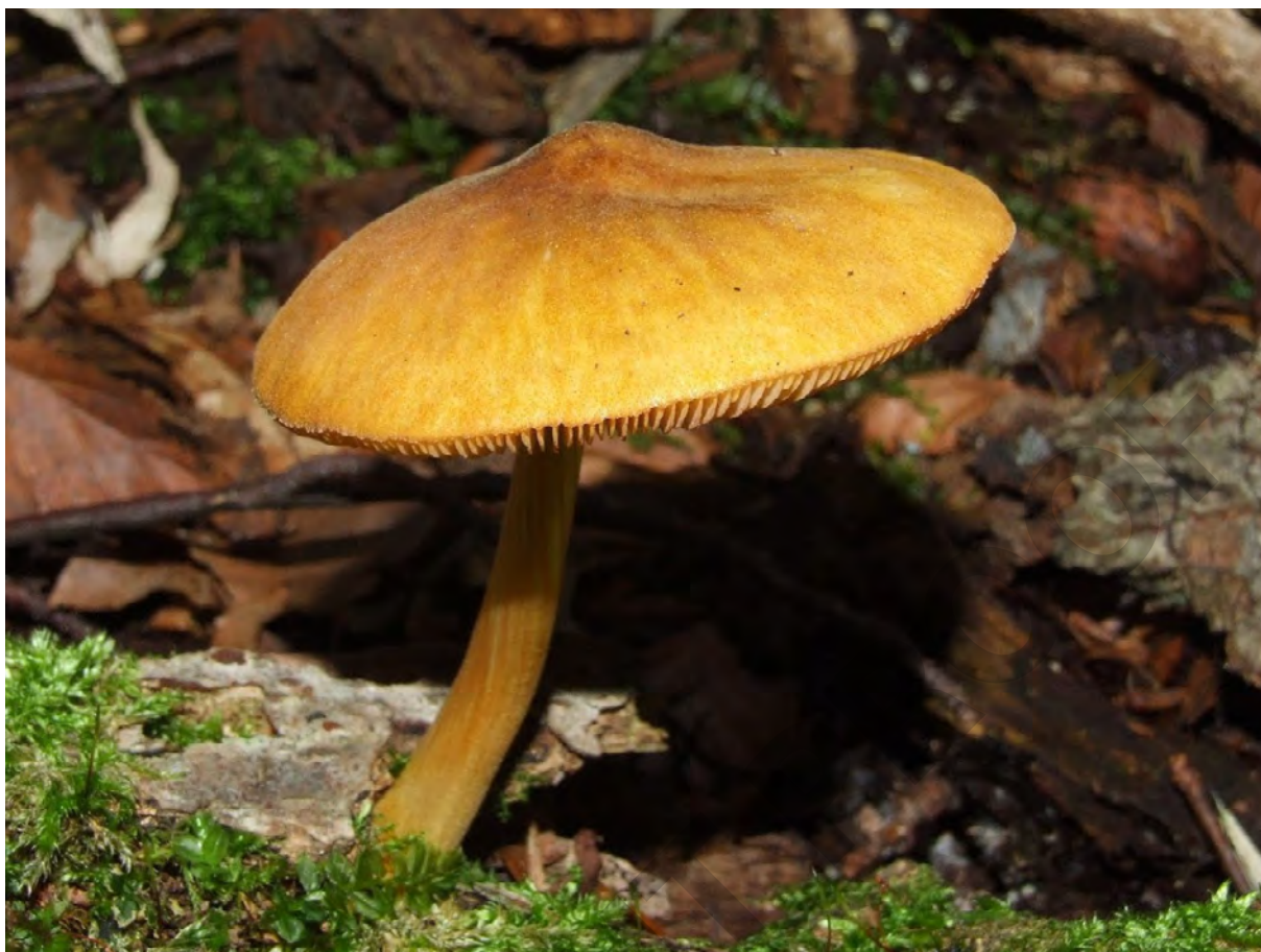
Fig. S43. Basidioma of Pluteus leoninus (Schaeff.) P. Kumm. from the Bieszczady Mts (Aug 19, 2009).

*♦ Pluteus luctuosus Boud.; LR: [S1]. PP: Wołosate 3.5 km E (Horbki); VIII; beech forest; Fagus log. UP: Wetlina (Górna Solinka valley), Zatwarnica 2 km S (Hylaty valley); VIII, X; beech forest; wood.