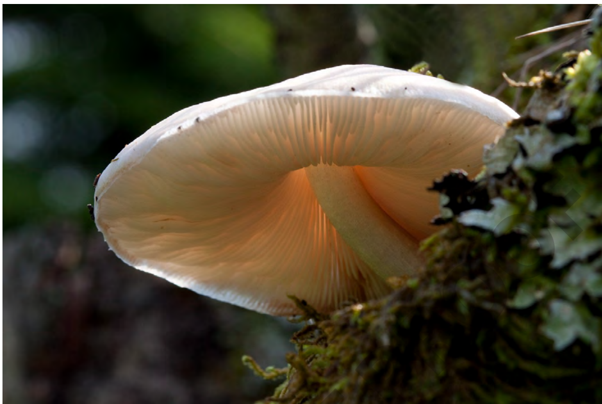
Fig. S45. Basidioma of Pluteus pellitus (Pers.) P. Kumm. from the Bieszczady Mts (Aug 02, 2011).

*♦ Pluteus petasatus (Fr.) Gillet; RL-R, SSI(B); LR: [S1]. UP: “Schron nad Negrylowem” shelter 2 km S; VII; willow-alder shrubs; wood.