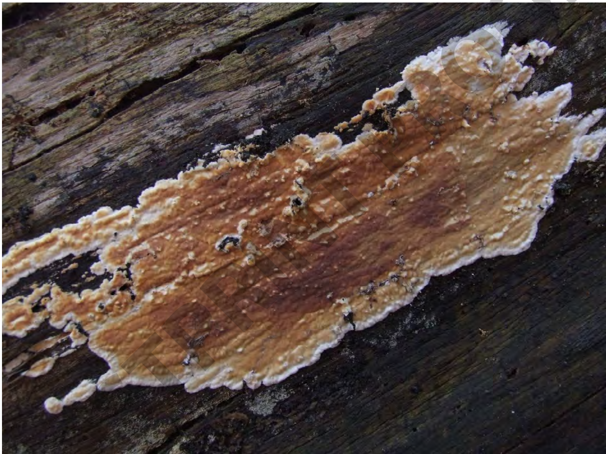
Fig. S19. Basidiomata of Dacryobolus karstenii (Bres.) Oberw. ex Parmasto from the Bieszczady Mts (Oct 09, 2010).

[S1,S12]. PP: Suche Rzeki, Ustrzyki Górne (near parking place at the base of Wielka Rawka Mt), Ustrzyki Górne 2 km SW (Wierch Mt), Ustrzyki Górne 3.5 km SW (Czuryłowo), Wołosate 3.5 km E (Horbki), near Beniowa (Górny San valley nature trail); VI-VIII; roadside, beech forest, spruce forest, mixed forest, Alnetum incanae ; Alnus incana trunk, Salix caprea branch. UP: Sękowiec 1.8 km N, Lutowiska (Jewish cemetery), Pszczeliny-Widełki 1.5 km W (SE slope of Magura Stuposiańska Mt); VIII; deciduous forest, tree clump; deciduous branch, Crataegus monogyna branch. Notes: In paper [S1] the names used by Domański et al. [S6] are incorrectly cited.