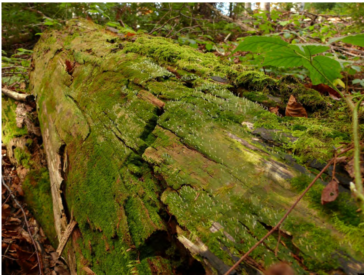
Fig. S33. Basidiomata of the Multiclavula mucida (Pers.) R.H. Petersen from the Bieszczady Mts (Oct 29, 2011).

* Mycena adonis (Bull.) Gray var. coccinea (Sowerby) Kühner; LR: [S6] (as M. rubella Quél.). Notes: In Poland also known from historical locality in the vicinity of Miedzyrzec Podlaski [S204].