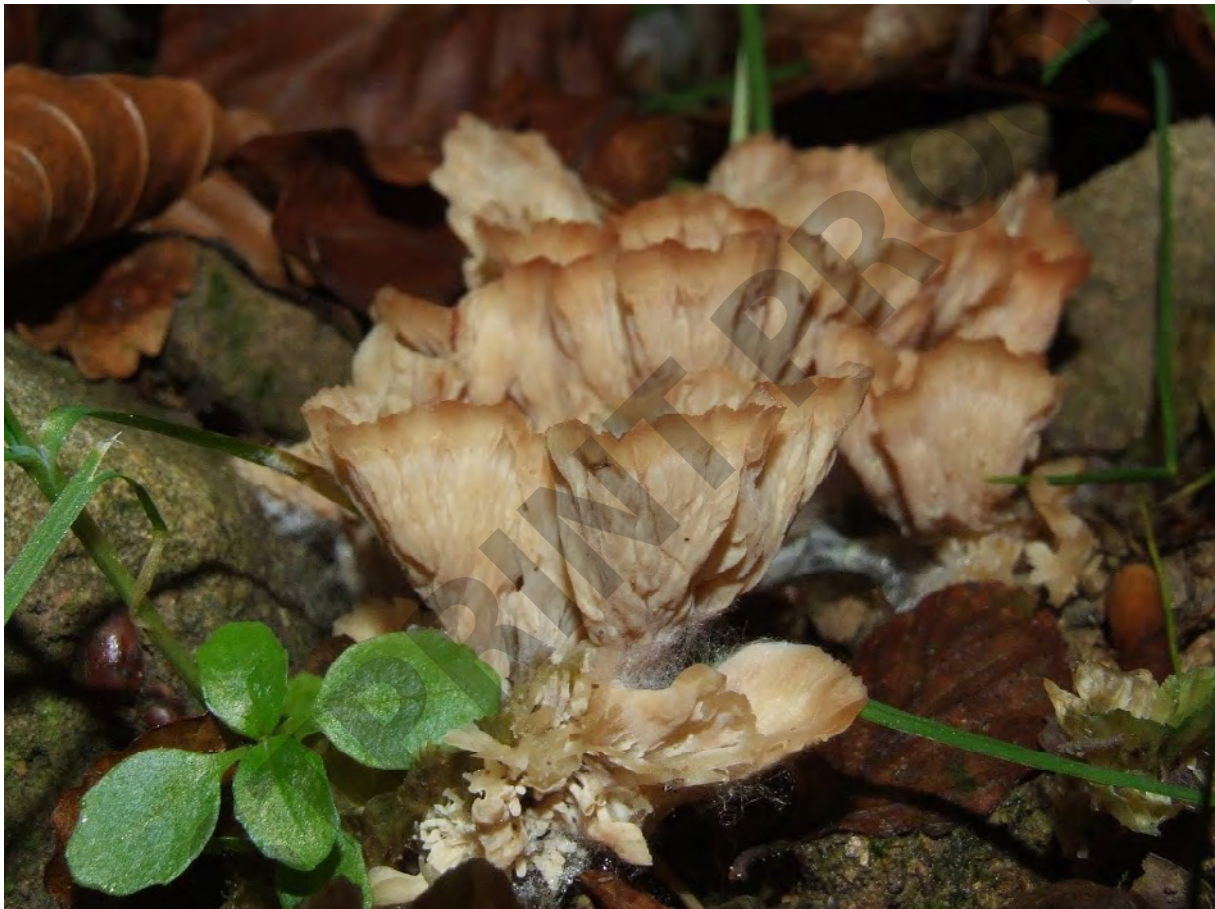
Fig. S17. Basidiomata of Cotylidia pannosa (Sowerby) D.A. Reid from the Bieszczady Mts (Oct 05, 2010).

#*♦ Cotylidia pannosa (Sowerby) D.A. Reid (Fig. S17); RL-E; UP: Wetlina, Dwerniczek 2 km N, Pszczeliny-Widelki 1.5 km W (SE slope of Magura Stuposiańska Mt), NE slope of Wielka Rawka Mt; VIII-X; beech forest, fir-beech forest; soil.