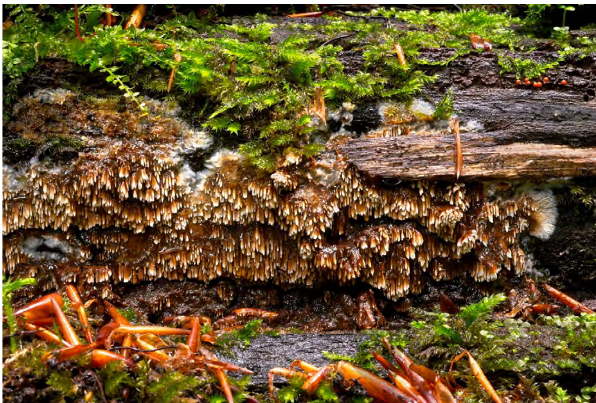
Fig. S34. Basidiomata of Mycoacia nothofagi (G. Cunn.) Ryvarden from the Bieszczady Mts (Jun 25, 2009).

#* Naucoria bohemica Velen.; UP: Muczne 1 km SW (NE slope of Bukowe Berdo Mt); VIII; mixed shrubs; soil.