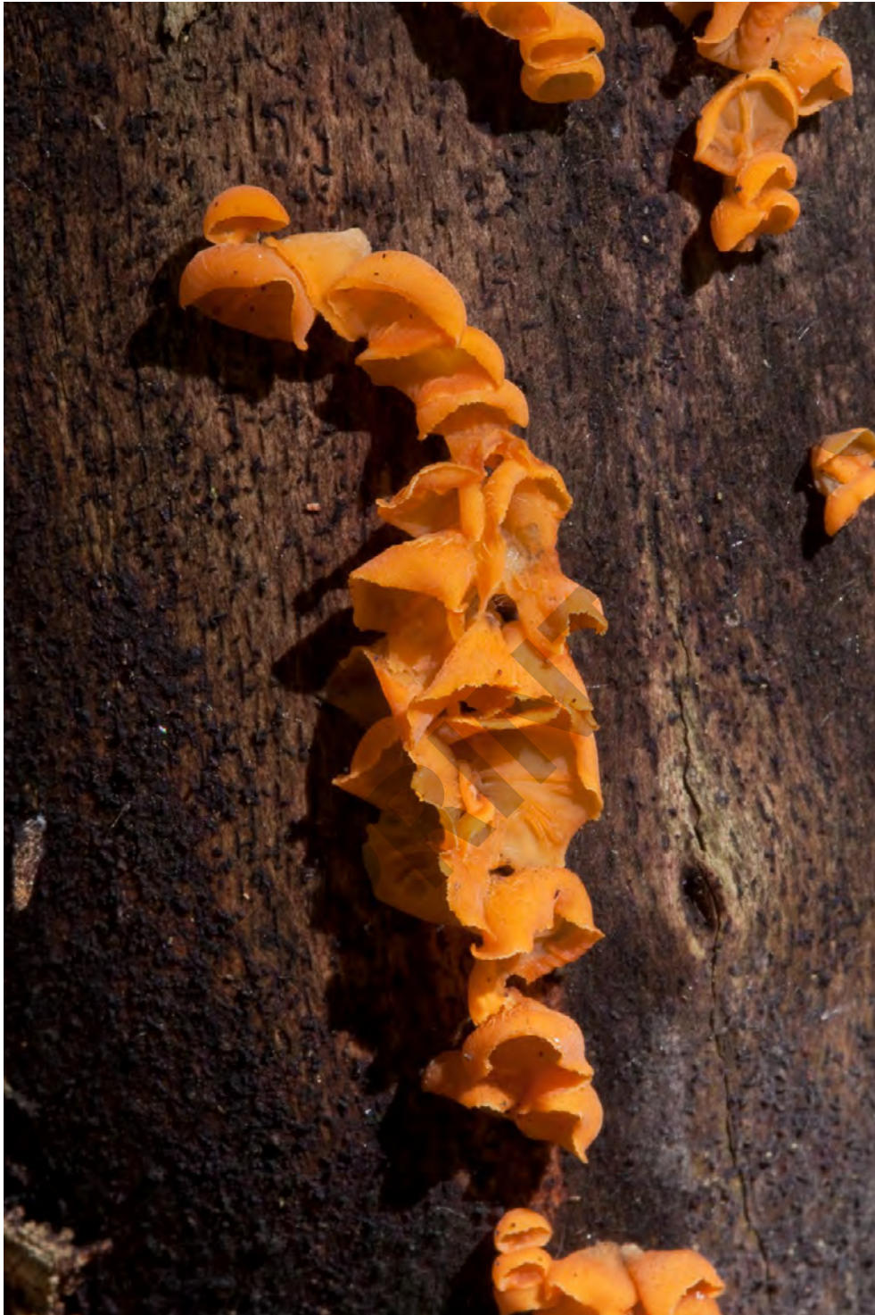
Fig. S22. Basidiomata of Guepiniopsis buccina (Pers.) L.L. Kenn. from the Bieszczady Mts (Sep 07, 2011). Photography by K. Kujawa.

Stuposiańska Mt), Bereżki 2 km NW, Cisna; VIII-IX; beech forest, fir-beech forest; Corylus branch, Fagus branch.