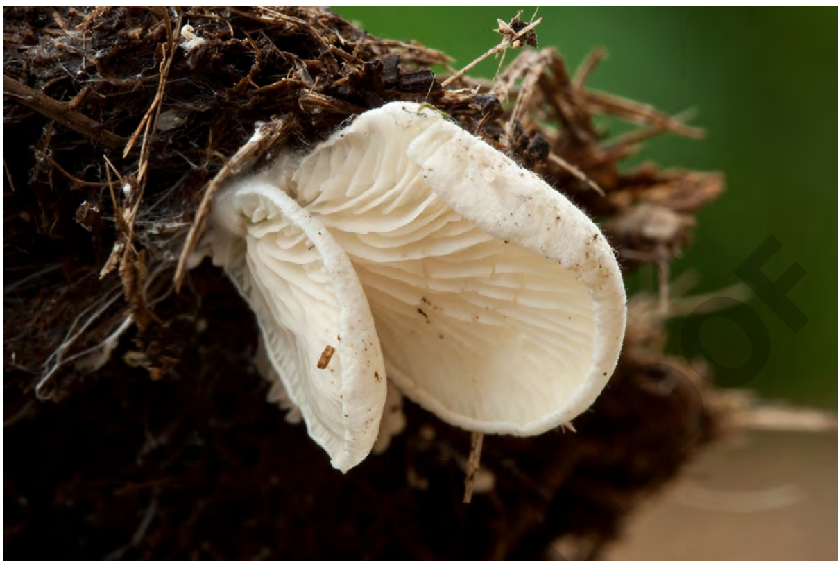
Fig. 9. Basidiomata of Clitopilus passeckerianus (Pilát) Singer from the Bieszczady Mts (Aug 01, 2011).