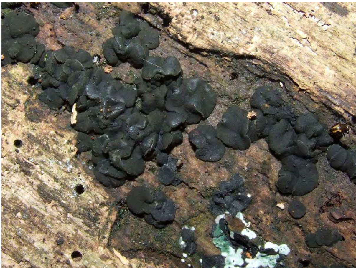
Fig. 8. Ascomata of Bulgariella pulla (Fr.) P. Karst. from the Bieszczady Mts (Aug 08, 2009).