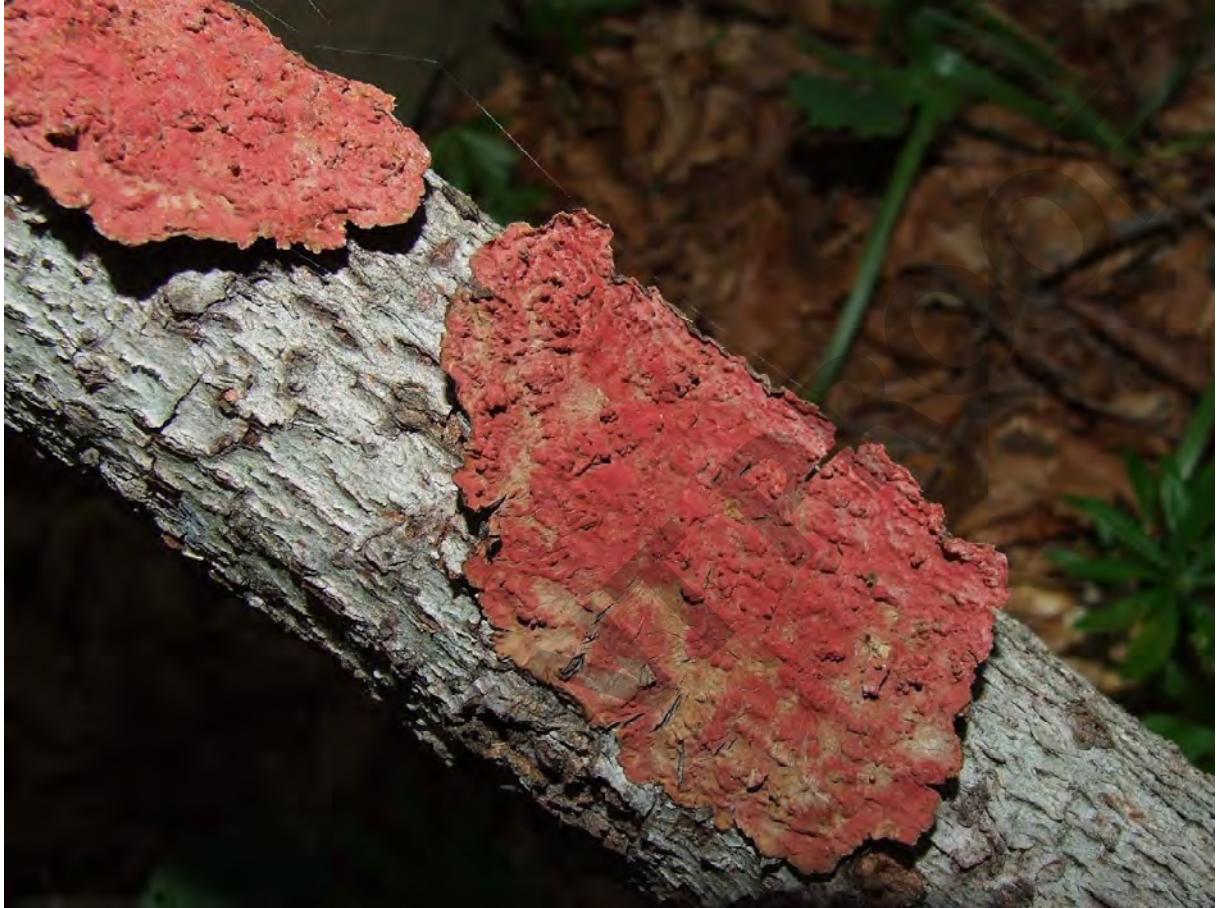
Fig. S28. Basidiomata of Hymenochaete cruenta (Pers.) Donk from the Bieszczady Mts (Sep 02, 2009).

*♦ Hymenochaete cruenta (Pers.) Donk (Fig. S28); RL-V; LR: [S7,S9] (as H. mougeotii (Fr.) Masee), [S4,S55,S166]. PP: SW from Zatwarnica (Hulski valley, SE slope of Błyszczowy Berek), Wetlina (Górna Solinka valley, Chyżyszcze); VI; fir-beech forest, beech forest; Abies branch. UP: N from Dołżyca (Łopiennik Mt); IX; beech forest; Abies branch.