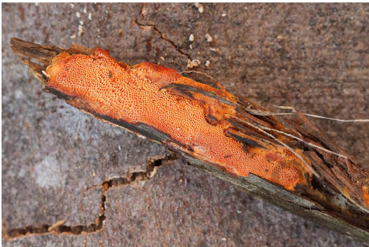
Fig. 7. Basidiomata of Auriporia aurulenta A. David, Tortič & Jelič from the Bieszczady Mts (Sep 05, 2011).