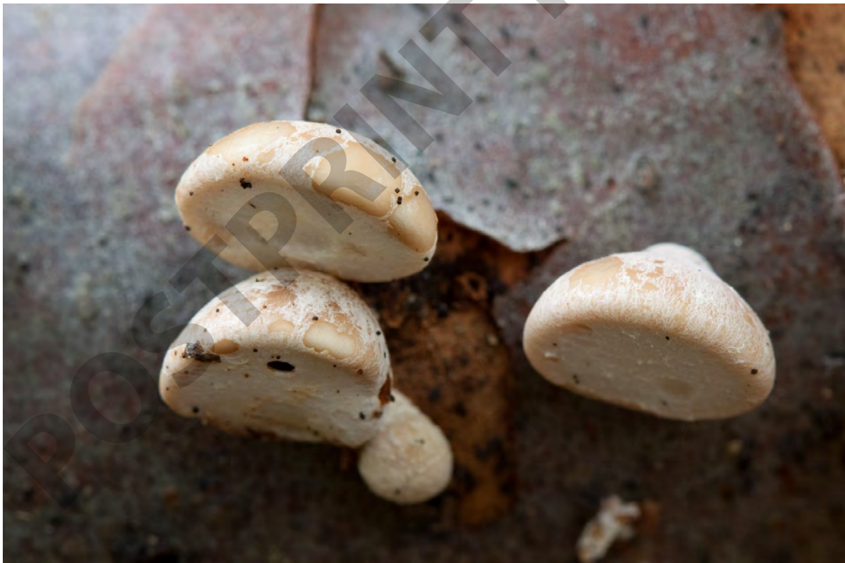
Fig. S49. Basidiomata of Tectella patellaris (Fr.) Murrill in the Bieszczady Mts (Sep 07, 2011).

* Tectella patellaris (Fr.) Murrill (Fig. S49); LR: [S246]. UP: 2 km SW from Wyżniańska Pass (by the tourist trail to Mała Rawka Mt), S from Zatwarnica (Hylaty valley, Izwir), Hulski valley; IX; beech forest; Fagus log and branch, deciduous branch. Notes: In Poland reported also from Ludwikowo [S247] and Gorce Mts [S183].