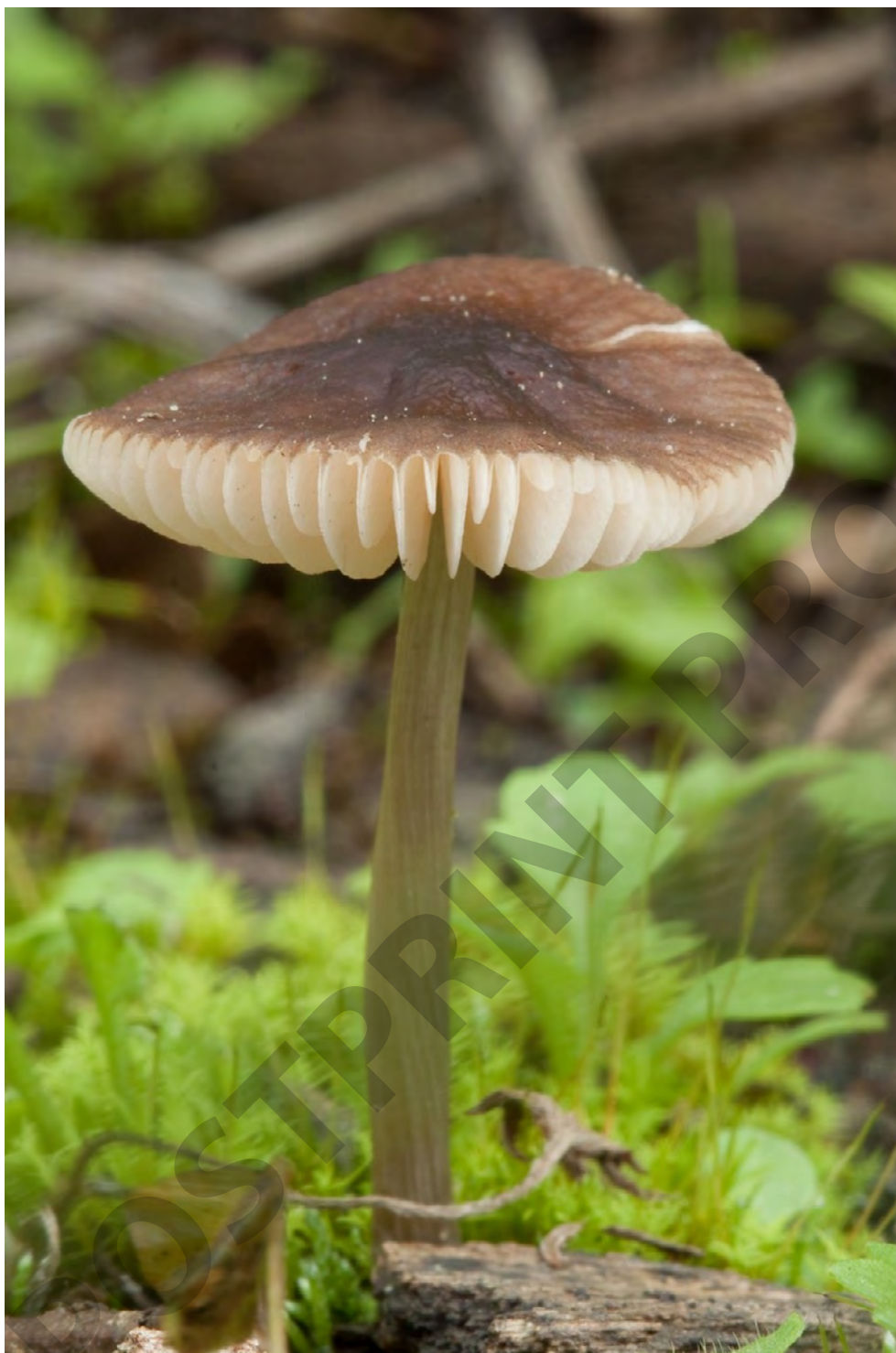
Fig. S44. Basidioma of Pluteus nanus (Pers.) P. Kumm. f. griseopus (P.D. Orton) Vellinga from the Bieszczady Mts (Aug 03, 2011).

#♦ Pluteus pellitus (Pers.) P. Kumm. (Fig. S45); UP: Lutowiska (Jewish cemetery); VIII; tree clump; soil.