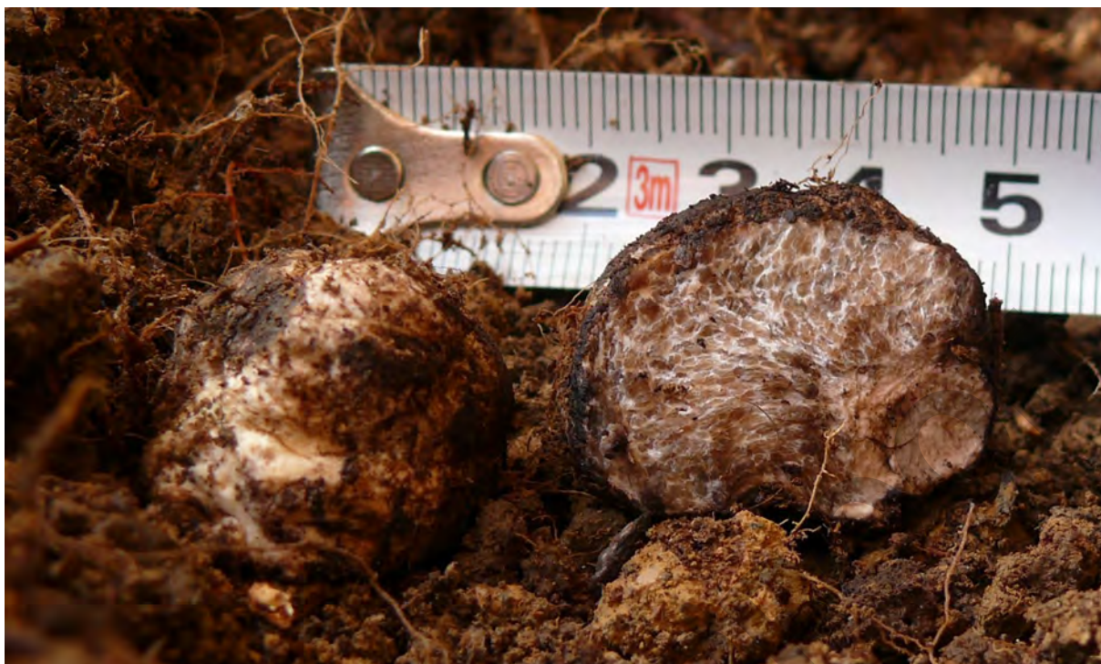
Fig. 12. Basidiomata of Octavianina mutabilis E. Bommer & M. Rousseau from the Bieszczady Mts (Nov 29, 2011).