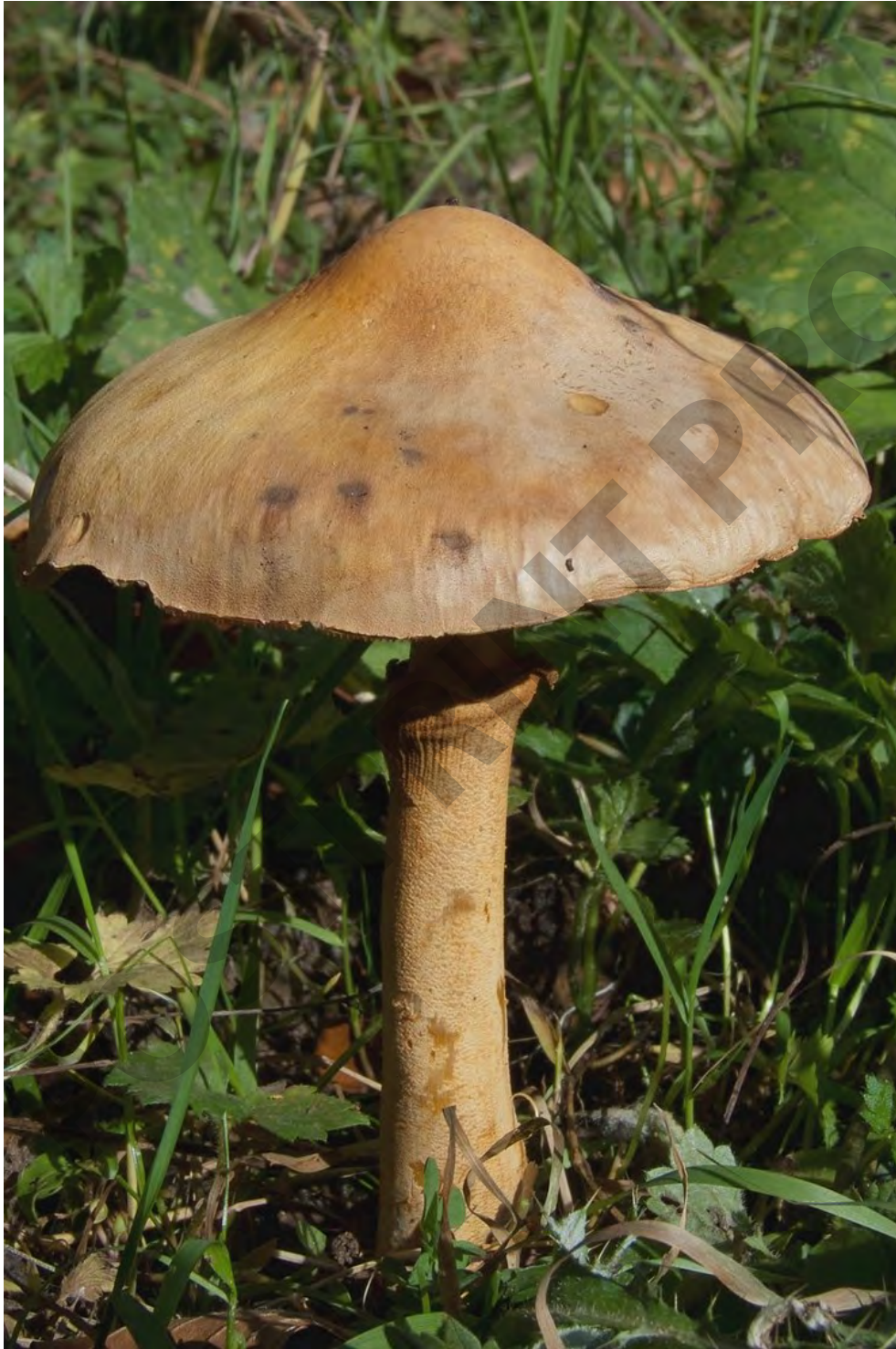
Fig. S39. Basidioma of Phaeolepiota aurea (Matt.) Konrad & Maubl. from the Bieszczady Mts (Oct 08, 2010).

Dydiowska), Wołosate 3.5 km E (Horbki); VI, VIII; beech forest; soil. UP: Wola Michowa, Rozsypaniec Mt 1 km SW, Pszczeliny 1 km W (SE slope of Magura Stuposiańska Mt), Berezki 2 km NW, W from Rabe (S slope of Chryszczata Mt by the tourist trail); VIII-X; beech forest, fir-beech forest; soil.