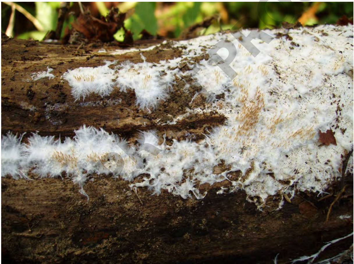
Fig. S30. Basidiomata of Kavinia himantia (Schwein.) J. Erikss. from the Bieszczady Mts (Oct 02, 2011).

* Kavinia himantia (Schwein.) J. Erikss. (Fig. S30); RL-E, SSI(B); LR: [S1,S4,S5]. UP: Wołosate; IX; Alnetum incanae ; Salix log.