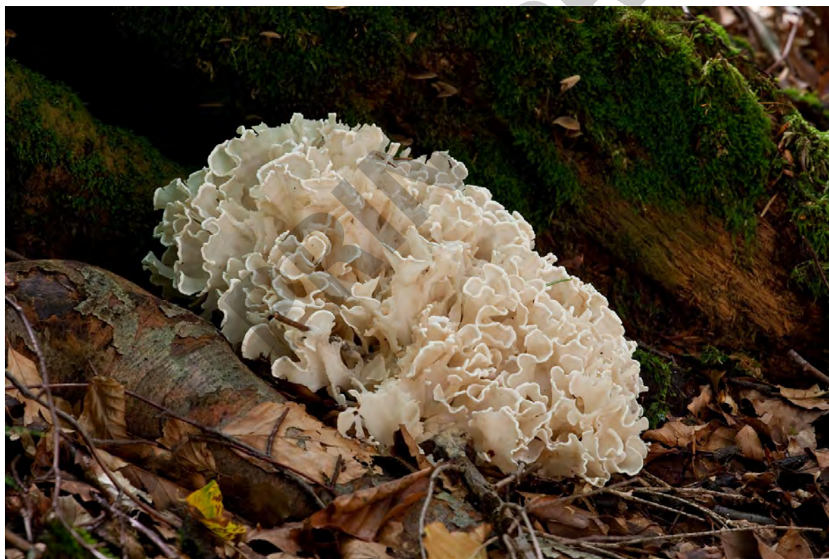
Fig. S47. Basidioma of Sparassis brevipes Krombh. from the Bieszczady Mts (Sep 07, 2011).

*♦ Sparassis brevipes Krombh. (Fig. S47); RL-V, PaP; LR: [S1,S4], [S243] (as S. laminosa Fr.). UP: Pszczeliny-Widełki 1.5 km W (SE slope of Magura Stuposiańska Mt), S from Zatwarnica (Hylaty valley, Izwir), Zatwarnica 3 km S (Hriadnik), Górna Solinka valley (Moczarne); VIII-IX; beech forest, fir-beech forest; Abies trunk base.