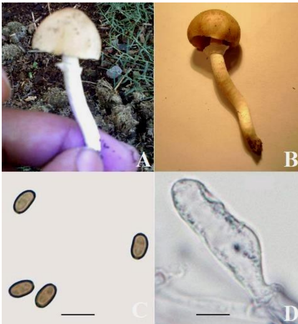
Fig. 1. Psathyrella fimicola . A – Carpophore growing in natural habitat; B – Carpophore showing floccose-powdery veil and peronate annulus; C – Basidiospores; D – Caulocystidium with clamp connection at the base. Bars C-D 10 \mu\text{m} .