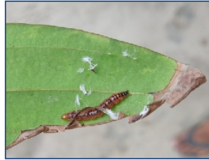
Fig. 10. Leaf folder damaging bay leaf.