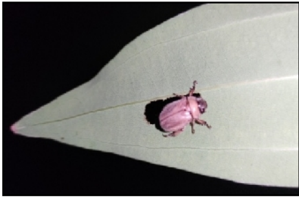
Fig. 7. Adult chafer beetle during night.