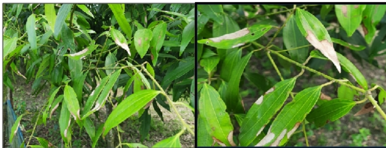
Fig. 13 (a & b). Grey leaf blight symptom on bay leaf plant.