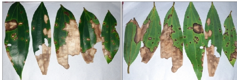
Fig. 14 (a & b). Upper and lower side of leaf infected by Colletotrichum gloeosporioides .