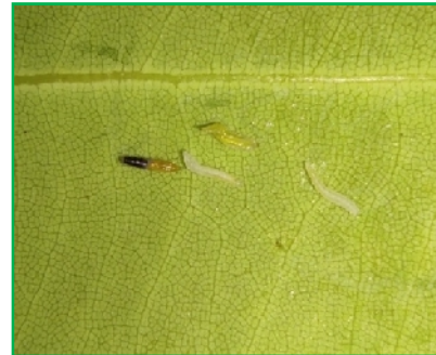
Fig. 5. Pupa and larvae of leaf miner.