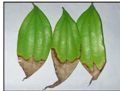
Fig. 12. Leaf infected by Grey blight disease.