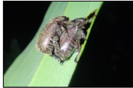
Fig. 8. Mating of adult chafer beetle.