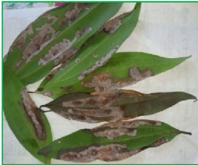
Fig. 4. Heavy damage by leaf miner.