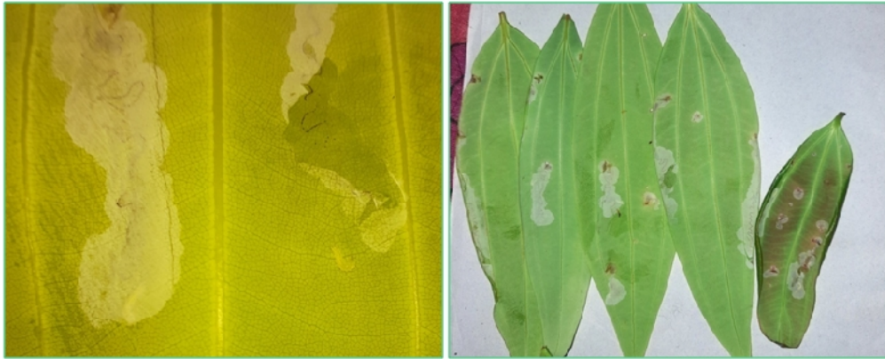
Fig. 3 (a & b). Leaf miner damage in newly emerged leaves.