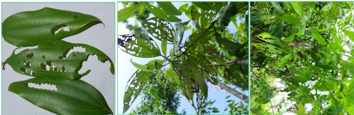
Fig. 6 (a, b & c). Damage caused by chafer beetle in bay leaf plantation.