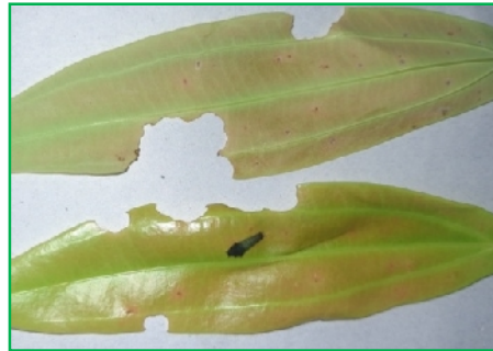
Fig. 2. Leaf damage caused by Tailed jay.