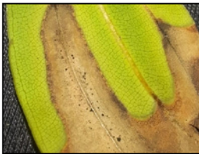
Fig. 11. Acervuli in Grey blight disease.