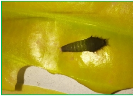
Fig. 1. Larva of Tailed jay.