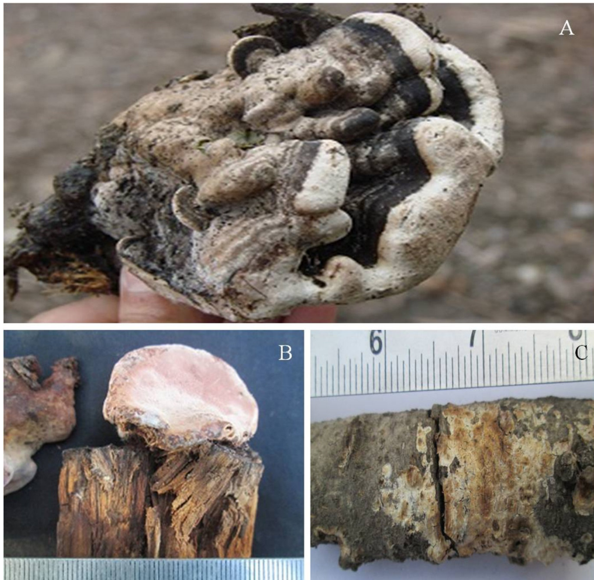
Fig 2. A) Perenniporia fraxinophila , B) Fomitopsis lilacinogilva , C) Hyphodontia barbajovis

Collection examined: Himachal Pradesh: Sirmaur, near Renuka lake, on Angiospermic log, Deepali 38518 (PAN), July, 31, 2011, IBP 37096