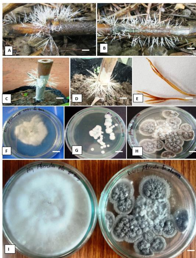
Fig. 2: Sexual morph of Pterula bambusicola sp. nov. (A- Holotype RFRI/BF/46; B-D Paratypes- RFRI/BF/86 and 101 Basidiomata; E-Basidiomes; Microscopic characteristics of Pterula bambusicola ex-holotype cultures ( F-I Fungal colonies on PDA medium producing slender and skinny mycelia with hyphal branching and bearing sporulating bodies ) (A-I Bar = 1cm).

Description: The clavarioid fungus having white to buff white (2.5Y 8/2) basidiomata, branched polychotomous (broom/frond like) apex (white coloured) and jellylike stipe are mostly present on nodal parts of the bamboo culm. This fungal species was observed on Bambusa bambos and collected from Geleky Reserve Forest, Sibsagar, Assam. Pterula bambusicola sp. nov. has pteruloid/ basidiome borne by slender mycelial cords, as curved intercalary swirl of mycelium with interspersed dextrinoid cystidia (18–20 × 4–5 μm), hyphoid to cylindrical with short mucronate apex, hyaline, thin-walled and hyphal system is dimitic, papillate skeletal hyphae in basidiomes. Spores are 5–7 × 3–4 μm, cylindrical, hyaline, smooth, thin-walled and guttulate in nature. The mean quotient value amongst the measured spores was found to be 1.66, and 1.75 respectively.