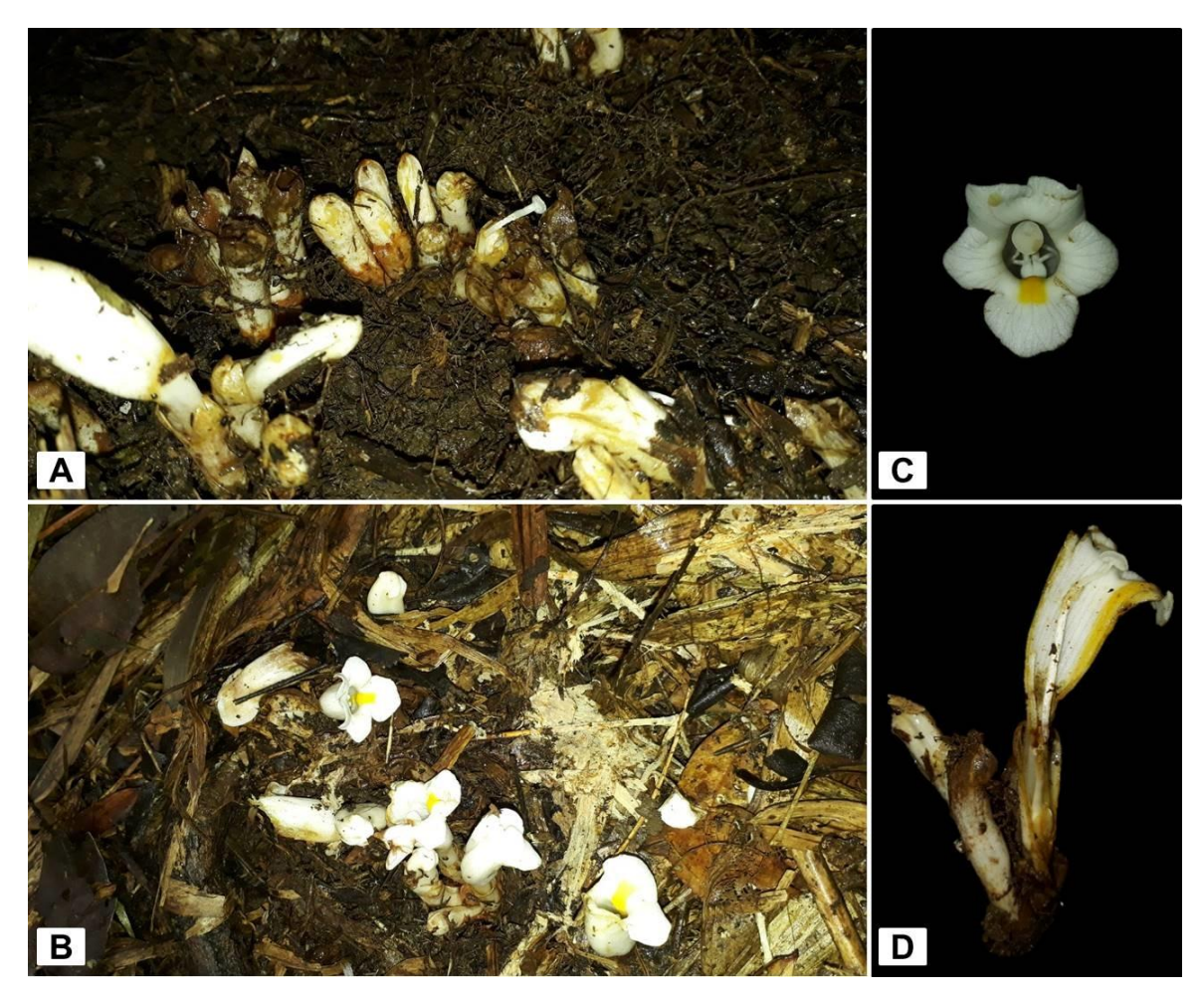
Fig. 2. Christisonia scortechinii Prain. A) Habit with unopened flowers, B) Habit with flowers in anthesis, C) Frontal view of the flower, D) Longitudinal section of the flower.

Emiliano "Blacky" Meliston for the help during the fieldwork at Mt. Kitanglad.