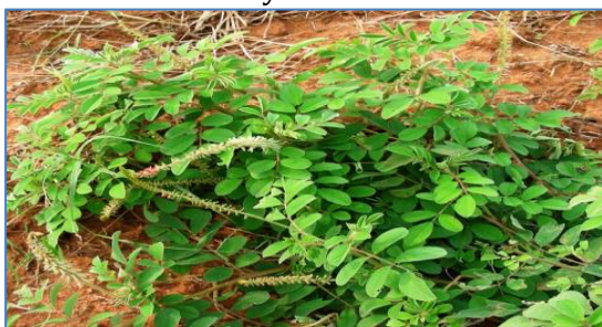
Figure 1: I. hirsuta - Natural Habitat

family Fabaceae. It is commonly known as hairy Indigo, in Africa and Kenya, it is used as chest medicine, Leaf is used against infant immunity [15], urinary complaints [16], decoction of leaf is used in case of stomach problems [17] used against diarrhea [18]. Whole plant paste is applied as an external application for back ache [19], I. hirsuta leaf methanol and ethanol extracts showed effective antibacterial activity on E. coli , B. subtilis , P. aeruginosa , S.aureus [20]. I. hirsuta fruits showed nearly 14 Phyto constituents in aqueous, methanol, alcohol, ethyl acetate and chloroform extracts and effective antibacterial activity than the control drug Ampicillin [21]. I. hirsuta leaf, fruit alcohol and methanolic extracts showed effective anthelmintic activity than the control drug Albendazole due to the presence of tannins [22]. About 25 Phenolic compounds are qualitatively identified [23]. I. hirsuta leaf, fruit alcohol and methanolic extracts showed effective antifungal activity [24]. Due to its high medicinal significance it is need to identify quantitatively various important bioactive secondary metabolites.