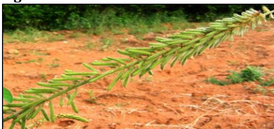
Figure 2: I. hirsuta - Fruits