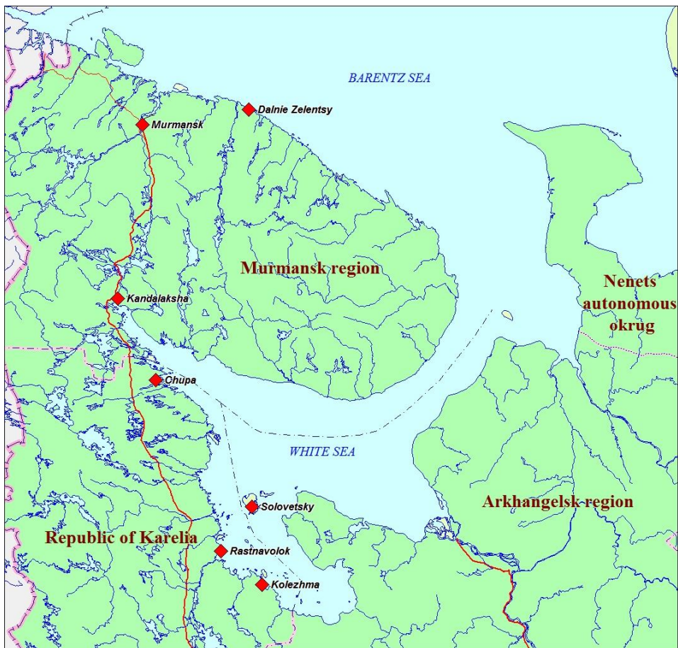
Fig. 1. The White Sea coast with indication of the study areas denoted as territories in the text. The study areas are indicated by red points.

belong to the most widespread coastal epilithic lichens. They are typical inhabitants of acidic rocks, have a circumpolar distribution in the Northern hemisphere and are found everywhere on the coasts of the northern seas (Smith et al. 2009). All samples were collected on the cliffs and boulders in supralittoral zone (3–9 m from water line). These rock fragments are irrigated by a spray or surging during heavy storms, but usually they are not inundated with sea water.