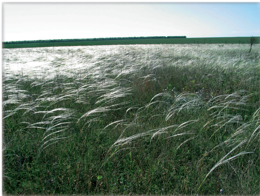
Fig. 3. S. ucrainica dominated the vegetation in May 2007.

The vegetation was documented from two sample plots (Table 1). Both relevés were made on level terrain, at 50 m altitude. The total projection cover of the vegetation was 90%. The cover of stones and pebbles on the soil surface was under 5%. With more than 50 species (70 species were identified altogether) found per relevé, the community had remarkable floristic diversity. All species found were herbs, with strong prevalence of perennials (66%).