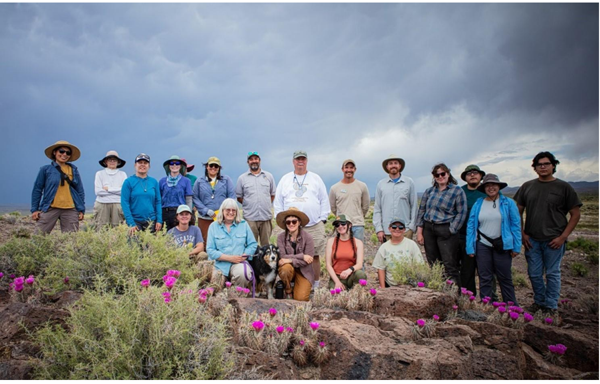
Group photo of most participants.

Table 2. Counts of species observed during the bioblitz.