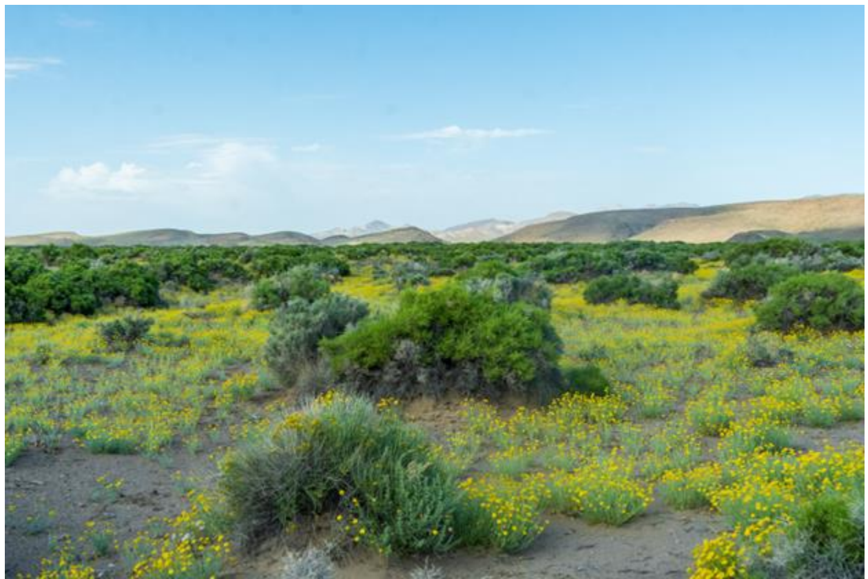
Stabilized sand dunes between the upper and lower wet meadows.