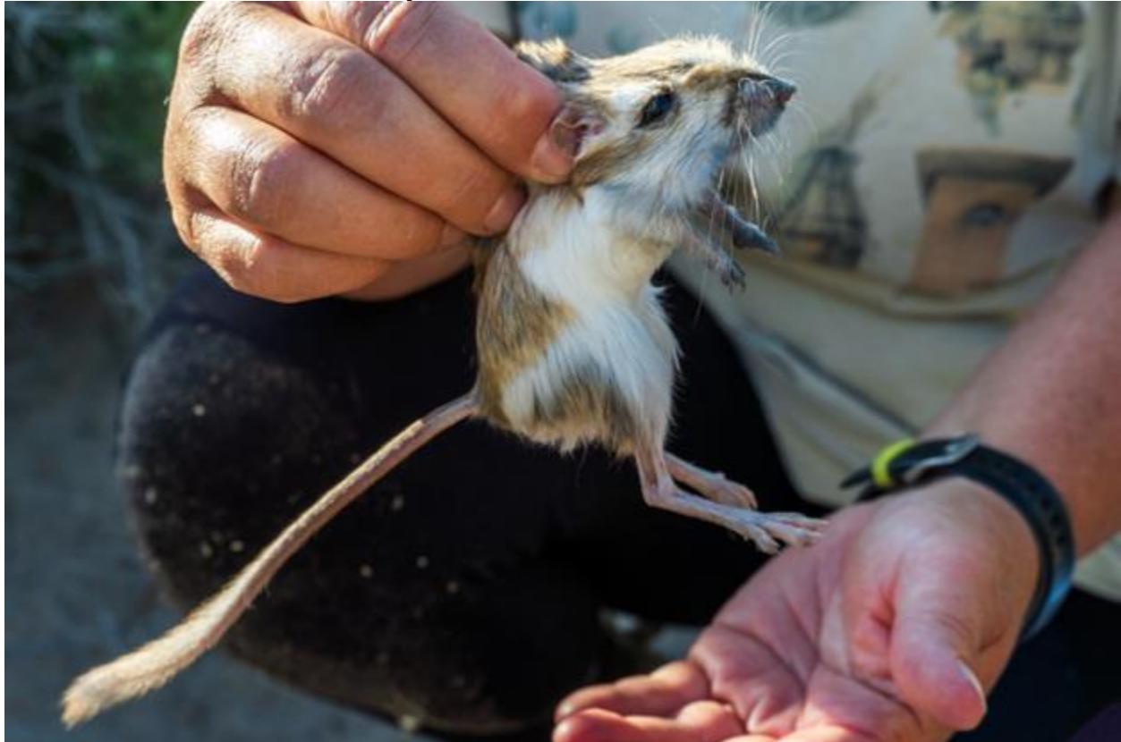
A Merriam's kangaroo rat being processed after capture.

One method to avoid these challenges would be to have a "rolling bioblitz" that allowed participants to visit the Atwood Preserve and conduct their surveys at the appropriate phenological time and during times that worked with their personal schedules. The downside of a rolling bioblitz could be access issues from TNC (e.g., lack of personnel available at the appropriate time), the personnel cost to TNC, and the community developed by the participants when attending the bioblitz. By having most participants at the Atwood Preserve together, it allowed participants to network with experts from other disciplines and provide guidance on other areas of the Preserve to survey.