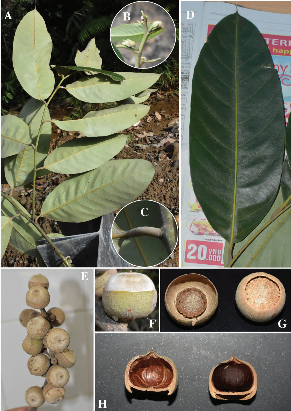
Figure 2. Lithocarpus dabuoaiensis Ngoc & L. V. Dung. A Leafy twig B Buds C Petiole D Abaxial surface of mature Leaf E Infructescence F Mature fruit G Cupule (left) and bottom of nut (right) H Vertical sections of nut.