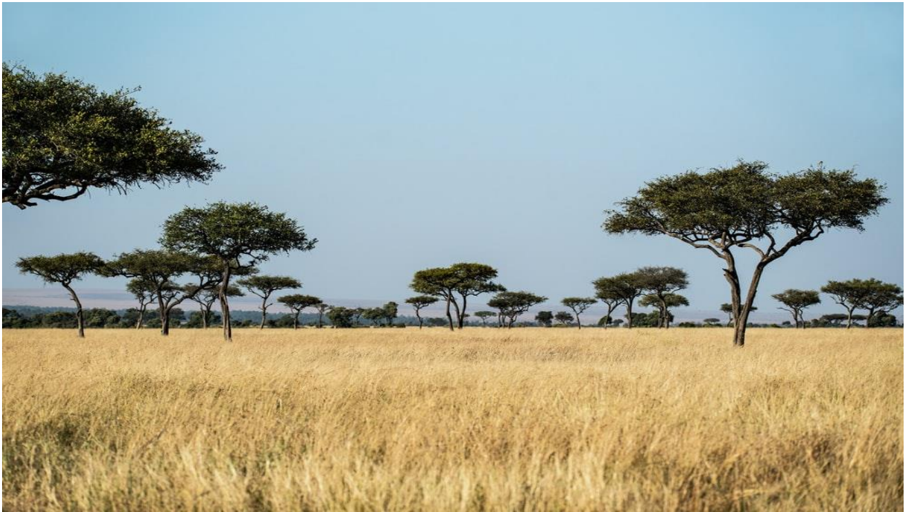
Figure 1: A typical savanna vegetation

Savannas are broadly defined as grasslands with scattered trees. Grasslands are lands on which the existing plant cover is dominated by grasses. (Anderson et al. , 1999; Janior et al. , 2006; Gandiwa, 2011). Savanna ecosystem is one consisting of a continuous or near continuous grass dominated understorey, with a discontinuous woody overstorey. The woody components can be a mixture of evergreen or deciduous, needle-like or broad-leafed trees and shrubs. The grass-dominated understory can consist of a mix of species with either annual or perennial habit (often >1 m in height). Ecosystems that fit this definition have ambiguously been termed woodlands, rangelands, grasslands, wooded grasslands (Werner et al. , 1991; Hutley and Setterfield, 2018).