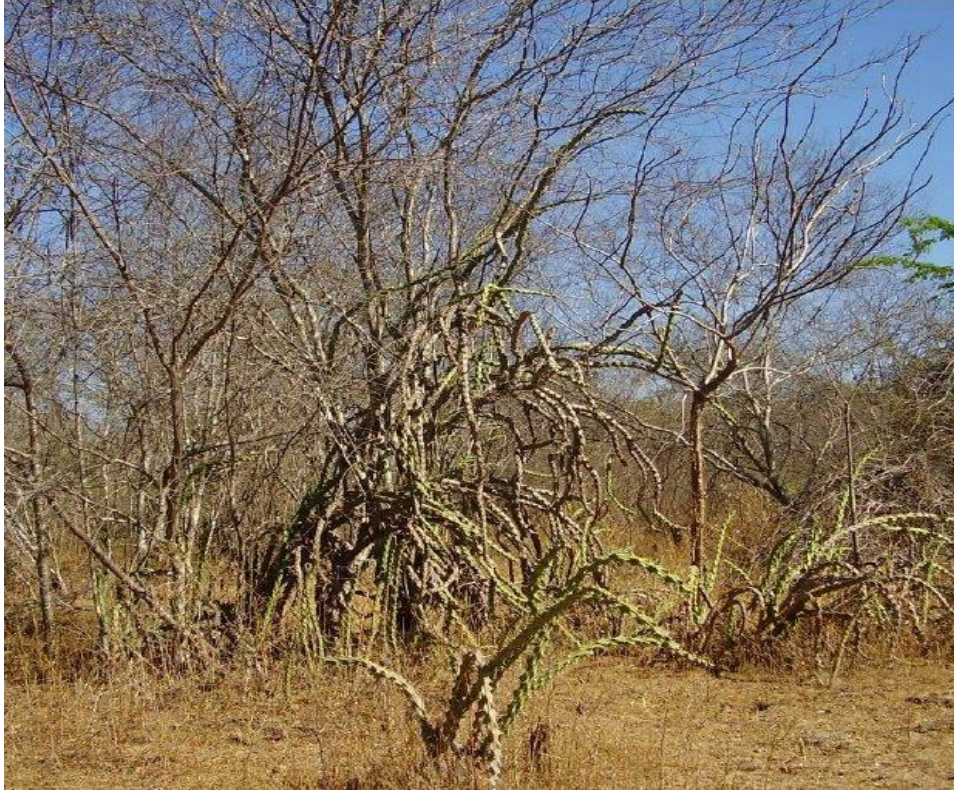
Figure 12: Deciduous plants shed their leaves in dry periods

Woody species have evolved physiological and morphological mechanisms to either tolerate ( evergreen habit) or avoid ( deciduous habit) prolonged periods of water stress. Deep-rooting woody plants (usually evergreen) can access water resources throughout the year and attain their full photosynthetic capacity when favorable conditions occur. Deciduous species rehydrate stems before the onset of wet season rains, which is then followed by leaf expansion to maximize photosynthetic activity during the wet season.