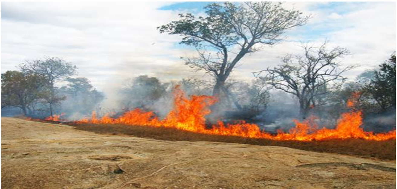
Figure 7: Seasonal fire ravaging a savanna vegetation

Savanna plants develop thick insulating bark, high wood moisture content, elevated and well-separated crowns, and significant resprouting capacity.