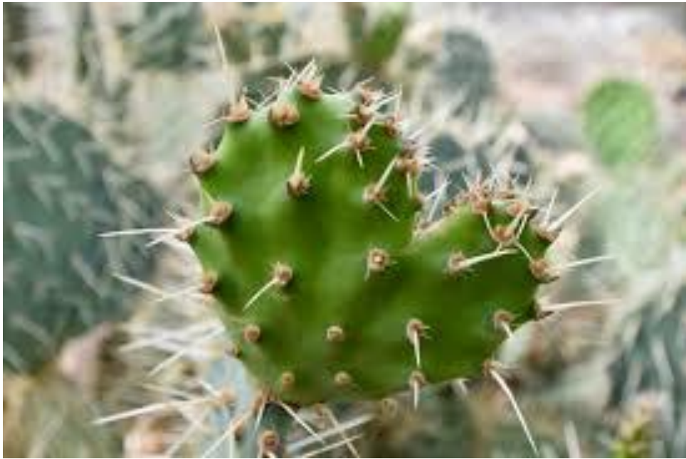
Figure 11: Reduced leaves in cactus to reduce water loss