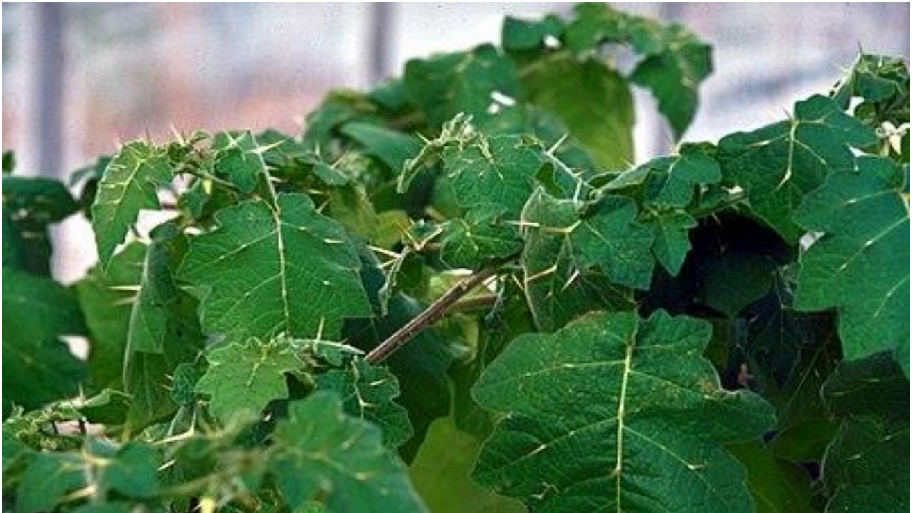
Fig. 10 Solanum viarum possess thorny leaves to resist herbivores

Savanna grasses also display morphological features, such as serrated edges and chemical features, including tannins and silica bodies to restrict grazing (Hutley and Setterfield, 2018).