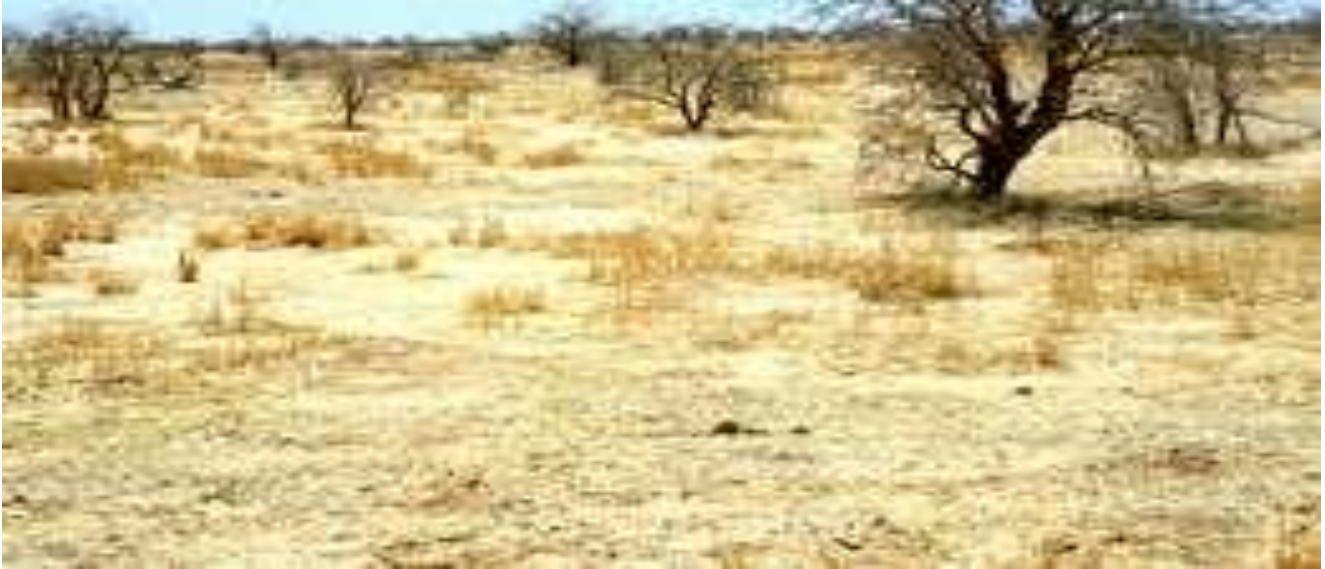
Figure 6: sahel savanna

The Sahel savanna, is found to the extreme Northwest and Northeast of the country, where the annual rainfall is less than 600 mm and with dry seasons exceeding 8 months (WWF, 2007). It is a transitional ecoregion of semi-arid grasslands, savannahs, steppes and thorn shrubs lying between the wooded savanna to the south, and the sahara to the north. The topography is mainly flat; usually between 200 – 400 meters in elevation (Dai et al. , 2004).