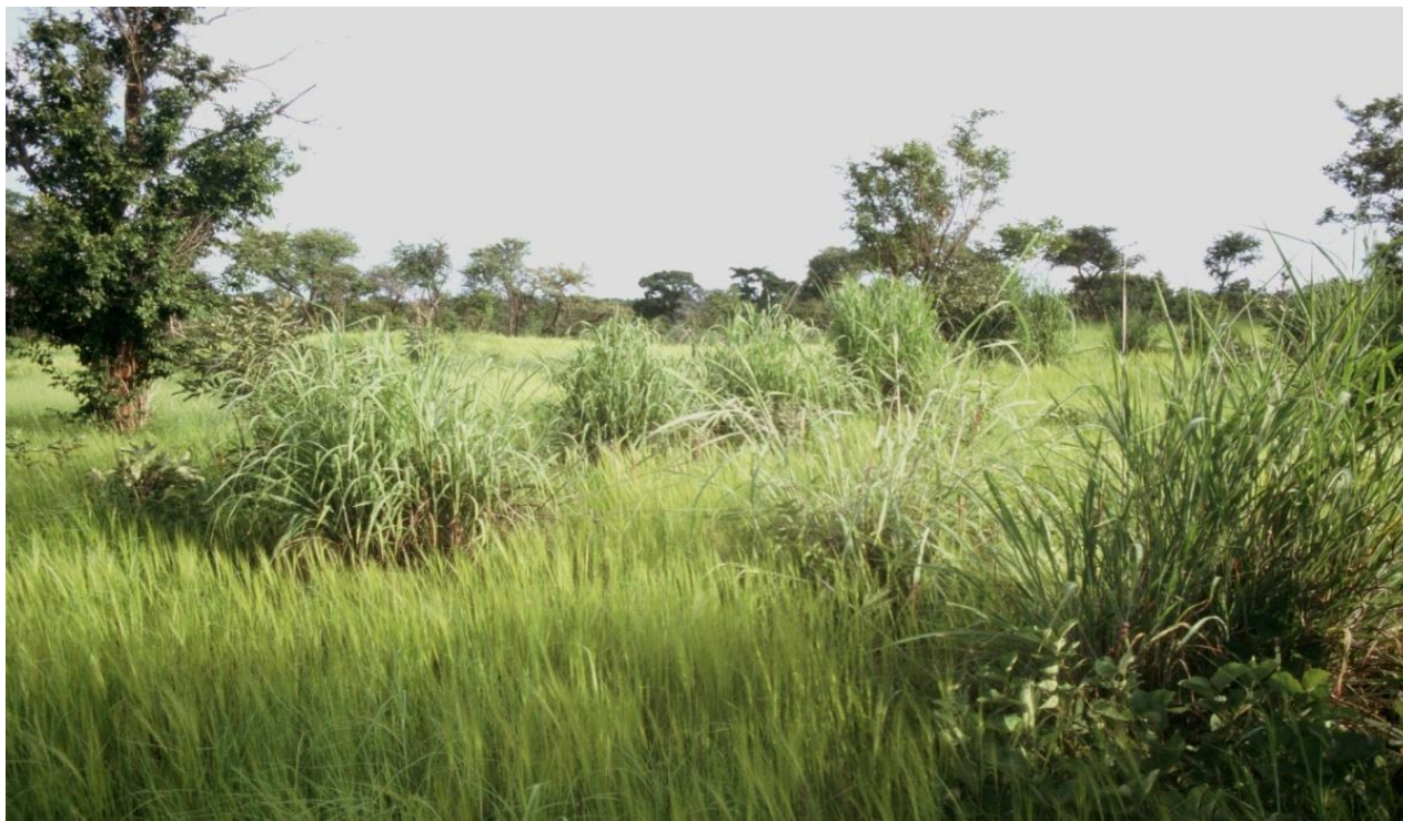
Figure 5: The Sudan Savanna

The zone experiences a dry season of about 4-6 months. The zone has the largest population density in Northern Nigeria, produces important economic crops such as groundnuts, cotton, millet, and maize and has the highest concentration of cattle in the country. Sudan savanna has consequently suffered great impact from man and livestock. The landscape has less vegetation than the Guinea savanna. Existing vegetation consist mainly of short grasses, about 1-2 m high, and some stunted tree species, such as Acacia spp , Ceiba pentandra (silk cotton/ kapok) and the Adansonia digitata (baobab), Hyphaene thebaica (doum palm). Parkia spp. , Butyrospermum spp. , Acacia albida e.t.c., are also found (Challinor et al. , 2007; Callo-Concha et al. , 2019). Up north, thorny plants like Acacia spp. become more prevalent, while the grasses get shorter, less tussocky, and featherier.