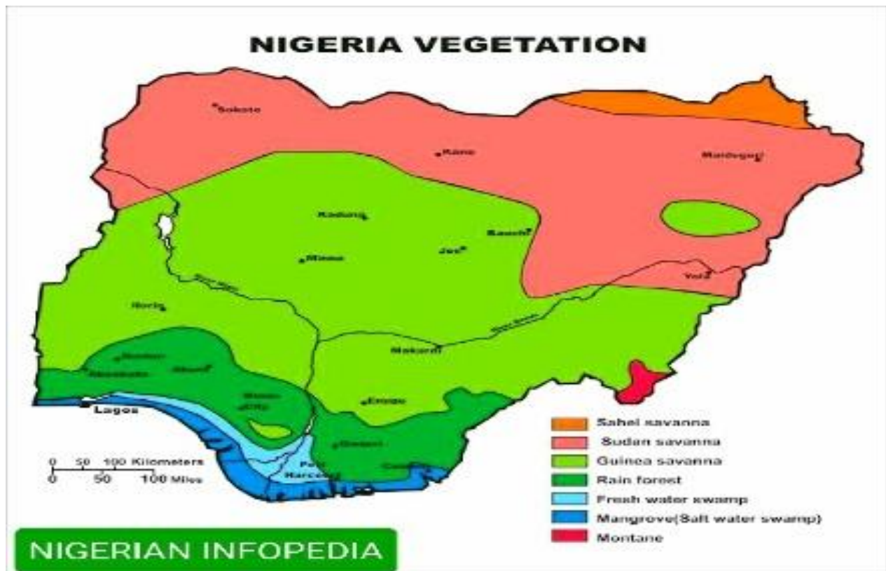
Figure 4: Nigerian ecological zones showing the Savanna belts