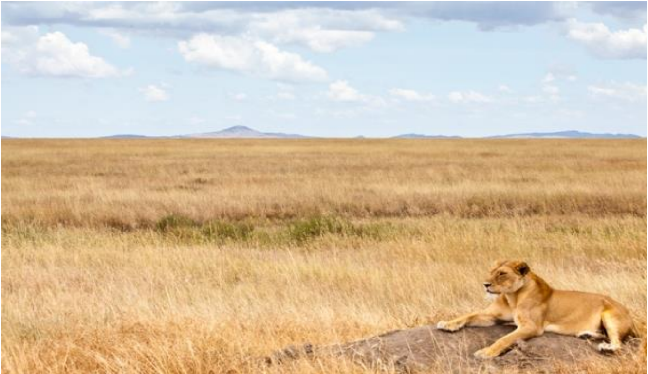
Figure 2: An extensive grassland

Grasslands evolved during the Cenozoic era, in the course of a period of cooling and drying of the global climate. It's possible that the Eocene and Oligocene epochs saw the beginning of the evolution of savanna ecosystems and the organisms that make them up. Grasslands and savannas can be either anthropogenic or natural, by definition. Grasslands and savannas together make up an estimated 20% of Earth's terrestrial biomes (Sankaran et al. , 2005). Savannas have wide socio-economic importance regarding land use and biodiversity. Savannas are the central biome in the transition between grasslands and forests, they are characterized chiefly by the coexistence of two types of vegetation: Trees (i.e., woody vegetation), and Grasses (i.e., grasses and herbs) (Janior et al. , 2006).