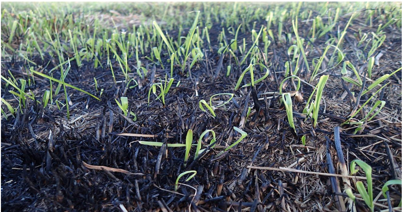
Figure 9: Savanna grasses sprouting after a fire occurrence

Resprouting can occur via lignotubers and from other underground and stem basal tissues following the death of aerial stems. This enables recovery with minimal developmental costs. Vegetative reproduction from roots, rhizomes, or stolons is dominant in much of the savanna biome.