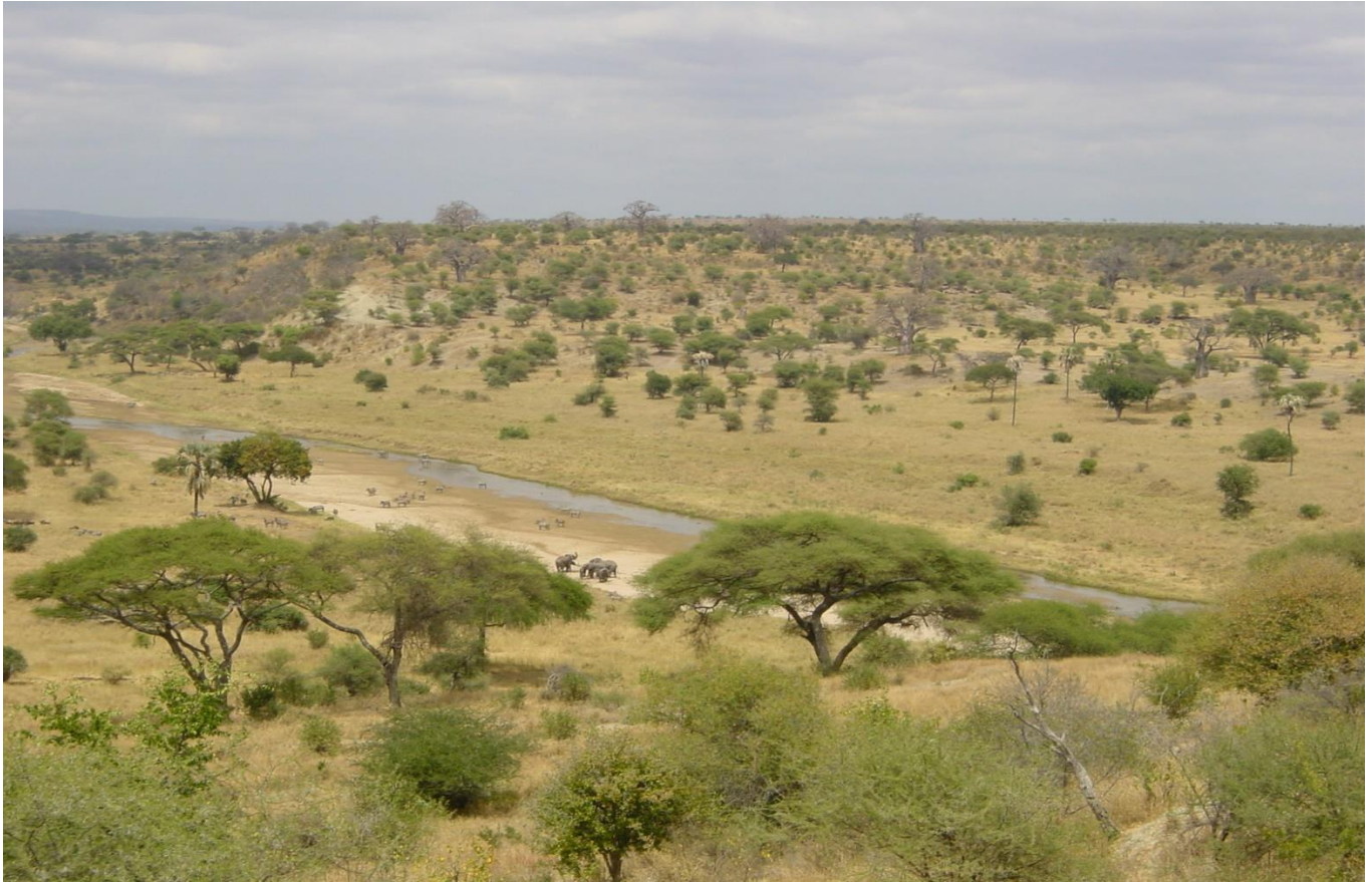
Figure 3: Savanna vegetation

The water and nutrient cycles of the savanna ecological system are determined by the seasonality of water availability. Because of the prevailing short humid period in the Savanna Zones and the open structure of their vegetation, the soils of the Savanna Zones dry up for a certain period during the dry season. This process is strengthened by the relatively shallow root system of the savanna vegetation, which is not as effective as the forest in pumping water from great depths. Water deficiency in the dry season has an inhibiting effect on the nutrient uptake by the vegetation (Ariko et al. , 2019).