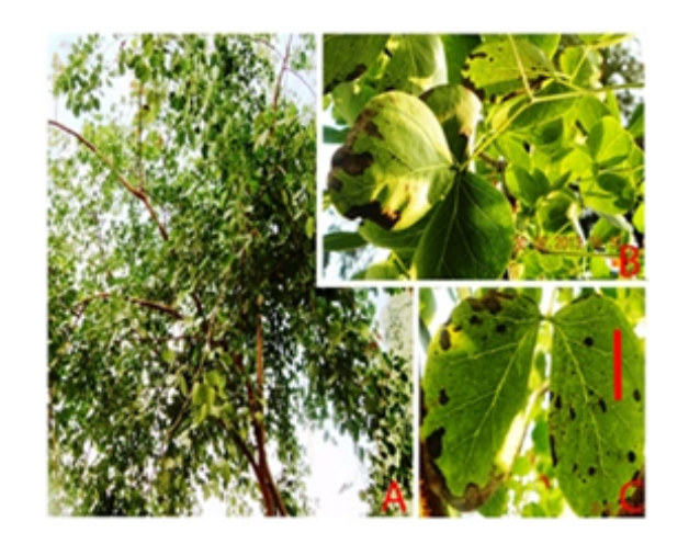
Figure 1: Leaf spot symptoms on endangered plant ( Indopiptadenia oudhensis ). A: Host plant habitat; B and C: on the underside of the leaf, many brown colour circular, sub-circular to irregular leaf spot appears, A, B, C=20 mm.