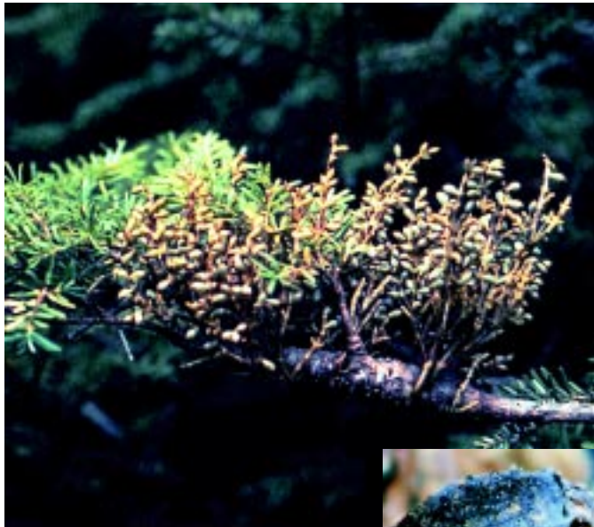
FIG. 1 (left)—Female plant of the western hemlock dwarf mistletoe ( Arceuthobium tsugense ).

Colletotrichum gloeosporioides is commonly isolated from dwarf mistletoes in the United States and western Canada (Wicker & Shaw 1968; Kope et al. 1997; Muir 1967). Although different isolates of the fungus are distinct in mycelial growth, colony colour, sporulation, and diameter growth, cross-inoculation experiments demonstrate that the isolates are not host-specific (Scharpf 1964). Colletotrichum gloeosporioides infections first appear as small brown-to-black necrotic lesions on the nodes of fruits and shoots. Lesions enlarge, coalesce, and cause die-back of the berries and shoots (Fig. 2) (Wicker & Shaw 1968; Parmeter et al. 1959). Parmeter et al. (1959) observed the endophytic system of Arceuthobium abietinum Engelm. ex Munz invaded by the fungus. Wicker (1967) determined that when both sexes of A. campylopodum Engelm. are attacked, from 35 to 67% of the plants, or 24% of the shoots, may be destroyed. Although the fungus may persist for several years (Wicker & Shaw 1968), its occurrence is usually sporadic (Hawksworth