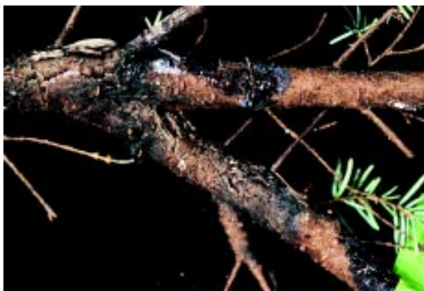
FIG. 4— Neonectria sp. canker of Arceuthobium tsugense swellings. Note: symptoms of the disease are resinosis and girdled branch of western hemlock.