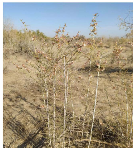
Salsola richterii (Moq.) Kar. ex Litv.