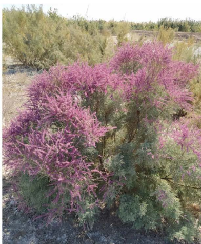
Tamarix ramosissima Ledeb.