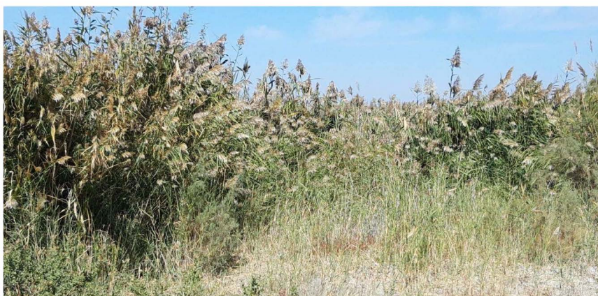
Phragmites australis (L.) Trin.