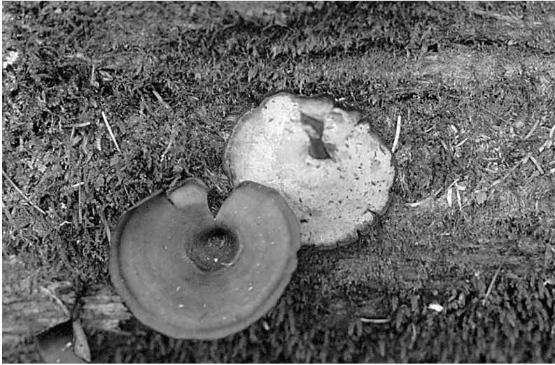
Fig. 4. Polyporus tubaeformis (P. Karst.) Ryvarden & Gilb. Two fresh basidiocarps, specimen Dai 626. Photographed in situ , \times 0.6

sian Far East. All these belong to the same species, and they are identical with the European Polyporus tubaeformis (I could not get the specimens identified by Burt and Bondartsev and Lyubarsky, but they evidently also represent this species).