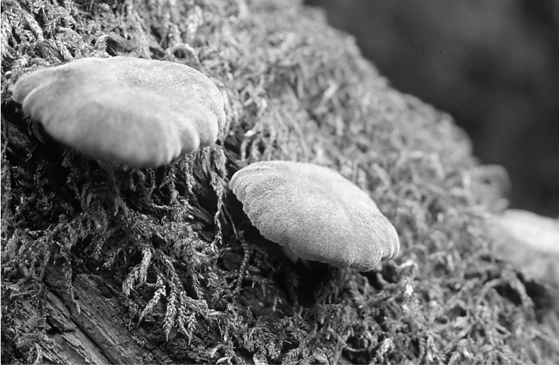
Fig. 2. Polyporus mongolicus (Pilát) Y. C. Dai. Two young fresh basidiocarps, specimen Dai 2190. Photographed in situ , \times 0.5

Betula and Tilia , 1993 Dai 1431. Liaoning Prov., Kuandian County, on rotten wood of Tilia , 1995 Dai 2190 & 2196. Russia. Primorye Terr., Ternei Distr., on ? Populus , 1979 Kollom (TAA 127019); on Alnus , 1990 Parmasto (TAA 151158).