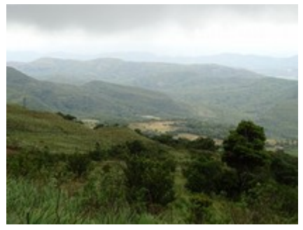
Pitawala Village in the valley down below