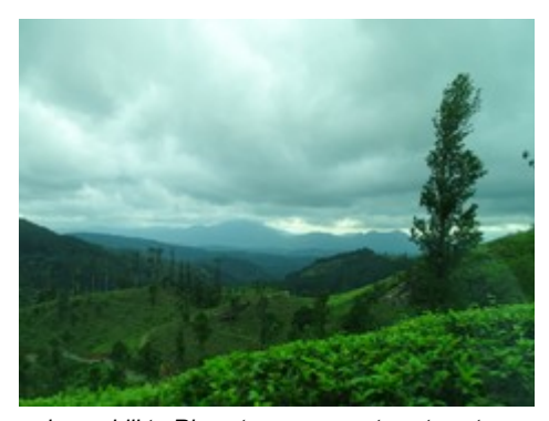
going uphill to Riverston gap - wet, wet, wet...