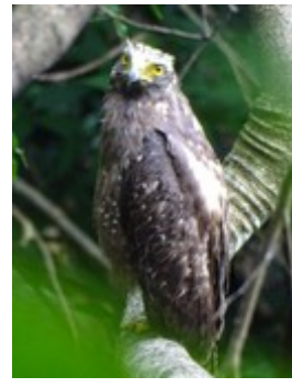
Crested Serpent Eagle

The general atmosphere was very lively and cheerful and the pre-dinner chatter amusing. The co-operation among the participants made it possible by and large to keep to our time schedules.