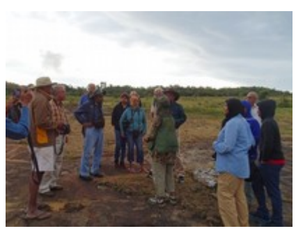
discussions at Pitawala Pathana