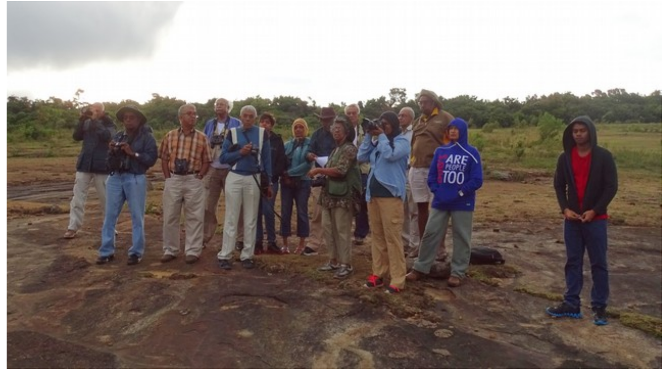
the participants at Pitawala Pathana