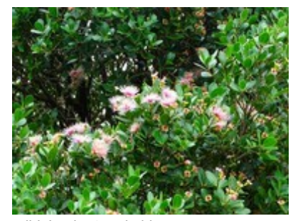
wild Jambu tree in bloom

Tea/Coffee with biscuits was served at 0600 hours after which a few of us walked along the road observing the vegetation and looking out for birds. It was very windy and misty as usual. The inevitable shower of rain followed and we rushed back to base. After breakfast at 0730 hours we drove down to Pitawala Pathana again through Riverston Gap.