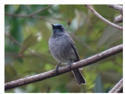
SL Dull Blue Flycatcher