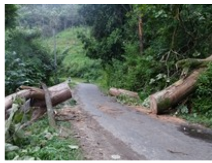
crash, bang and cleared next morning