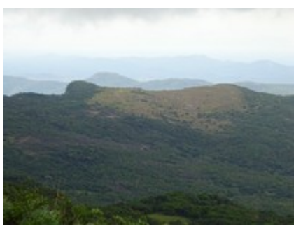
Pitawala Pathana .... up closer