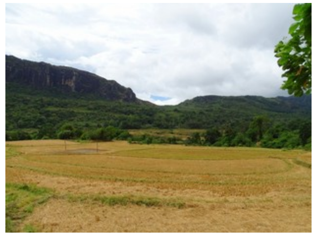
rural enchantment - with the saddle of Mani Gala

We journeyed on down into the valley and disembarked in the rural atmosphere of the Pitawala village. We walked parallel and quite close to the long rock mountain of Mani-gala down to the waters of Veddha Pani Ela observing the birds along the way. We were entranced by the typical village scenery of extensive paddy fields viewed against the backdrop of the huge rock face. We chatted to the village folk who reminisced about times past. We retraced our route for the last time up the hills to base, for lunch after which we packed up and departed on our journey back home.