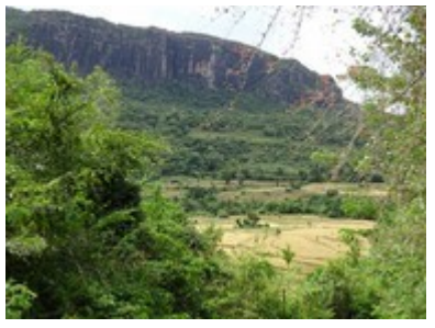
Pitawala village by the side of Mani Gala