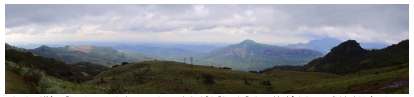
going downhill from Riverston gap - the brown patch towards the left is Pitawala Pathana, Mani Gala is seen slightly right of centre