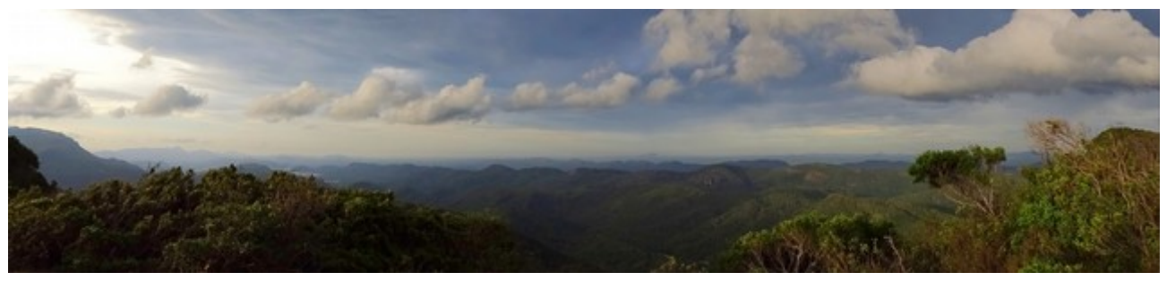
Panaromic view from the edge of Pitawala Patana