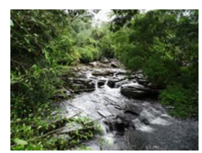
Veddah Pani Ela