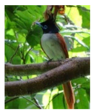
Asian Paradise Flycatcher