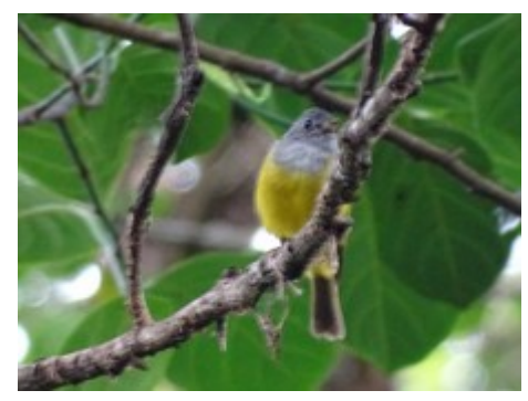
Grey Headed Canary Flycatcher

The accommodation at the Sanasuma Holiday Resort was basic and adequate for our needs. Meals were quite tasty and served warm. The weather was mostly wet, windy and misty. The almost constant cloud cover lifted from time to time to reveal the beauty of the distant hills and valleys. Brief periods of shaded sunlight filtered through the clouds in the rapidly changing weather and the sun was never seen. It rained on and off but fortunately remained dry whilst we were out on our longer walks.