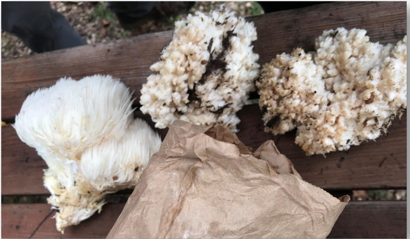
Figure January SOMA Camp foray lions main finds on a table. This wasn't the only bunches found but here's a photo