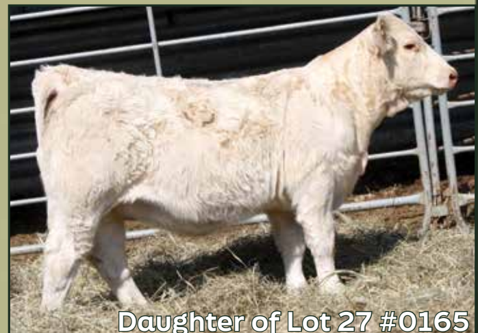
Daughter of Lot 27 #0165 Sold to Arizona in our 2020 sale