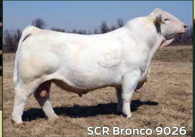
SCR Bronco 9026 Sib to Lot 10