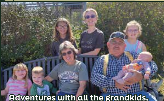
Adventures with all the grandkids, including our newest addition Riley