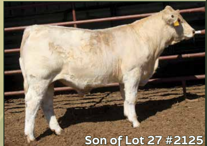
Son of Lot 27 #2125

Bred AI on 5/19/2022 to LT BADGE 9184 PLD and pasture exposed to SCR AFFINITY 9104 from 6/5/2022 - 8/9/2022. Here is an ET daughter of SCR Bronco 9026 that sold to Lindskov-Thiel and Wild Indian Acres. Her 4-3-20 daughter sold to Arizona. Her bull calf #2125 born 2-15-22 will sell next spring.