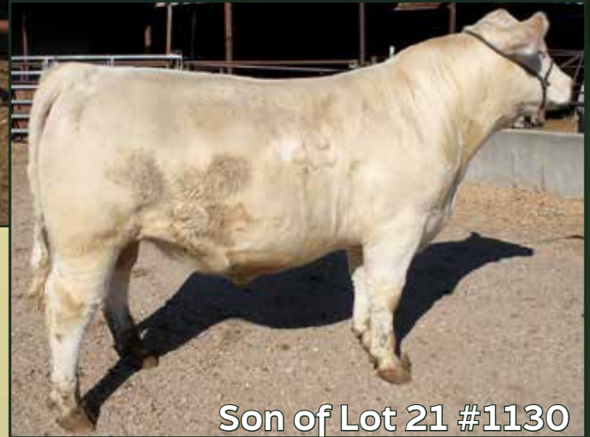
Son of Lot 21 #1130 Part of our 2022 Denver Pen