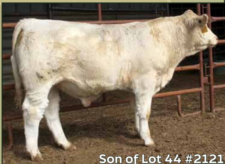
Son of Lot 44 #2121

Implanted embryo (SCR MISS CASANOVA 8152 X LT PATRIOT 4004 PLD) on 5/3/2022 and pasture exposed to HBC SUMMIT 1H from 5/26/2022 - 8/17/2022. Another good bull calf #2121 born 2-15-22 that had an AWW of 792 lbs.