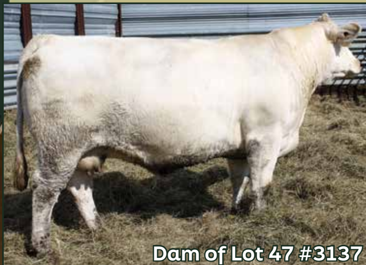
Dam of Lot 47 #3137

A daughter also sells as Lot 87. She also has a bull calf #2140 born 2-21-22.