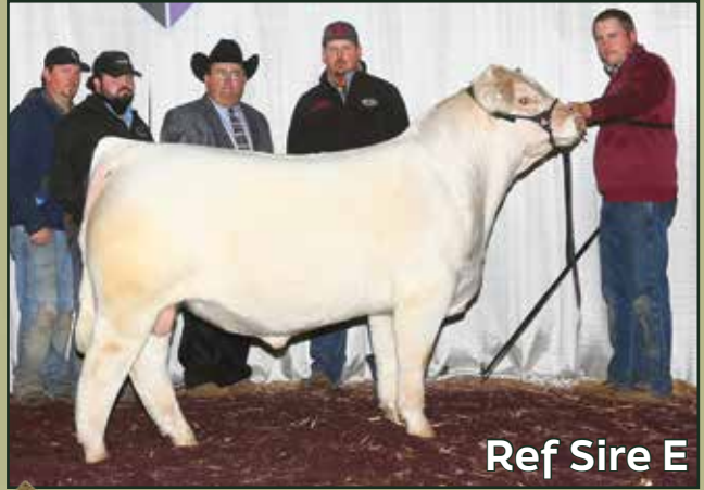
Ref Sire E