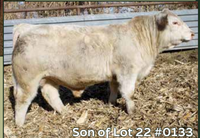
Son of Lot 22 #0133 Part of our 2021 Denver Pen