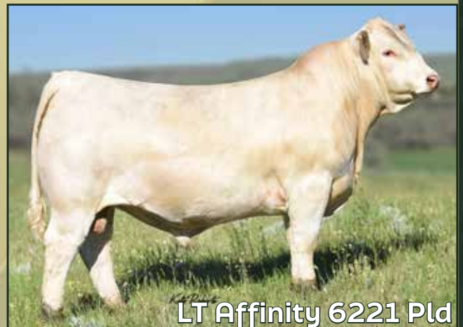
LT Affinity 6221 Pld

An ET heifer out of another tremendous donor for us SCR Miss Maple 9021 who had 29 registered progeny. This females first calf also sells as Lot 71.