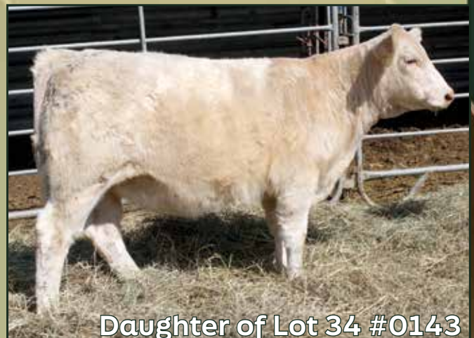
Daughter of Lot 34 #0143 Sold in our 2020 female sale