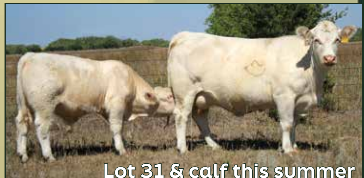
Lot 31 & calf this summer