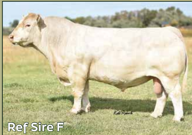
Ref Sire F

He was named the National Champion Bull in 2021 in Oklahoma City and was also the lead bull in the Wild Indian Acres Grand Champion Pen-of-Three at that same National Show. His BW was 71 lbs. and his AWW 841 lbs. He sold in the National Sale for $30,000 for one-half interest. His sire PVF Ridge sold as a yearling for $92,000 and his dam is one of the greatest daughters of M&M Outsider 4003 ever. She was the National Reserve Grand Champion Female in 2018 and the AICA Show Heifer of the Year for 2017-18.