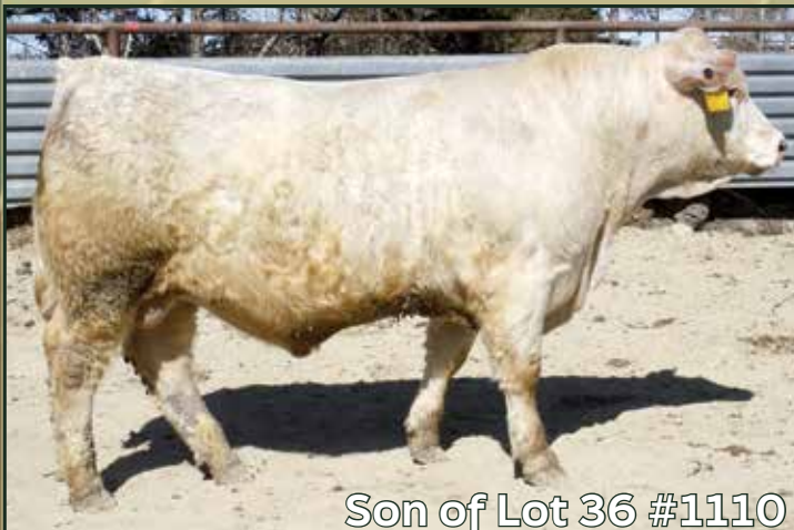
Son of Lot 36 #1110

Implanted embryo (SCR MISS CASANOVA 8152 X LT PATRIOT 4004 PLD) on 5/3/2022 and pasture exposed to R/V MARKSMAN 7548 from 5/26/2022 - 8/9/2022. We start out with a bang on these 2019 young cows. This female's first calf born 2-7-21 came in with an outstanding AWW of 757 lbs. to ratio 113 and her bull calf #2141 born 2-21-22 has a AWW of 727 lbs.