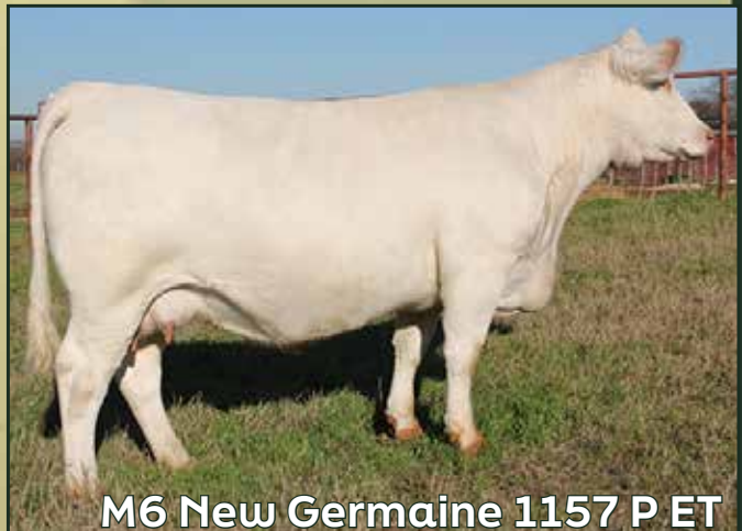
M6 New Germaine 1157 P ET Dam of Lots 33 and 34

Bred AI on 5/17/2022 to WIA BACKWATER JACK 060 P and pasture exposed to SCR AFFINITY 9104 from 6/5/2022 - 8/9/2022. Another ET out of M6 New Germaine 1157 that we owned with Brent Charolais in Kansas but we sold out to way before this sale. She aborted during ice storm on 1-15-22.