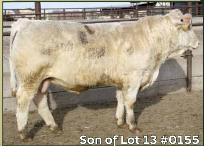
Son of Lot 13 #0155 Sold in our 2021 bull sale

This female came from Meinders Stock Farm in Iowa. She is sired by the powerful M6 New Standard 842 that produced over 1,870 progeny to date and his semen still sells for $300 plus at auction. We put an embryo in CP012 and she raised ET heifer calf Lot 15A out of the Lot 15 donor that sells.