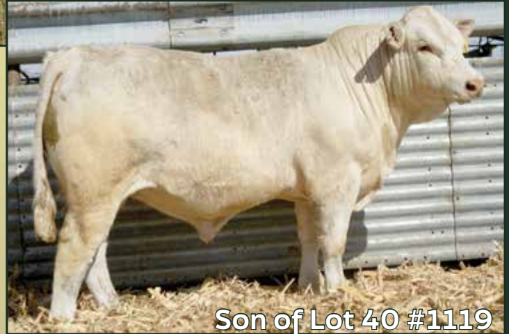
Son of Lot 40 #1119 Sold in Nebraska in our 2022 bull sale