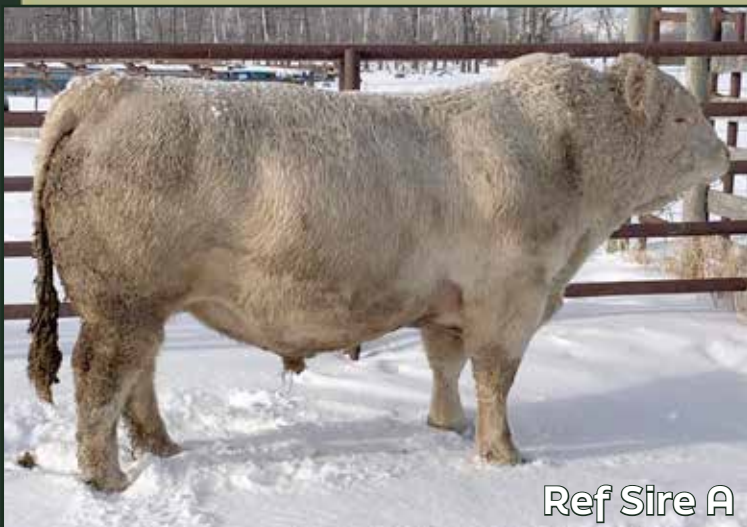
Ref Sire A