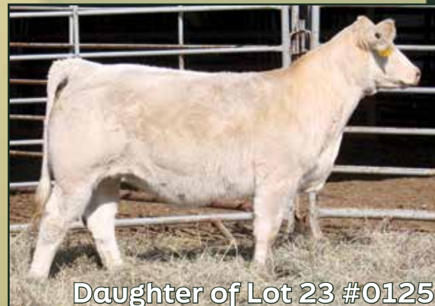
Daughter of Lot 23 #0125