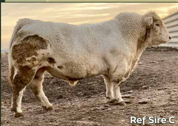
Ref Sire C