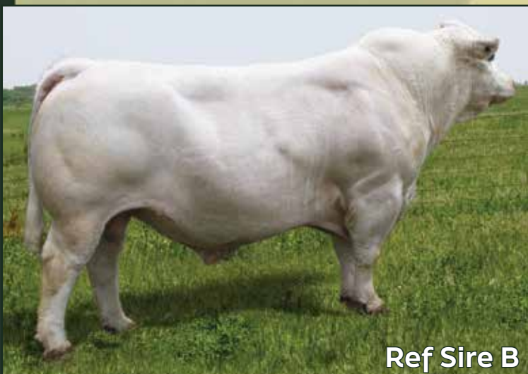
Ref Sire B