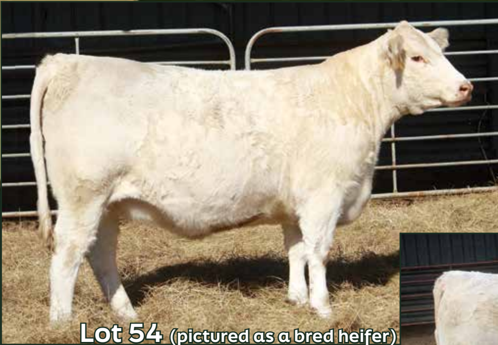
Lot 54 (pictured as a bred heifer)