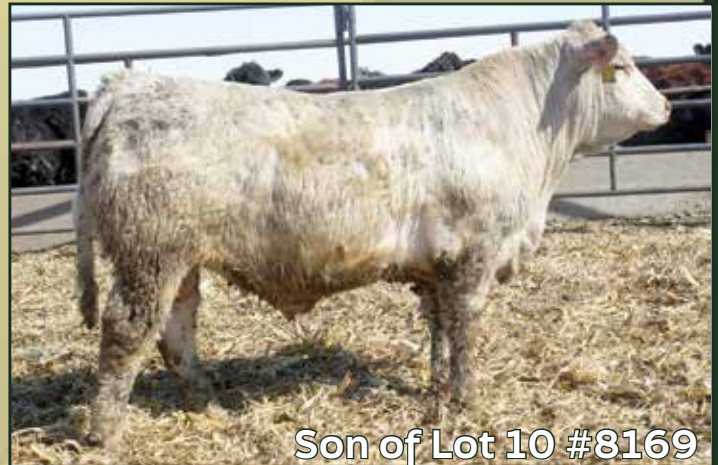
Son of Lot 10 #8169 Sold in our 2019 bull sale to Iowa

Implanted embryo (SCR MISS TRIUMPH 3137 X SCR CASANOVA 7107) on 5/3/2022 and pasture exposed to SCR AFFINITY 9104 from 5/26/2022 - 8/9/2022. This ET Tuffy daughter's dam SCR Ms Kingdom 1228 was one of our very best donor dams with 18 registered progeny. One of her sons SCR Bronco 9026 was purchased by Lindskov-Thiel & Wild Indian Acres after posting an AWW ratio of 113 and an AYW ratio of 113. He produced over 200 registered progeny across the country. One daughter of this female sells as Lot 74. We put an embryo in 4122, and she raised an ET bull calf #2136 that will sell next spring.