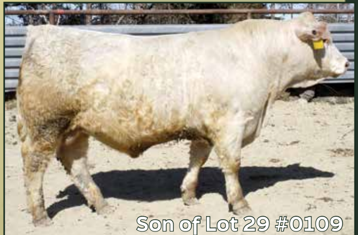
Son of Lot 29 #0109 Sold to Kansas in our 2021 bull sale