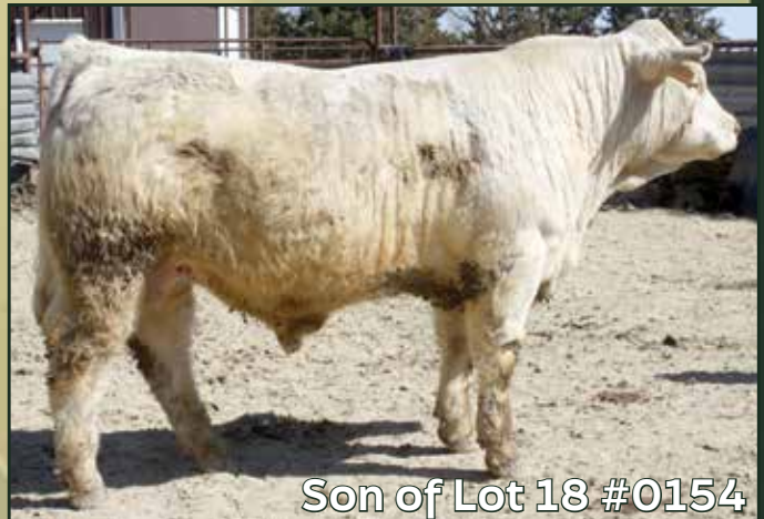
Son of Lot 18 #0154 Sold in our 2021 bull sale