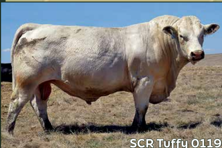
SCR Tuffy 0119 Sire of many lots selling

Another good Tuffy daughter who's first two calves started out with a bang on 2-20-16, a son that had an AWW of 723 lbs. her next another son AWW 825 lbs. and third a heifer that sells as Lot 30. Her last calf, a bull #2134 was born 2-18-22.