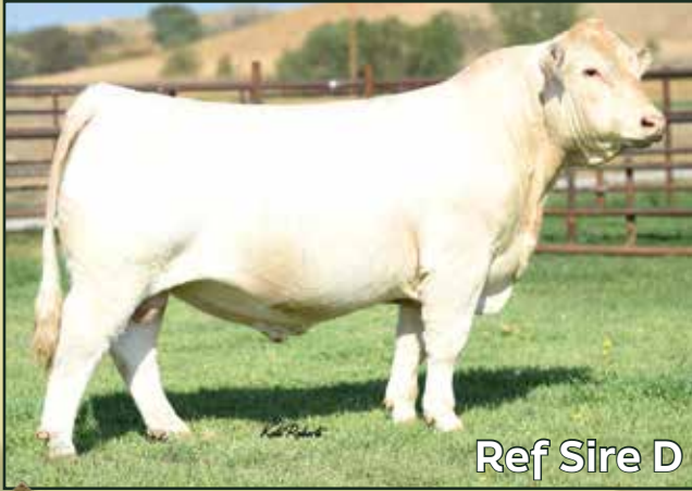
Ref Sire D