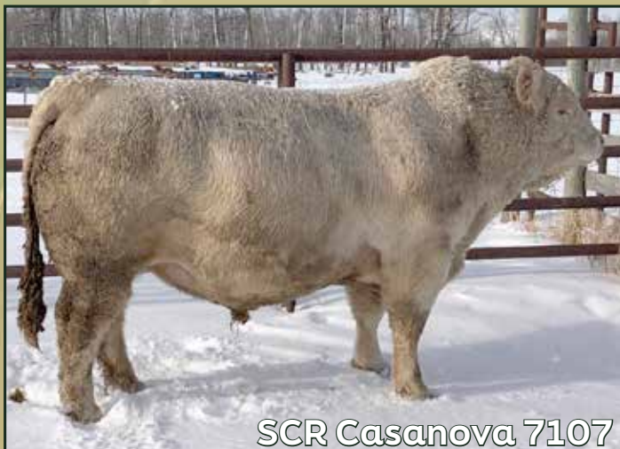
SCR Casanova 7107

Sire of Lots 40 & 41 and other lots selling