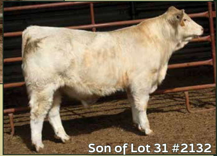
Son of Lot 31 #2132

Bred AI on 5/18/2022 to LT BADGE 9184 PLD and pasture exposed to HBC SUMMIT 1H from 6/5/2022 - 8/17/2022. Her 2020 son had an AWW of 774 lbs. to ratio 108 and her 2021 daughter sells as Lot 83. Her bull calf #2132 born 2-18-22 will have an AWW way over 800 lbs.