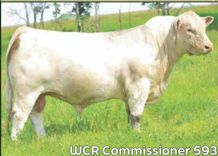
WCR Commissioner 593 Sire of Lot 1

Only to settle this partnership does the entire bull sell and full possession. Summit's sire WCR Commissioner 593 sold for $50,000 in the 2016 Wienk Charolais Ranch Bull Sale to three Canadian breeders. His dam is sired by the $125,000 WC Milestone 5223 during the Wright Charolais Bull Sale.