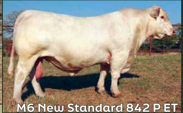
M6 New Standard 842 P ET Sire of Lot 12