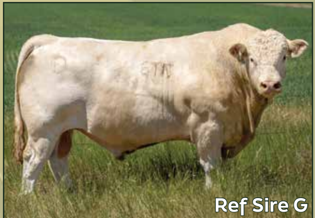
Ref Sire G