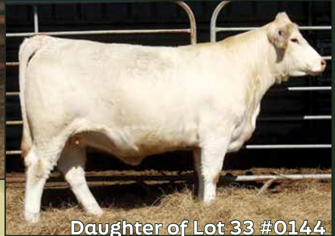
Daughter of Lot 33 #0144 Sold in our 2021 female sale