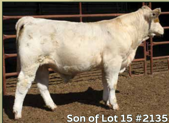
Son of Lot 15 #2135

Born: 2-21-22, AWW: 575 lbs., sired by HBC Summit 1H.