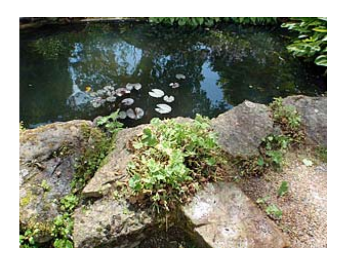
Alchemilla after cutting back

Most plants on the crevice garden have finished flowering but one or two late flowerers are performing. First of these is the often short-lived Gentiana saxosa . This often grows in sand in the wild so has found itself quite at home in the sand of our crevices: