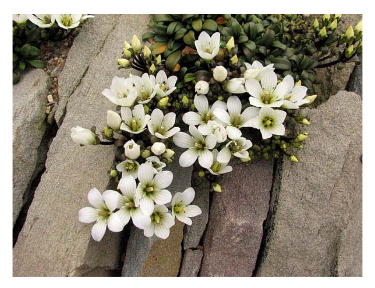
The first of the autumn-flowering gentians has just opened. This is Gentiana farreri 'Silken Star' group: