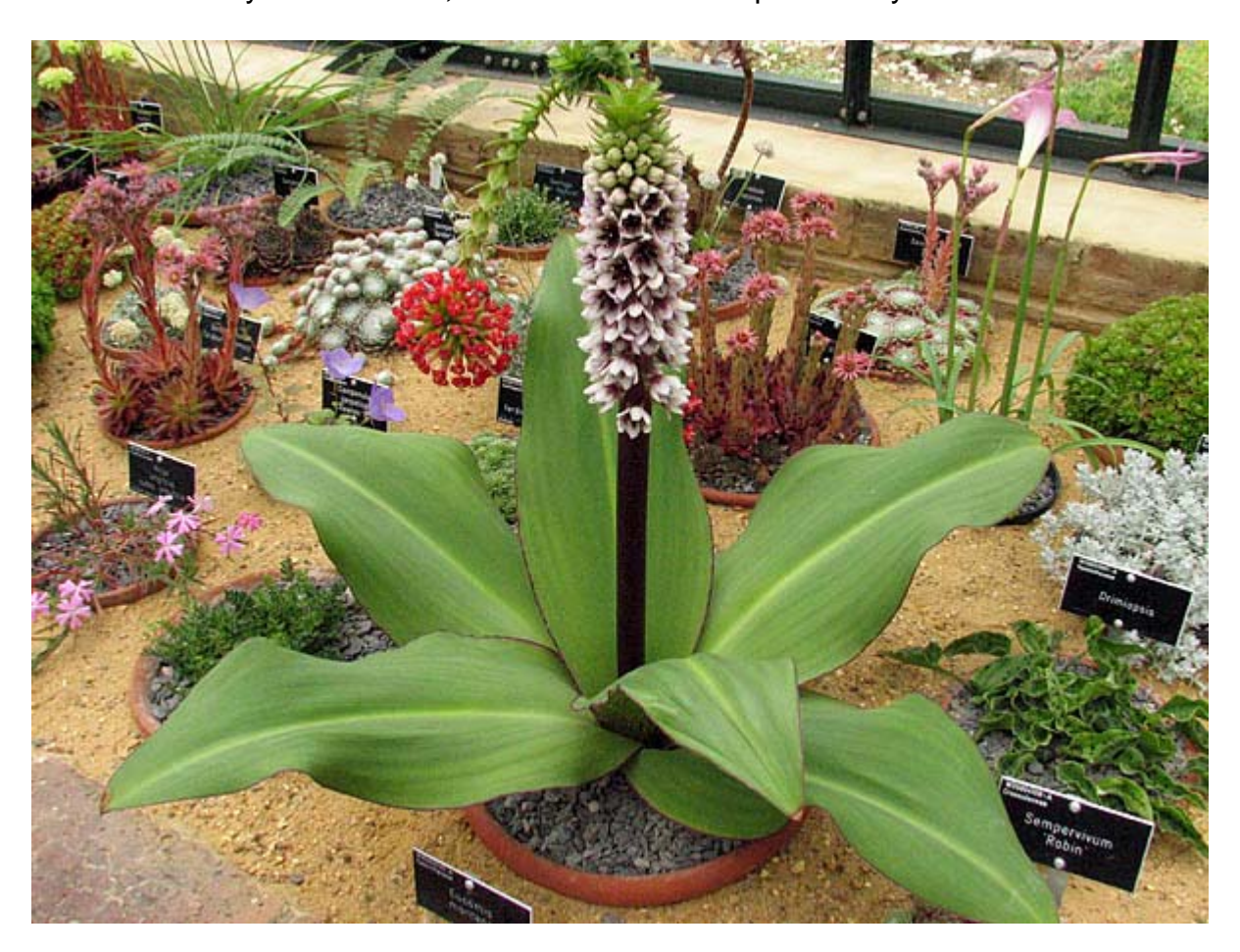
Here is a close up of the flowers: