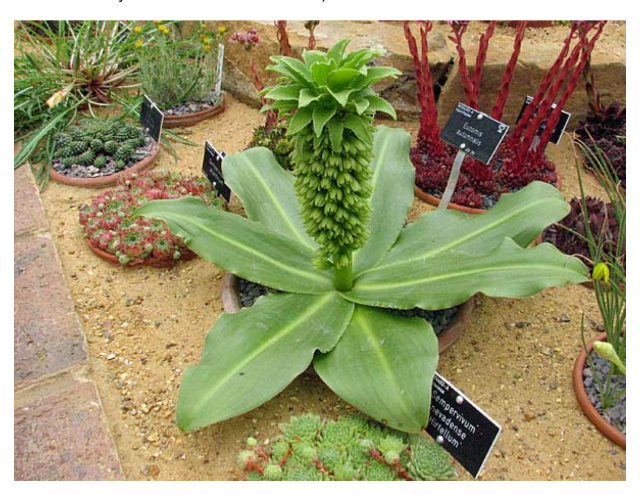
Its smaller cousin, with slightly narrower leaves and more outward facing flowers, is Eucomis autumnalis ssp. amaryllidifolia

Also in the house now are some Eucomis . This is Eucomis autumnalis (I'm not sure why it is called this as it always flowers in summer for us!):