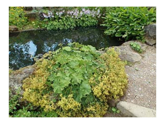
Alchemilla before cutting back

Alchemilla mollis grows all over the rock garden and while useful in places it can be an aggressive invader, seeding everywhere. As a result, we remove a lot each year. In places where we still want it, we cut it back after flowering to stop further seeding. David took these shots of such a clump: