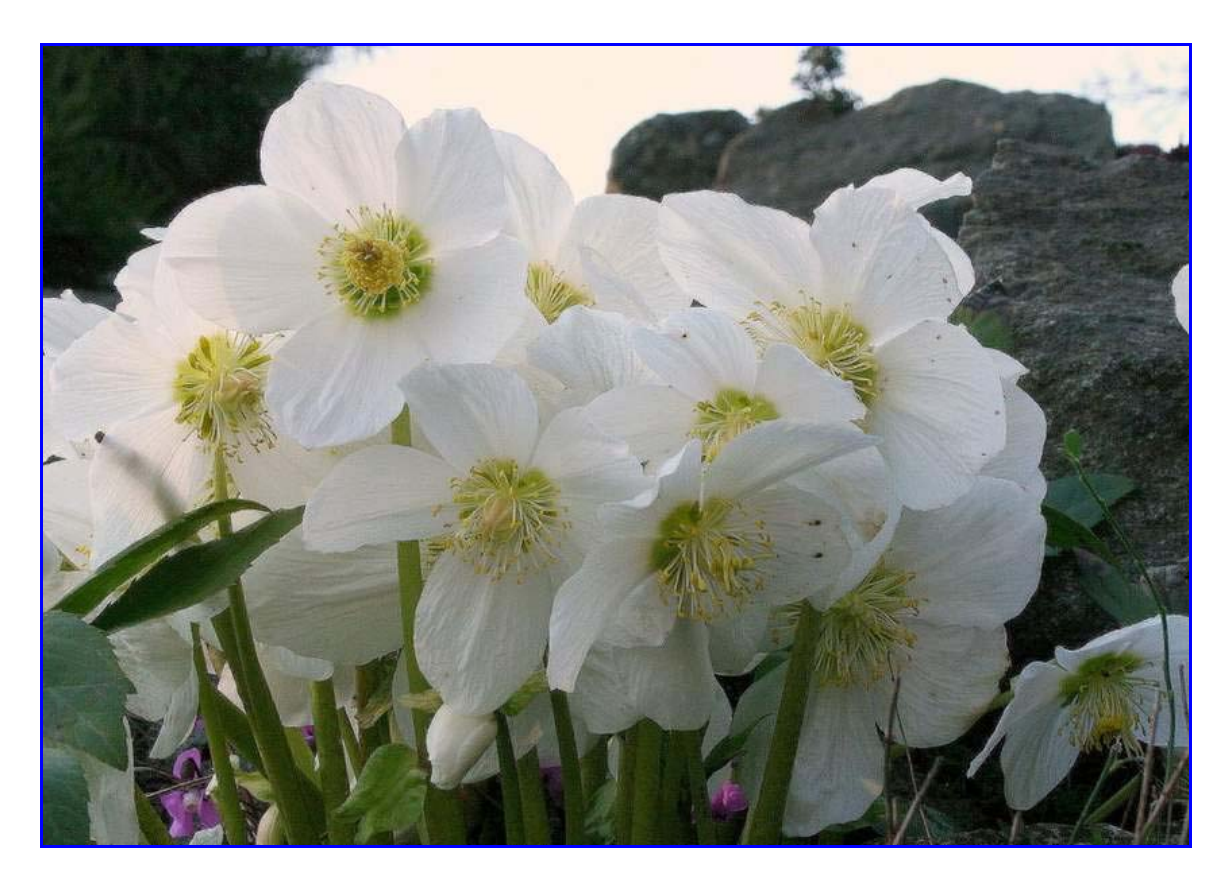
Helleborus niger- old cultivar with large 'Potter Wheel' flowers