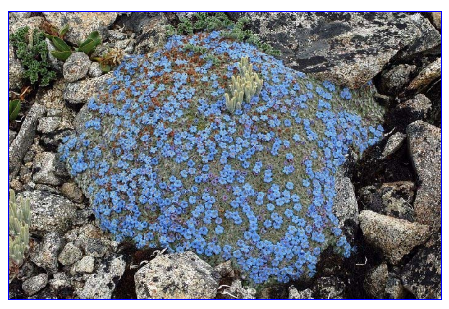
Chionocharis hookeri Harry Jans

The flowering time is in June/July, depending on the amount of snow during winter. The flowers are Eritrichium blue and fade to a dirty pink when they get older.