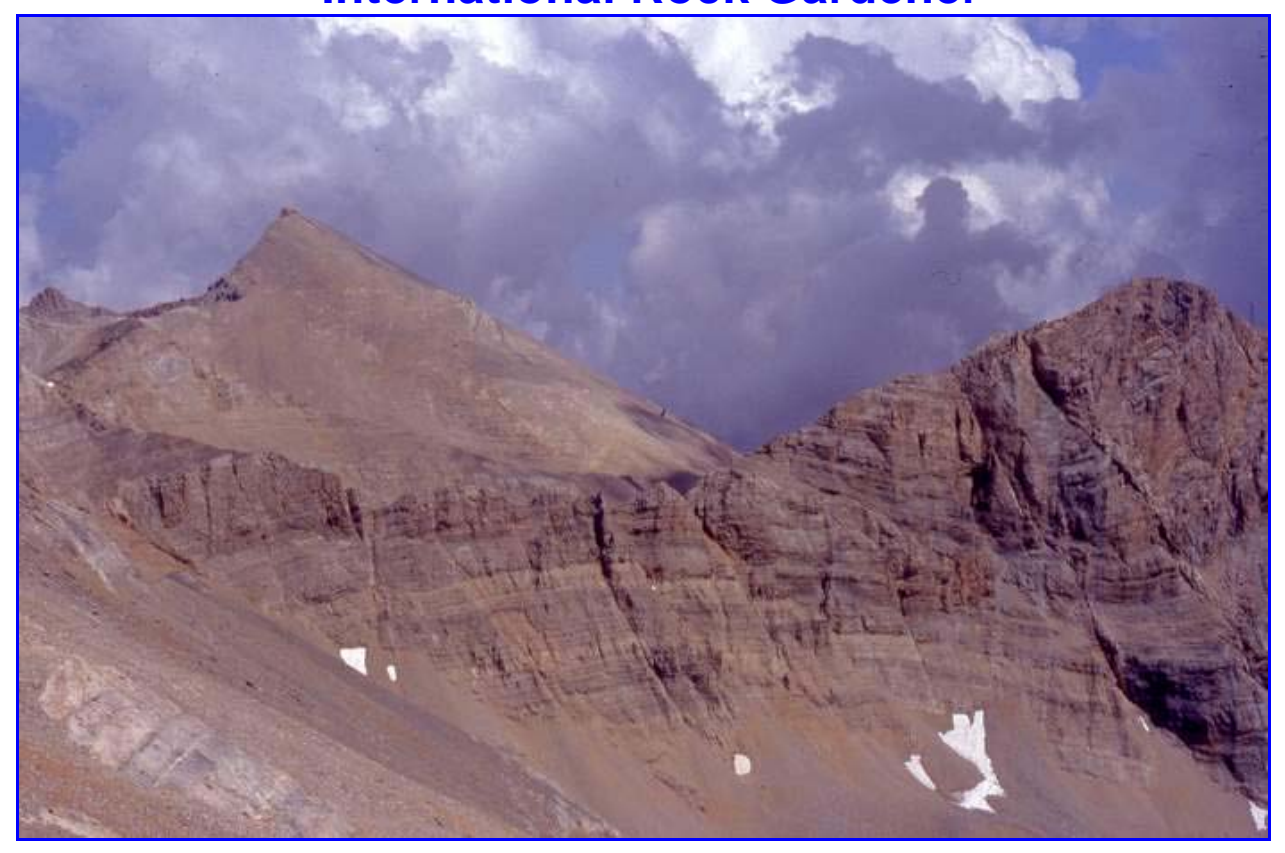
Mt.Medetsiz, highest peak of the Bolkar Dag