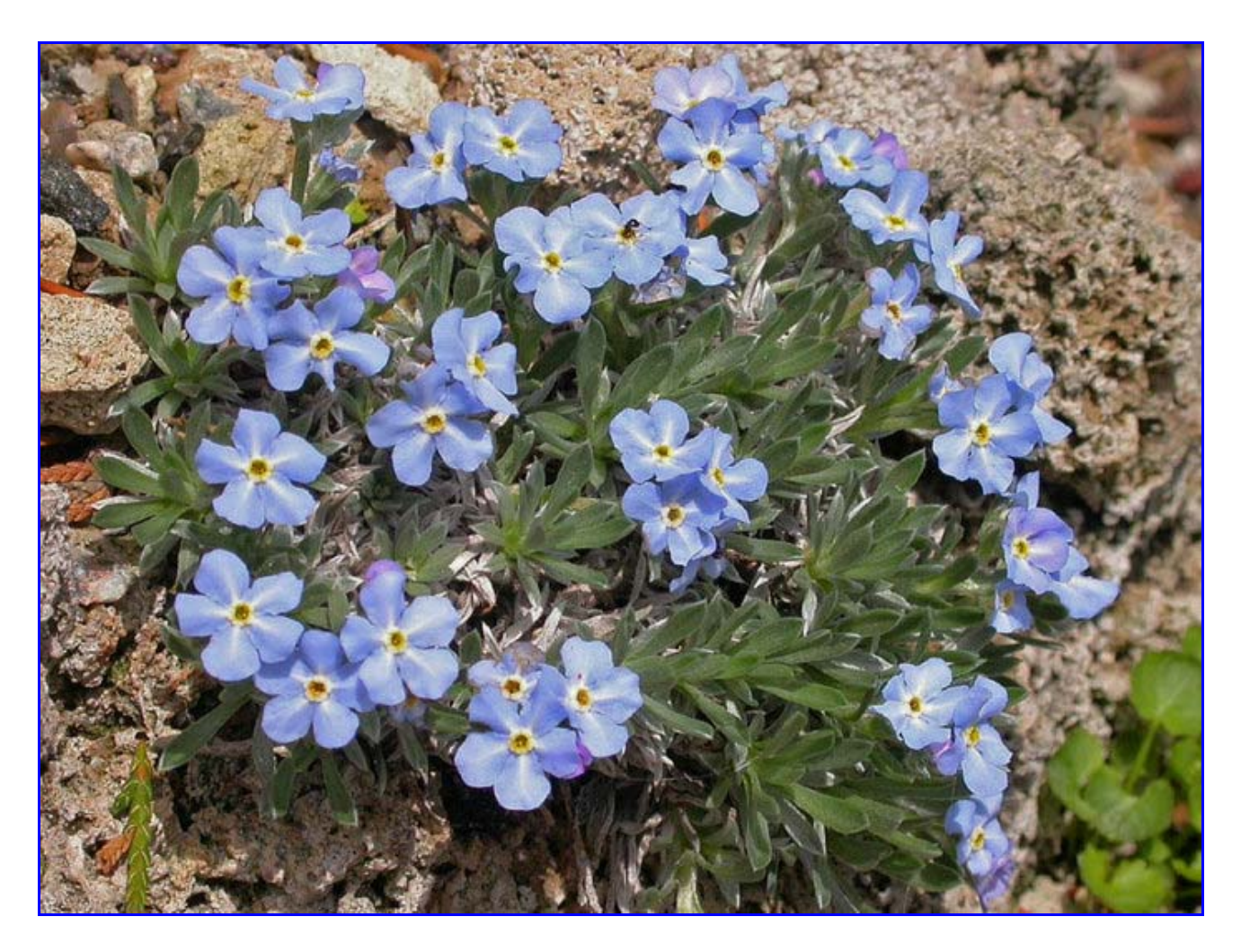
Eritrichium howardii Blue Sky