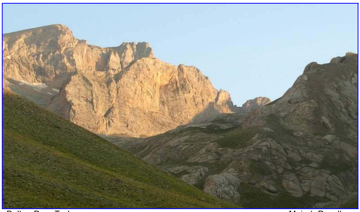
Bolkar Dag, Turkey

Happy 8 year old plants, each with 10-15 flowers, grow in Mojmír Pavelka's scree which has a 30 cm thick mixture of farm soil, crushed stone and 2-5 cm stones from a quarry. The plants have a few thick roots like Gentiana septemfida and they do not need protection in our continental winters. This is a small gentian with a neat habit, flowering in June even August in the UK and perfect for troughs placed in a cool position.