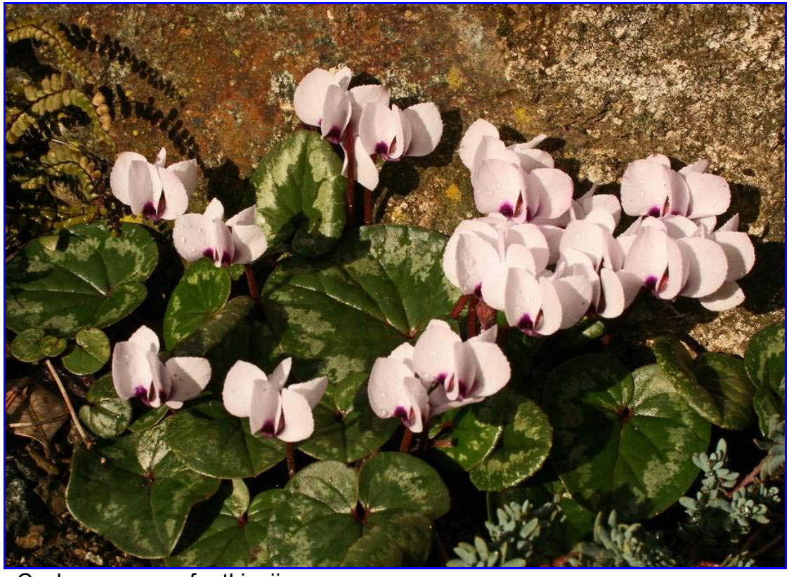
Cyclamen coum f. atkinsii

Mindful of our local conditions, we specialise in those plants which need watering only while they are becoming established; after that we don't give them artificial water. Zdenek, with help of Joyce, will inform you all year round about our rock garden plants.