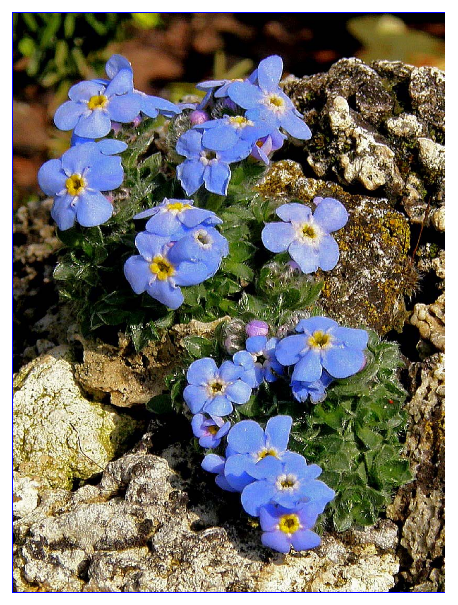
Eritrichium cushion in tufa rock