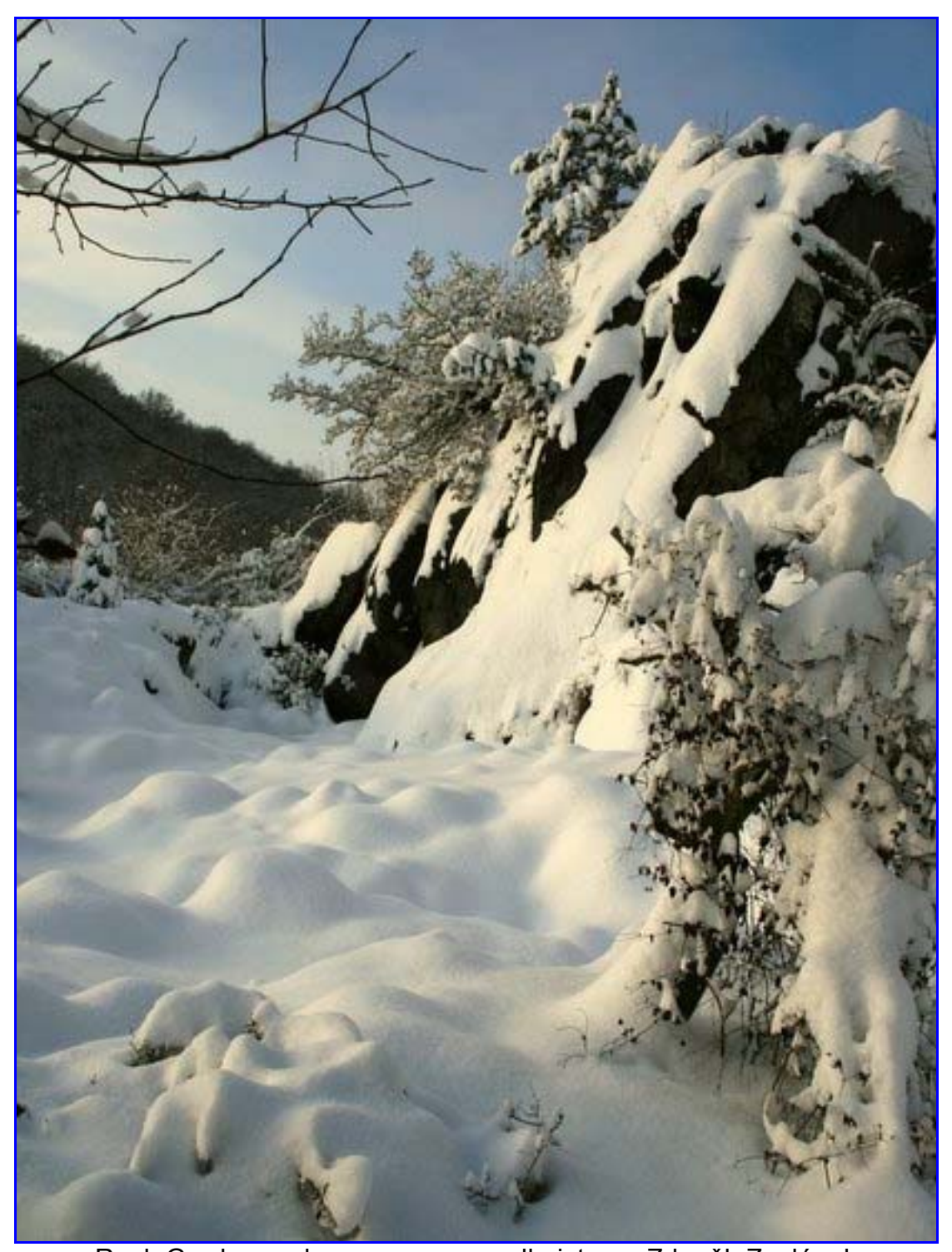
Rock Garden under snow cover

The Beauty Slope is local name for steep southern facing terrain south of Prague. In one part there was an ancient vineyard owned by monks, and in one corner the monks also had a quarry for dolerite, a fine-grained igneous rock. This corner is rented from the "Czech Forests" enterprise by Joyce Carruthers and Zdenek Zvolánek who maintain a quite extensive rock garden here.