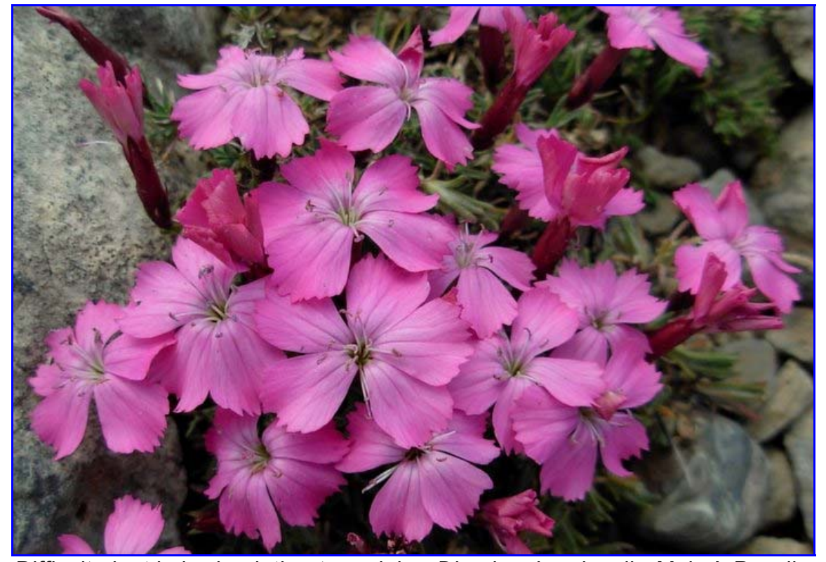
Difficult plant in lowland, the true alpine Dianthus brevicaulis Mojmír Pavelka

Higher, there was only Dianthus brevicaulis and Draba acaulis . In August 2008 he visited a more well known locality above Black Lake (Kara Gol) at 2800 m where you can see this species in three different habitats: northern slope with mineral slightly limy soil, southern slope in an association with grasses and at the banks of small brook (dry in summer) with primulas. Because of the dry season, flowers here were a paler blue. In normal conditions stems are about 5 cm long and their blue-purple flowers are 3-5cm long. Similar to all high mountains, Bolkar Dag covers itself every afternoon in clouds and the nights here are close to frost. This is the reason that the plant does not like baking in our lowland gardens.