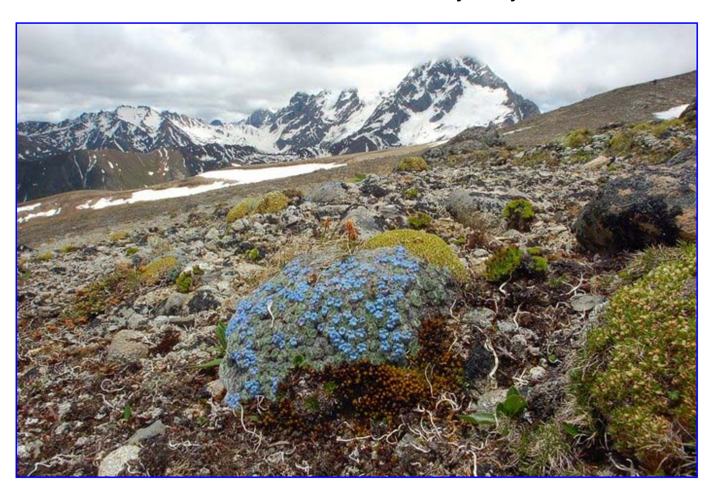
Chionocharis hookeri is sometimes called the Himalayan Eritrichium and is the only species in the genus and a member of the family Boraginaceae.