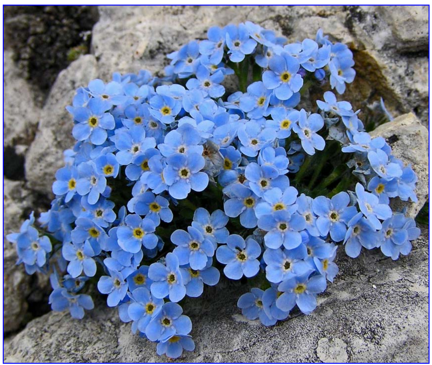
Eritrichiun nanum at Passo Rolle