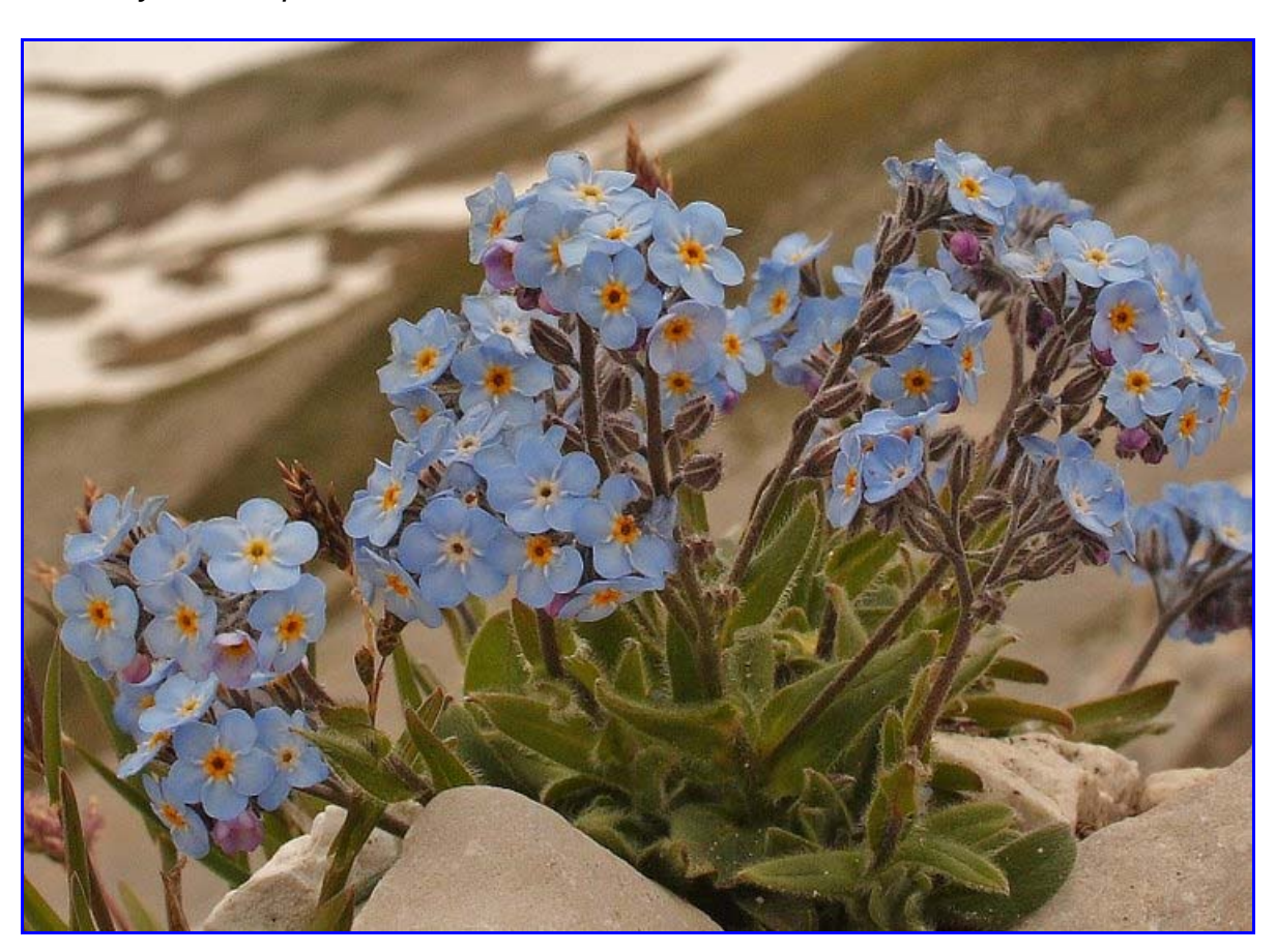
Myosotis alpestris in Gran Sasso, Italy