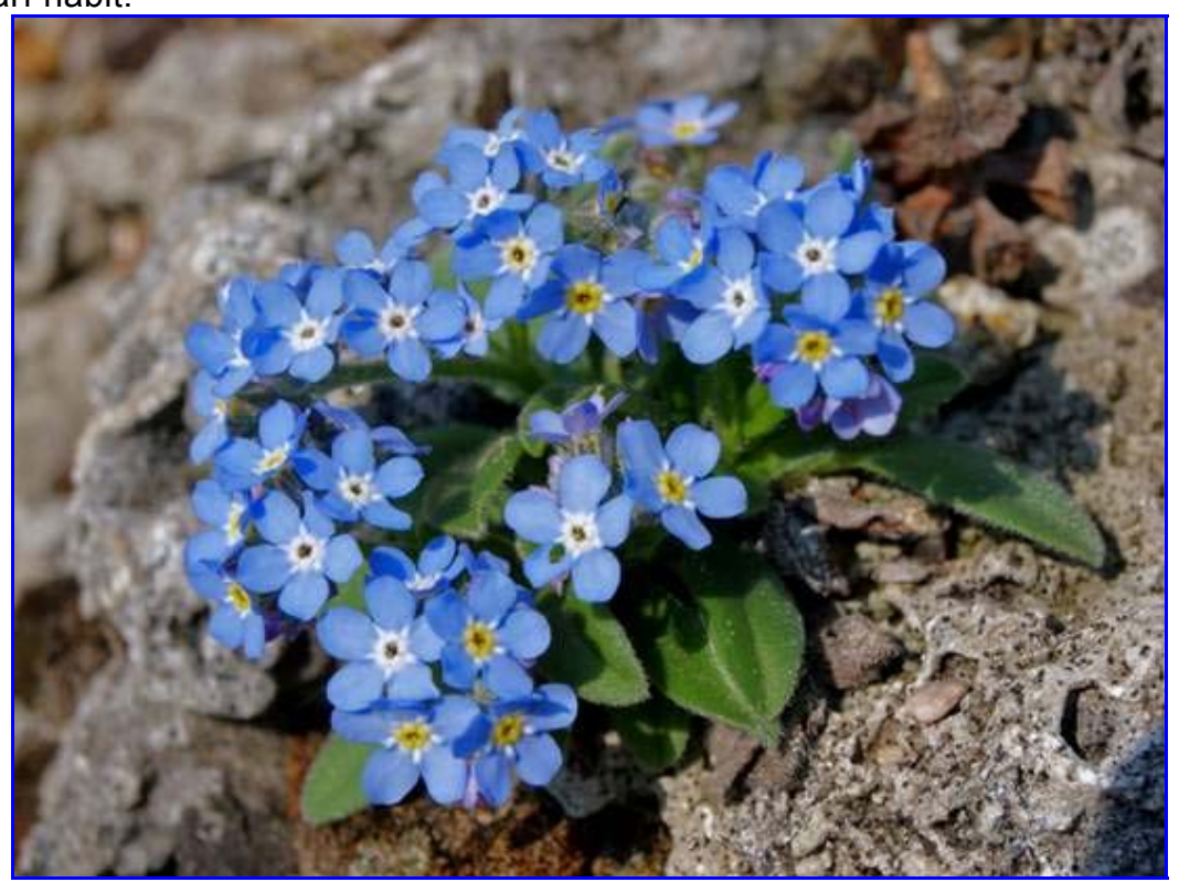
Myosotis alpestris in tufa

Ten years ago Zdenek Rehacek from the highland of Eastern Bohemia, selected one seedling of Myosotis alpestris and planted it into hole in tufa stone. Now this selected plant is stemless and up to 3 cm tall and 8 cm in diameter, looking similar to some Eritrichium. Fortunately, seedlings keep this same dwarf habit.