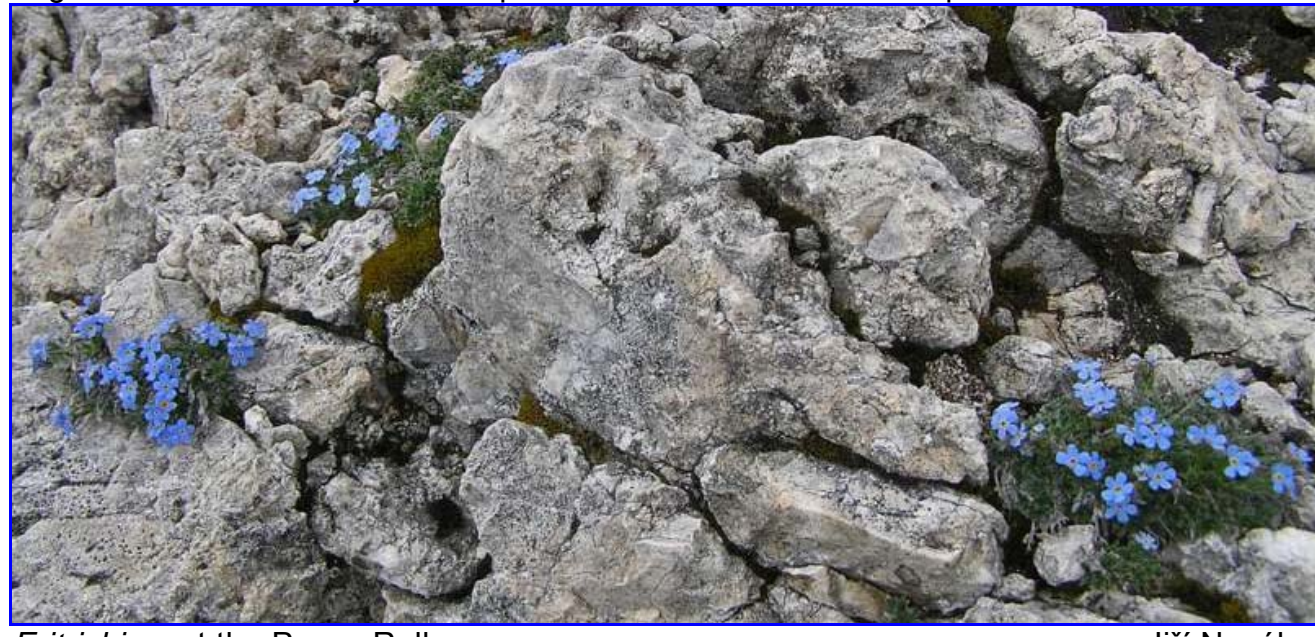
Eritrichium at the Passo Rolle

Jiří Novák gardens in the lowland of Eastern Bohemia. His Eritrichium nanum is a rooted sample from Passo Rolle. He has grown two cuttings in tufa for 4 years in north-eastern exposure in his rock garden; the stone is shaded with green net during hot summer days. A cover with a sheet of glass is given in winter. Last year both plant formed one cushion and produced 20 flowers.