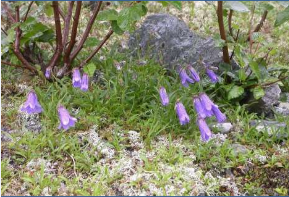
Campanula dasyantha M.Bieb.