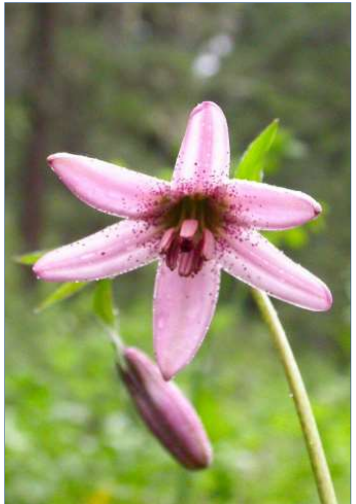
Lilium martagon var. pilosiusculum Freyn