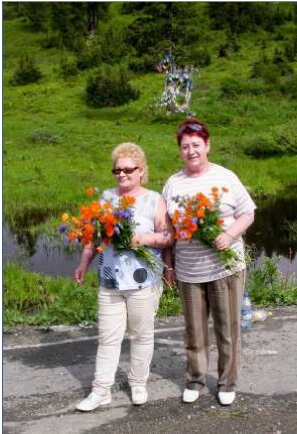
Tourists picking flowers