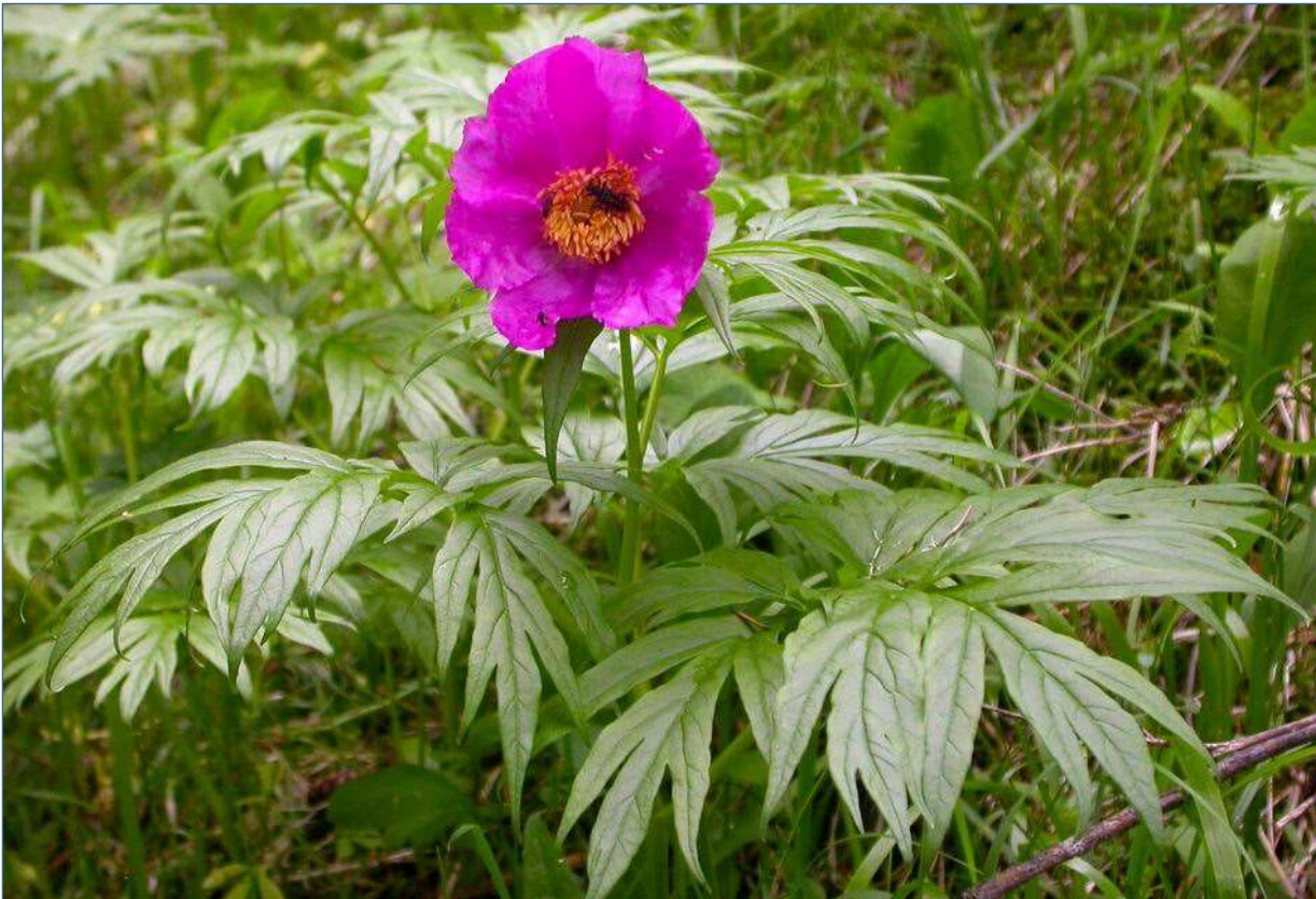
Paeonia anomala L.