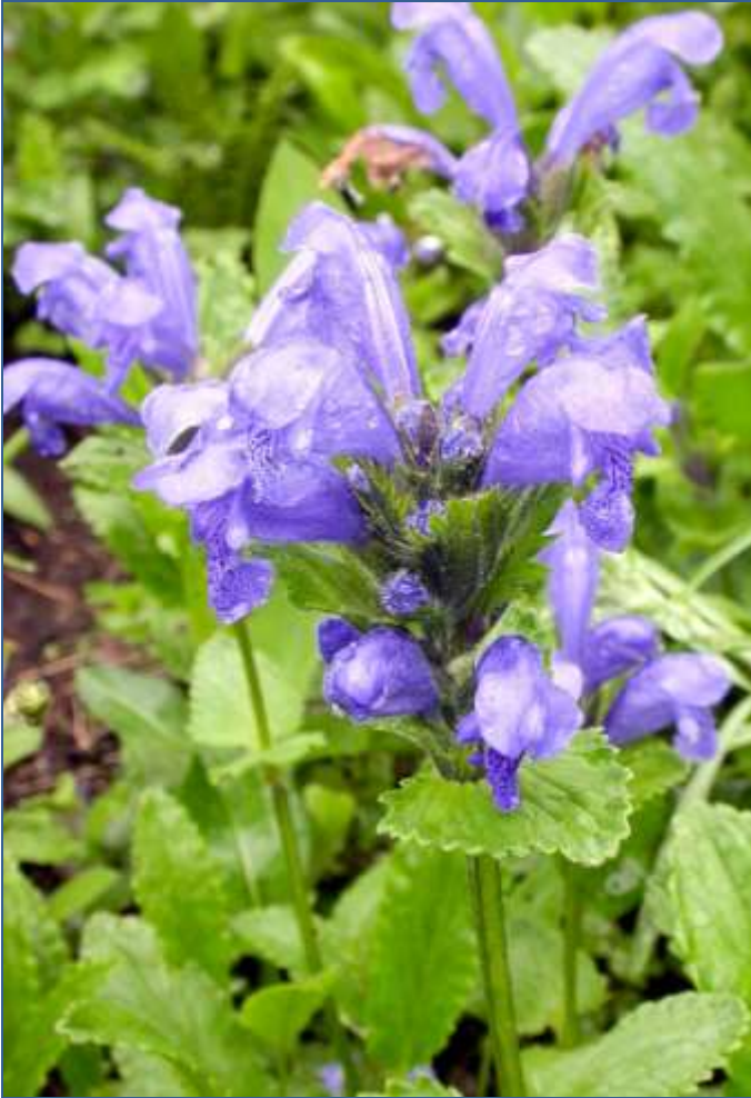
Dracocephalum grandiflorum L.