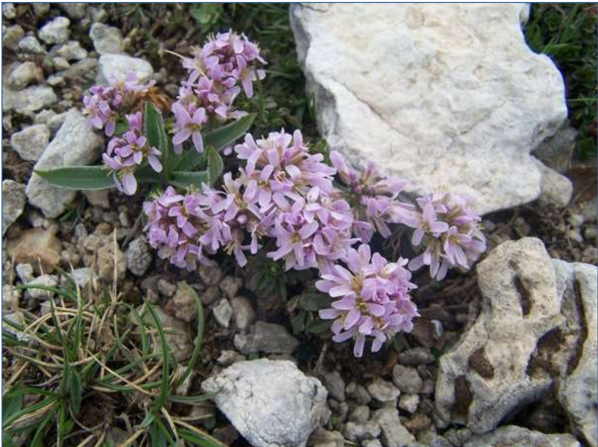
This is the local pale form of Thlaspi bellidifolium