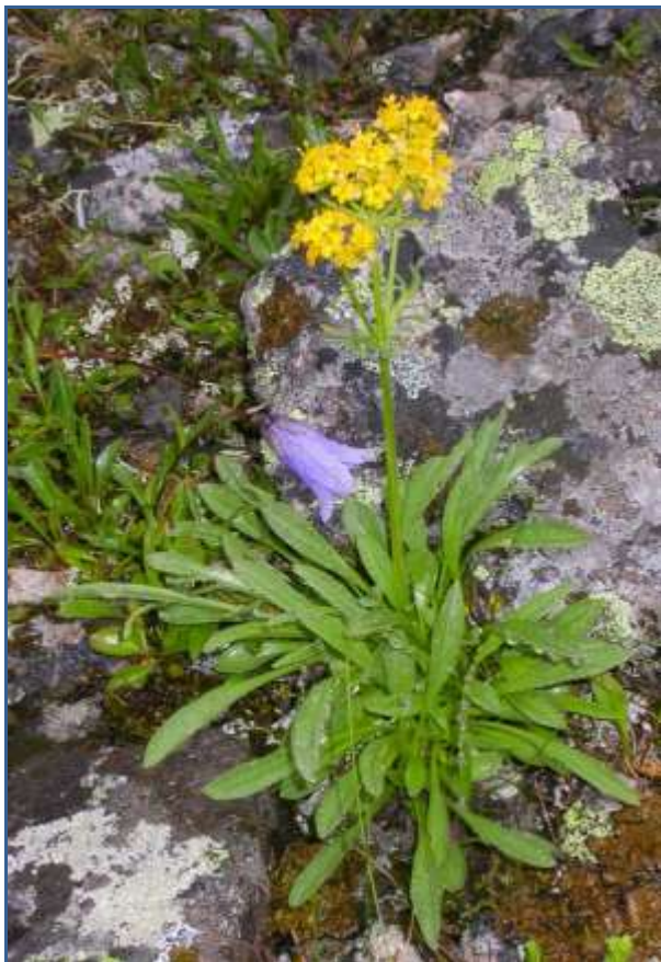
Patrinia sibirica (L.) Juss.