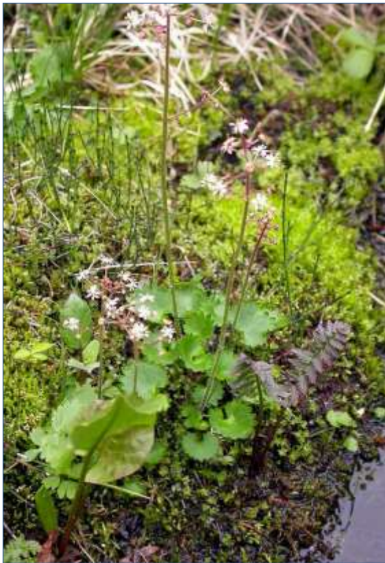
Left above: Saxifraga nelsoniana subsp. aestivalis (Fisch. & C.A.Mey.) D.A.Webb