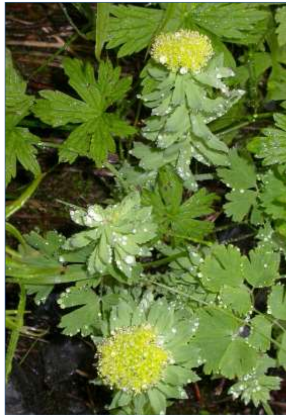
Right above: Sedum roseum (L.) Scop.