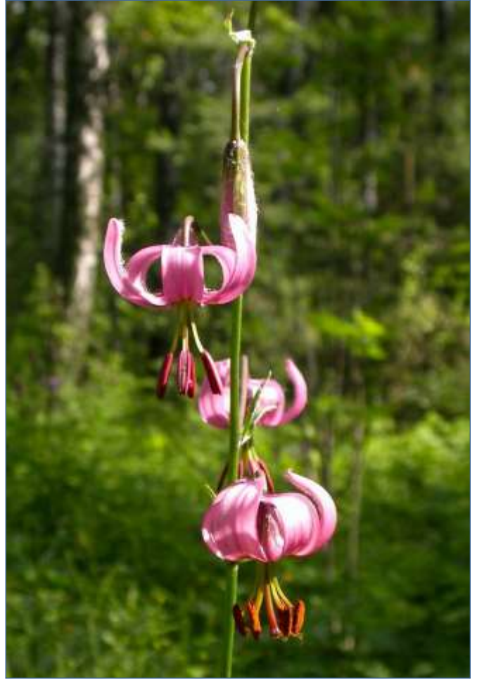
Lilium martagon var. pilosiusculum Freyn