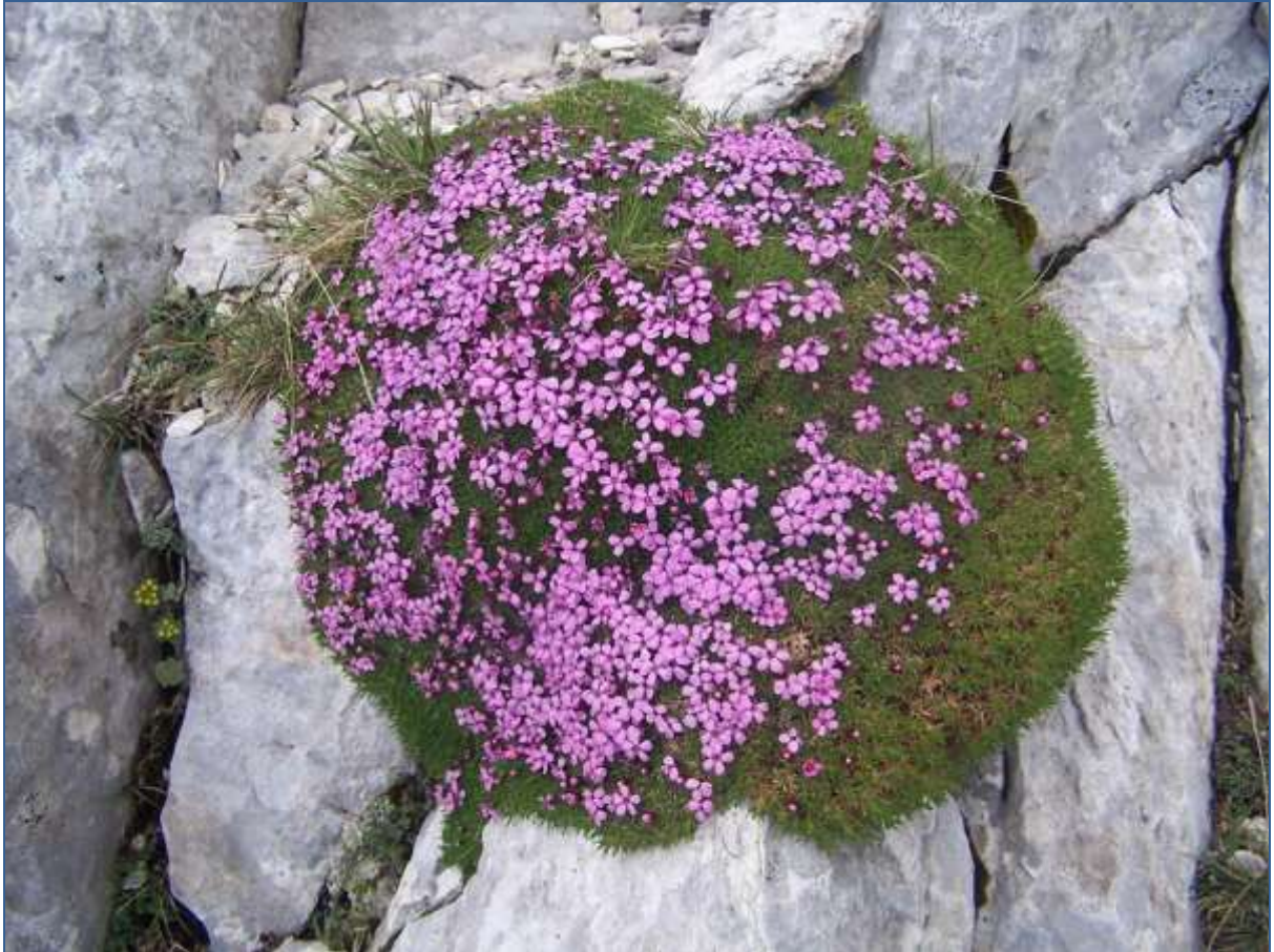
Silene acaulis is an international alpine, better above tree line than in garden.