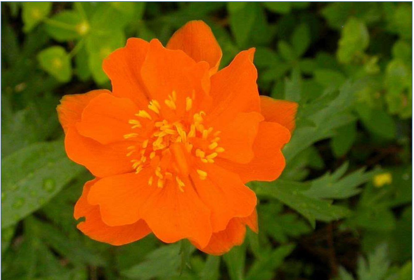
Trollius vitalii Stepanov