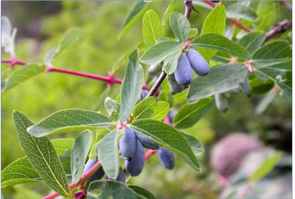
Lonicera caerulea subsp. altaica - in fruit.