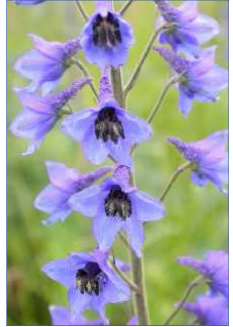
Delphinium elatum L.