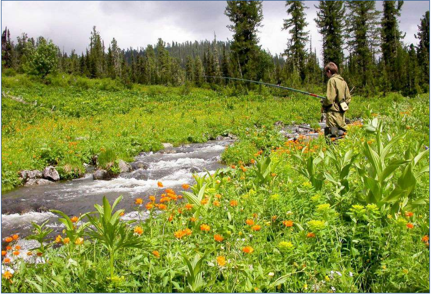
There can be little doubt that Trollius were abundant in the area at that time.