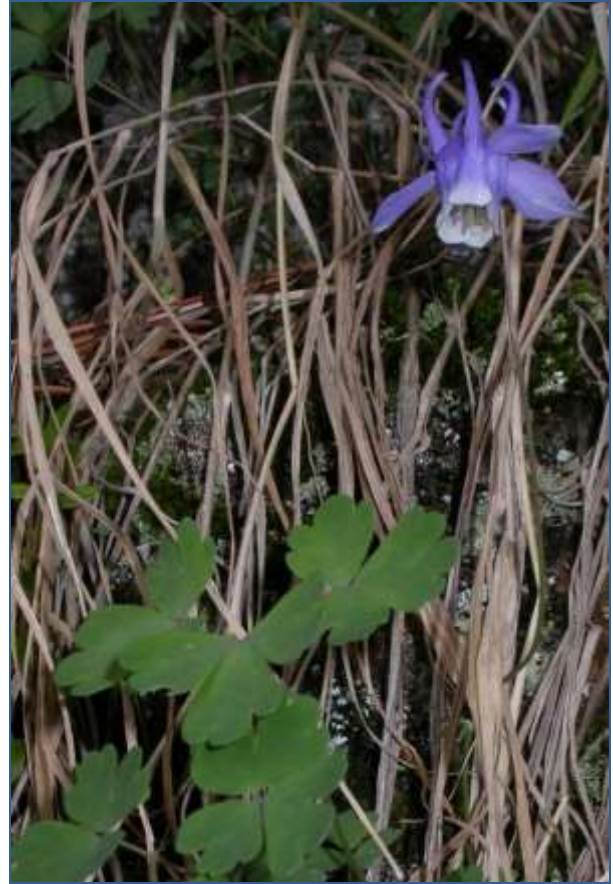
Aquilegia borodinii Schischk.