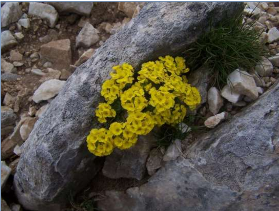
Alyssum cuneifolium var. pirinicum

ZZ: I think that Alyssum cuneifolium var. pirinicum , Daphne velenovskyi and most other alpine plants from the area do not like stronger limestone substrates having neutral soil and plenty neutral rain water.