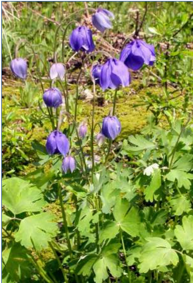
Aquilegia glandulosa Fisch. ex Link.