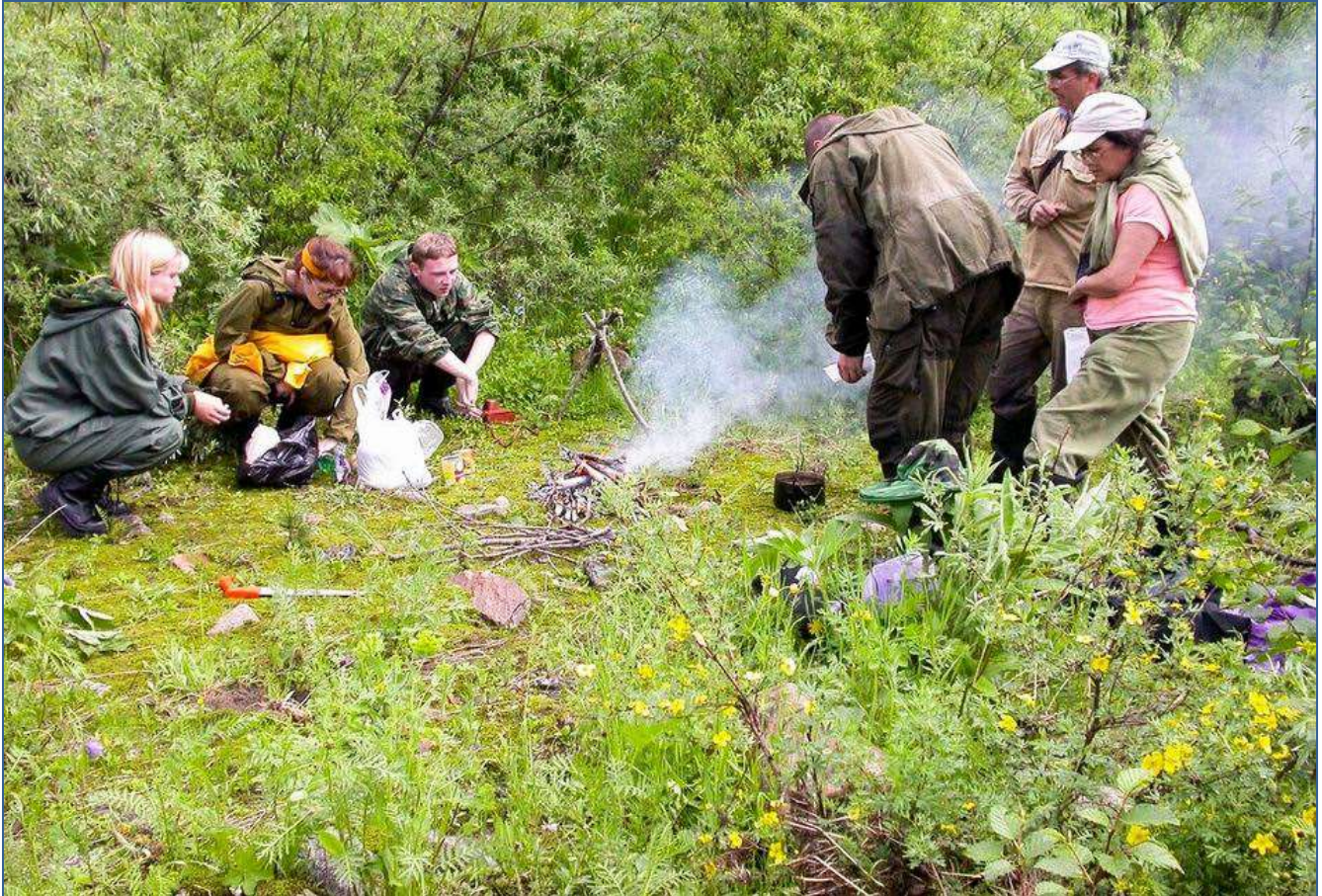
Preparing tea. Dasiphora fruticosa (L.) Rydb. is in the foreground.