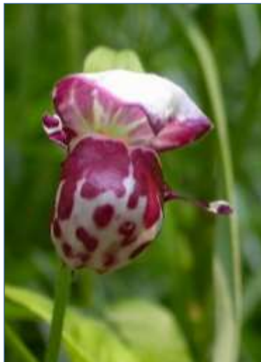
Cypripedium guttatum Sw.