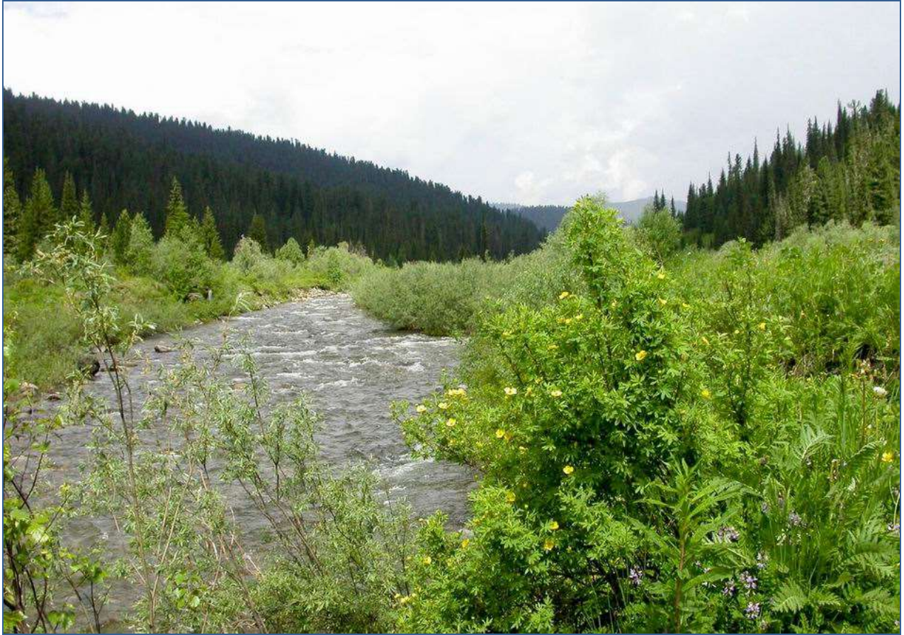
Dasiphora fruticosa by the river.