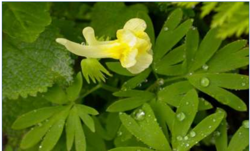
Corydalis bracteata (Steph. ex Willd.) Pers.