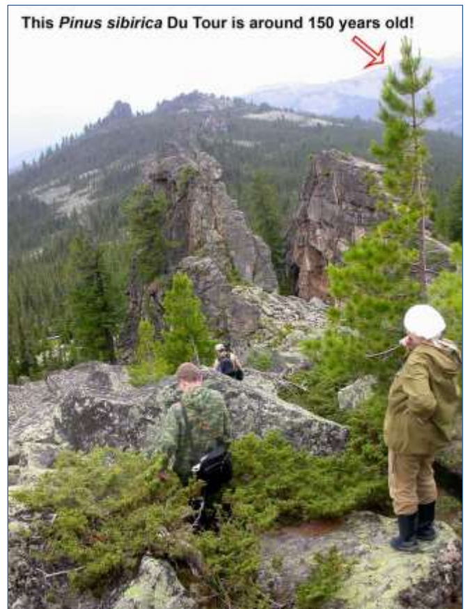
This Pinus sibirica Du Tour is around 150 years old!