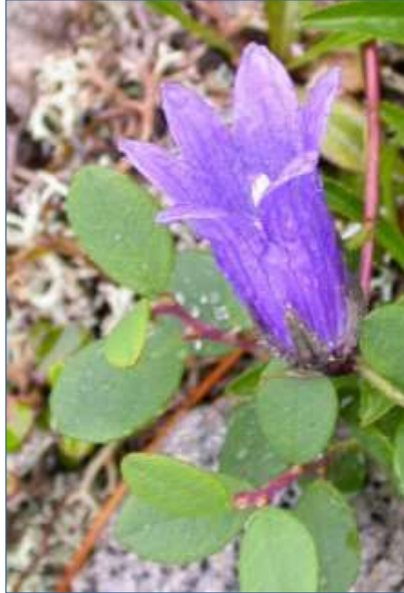
Far left: Callianthemum sajanense (Regel) Witasek Left: Campanula dasyantha M.Bieb. Below: Clematis alpina subsp. sibirica (L.) Kuntze.