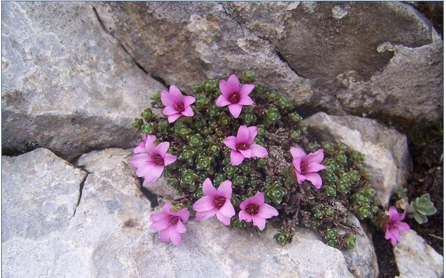
Saxifraga oppositifolia on Mt. Vichren often has six petals.