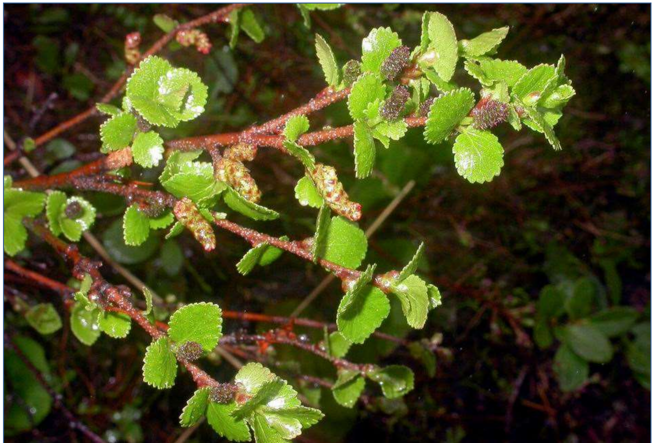
Betula divaricata Ledeb