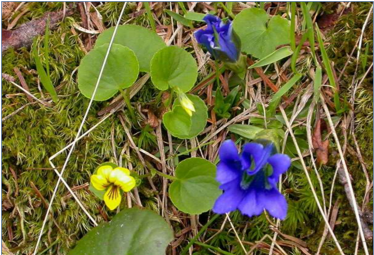
Viola uniflora L. with Gentiana grandiflora Laxm.