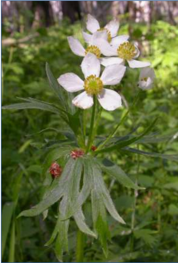
Anemonastrum crinitum (Juz.) Holub.