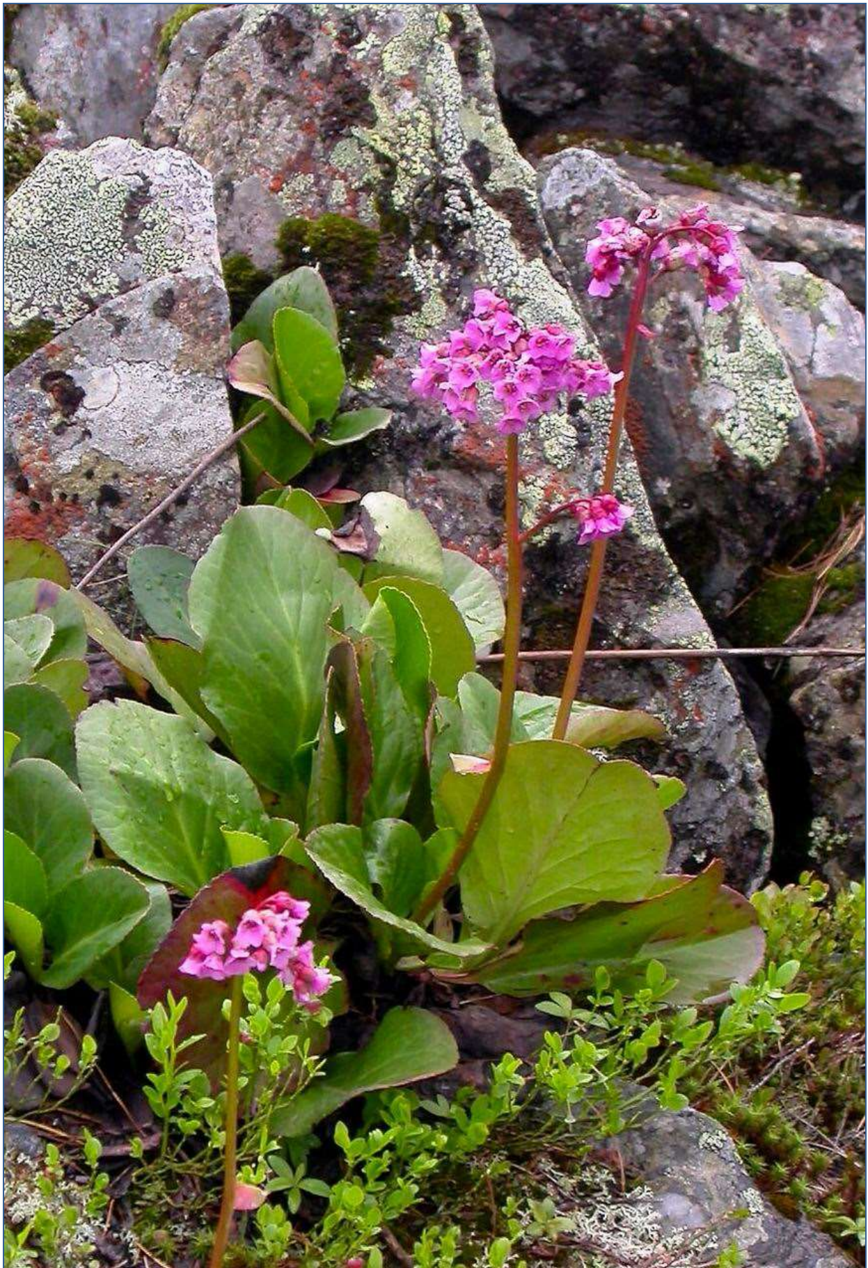
Bergenia crassifolia (L.) Fritsch