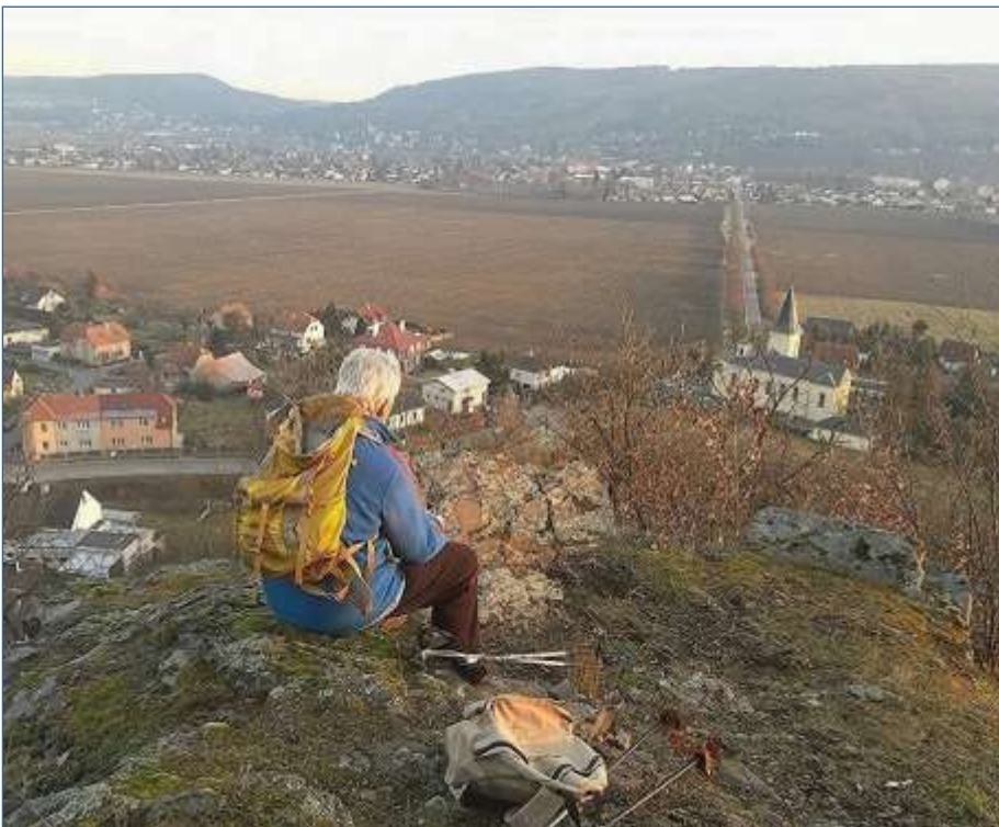
Photo by Zdena Kosourová from 28 th December 2017 of ZZ enjoying the view after a small hike to at the highest cliff above the village of Karlík, and just above their garden, the Beauty Slope.

Comment from ZZ: My first claiming of Mt. Vichren (Vihren) was in 1975. I went slowly from this Southern saddle, Kabata, smoking cigarettes and looking for colour varieties of Saxifraga oppositifolia . The last attempt was in 2009 with Joyce Carruthers, when strong July rain turned us back, both cold and very wet.