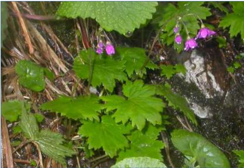
Cortusa matthioli subsp. altaica (Losinsk.) Korobkov.