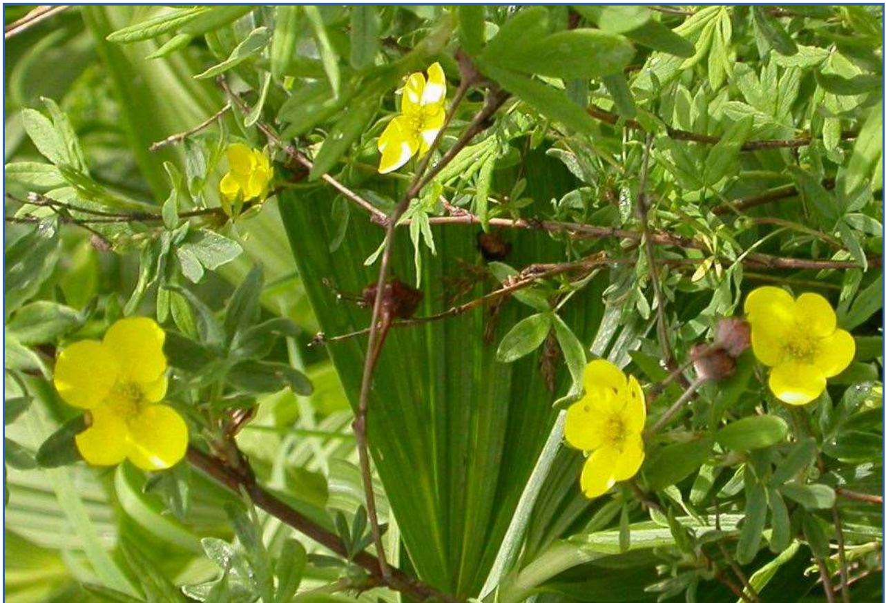
Dasiphora fruticosa (L.) Rydb. – previously Potentilla fruticosa (L.)