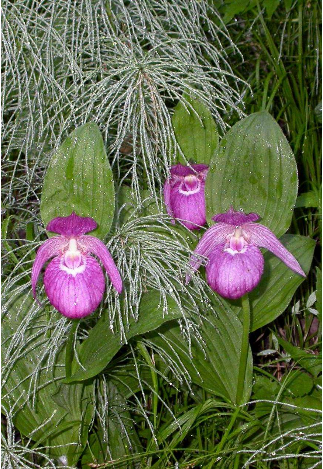
Cypripedium macranthos Sw.