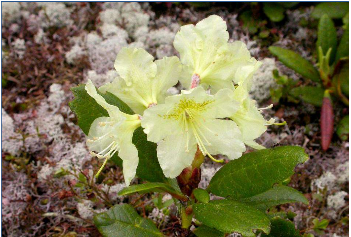
Rhododendron aureum Georgi