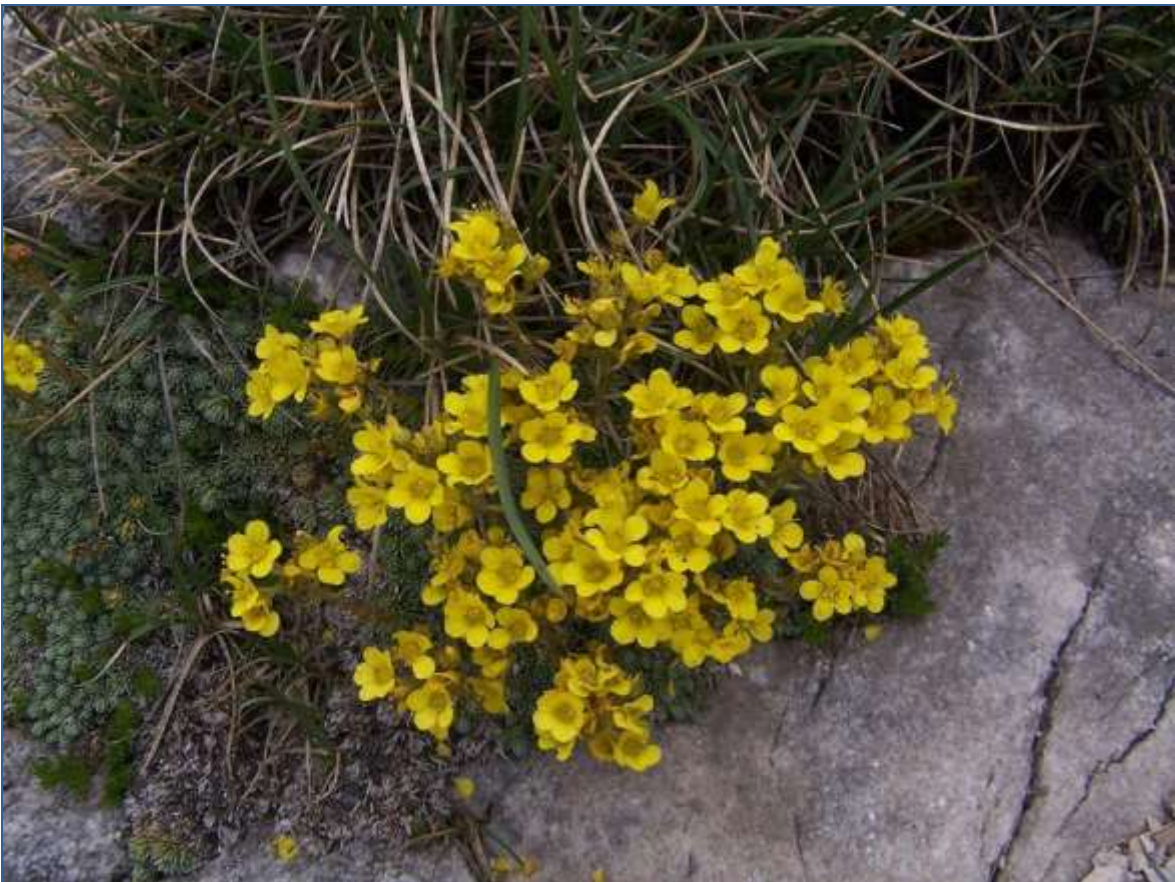
Saxifraga ferdinandi-coburgi - This easy Saxifraga is also named after the flamboyant Bulgarian Tsar, Ferdinand Saxe-Coburg-Gotha.