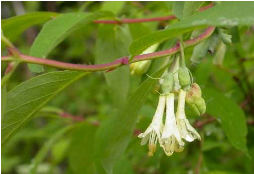
Lonicera caerulea subsp. altaica (Pall.) Gladkova