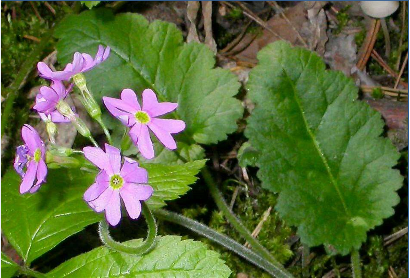
Primula cortusoides L.