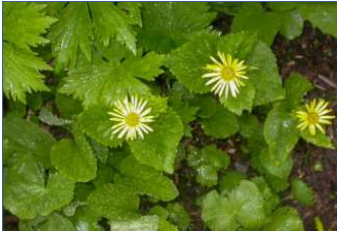
Doronicum altaicum Pall.