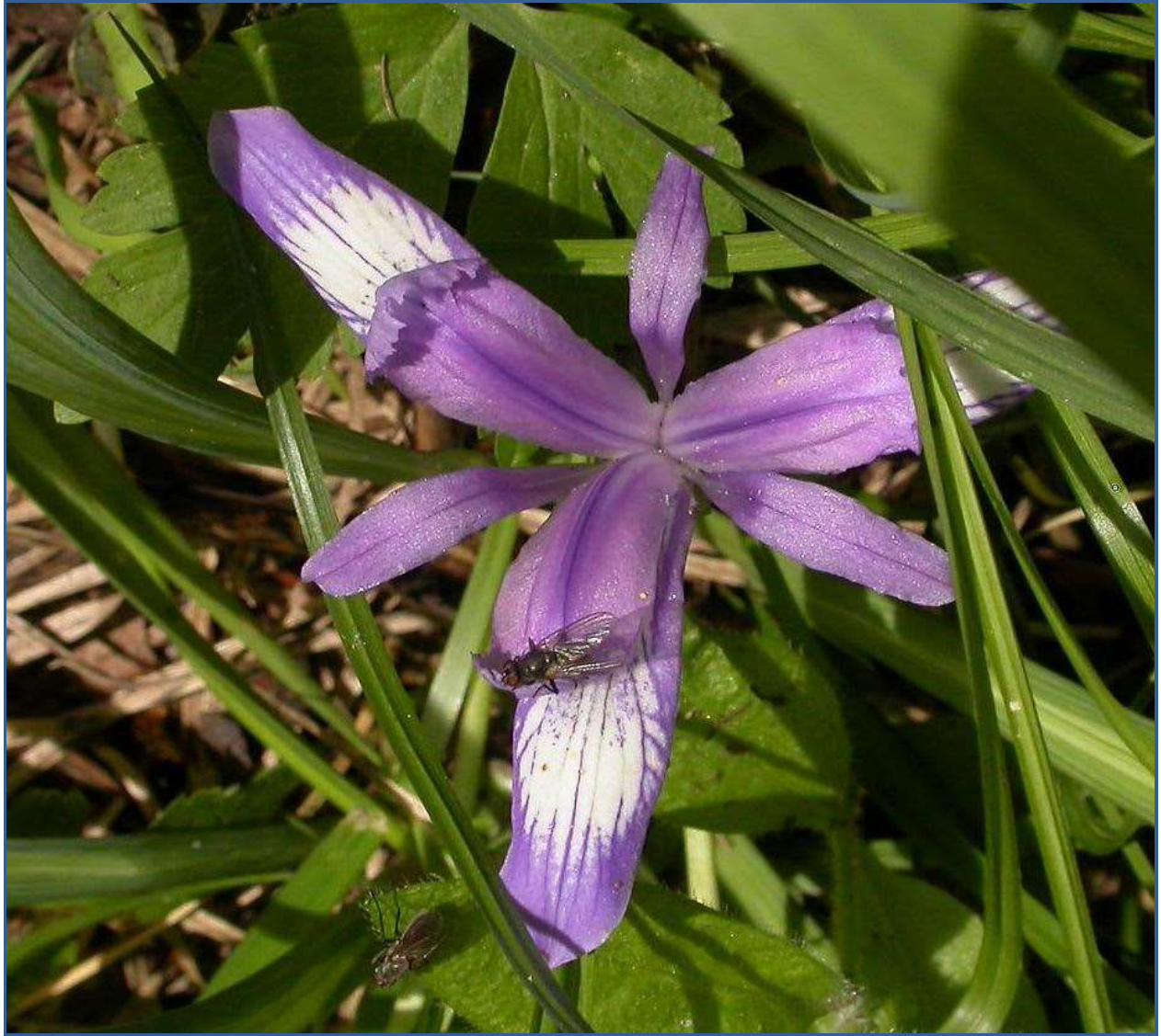
Iris ruthenica Ker Gawl.