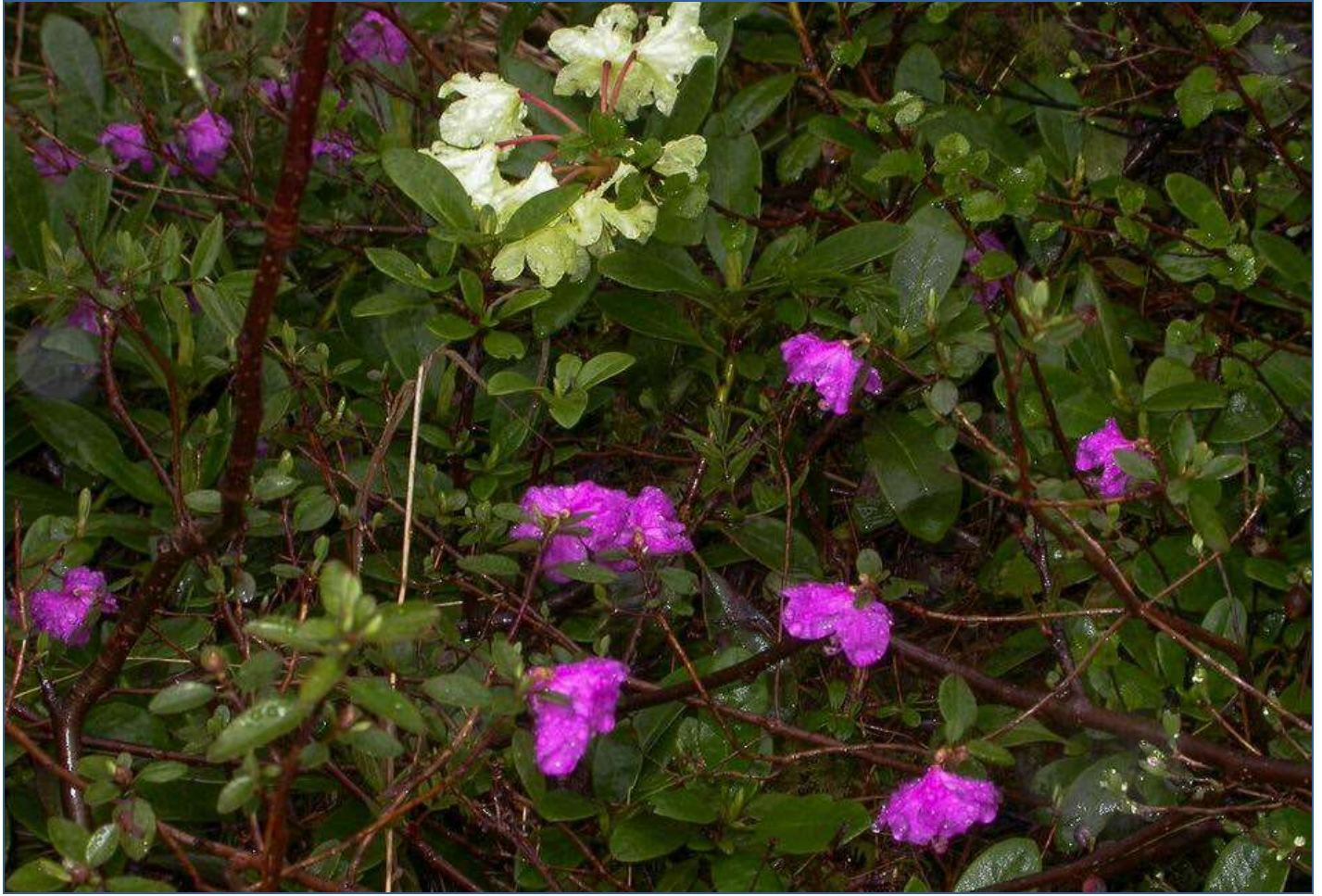
Rhododendron ledebourii Pojark.