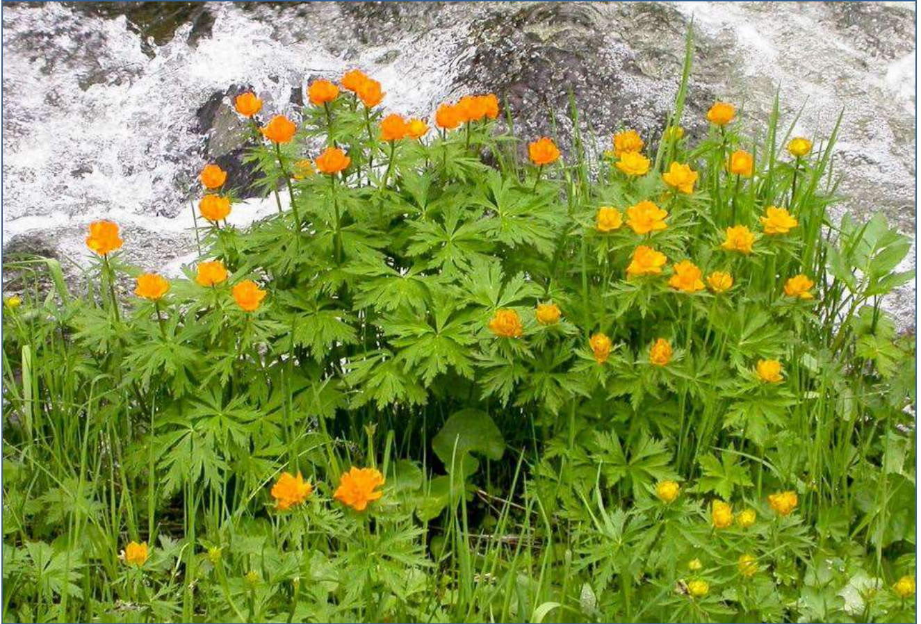
Trollius asiaticus L.