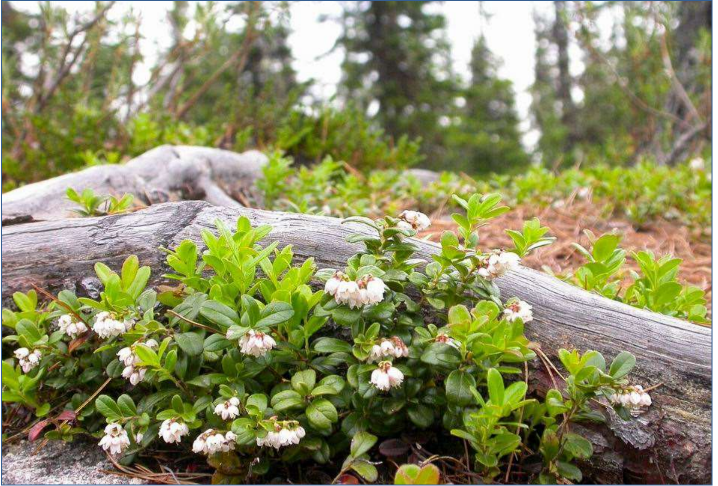
Vaccinium vitis-idaea L.