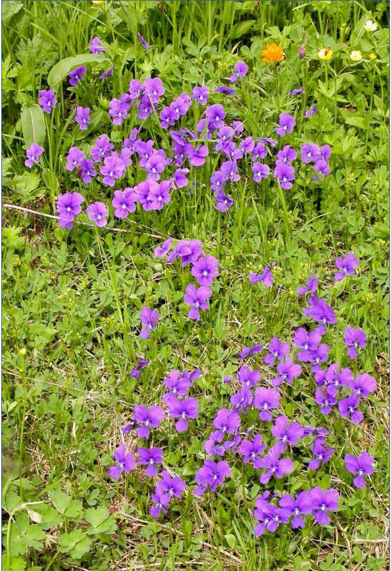
Viola altaica Ker Gawl.