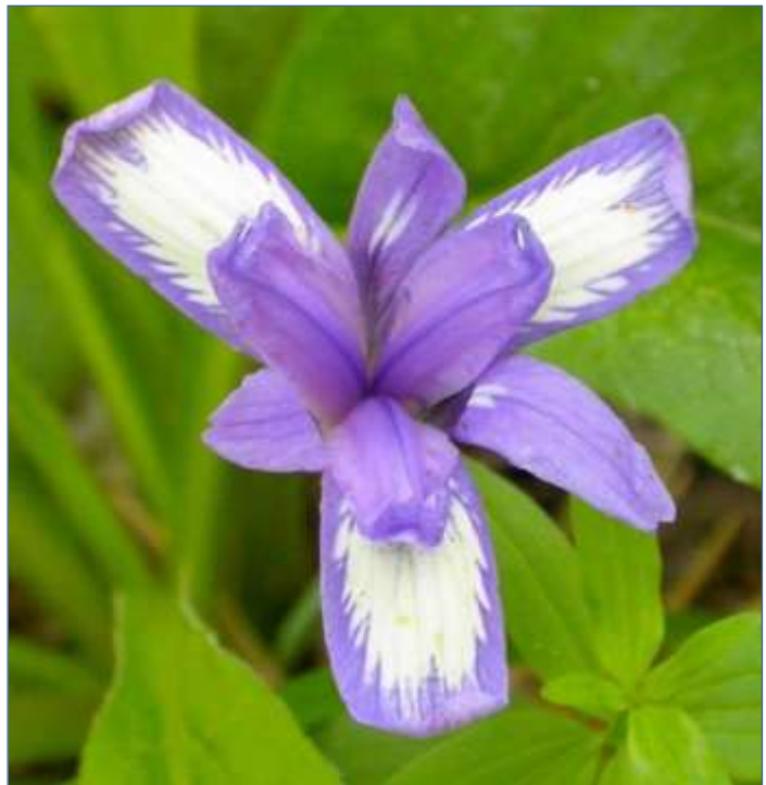
Above: Iris ruthenica Ker Gawl.