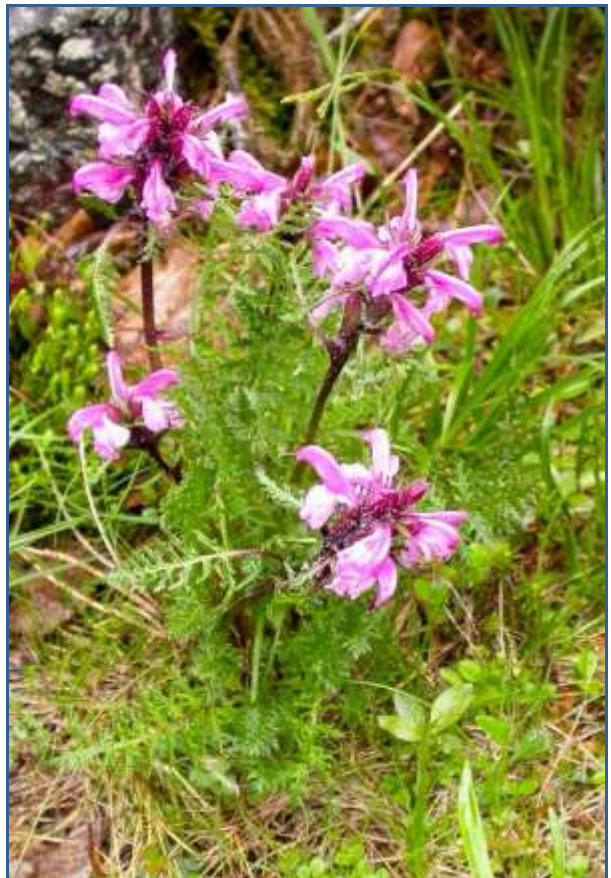
Pedicularis fissa Turcz.