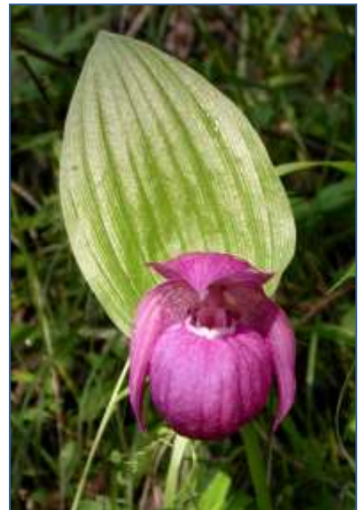
Cypripedium macranthos Sw.