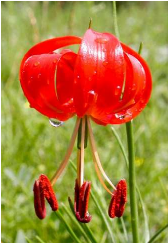
Lilium pumilum Delile