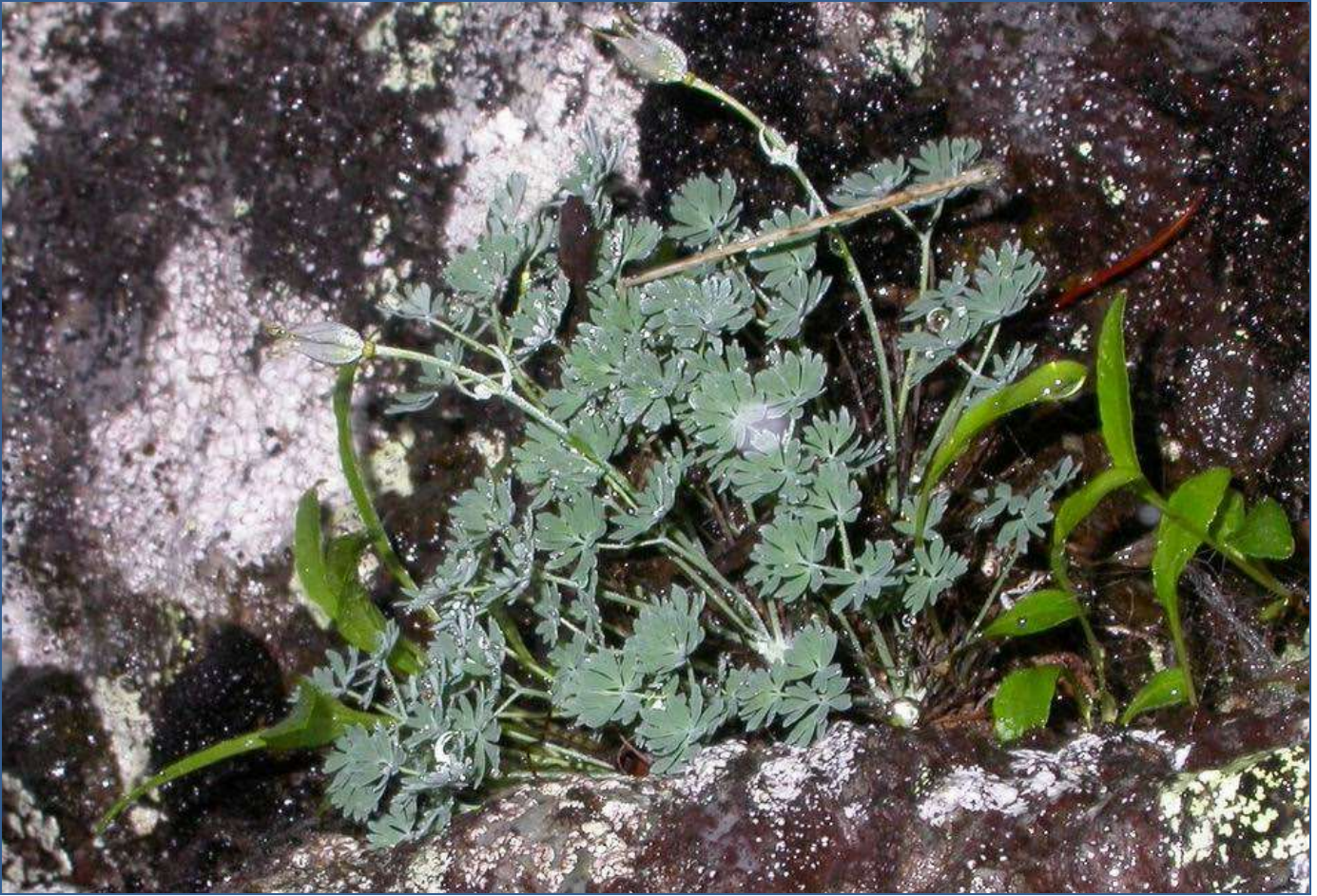
Paraquilegia anemonoides (Willd.) O.E. Ulbr. – in seed.