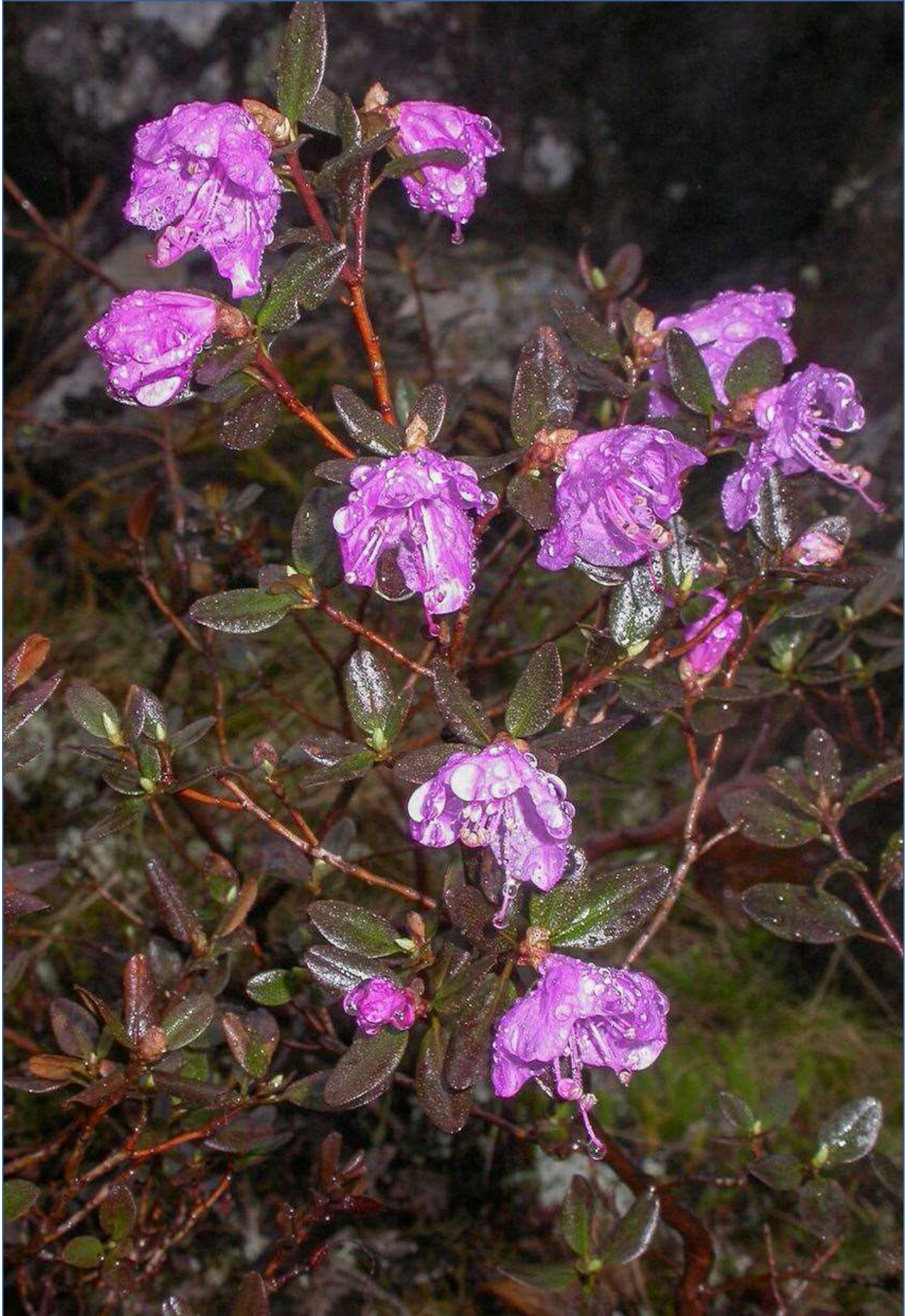
Rhododendron ledebourii Pojark.