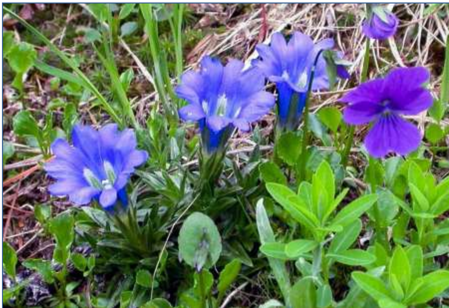
Gentiana grandiflora Laxm.