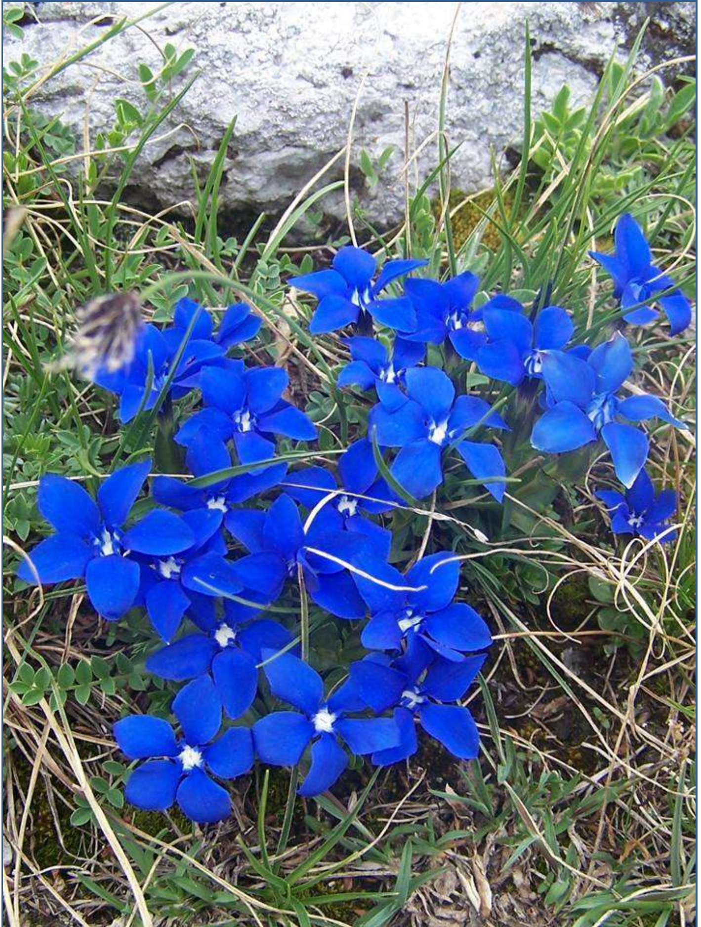
Gentiana verna var. balcanica prefers acid-neutral soil.