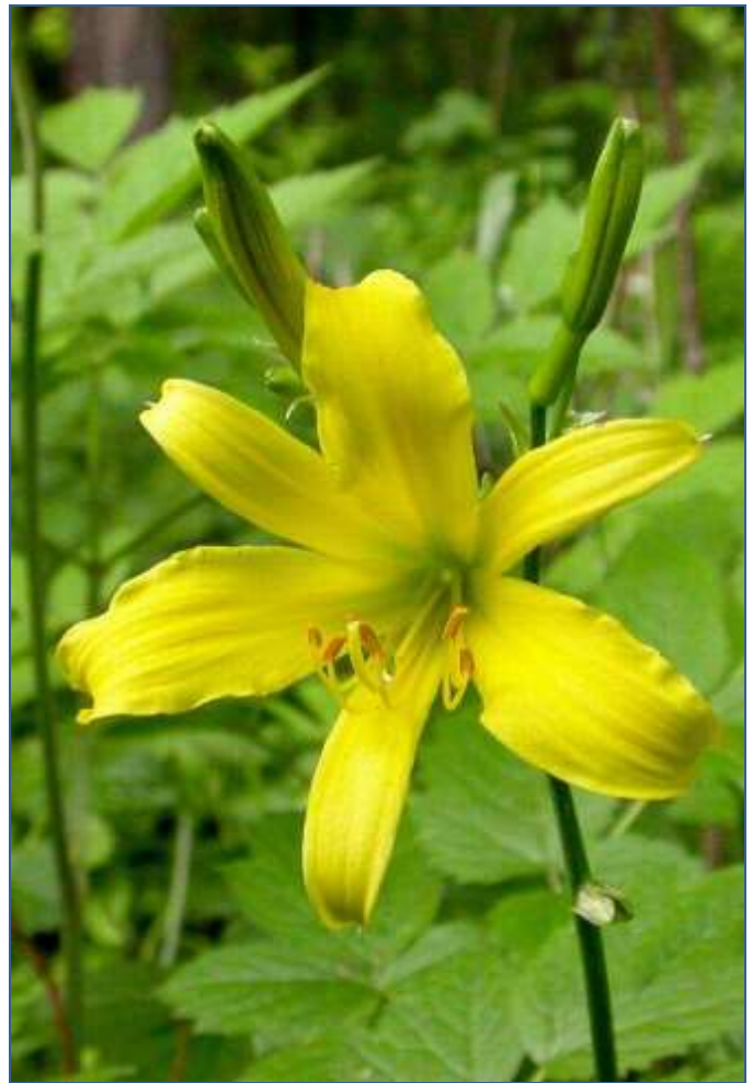
Hemerocallis minor Mill.