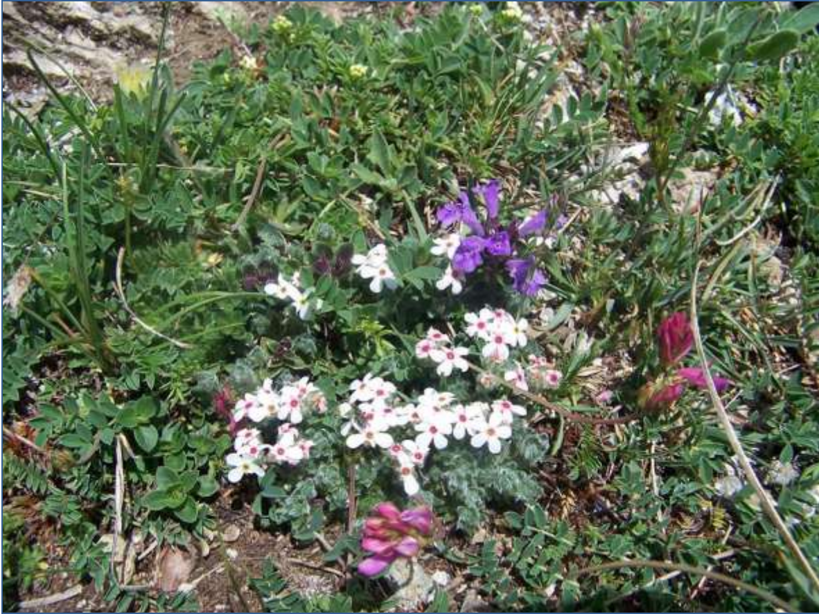
Androsace villosa : Very often the natural rock garden is a messy mish-mash. The fine Androsace suffers in this democratic society.