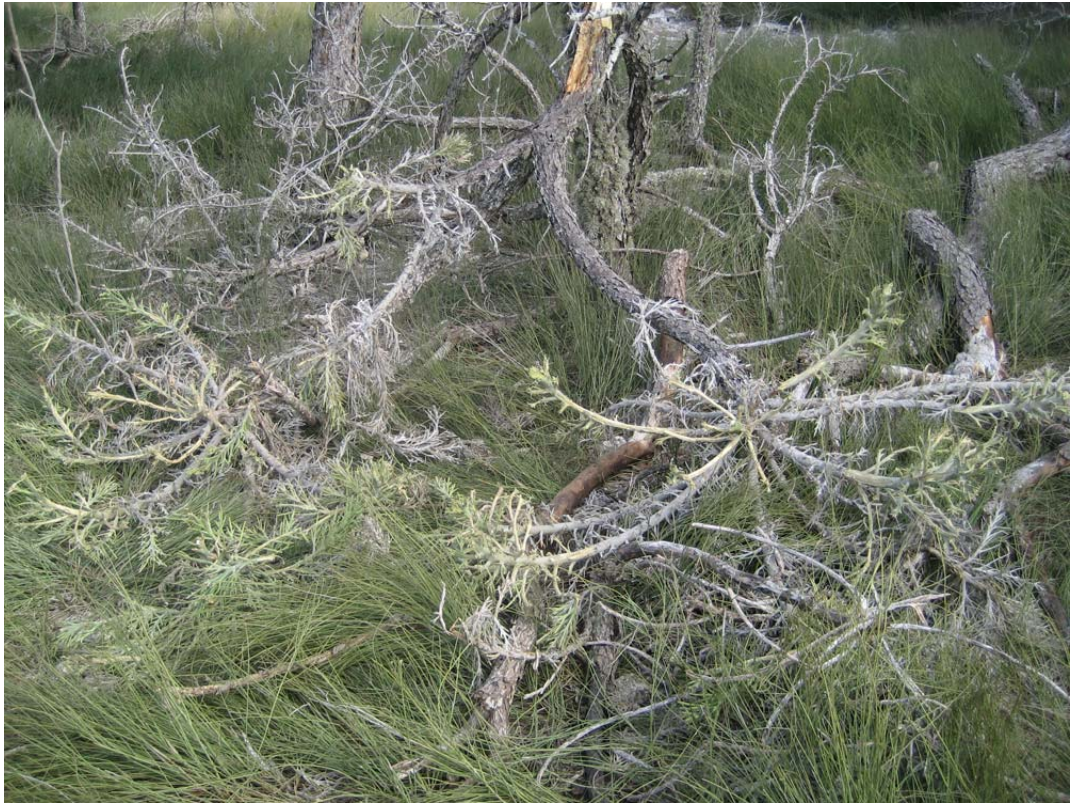
Plate 1: Goat browse on euphorbia.

The density of rats on the island was estimated in order to provide information on the quantity of poison that would be required for any eradication attempt. Rats were live-trapped in a 7 by 7 live-trap grid with traps spaced at 10 m baited with peanut butter and sweet potato. The first grid was placed south of the airstrip in forest (Plate 2) while the second grid was placed in the plains around the third kilometre mark (Plate 3). Rats were captured, marked and released for nine nights before two nights of removal (kill) trapping. Rats were marked with one ear-tag in each ear, to account for possible tag-loss. Dead rats were frozen for subsequent autopsy.