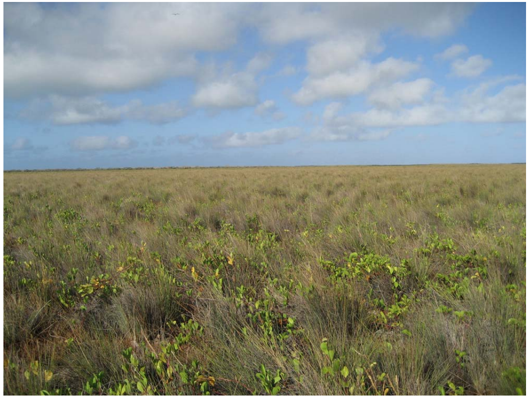
Plate 3: Plains rat trapping grid – third kilometre.