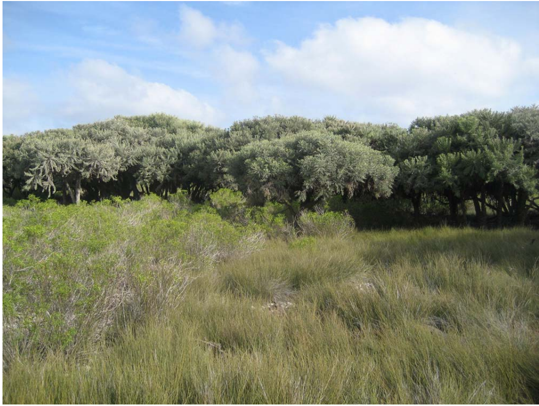
Plate 2: Forest rat trapping grid – south of airstrip.