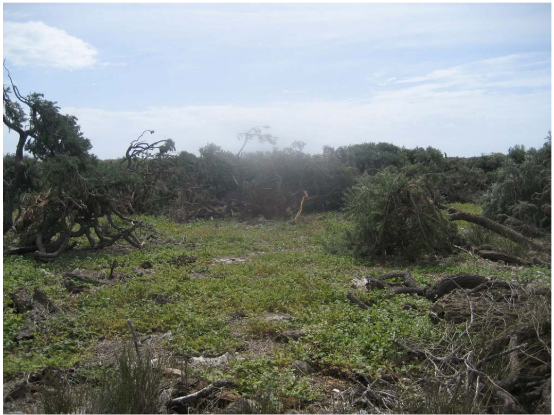
Plate 5: Damage to euphorbia forest following cyclone Jokwé

This thinning of dense stands would lead to a substantial decline in abundance but without the expected decline in distribution of the forest across the island. In effect, although the forest is as widespread as previously, its density is decreasing, and this effect would be masked if only aerial photos were inspected. This gradual decline in forest abundance is compounded by the impact of goats on the forest, which extensively browse the lower 2 m of the forest, effectively preventing most forest regeneration. Ultimately the euphorbia forest is gradually being transformed into savannah habitat. The establishment of a series of permanent plots which could be regularly inspected (e.g. annually) would greatly enhance the understanding of forest dynamics on the island.