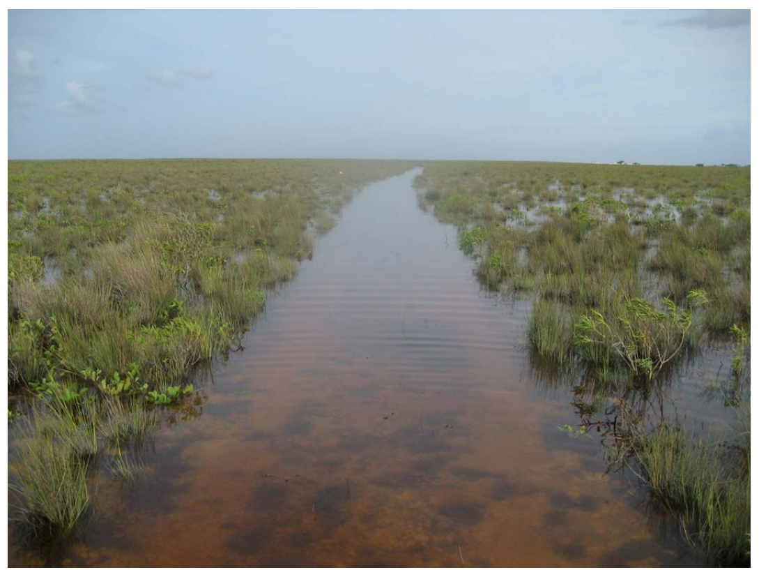
Plate 4: Flooding on the plains at the third kilometre mark.

Over 50% of euphorbia trees were impacted by cyclone Jokwé, although the small sample size (n = 10) gave large confidence intervals. Most damage occurred in the dense stands of euphorbia, were the collapse of one tree would lead to further damage to other nearby trees (Plate 5).