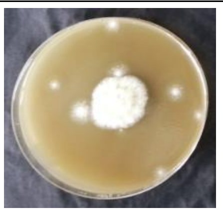
nanoform Agaricus sp. extracts