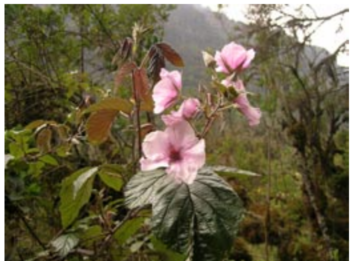
Rubus cf. steudneri