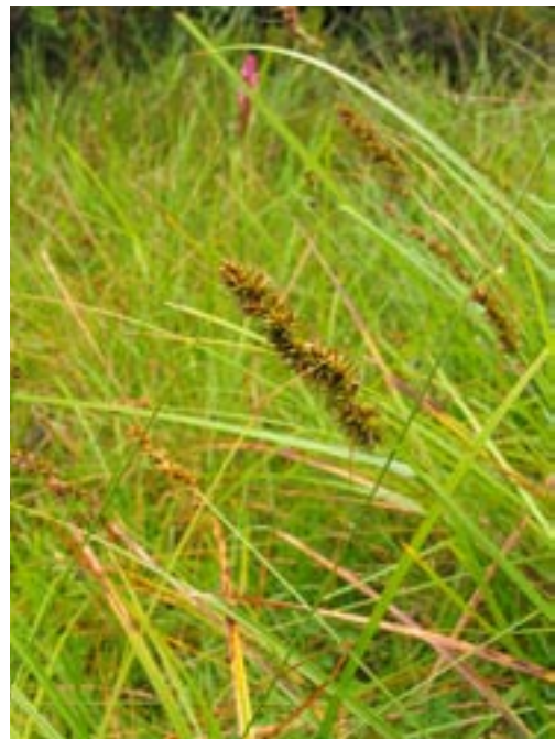
Carex conferta var. leptosaccus

Carex conferta var. leptosaccus . Plants forming large tussocks, inflorescence a dense terminal panicle, brownish green. In open, wet spots often near seepages or running water. In the bamboo and upper montane zone.