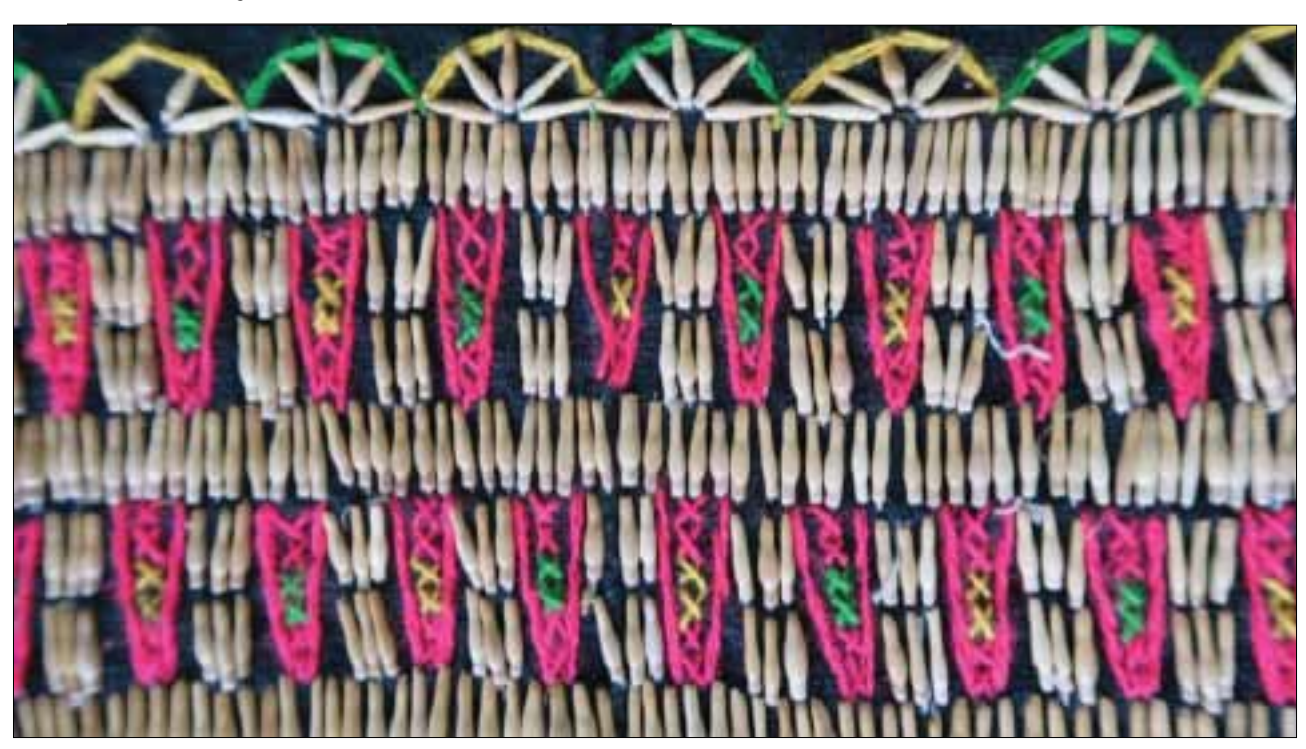
6 Karen blouse (Bago, Myanmar, 2002)

Akha women living in northern Thailand, northern Laos, eastern Myanmar and Yunnan Province use the seeds for decorating. The decorations are characterized by 1) using all four types of seeds with variation in the shape and size and 2) adapting the seeds for many articles of costume, such as headdresses, jackets, aprons, leg covers and shoulder bags. The seeds are artfully