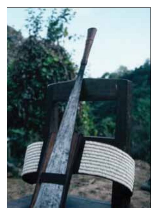
14 Makuri Naga belt (Sagain, Myanmar, 2006).

of natural materials were gathered from the forests and fields, including cotton, vine, plant dyes and the seeds of Job's tears. Nowadays, these have been replaced by newly introduced materials from the markets, such as mass-produced machine-made textiles, chemical dyes, synthetic fibers and plastic beads.