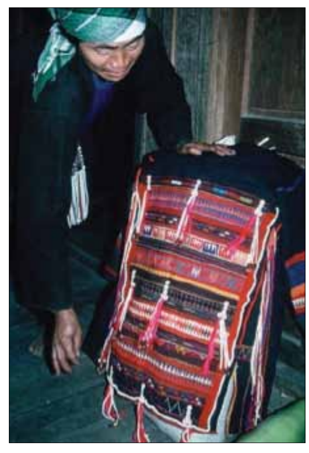
3 Akha jacket for wedding ceremony (Shan, Myanmar, 2006)

The most common way people use the beads is to make necklaces by connecting the seeds by thread. This