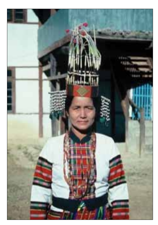
12 Falam Chin woman with her headdress (Chin, Myanmar, 2006).

Similarly, the decorative material of Taungyo onepiece dresses has changed from the seed into plastic beads and sequins which are arranged prominently around the neck. In the local context, the Job's tears were an accepted traditional material for dressmaking. However, when the Taungyo attended national events in the capital of Myanmar, their costume was compared