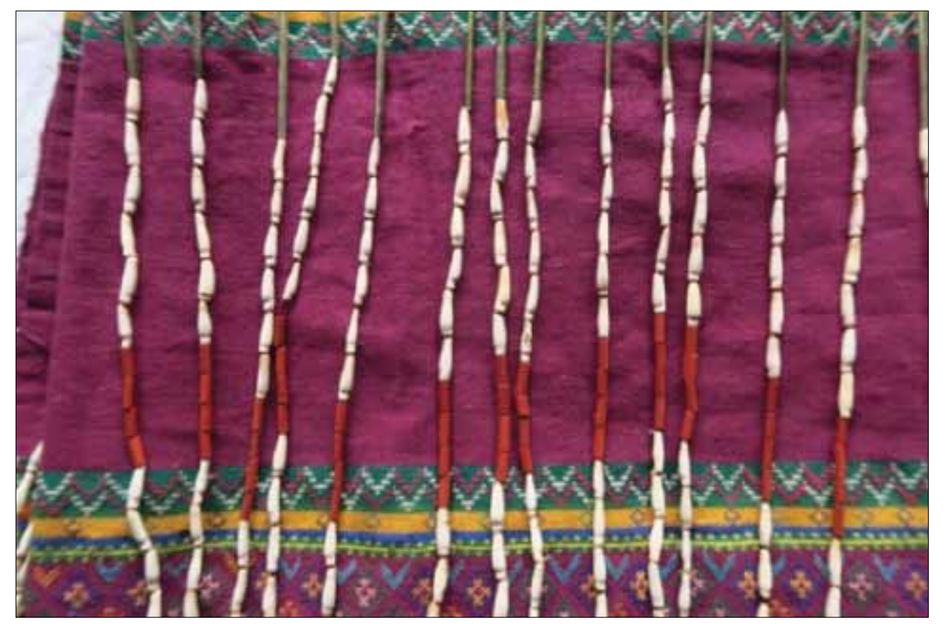
11 Haka Chin skirt (Yangon, Myanmar, 2006).