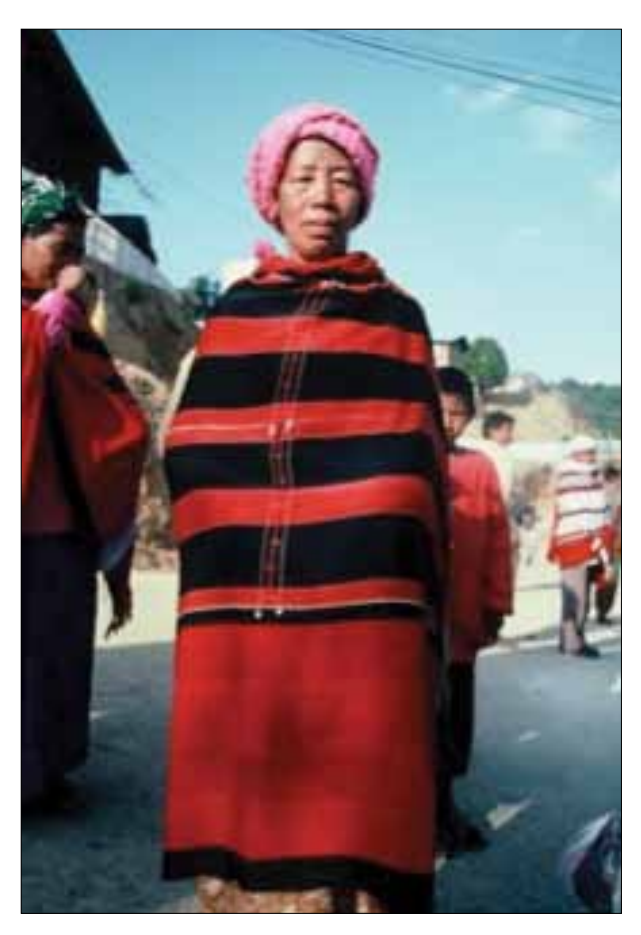
15 Naga woman wearing a shawl (Sagain, Myanmar, 2006)

The use of Job's tears beads in textiles are a unique indicator of the evolution of people and plant interactions in mainland southeast Asia and of the upheavals many ethnic minority communities are undergoing—resettlement of villages, integration into a market economy, commercial cultivation of single crops and erosion of cultural practices and customs. This is explored further in our upcoming exhibition called "Seeds of Culture: From Living Plants to Handicrafts" which will open on 13 September 2016 at the Traditional Arts and Ethnology Centre in Luang Prabang, Lao PDR, which combines our contemporary understanding of and concern with environmental degradation and its relationship to cultural homogenization and poverty among ethnic groups in developing countries.