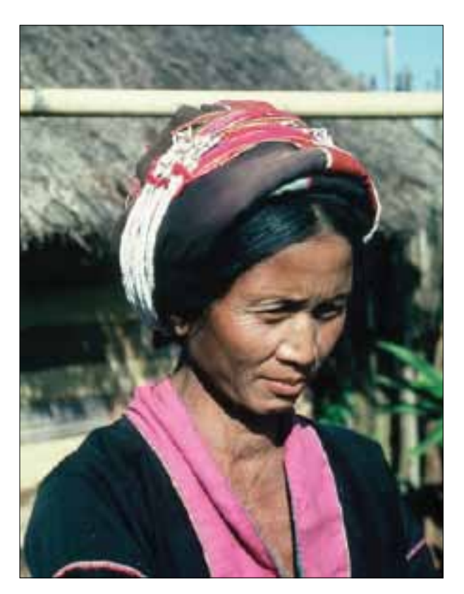
8 Palaung headdress (Shan, Myanmar, 2003).

Karen women in northern Thailand and central and eastern Myanmar adjust their clothing according to their