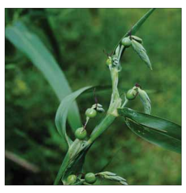
1 Job's tears plant ( Coix lacryma-jobi var. lacryma-jobi ) growing in a village (Luang Prabang, Laos, 2011).

In mainland Southeast Asia, many ethnic groups weave their textiles as one of their subsistence activities. These textiles are used for everyday life, such as sleeping items, towels, ritual items and clothing. Thus, textiles and costumes in this region are admired for the quality of their local materials (often hand-reeled silk and hand-spun cotton) and craft techniques. They often feature elaborate embellishments and patterning, includ-