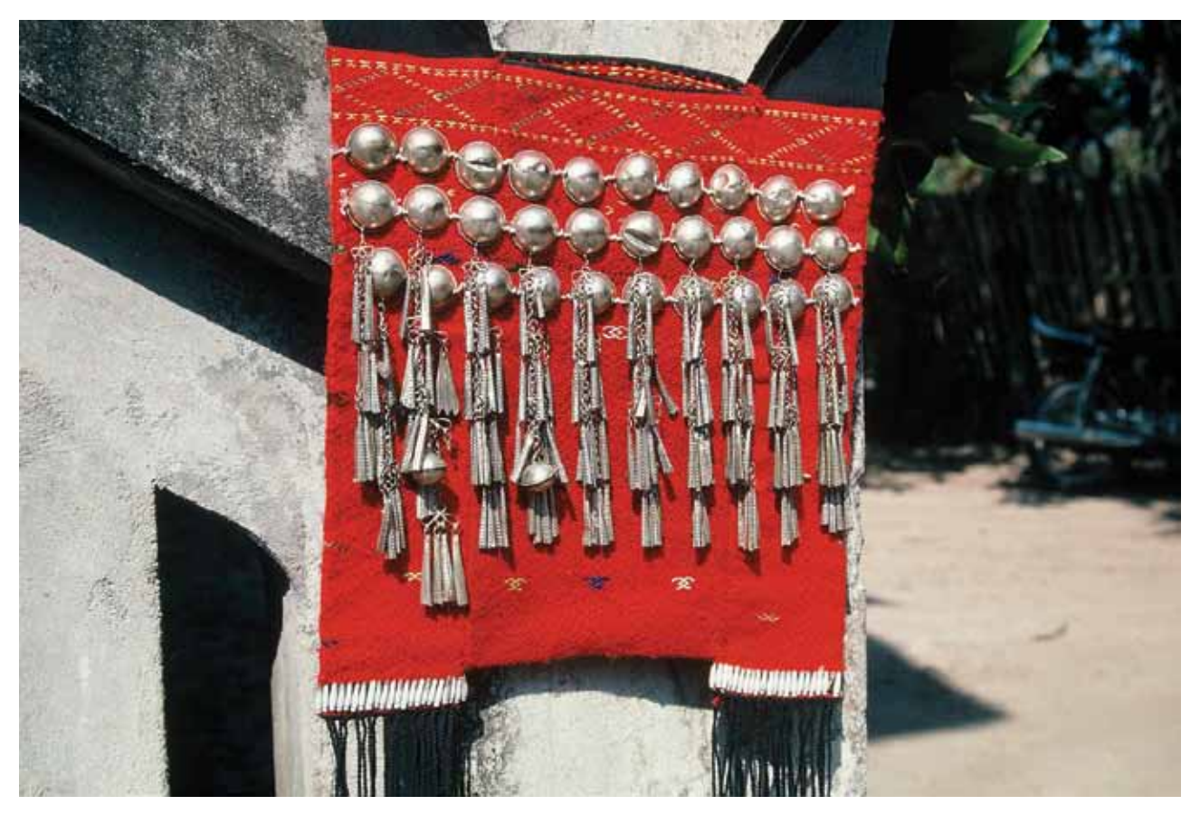
9 Jinghpaw shoulder bag (Kachin, Mynamar, 2005).

State of Myanmar (figure 7) for one-piece dress decoration, Palaung women in the northern Shan State (figure 8) for headdress decoration, Jingphaw people (figure 9) in the Kachin State of Myanmar, and Wa people (figure 10) of the Shan State of Myanmar for shoulder bag decoration.