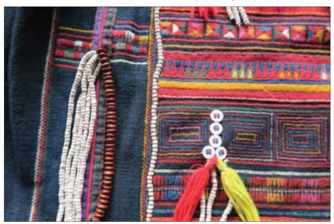
4 Seed decoration on the backside of the Akha jacket (Shan, Myanmar, 2006).