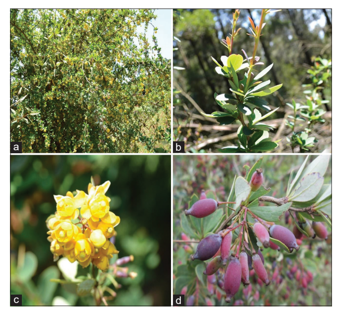
Figure 1: (a) Habit of Berberis tinctoria , (b) leaves, (c) flower, and (d) fruit

B. tinctoria is an evergreen shrub; endemic to South Western Ghats, predominantly found in the higher altitude of The Nilgiris, Tamil Nadu, India.<sup>[17]</sup> Figure 1 shows the habit of the plant which is in variable size and form, often 1–2 m high,