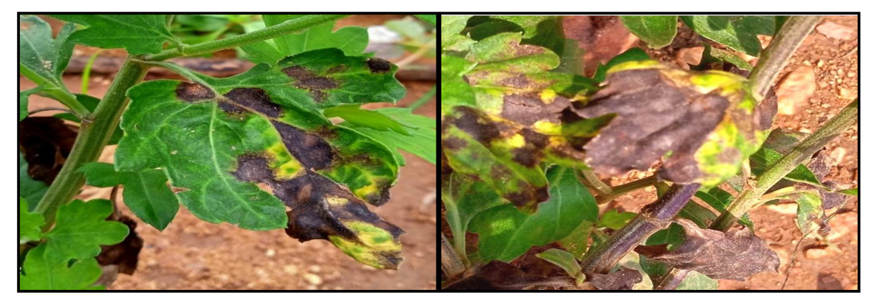
Coalesce of spots and yellowing of leaf