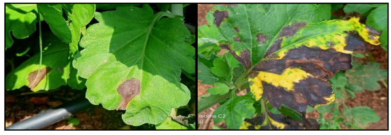
Initial necrotic spot