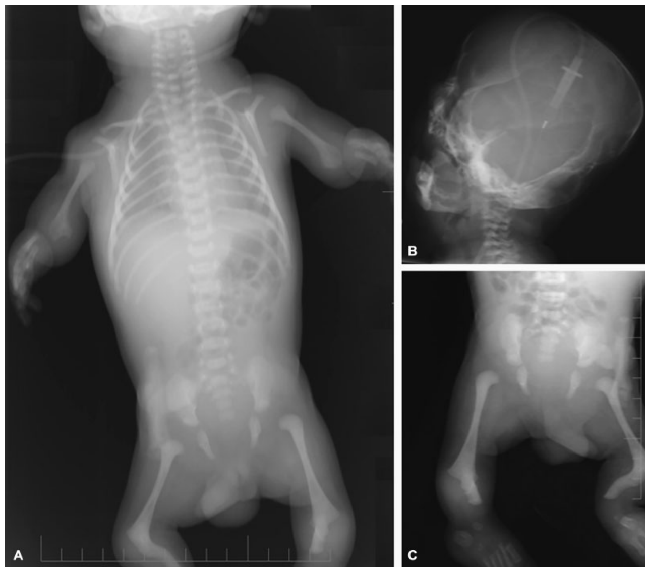
Fig. 2 Radiographic evaluation showing 11 ribs and shortened and deformed humerus (A); marked deformity of the skull with reduction of its anteroposterior diameter (B), and femur bending, with absence of tibia and fibula (C).