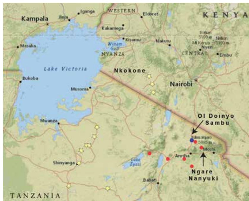
Fig. 1. Locations of three new species of Sansevieria in Kenya and Tanzania. Sansevieria enchiridifolia was only found near Ol Doiyo Sambu (blue dot). The red dots indicate localities where Sansevieria rugosifolia was found; the yellow dots indicate where Sansevieria forestii was found. The sighting of Sansevieria rugosifolia near Mbuyuni (Table 1) is well south of the map area and is not shown.

Here, we describe three new related species from the region near the border of Kenya and Tanzania (Fig. 1). These species are broad-leaf ones that range in width considerably, and they clearly are related to each other. The first new species was originally found by Bhwire Bhitala of Arusha, Tanzania. The second species was originally found in southwestern Kenya by Arturo Foresti, now deceased, and is named for him. The third species was found serendipitously by Newton and Webb alongside a main highway in northern Tanzania.