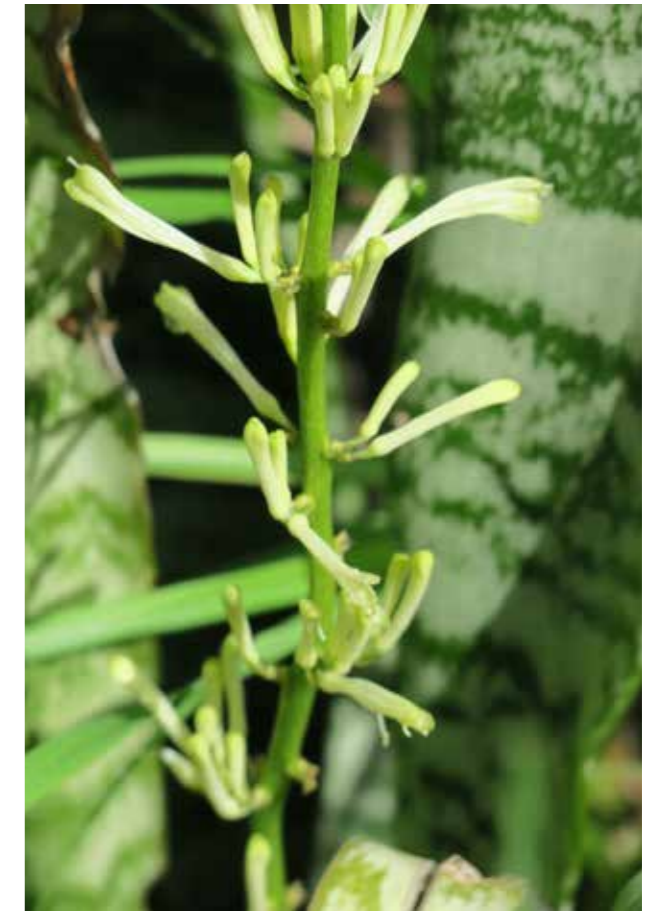
Fig. 3. Close-up of inflorescence of Sansevieria trifasciata subsp. sikawae showing zig-zagged form and lax flower clusters.

section about half the total length of the peduncle, basal bracts the color of leaves 8 × 4 cm; light green bracts at flexures 20 × 4 mm; flower clusters lax, cluster peduncle short and stubby with no subtending (or weak) bracts, (2–) 3 (–5) flowers per cluster. Floral tube on short (~1 mm) peduncle, 50–55 mm long, 2 mm diameter around ovary, narrowing to 2 mm diameter above ovary, cream to yellow-green color; tepal lobes widely spreading, 25 mm long, 2–3 mm wide; filaments attached to the base of the tepals, exserted, 30 mm long, anthers 2 mm long, asymmetrically attached to filaments, cream to light yellow in color; style 25 mm long, exserted, white to cream colour, stigma <1 mm diameter and resembles an upside-down hemisphere. Flowers opening in the evening without a strong scent. Seeds not seen.