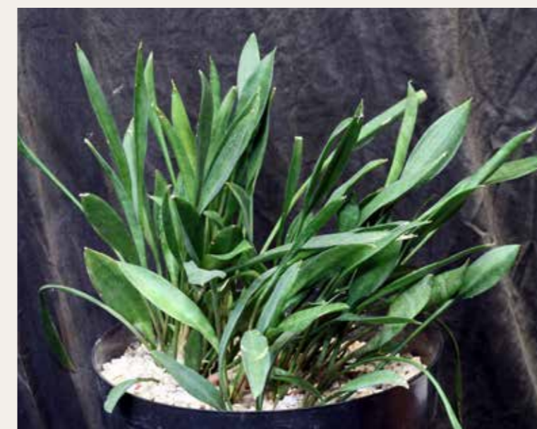
Fig. 5. Sansevieria concinna (Lav 5933).