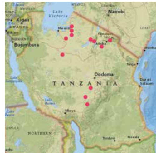
Figure 5. Known distribution of Sansevieria trifasciata subsp. sikawae in Tanzania.