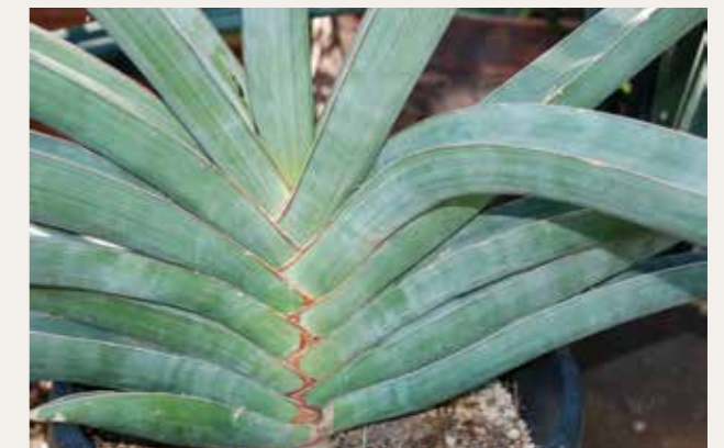
Fig. 24b. Sansevieria sp. (Lav 24977), blue form.