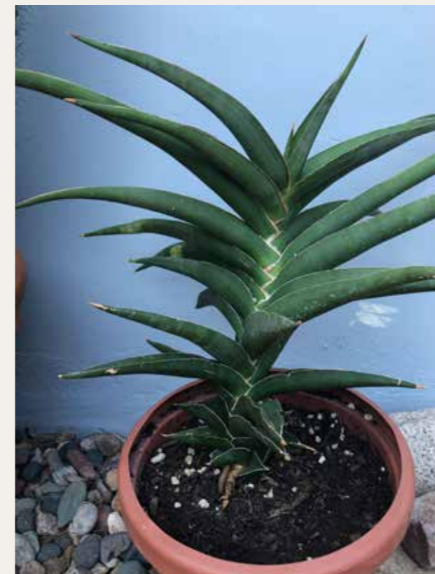
Fig. 22b. Sansevieria sp. (Lav 24561).