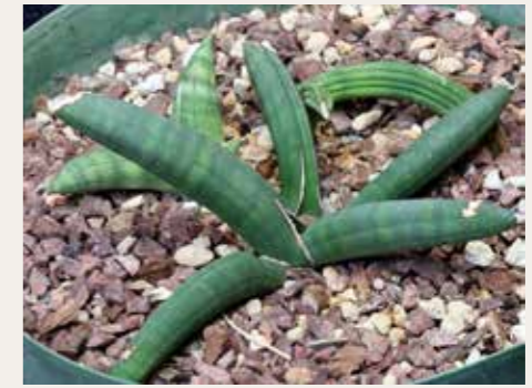
Fig. 13. Sansevieria eilensis (Lav 10178).