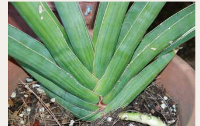
Fig. 24a. Sansevieria sp. (Lav 24977), green form.