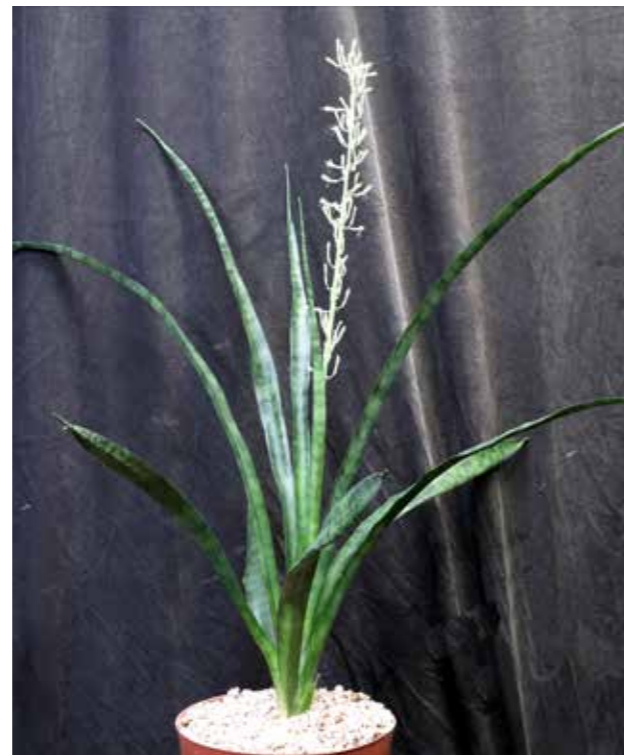
Fig. 4. Sansevieria trifasciata subsp. trifasciata in flower in Tucson, Arizona.

Discussion. Sansevieria trifasciata subsp. sikawae is clearly different from the typical Sansevieria trifasciata (Fig. 4), both in patterning of the leaf and inflorescence characteristics. The largest differences are in the inflorescence and flowers; subsp. sikawae has an articulated (zig-zagged) inflorescence while subsp. trifasciata does not, and the flowers of subsp. sikawae have a yellow appearance whereas subsp. trifasciata is typically white (Fig. 4). Its presence as a putative native species in East Africa raises interesting questions concerning the status of Sansevieria trifasciata across Africa from at least Nigeria in the west to at least Tanzania in the east. Other species may also belong to a greater S. trifasciata complex but are currently listed under other names. These might include Sansevieria lineata from Uganda (Forest, 2013), which has considerable similarities with Sansevieria trifasciata . It is possible that subsp. sikawae is the second (following subsp. laurentii ) subspecies in a much larger concept of one of the most common species of Sansevieria in cultivation.