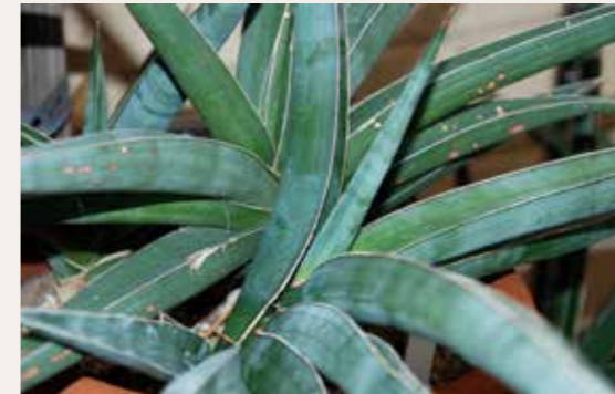
Fig. 11. Sansevieria ehrenbergii (Lav 23395).