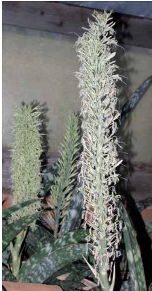
Fig. 9. Inflorescences of Sansevieria enchiridiofolia (foreground) and S. rugosifolia (left background).