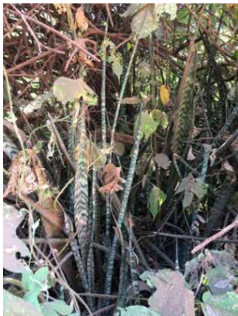
Figure 3. Sansevieria trifasciata subsp. sikawae (narrow-leaf form) at Lake Manyara National Park.

after World War I. Some of the major cities such as Dodoma were visited by Arab traders for hundreds of years, so there were many opportunities for exotic plants to be established. When visiting cities in Tanzania, it is easy to see where European people had settled, as much or most of the plantings there are exotic species. This is much less true in native villages, and in the remote areas it is rare to see any exotic species other than food crops.