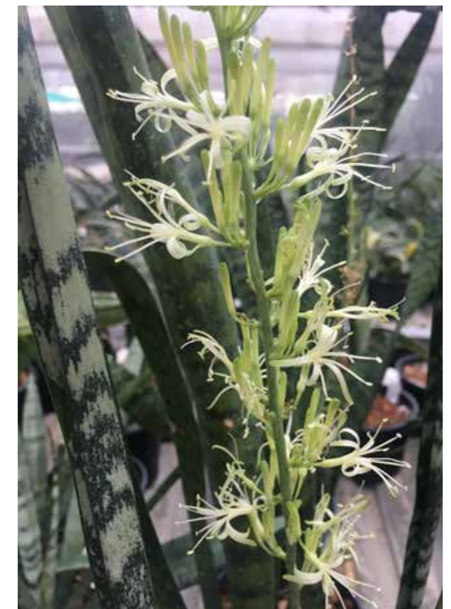
Figure 9. Sansevieria trifasciata subsp. sikawae (broad-leaf form) in flower.