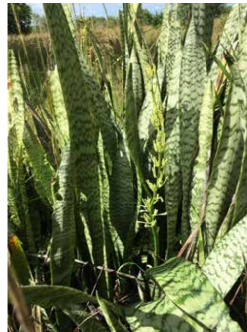
Figure 6. The broad-leaf form of Sansevieria trifasciata subsp. sikawae in flower at the type locality near Lolanguru, Tanzania.