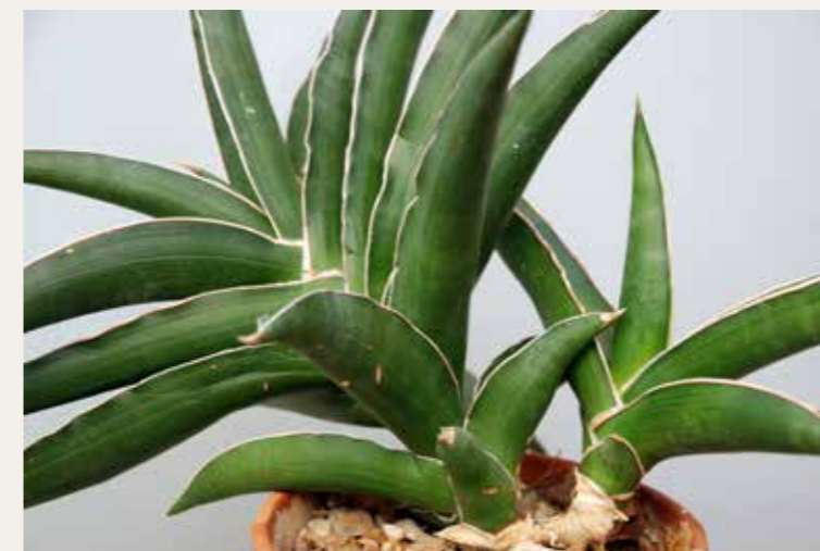
Fig.26. Sansevieria sp. (Lav 23154).