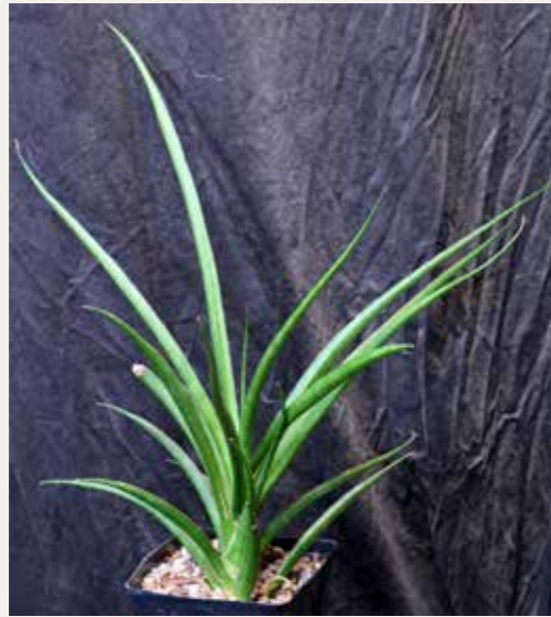
Fig. 16. Sansevieria gracillima (Lav 27839).