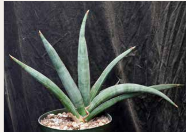
Fig. 19. Sansevieria rorida (Lav 23319).