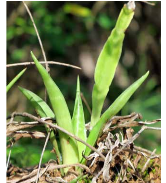
Fig. 1. Sansevieria dooneri at its type locality on the western edge of the Rift Valley Escarpment west of Nairobi, Kenya.