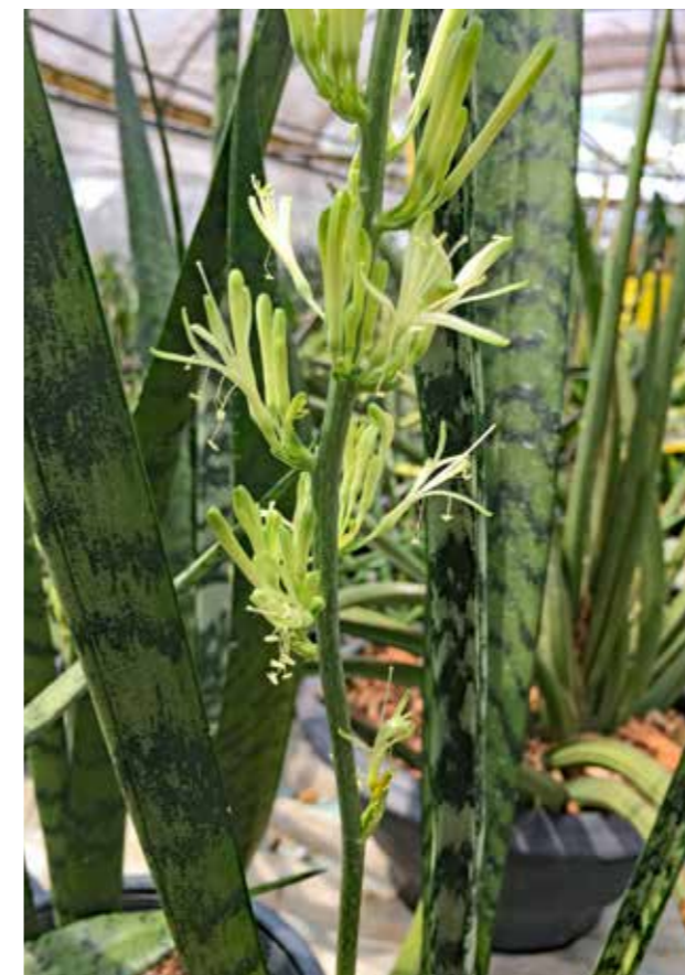
Figure 8. Sansevieria trifasciata subsp. sikawae (narrow-leaf form) in flower. This specimen was collected originally from Miss Catherine's house in Ibinzamata, Tanzania.

There are a number of differences between the flowers of Sansevieria trifasciata ssp. trifasciata and S. trifasciata subsp. sikawae , but some of the differences cannot be seen on an herbarium specimen. The sequence of flower development, the way that the flowers are held, and the absence of the broadly open white flower of S. trifasciata subsp. trifasciata are a few of the differences.