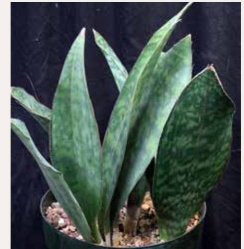
Fig. 14. Sansevieria elliptica (Lav 6795).