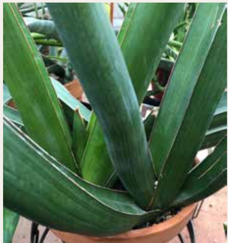
Fig. 7. Sansevieria dhofarica .