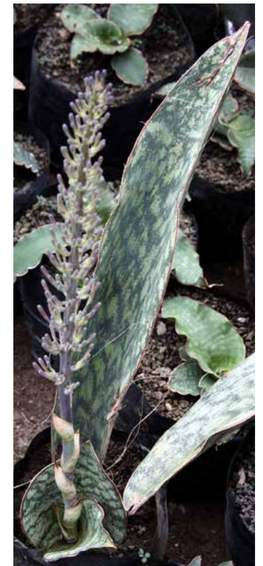
Fig. 2. Sansevieria rugosifolia growing in a plastic liner pot at Bhwire Bhitala's nursery in Arusha, Tanzania, in 2011. This plant was collected from the type locality near Ngare Nanyuki, Tanzania.

Bhwire Bhitala found this species in various places near Arusha, Tanzania, where he lives. We first saw this species in flower at the Bhitala nursery in Arusha on 24 December 2009 (Fig. 2) but failed to recognize its significance as a new species. The most striking characteristic of this species is its extremely rough leaves on both sides (the epithet reflects this character); other related species are only rough on the undersides of the leaves and only slightly rough to smooth on the tops of the leaves. Bhitala mailed plants to us under the collection number of Bhitala 1008, and we grew it in ground beds for years. Eleven years after receiving those plants, several bloomed in February 2019, enabling this description.