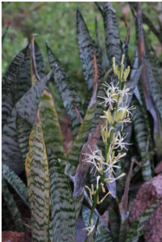
Fig. 1. Wild population of Sansevieria trifasciata subsp. sikawae in flower.

S ansevieria trifasciata quite possibly is the most common species of this genus in cultivation around the world. Numerous cultivars have been created from this species, mostly as offset sports (Chahinian, 1986). In this paper, we describe a new subspecies of S. trifasciata from Tanzania and discuss why we believe this is a subspecies and not an escapee from cultivation. A companion article (Yinger, this volume) discusses the distribution of this subspecies in Tanzania and provides the arguments for why we think it is native to the region.