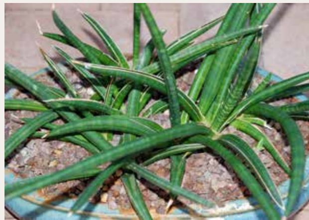
Fig. 17. Sansevieria hargeisana (Lav 7382).