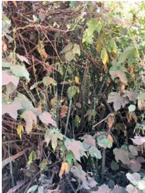
Figures 2 a and b. Sansevieria trifasciata subsp. sikawae (narrow-leaf form) in nature at Lake Manyara National Park