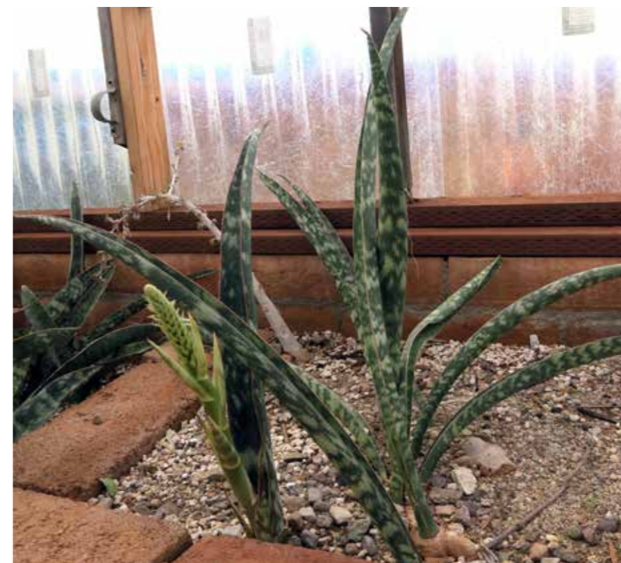
Fig. 7. Sansevieria enchiridifolia in a ground bed in Tucson, Arizona.