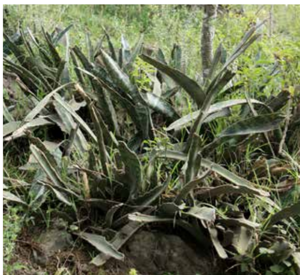
Fig. 4. Sansevieria rugosifolia at the type locality of Ngare Nanyuki, Tanzania.