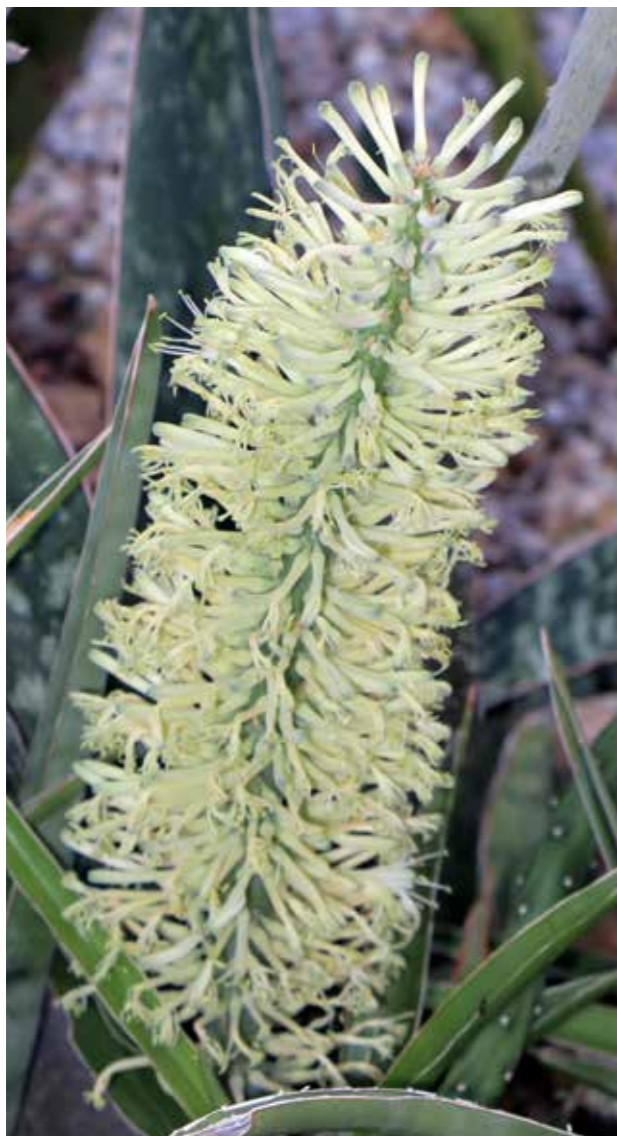
Fig. 3. Sansevieria rugosifolia inflorescence in cultivation in Tucson, Arizona.