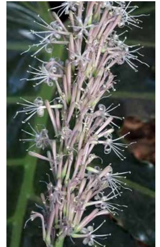
Fig. 12. Sansevieria forestii flowering in Belinda Levitan’s garden in Nairobi, Kenya.