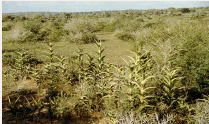
Fig. 8. Sansevieria arborescens.