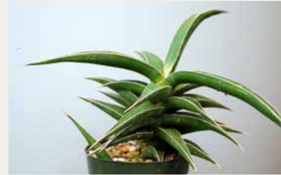
Fig. 9. Sansevieria sp. aff. arborescens (Lav 23251).