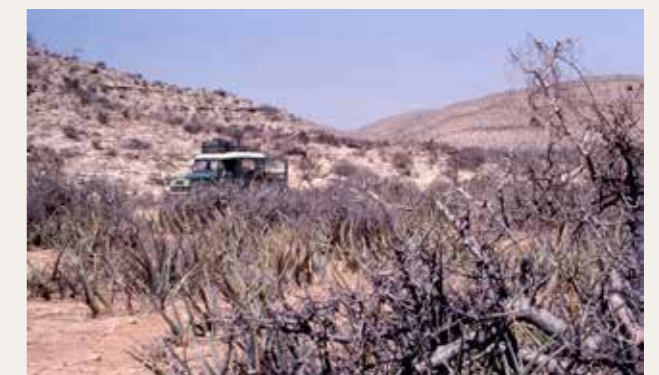
Fig. 25. This field photograph could be Sansevieria sp. (Lav 24977) 'Las Anod' based on similarity with what is shown in Butler (2009, Fig. 1). (photograph by Susan Carter-Holmes).