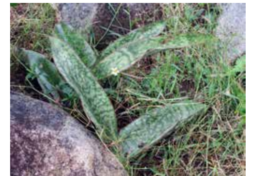
Fig. 13. Sansevieria forestii in an area of granitic outcrops near Nzega, Tanzania.