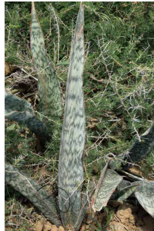
Fig. 5. Sansevieria rugosifolia south of Longido, Tanzania.

This species really deserved to be named Sansevieria serendipida , because we found it by chance along the main road between Arusha, Tanzania, and Nairobi, Kenya. We pulled over for a proverbial “rest stop” before we got to the border crossing at Namanga, and we happened to notice a clump of this Sansevieria behind an Acacia shrub. We immediately knew that this was something different despite the fact that goats and other domestic animals had nibbled on it (Fig. 5). Despite careful searching the area on a later trip, during which