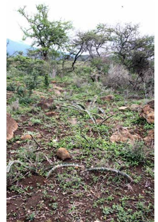
Fig. 6. Sansevieria enchiridifolia at its type locality north of Ol Doinyo Sambu, Tanzania.