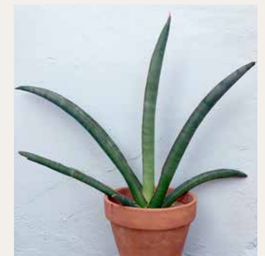
Fig. 27. Sansevieria ehrenbergii , plant from material collected in Yemen by John Lavranos without collection number.