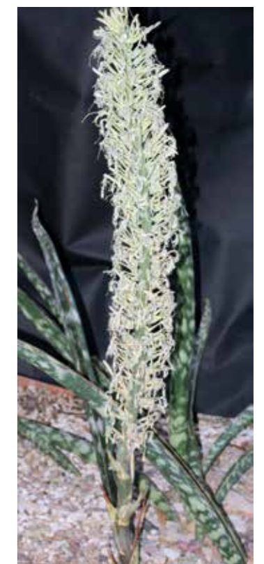
Fig. 8. Sansevieria enchiridifolia with inflorescence in February 2019.