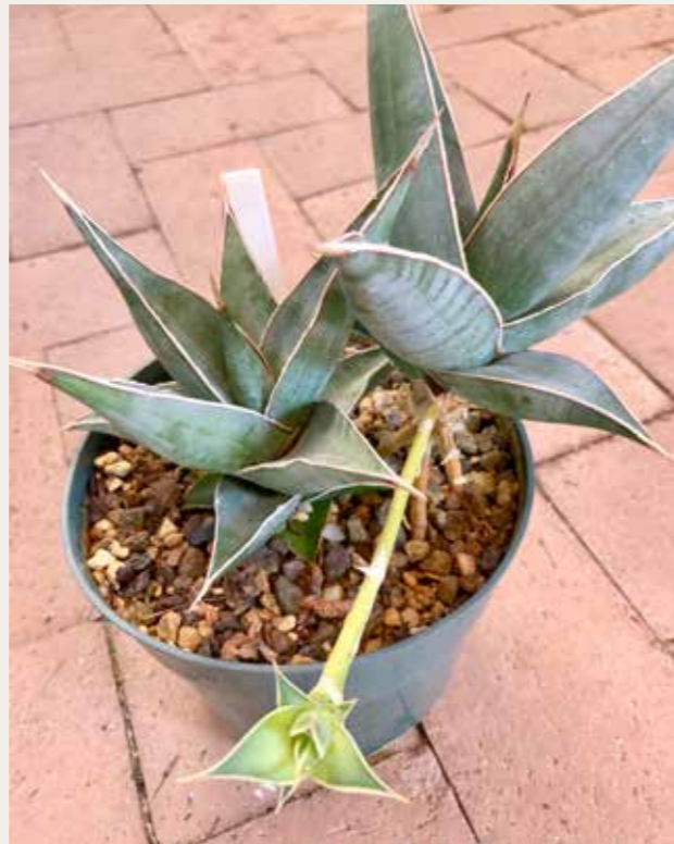
Fig. 4. Sansevieria pinguicula (Lavranos & Newton 12240).