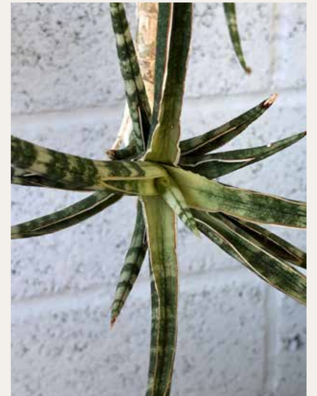
Fig. 2. Sansevieria ballyi .