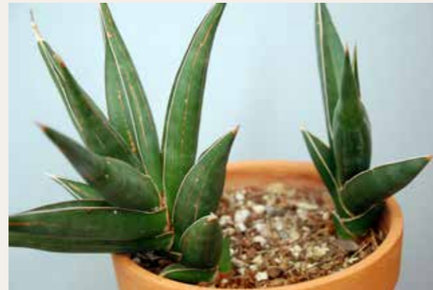
Fig. 21. Sansevieria sp. (likely S. powellii ) (Lav 24534).