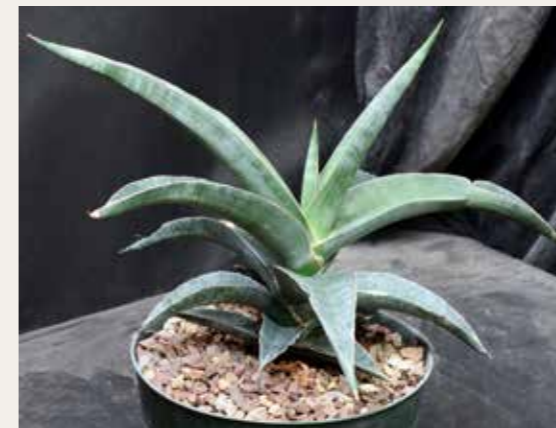
Fig. 12. Sansevieria lavranii (Lav 24769).