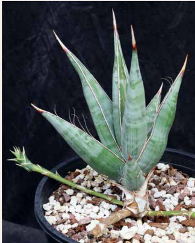
Fig. 3. Sansevieria pinguicula (Lav 9424).