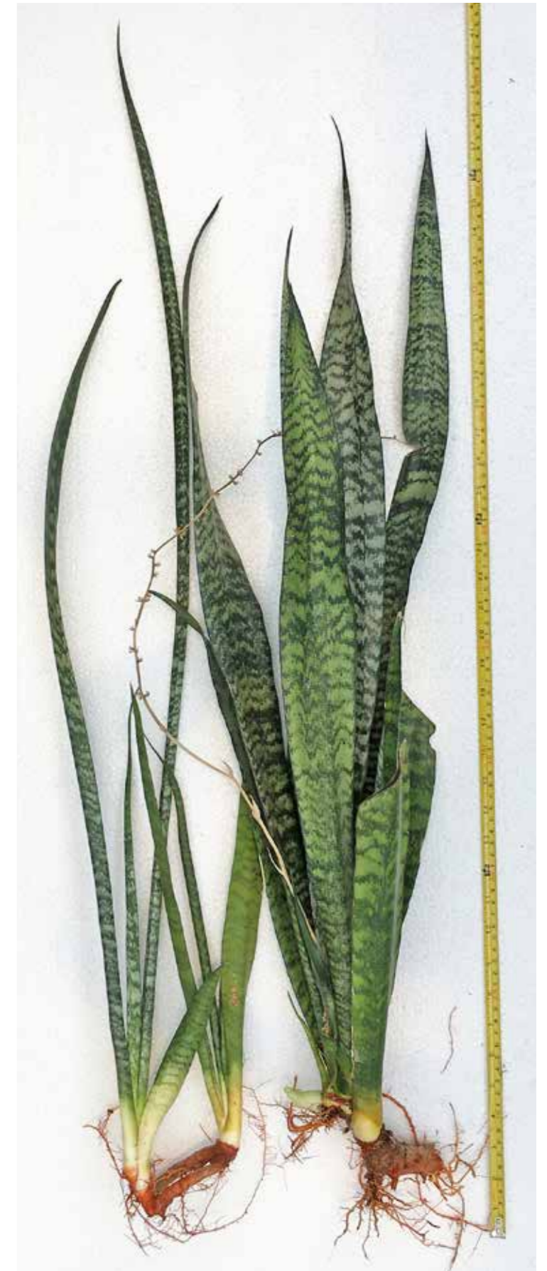
Figure 7. Comparison of the narrow-leaf (left) and broad-leaf (right) forms of Sansevieria trifasciata subsp. sikawae