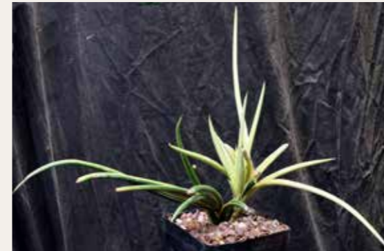
Fig. 10. Sansevieria gracilis (variegated) (Lav 23328A).