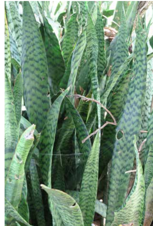
Fig. 2. Large clump of Sansevieria trifasciata subsp. sikawae at its type locality at Lolanguru near Tabora, Tanzania.

Description. Acaulescent, rhizomatous, clumping perennial with 50–100 or more rosettes in a colony; rhizomes ~ 2 cm, turning orange when in the air; basal bracts papery, triangular-deltoid 4 (–5) × 4 cm; leaves (2–) 3 (–9), ± upright, flexible, ensiform, smooth both sides with gray-green background bearing lateral medium-green lines or bands or disconnected blotches, flat with vague center channel, (55–) 120 (–160) cm long × (4–) 5 cm wide, widest ~2/3rds distance from the base, < 1 cm thick near base; tip blunt. Inflorescence simple, 50–75 cm long, ~5 mm wide, wavy (zig-zagged) with flexures in the pale green peduncle at ~ 5 cm intervals, infertile section patchy tomentose with discontinuous channel, fertile