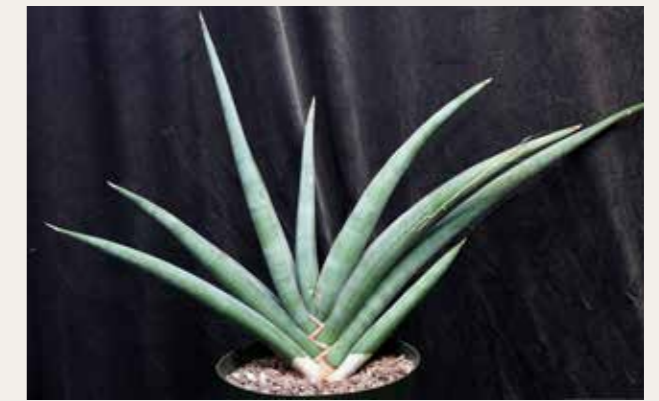
Fig. 23. Sansevieria sp. (Lav 24688).