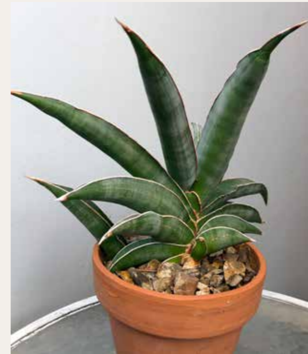
Fig. 22a. Sansevieria sp. (Lav 24561), blue form.