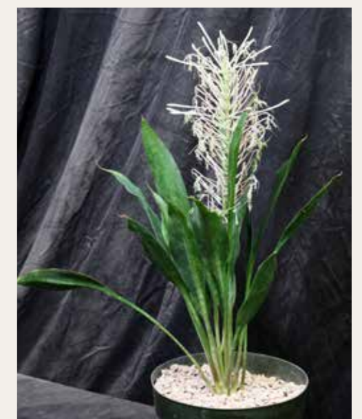
Fig. 6. Sansevieria concinna (Lav 5949).