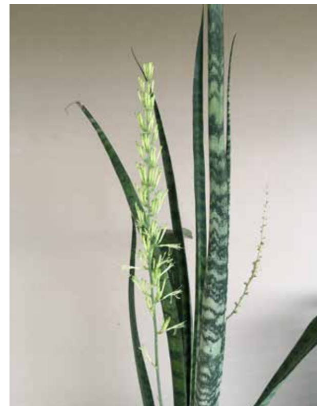
Figure 1. Sansevieria trifasciata subsp. sikawae (narrow-leaf form) in flower.

The first question that came to mind was whether or not this Sansevieria is native to Tanzania. Tanzania was, until its independence in 1961, colonized by the Germans and subsequently ceded to the British