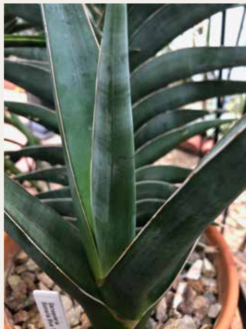
Fig. 18. Sansevieria powellii (Lav 27828).