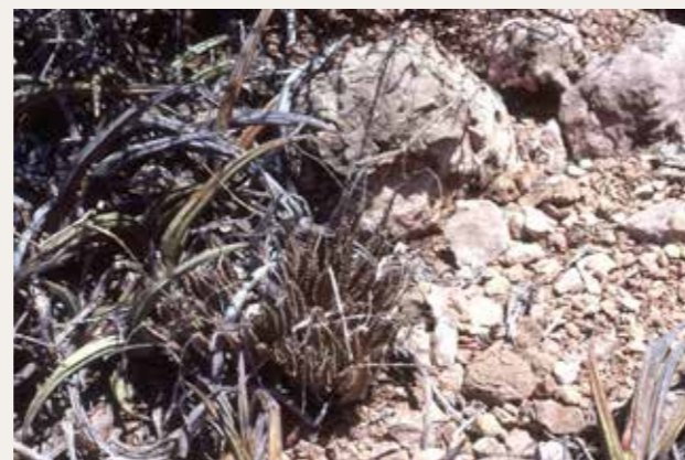
Fig. 20. This field photograph could show Sansevieria aff. rorida on the left side. The subject of the photograph is the asclepiad at center.