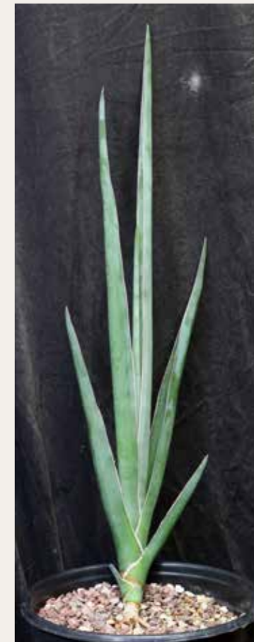
Fig. 15. Sansevieria lavranii (Lav 23295).