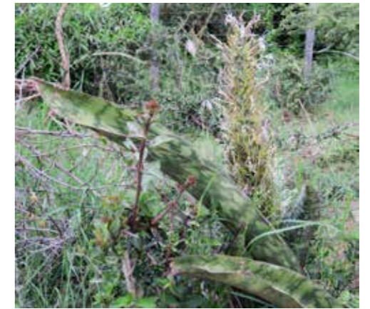
Fig. 11. Sansevieria forestii flowering at its type locality near Nkokone, Kenya.

Description. Acaulescent, rhizomatous, clumping perennial; rhizome 4 cm diameter, pale brown epidermis. Leaves (1-) 2 (-4) in