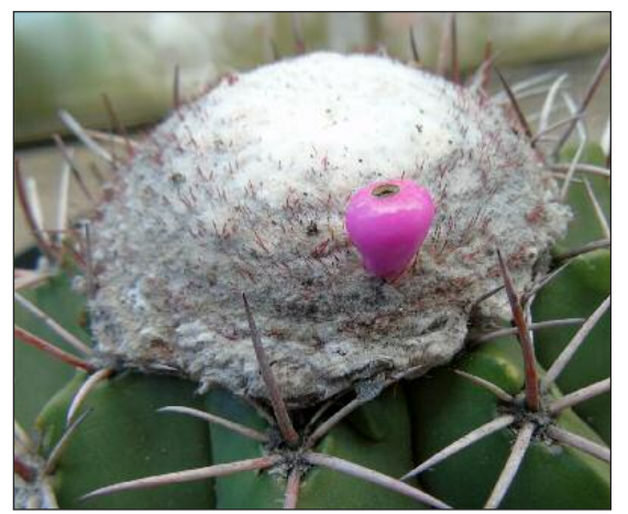
Figure 6. M. sergipensis ex Holotype locality in fruit.

Stem subglobose, light grey-green to somewhat glaucous, 5.5–9.5×8–14.5cm; ribs 8–9(–11), relatively broad, but edge acute, slightly notched at the areoles; areoles only 3-4 visible per rib below the cephalium, 19-23mm apart along the ribs, 5-6mm in diam., bearing whitish to grey trichomes and 8-10 spines. Central spine 1, slightly upward-curved, 18-30×1.6-1.8mm near base, reddish brown to horn-coloured; radial spines 7–9, \pm straight, lowermost longest, 28-40×1.5-2.2mm near base, some partly horn-coloured, others grey-white. Cephalium generally rather small, 3-8cm in diam., often conical in shape, with white bristles and much woolly trichomes, the marginal bristles reddish, more rigid. Flowers 21–23×4–5mm, intense pink, anthesis beginning at 1pm; with 23-25 perianth-segments visible from above, the segments 4.1-4.15 \times <1.4 mm; pericarpel 4.0-4.3×2.8-3.0mm; nectar-chamber 4.2-4.7×3.8-4.2mm, remainder of tube 6.8-7.0×3.8-4.0mm; stigma-lobes 5, white. Fruit 15-19×6-8mm, intense pink above, paler to white below, expelled from the cephalium between 8 and 10am. Seeds c. 12-22 per fruit, black-brown, 1.6-1.9×1.0-1.2mm.