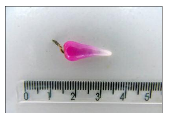
Figure 7. Fruit of M. sergipensis.