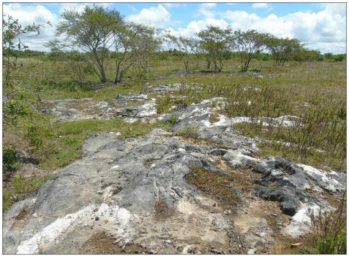
Figure 1. The Paratype locality of M. sergipensis – low-lying limestone outcrops in destroyed high caatinga forest.

not normally found in closed vegetation unless upon included rock outcrops, as in this case. Elsewhere in the genus species found on limestone outcrops are generally rare or in very disjunct populations, though often locally abundant, e.g. M. azureus , M. ferreophilus and M. levitestatus . Thus, that M. sergipensis is currently known from only a single small area is in keeping with such calcareophilus taxa. Sadly, this species, newly described here, must be regarded as at the greatest risk of extinction, since the local land owners regard it as a nuisance, their main interest being the production of maize.