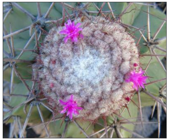
Figure 5. The diminutive flowers of M. sergipensis ex Holotype locality.

slender, ± straight, and each rib bearing only 3–4 areoles visible between ground level and the cephalium; in its combination of few ribs each bearing only 3–4 areoles, glaucous stem, whitewoolly cephalium, small flowers and fruits, and large seeds, differing from all other members of its genus. Holotype : Brazil, Sergipe, Mun. Simão Dias, 10°46'15.7"S, 037°53'39.3"W, 312m asl, limestone outcrop in maize plantation, June 2014, E.S. Bravo Filho 15 (ASE 31075). Paratype : loc. cit. , 2–3km south, small limestone outcrop in maize plantation, 16th September 2014, M.V. Meiado s.n. (ASE).