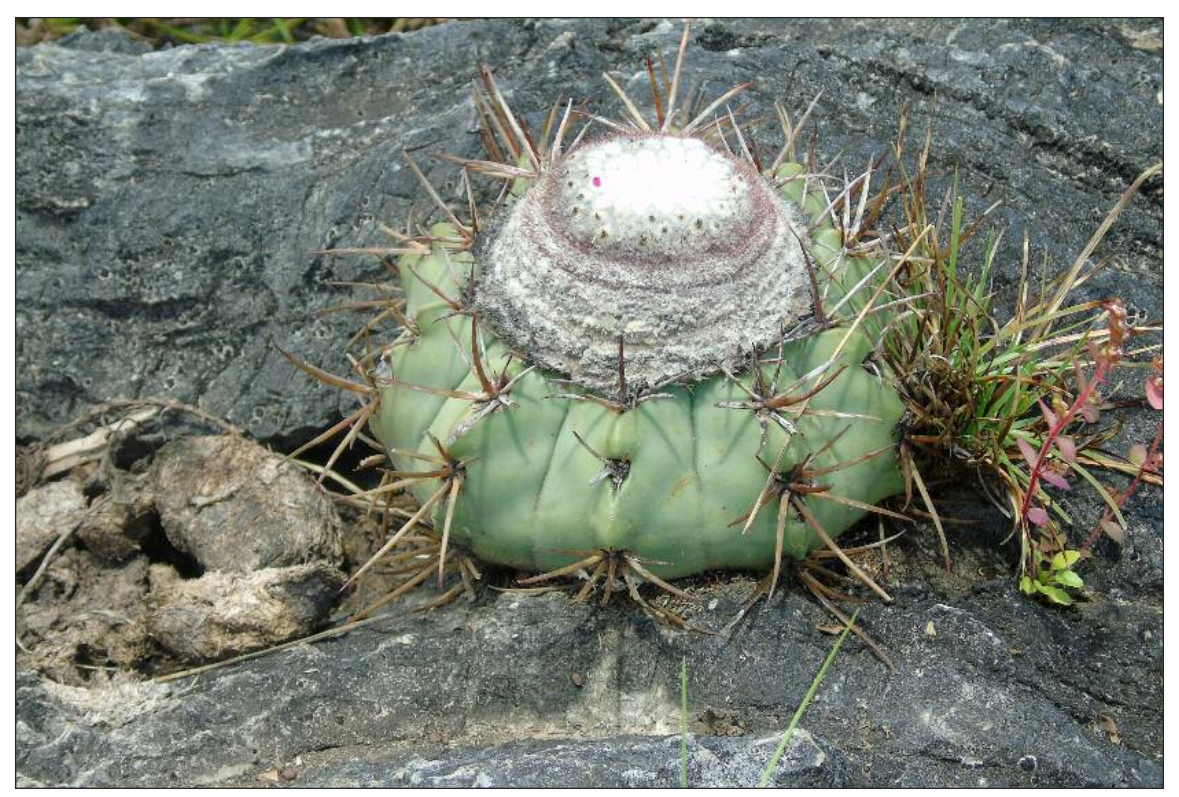
Figure 4. M. sergipensis at the Paratype locality, 16th September 2014.

de Contas (Rio Gavião) drainage systems. This leaves only M. lanssensianus, which is represented by rare, disjunct, cleistogamous forms found on granite in mountainous areas in the states of Pernambuco and Paraíba.