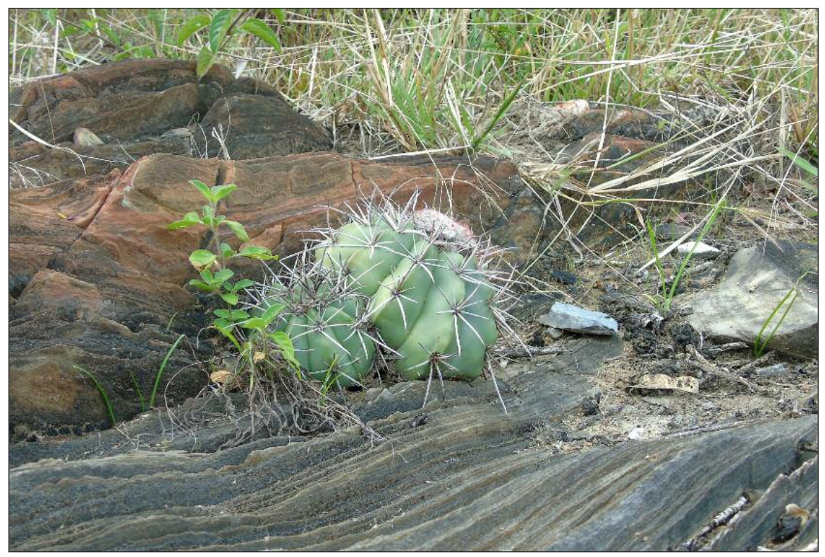
Figure 3. M. sergipensis at the Holotype locality with characteristically grooved limestone substrate.