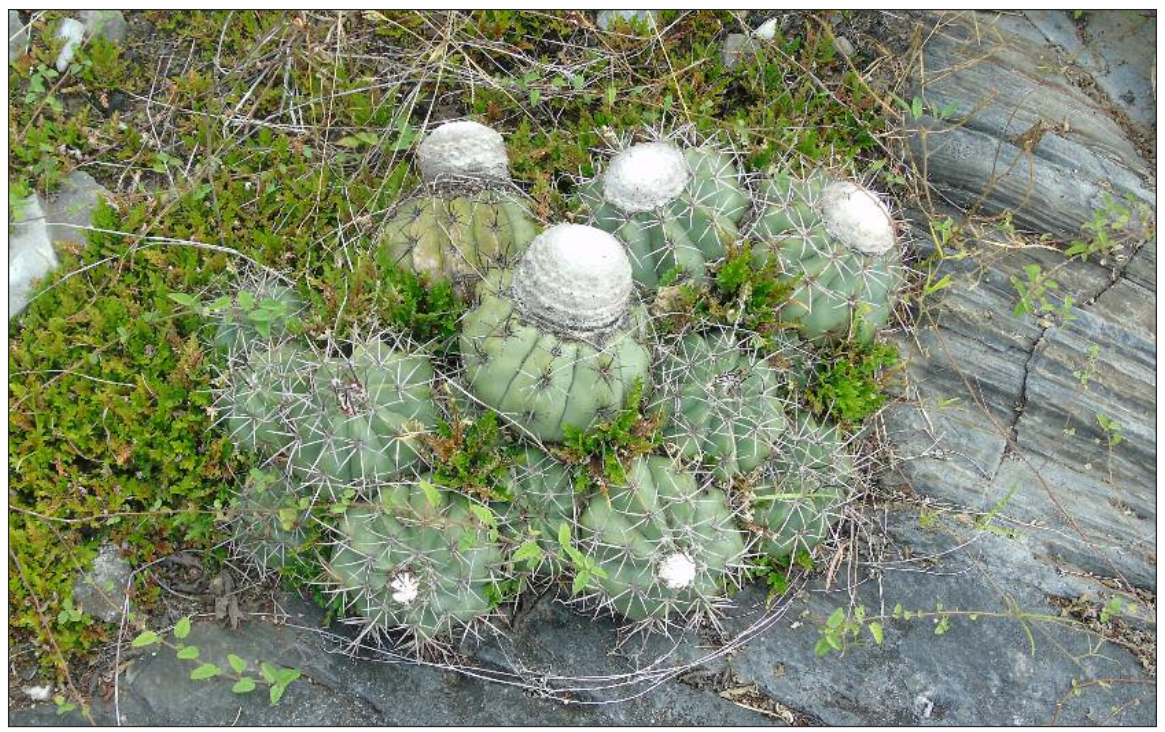
Figure 2. Group of M. sergipensis at the Holotype locality.