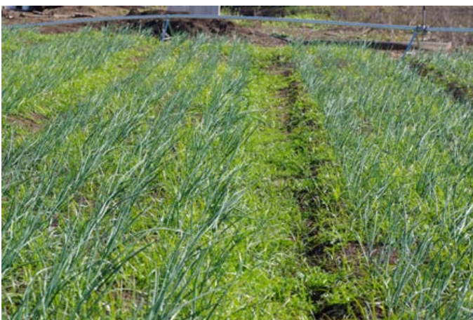
Figure 8 The significance of nutgrass in northern Australian vegetable growing regions is illustrated by this heavily infested onion crop near Gatton, Qld.