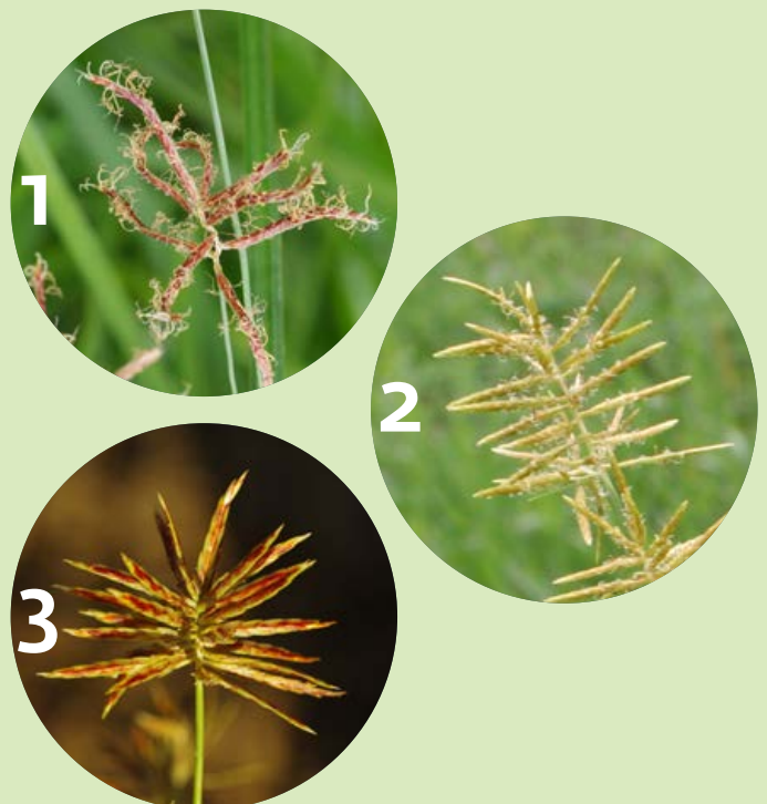
Figure 6 Comparison of flower head colours and form of: 1. Nutgrass C. rotundus (reddish-brown and umbrella shaped), 2. Yellow nutgrass C. esculentus (yellow-straw colour and bottlebrush shaped), and 3. Dense flat-sedge C. congestus (reddish-yellow and bottlebrush shaped).

Of the similar species, yellow nutgrass ( C. esculentus ) is the next most common in Australia. Yellow nutgrass is distinguished from nutgrass by its brighter green foliage, its yellow/straw-coloured flowers and the fact that tubers are found singly rather than being found in chains as is the case with nutgrass. Yellow nutgrass is also more likely to grow in cooler climate regions than nutgrass. It is most commonly troublesome in high-moisture soils in temperate irrigated regions, and can have a similar impact to nutgrass in Australia's temperate vegetable producing regions.