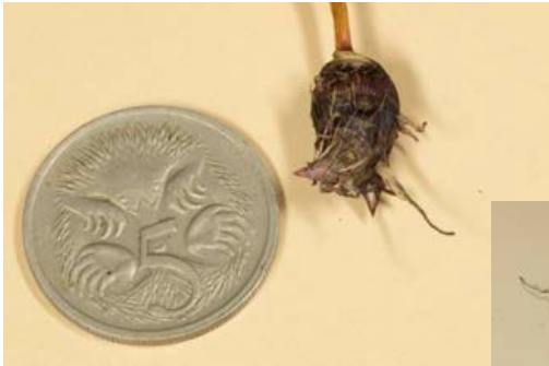
Figure 3 Single small nutgrass tuber.