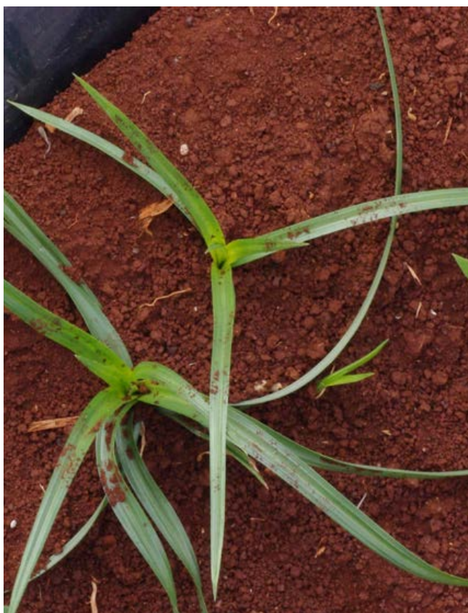
Figure 1 Nutgrass plants before flowering.

Individual plants form a basal bulb, mostly within 7-18 cm of the soil surface. This basal bulb contains the plant growing point. The fibrous root system can extend up to 1.2 metres below the soil surface. Because the growing point remains in the basal bulb, leaves can regrow easily after being severed at the soil surface.