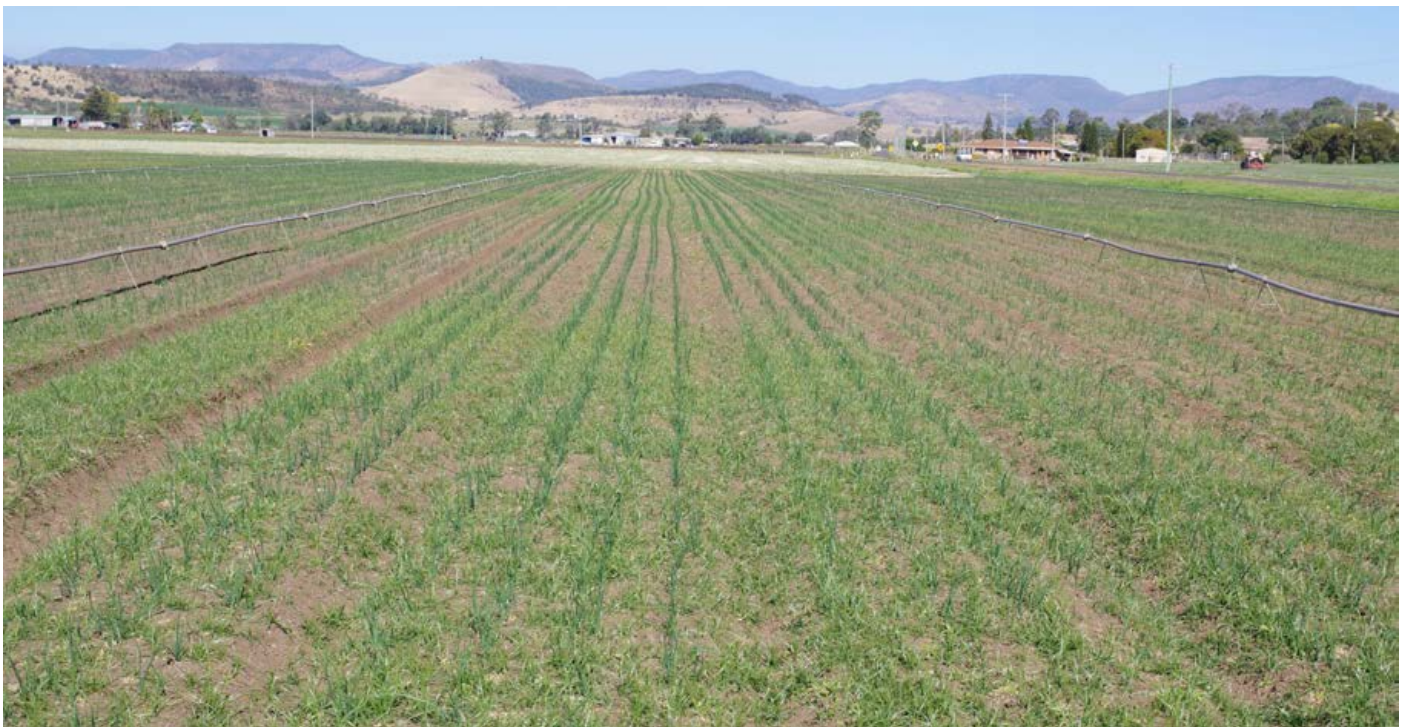
Figure 7 The high fertility soils and frequent tillage generally associated with vegetable production in Australia provide an ideal environment for the spread of nutgrass.

Other important methods of spread include soil transport (for example on tractor tyres), and flooding.