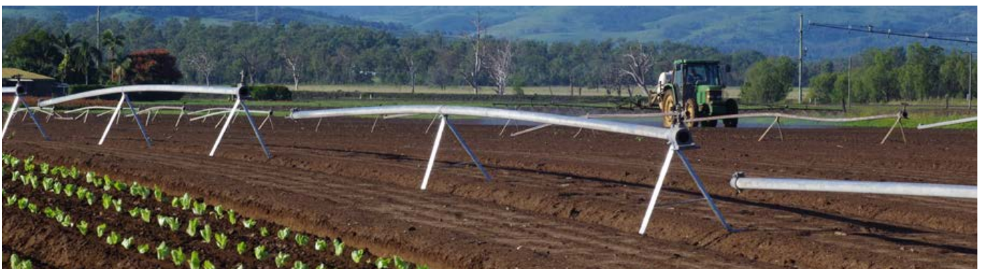
Figure 14 When used appropriately, herbicides can be a key component of nutgrass management in vegetable crops.

* Details correct at time of writing; please consult the relevant herbicide label/s, contact your reseller for current registration details, or contact the Australian Pesticides and Veterinary Medicines Authority. This table does not include minor use permits, or non-selective options such as glyphosate or diquat. If using crop rotations, the APVMA Public Chemical Registration Information System database may be searched for 'nutgrass' to identify a range of herbicides suited to a range of cropping situations.