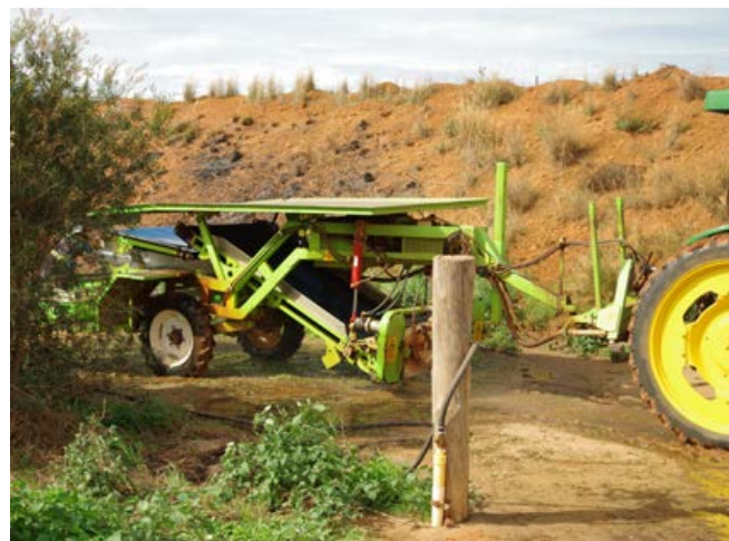
Figure 12 Establishing a fixed equipment wash-down bay can help restrict the spread of nutgrass on the farm, particularly where it is not present at all or only present on part of the farm.

Farm hygiene may be less relevant for managing nutgrass where it has already spread across the farm. Farm hygiene also requires considerable time to wash equipment down thoroughly.