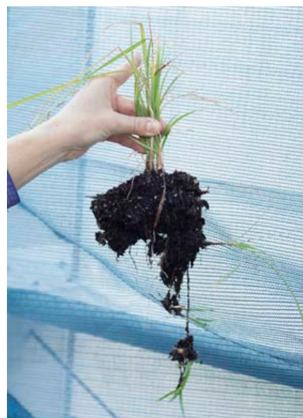
Figure 13 The dense formation of viable tubers characteristic of nutgrass makes physical control impactful, particularly when tubers can easily break off when controlled by hand, giving rise to new nutgrass plants.

It is therefore unlikely to be a viable component of a nutgrass management strategy in vegetable production, except as a targeted control option for new incursions in otherwise uninfested fields.