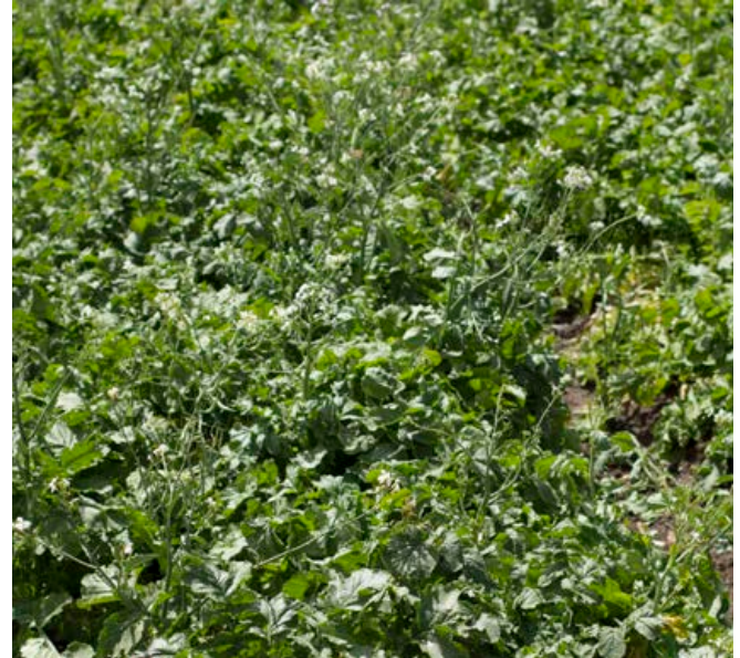
Figure 9 Cover crops which establish rapidly and produce a lot of biomass have been shown to be effective in suppressing nutgrass growth due to their dense canopy. In this example, tillage radish ( Raphanus sativus ) produced a rapid-growing and thick canopy which was effective in suppressing nearly all weed growth on a farm near Hobart, Tasmania.

Research indicates that some cover crops may also potentially retard the growth of nutgrass through allelopathy (production of compounds toxic to other plants), including sorghum ( Sorghum bicolor ) and cowpea ( Vigna unguiculata ). Nutgrass has been shown to have some susceptibility to several phytotoxins present in sorghum, suggesting that this may be worth consideration as an allelopathic cover crop candidate to help restrict the spread of this weed. Intercropping of sorghum and sesame has also shown some promise for nutgrass control in overseas research.