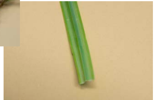
Figure 5 Close-up of nutgrass leaf, showing prominent vein on leaf underside.