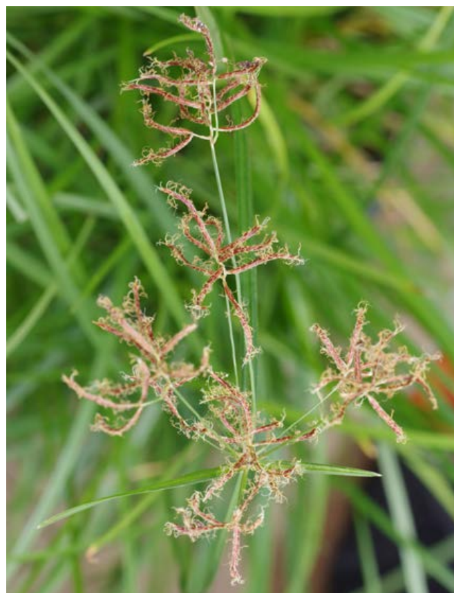
Figure 2 Nutgrass flower detail.