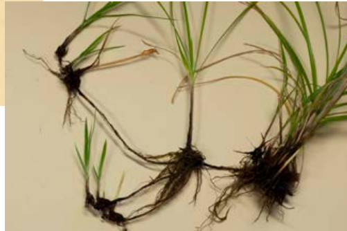
Figure 4 Nutgrass chain showing network of larger and smaller plants, rhizomes and tubers.