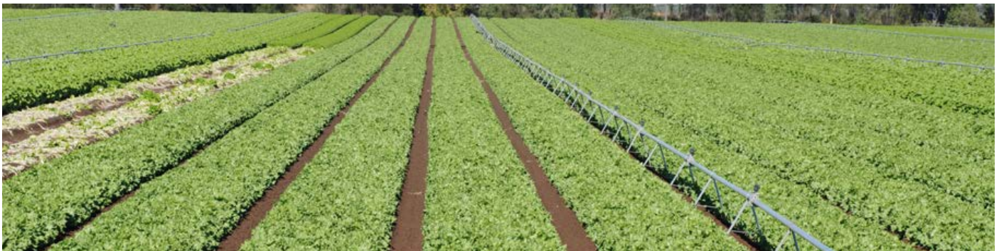
Figure 10 On this farm near Gatton, Queensland, appropriate planting density of the lettuce crop was combined with tillage and non-selective herbicides to suppress nutgrass and other weeds effectively within the crop beds.

Competitive vegetable crops such as bean, cucumber and transplanted cabbage have been used with some success in shading nutgrass to reduce its impact. In order to begin having an effect on nutgrass, it has been suggested that at least 80% shading of the crop rows is necessary.