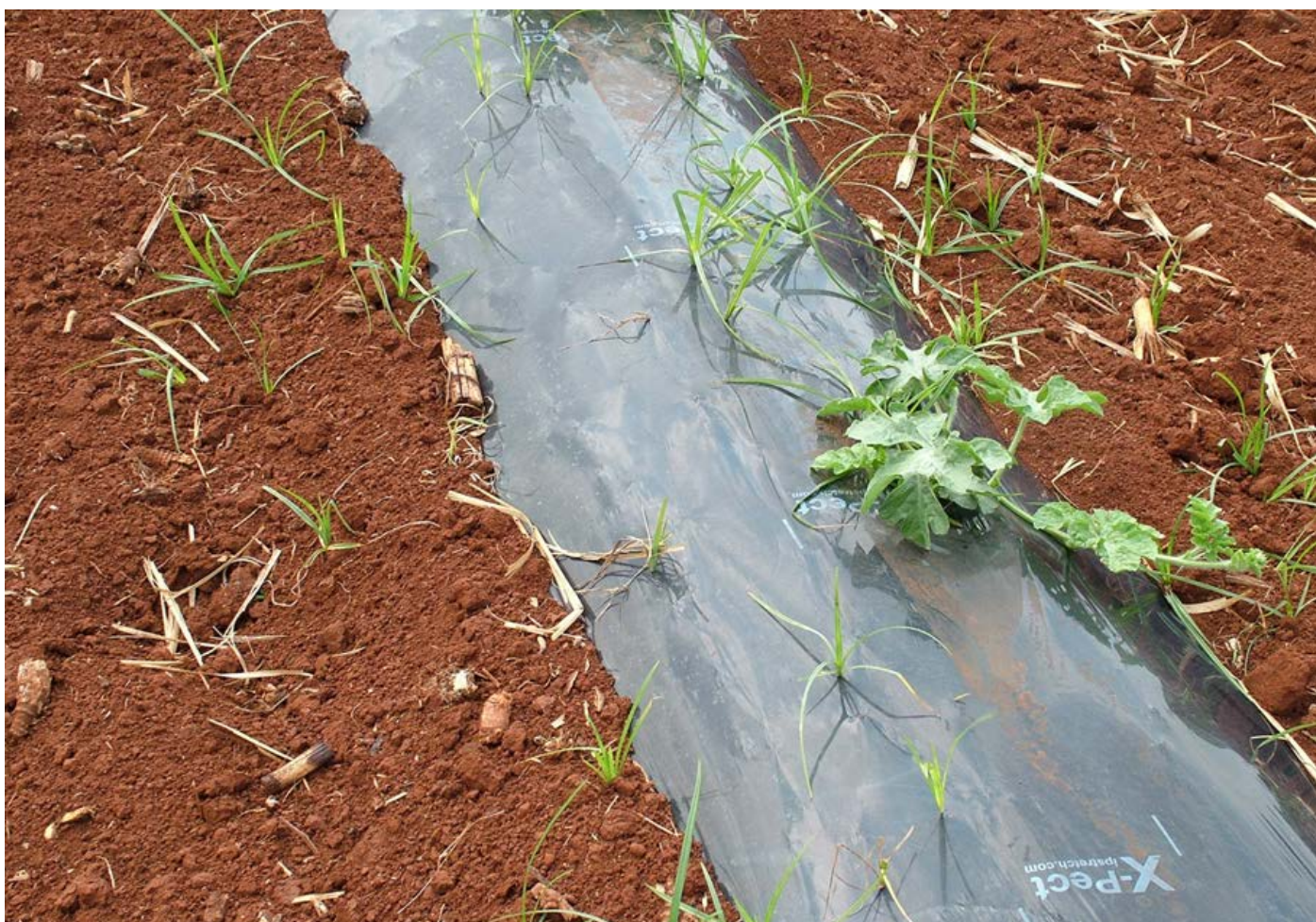
Figure 11 On this cucurbit crop near Bundaberg, Queensland, nutgrass readily pierced the plastic mulch film and caused significant in-crop and post-harvest management issues.

Research also suggests that paper mulch alternatives (such as those coated with soy oil or linseed oil) may be more likely to resist piercing by nutgrass plants than black polyethylene mulches. However, there is a range of drawbacks using these paper mulches compared with plastic, including slower application times, higher initial costs, and variability in rate of degradation depending on soil and weather conditions. Biodegradable mulch films, for example made from corn starch, are increasingly available and may be suitable, though they have not been widely evaluated in vegetable crops.